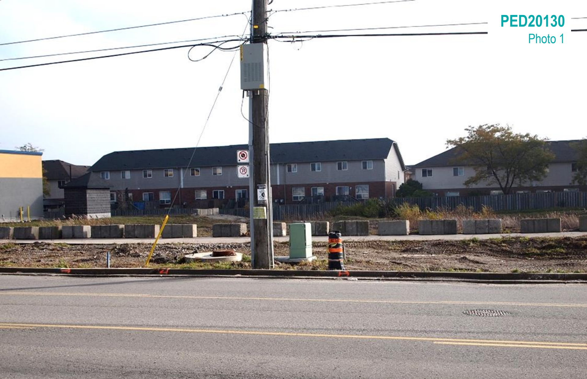
Subject Lands from Upper Mt Albion Rd