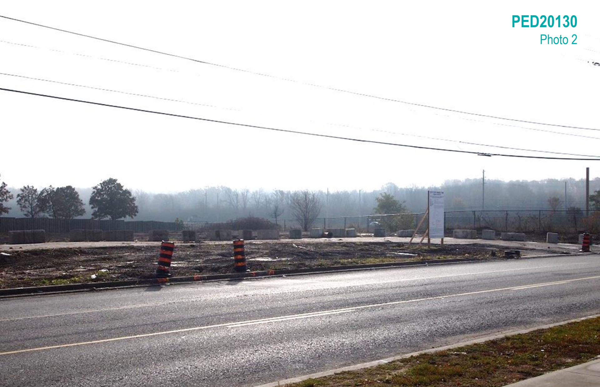
Subject Lands from Upper Mt Albion Rd