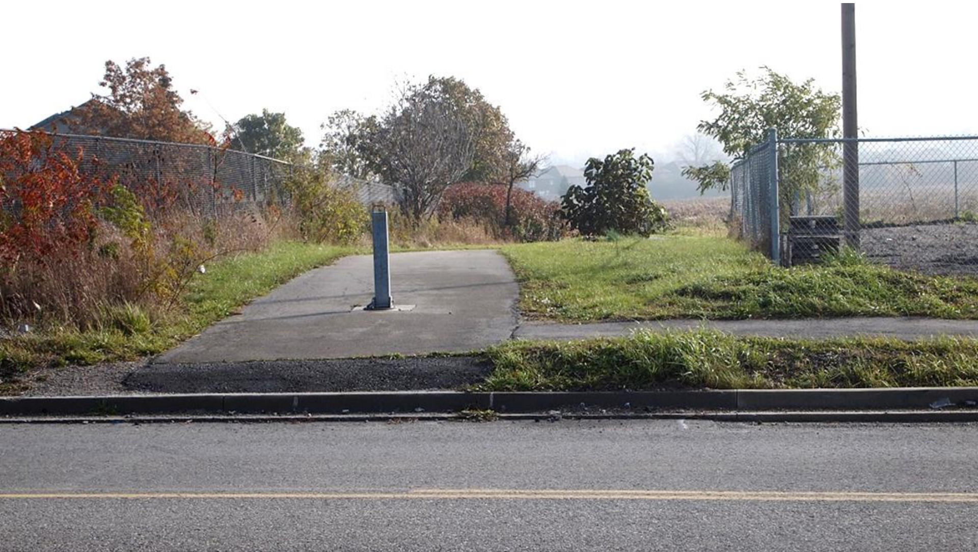
Existing pathway from Upper Mt Albion with Subject Lands to the left