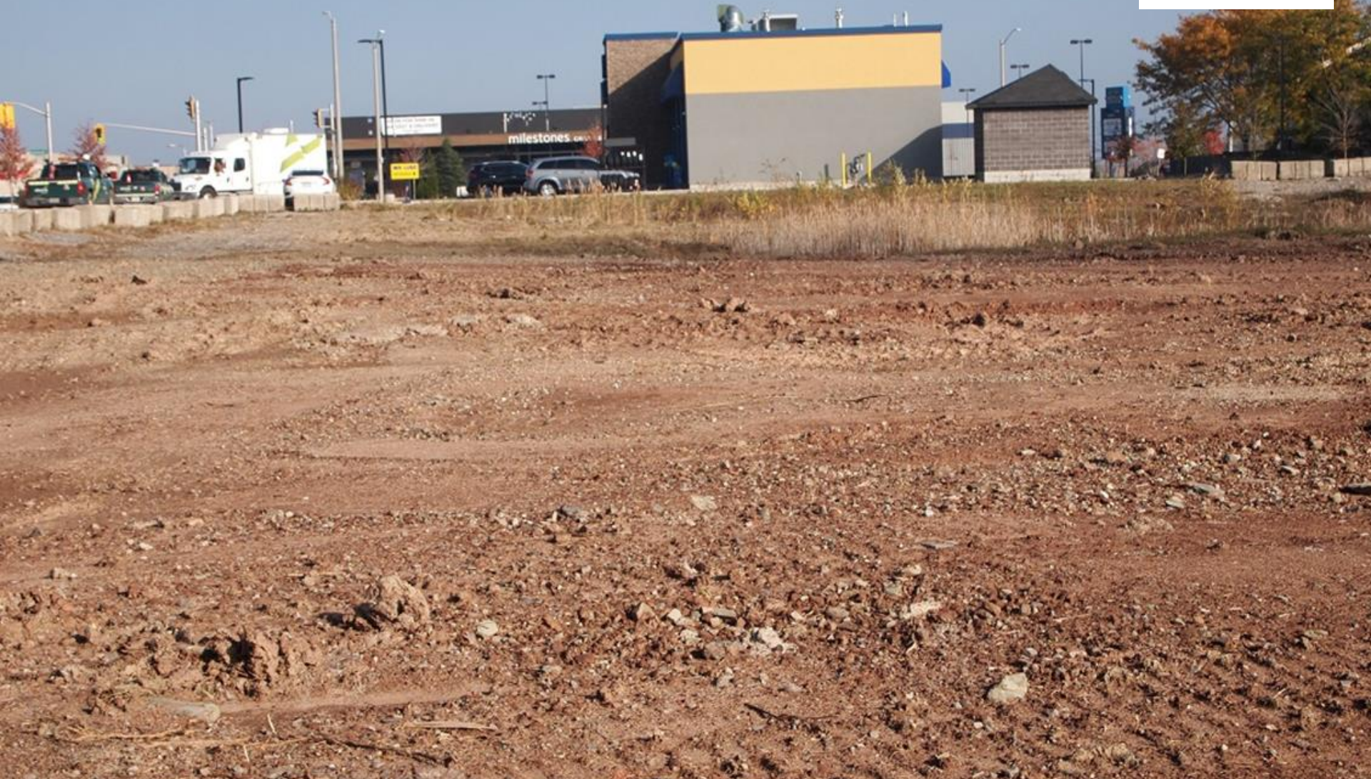
Subject Lands from Existing Pathway facing Jiffy Lube