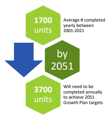
Figure 2: Graphic showing that Hamilton will need to increase our housing starts by 2000 units/year to achieve minimum Growth Plan targets.

Housing completions in the past two years have significantly increased since the beginning of the 2018-2022 Council Term.