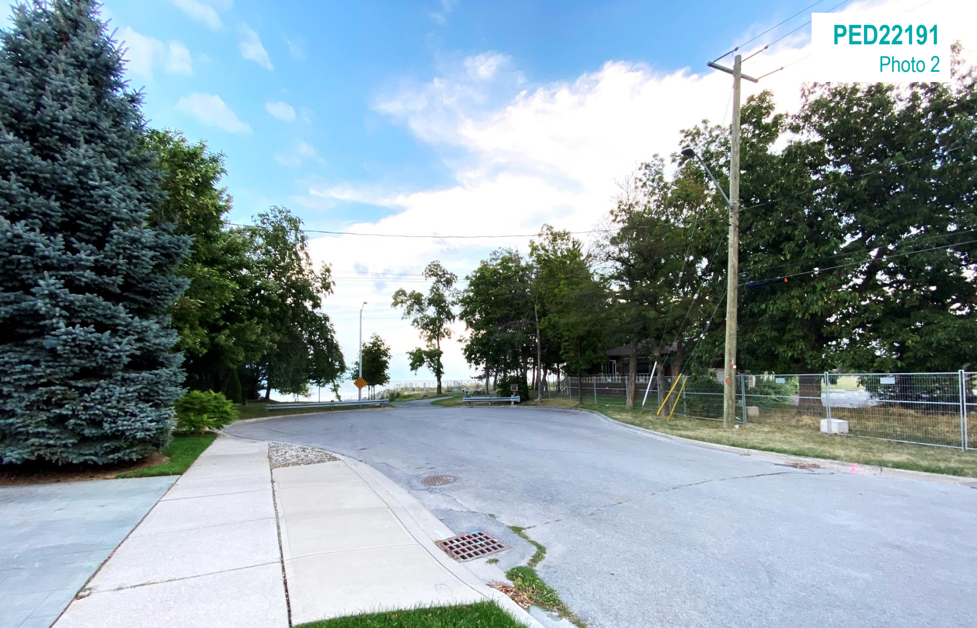
Same point looking north east