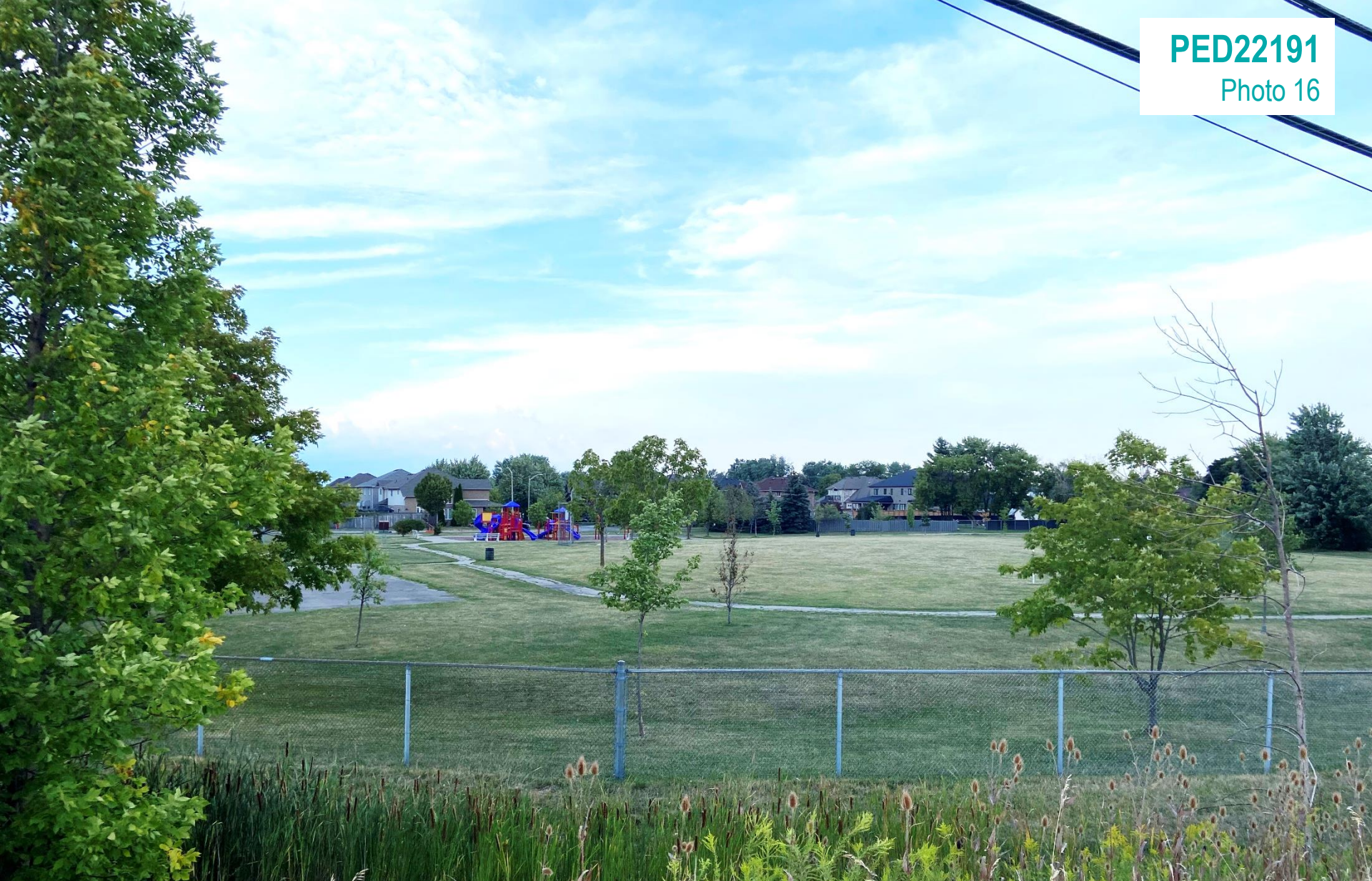
View of John Wilson Park