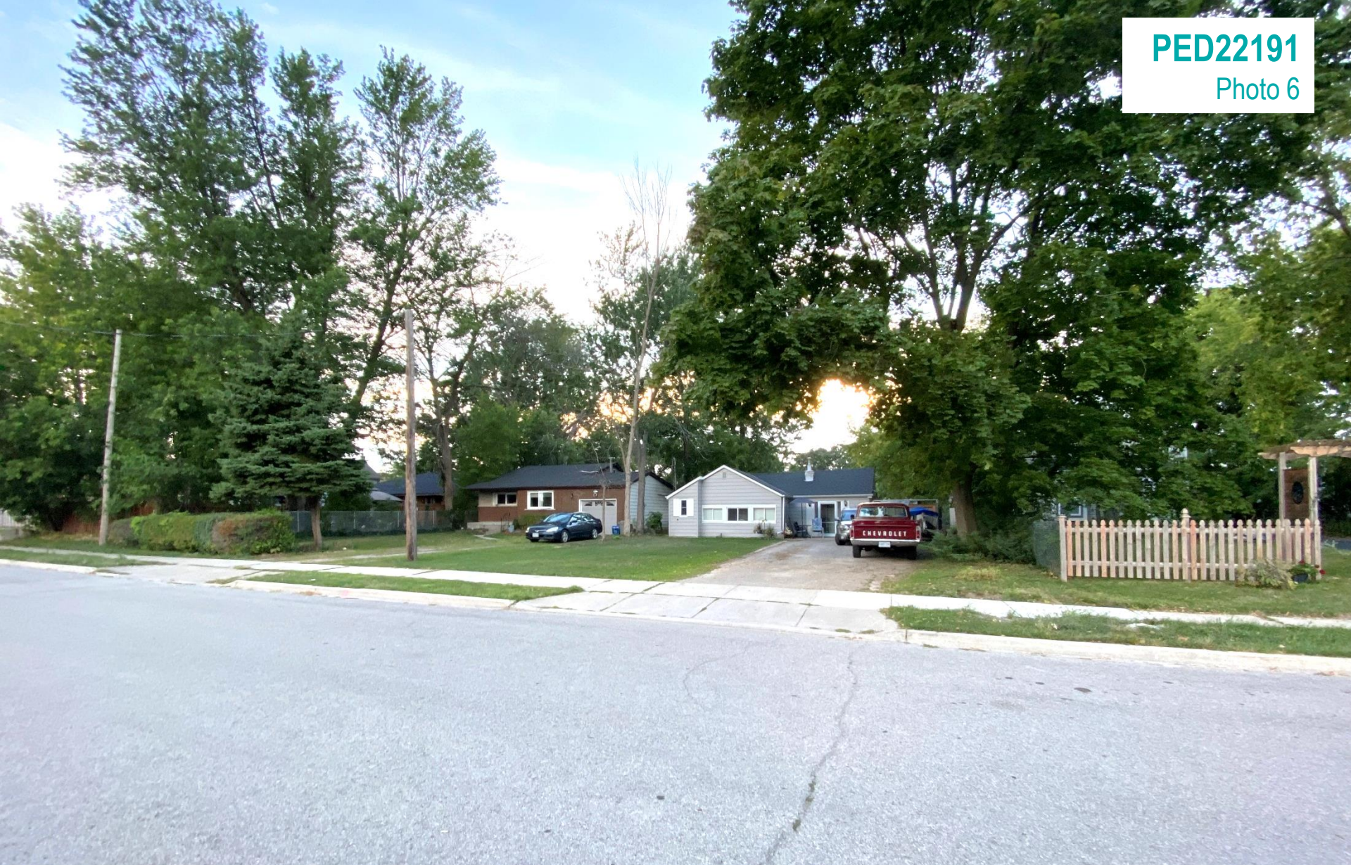
View of nearby Single Detached Dwellings on west side of Winona Road