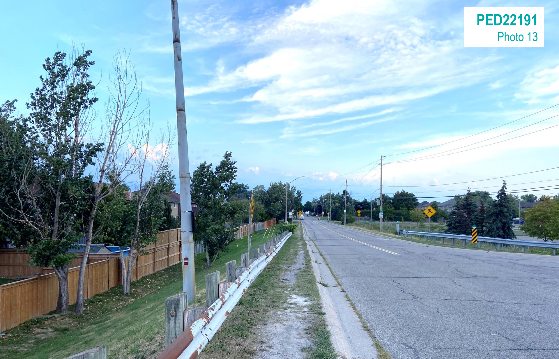
View of Winona Road looking north