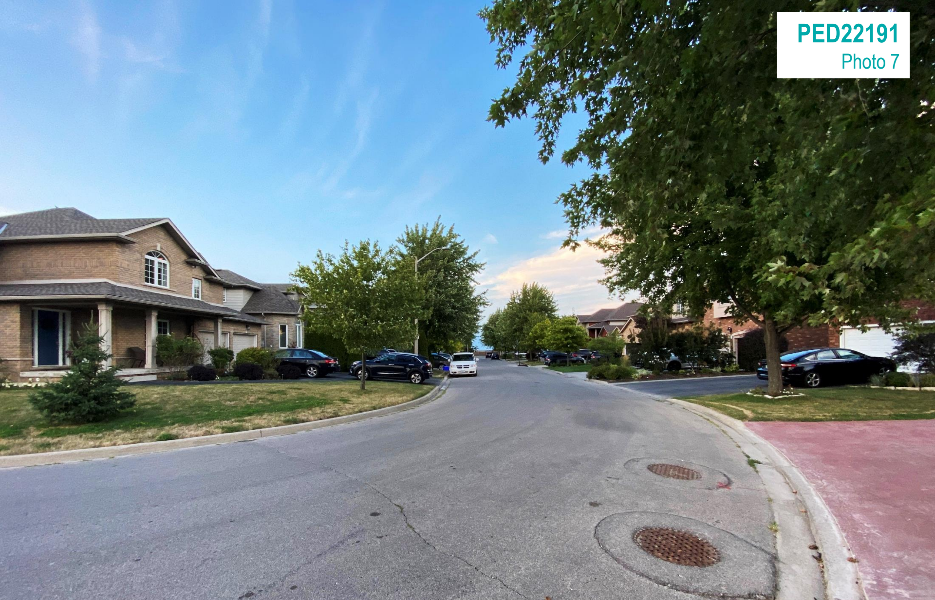
View of Liuna Court looking north