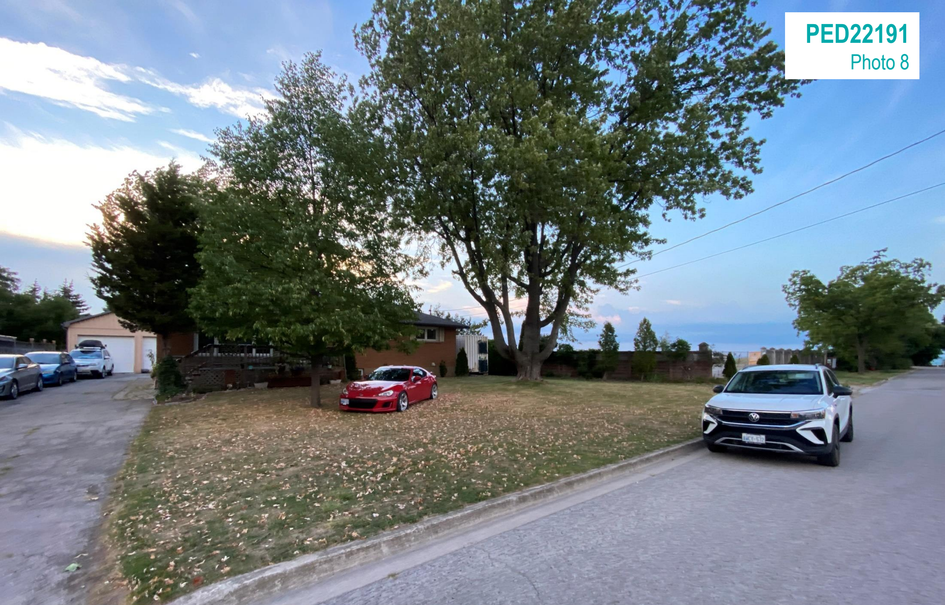
View of neighbouring property to the south on East Street