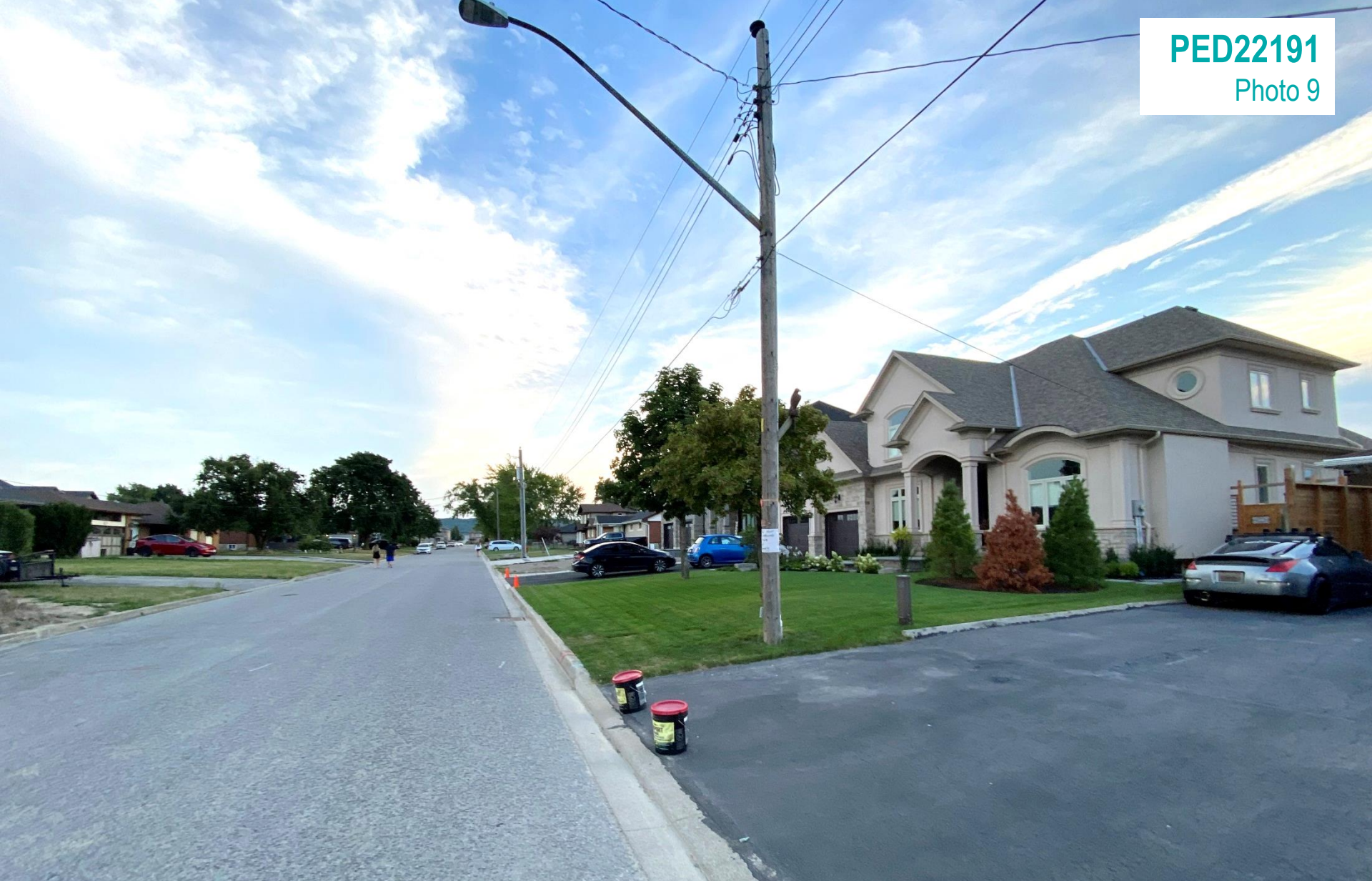
View of nearby Single Detached Dwellings on East Street Continued