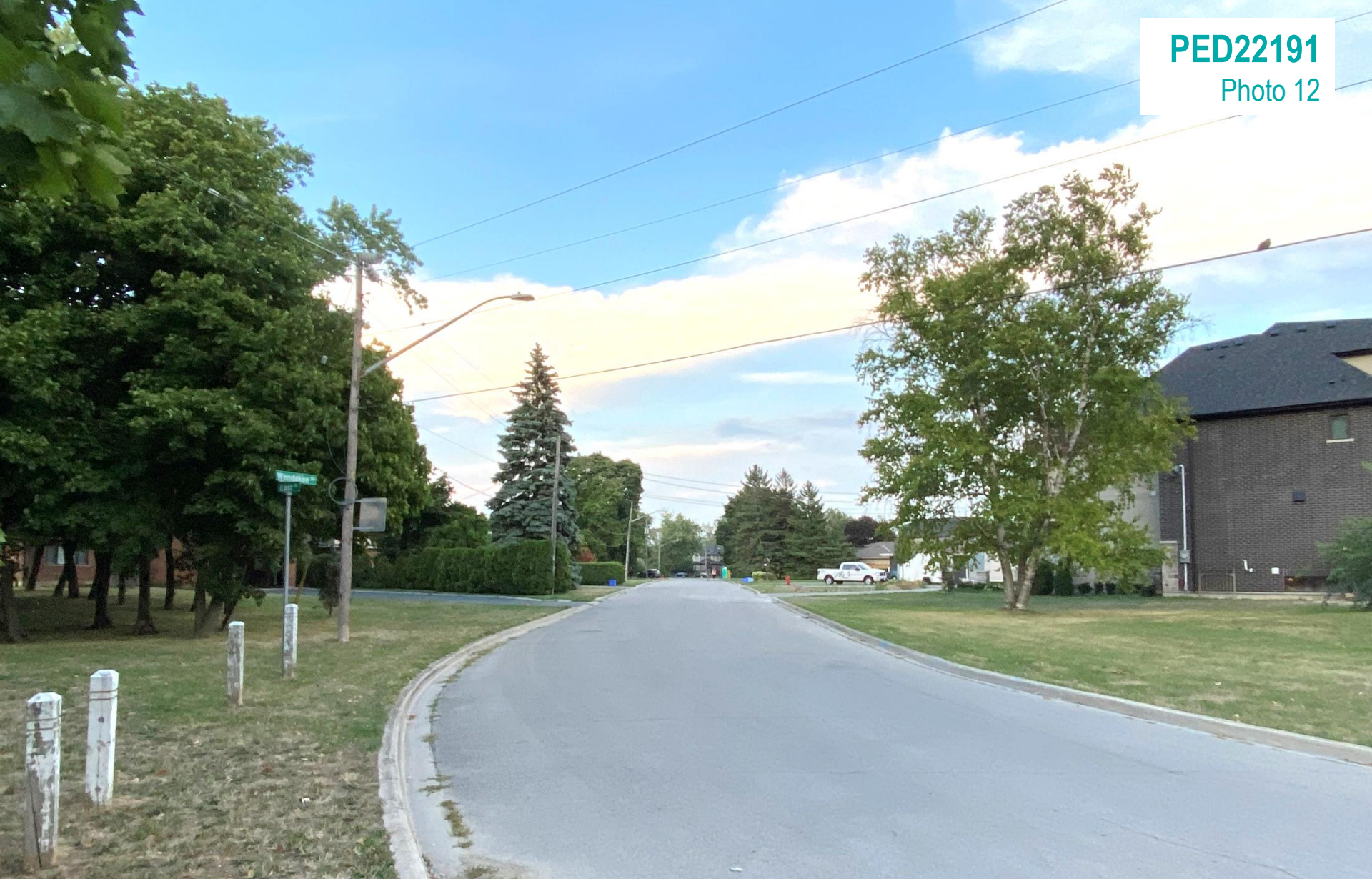
View of Wendakee Drive looking east