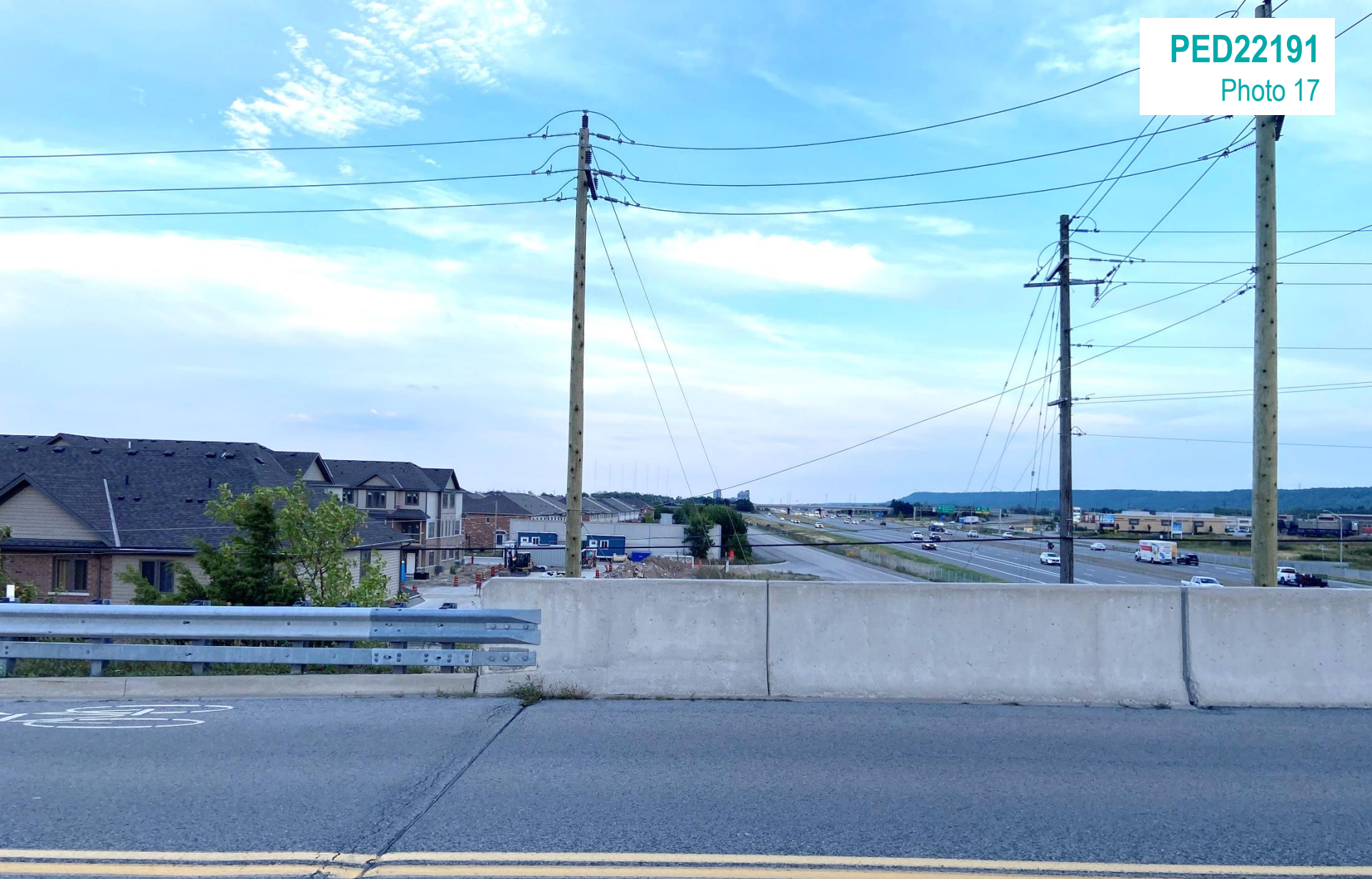
View QEW looking east