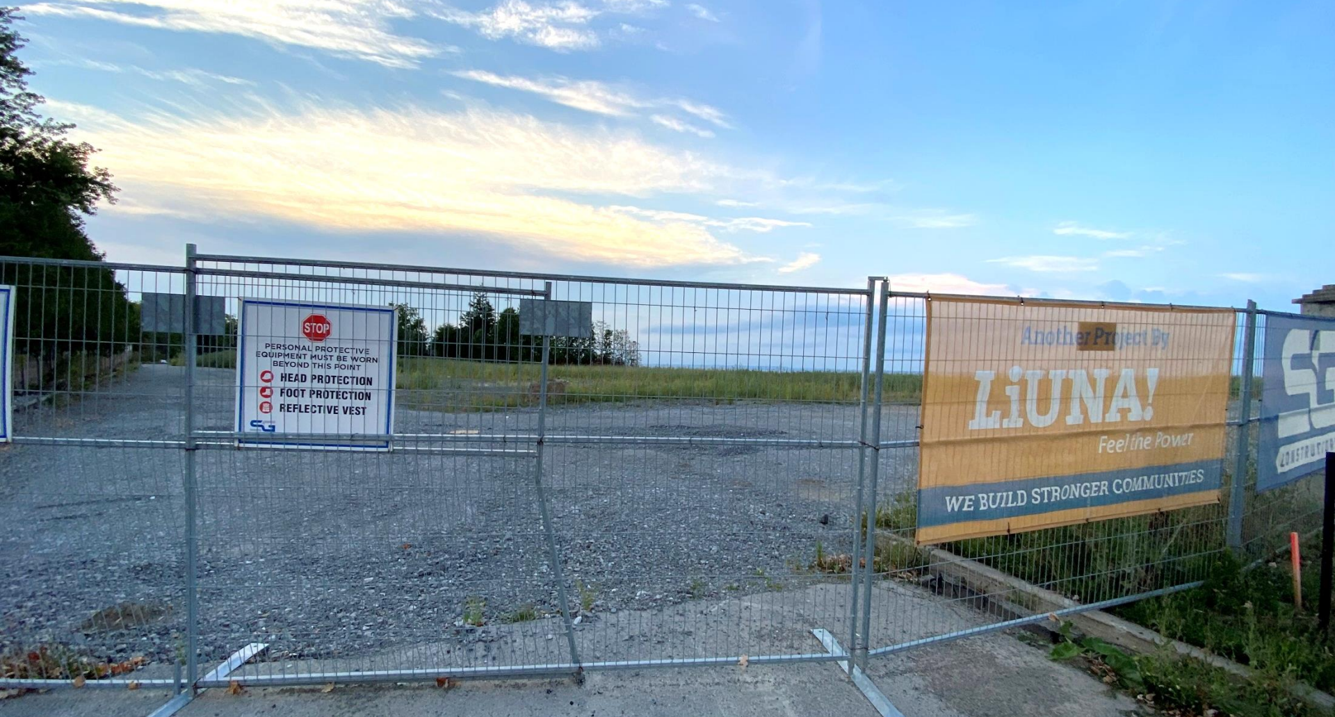
View of Site from East Street looking west