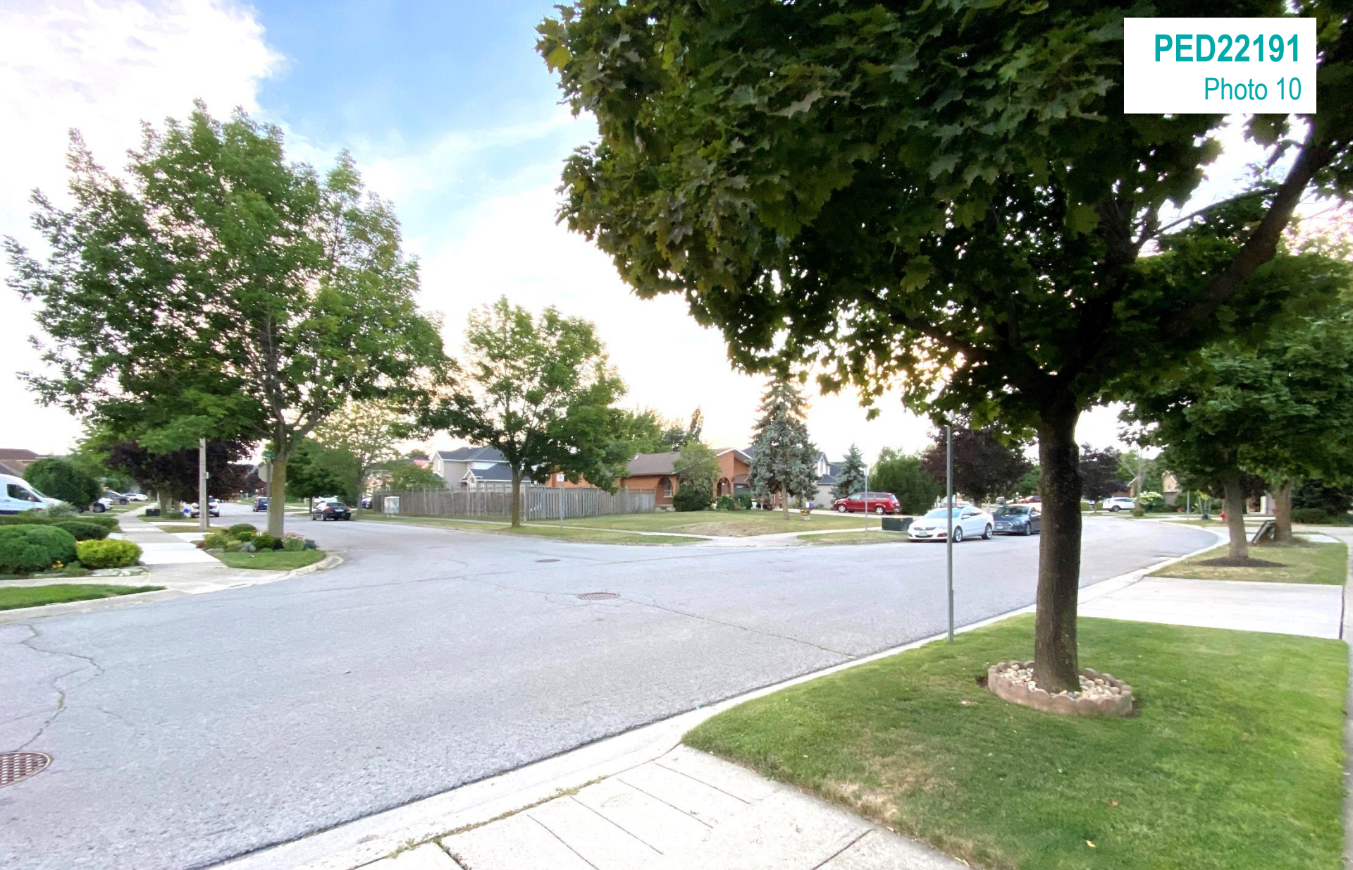
View of Lido Drive and Riviera Ridge