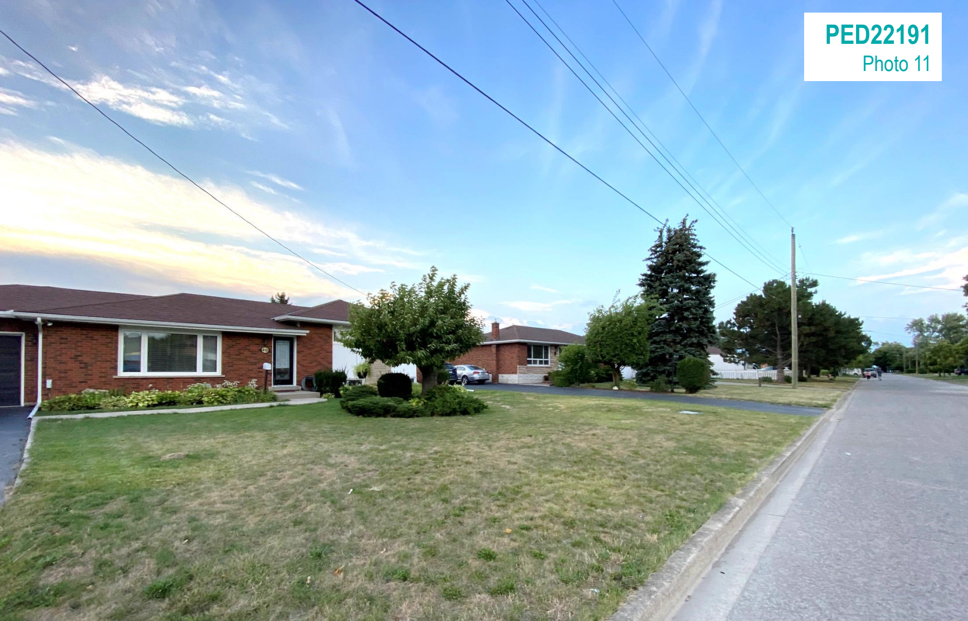
View of East Street looking north