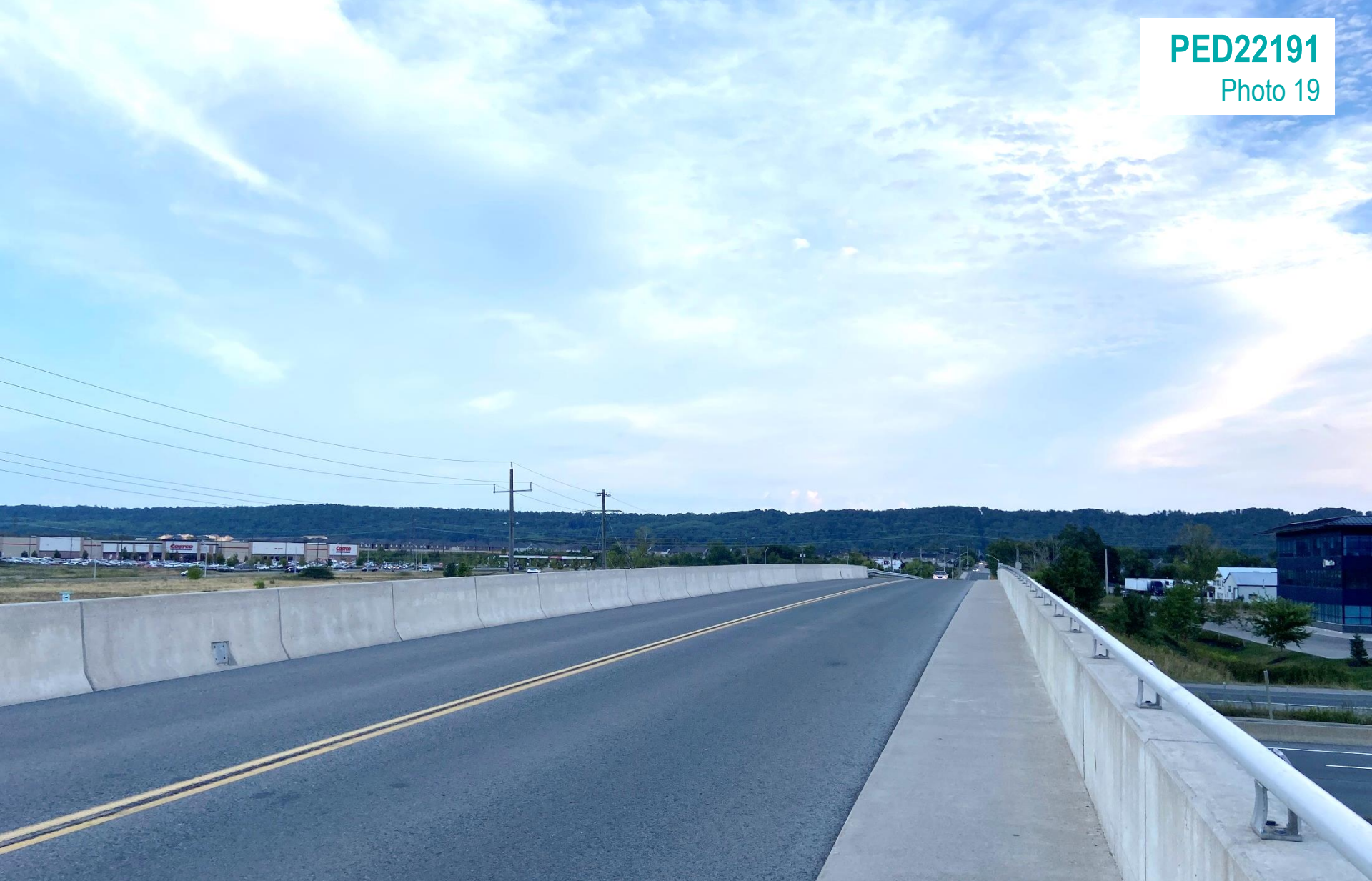
View looking south on Winona Road bridge