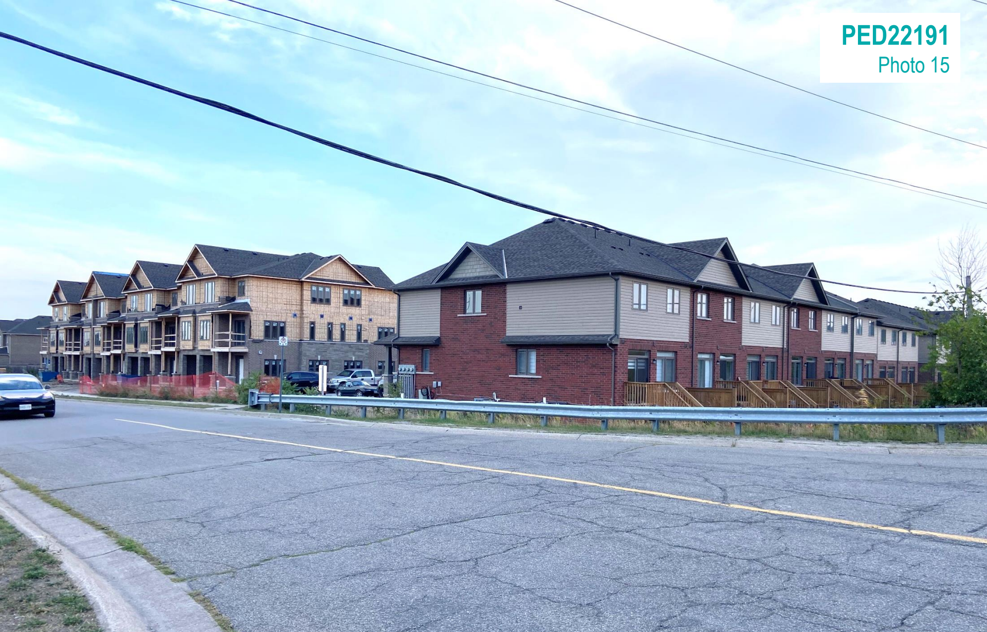
View of newer development at Baseline Road and Winona Road