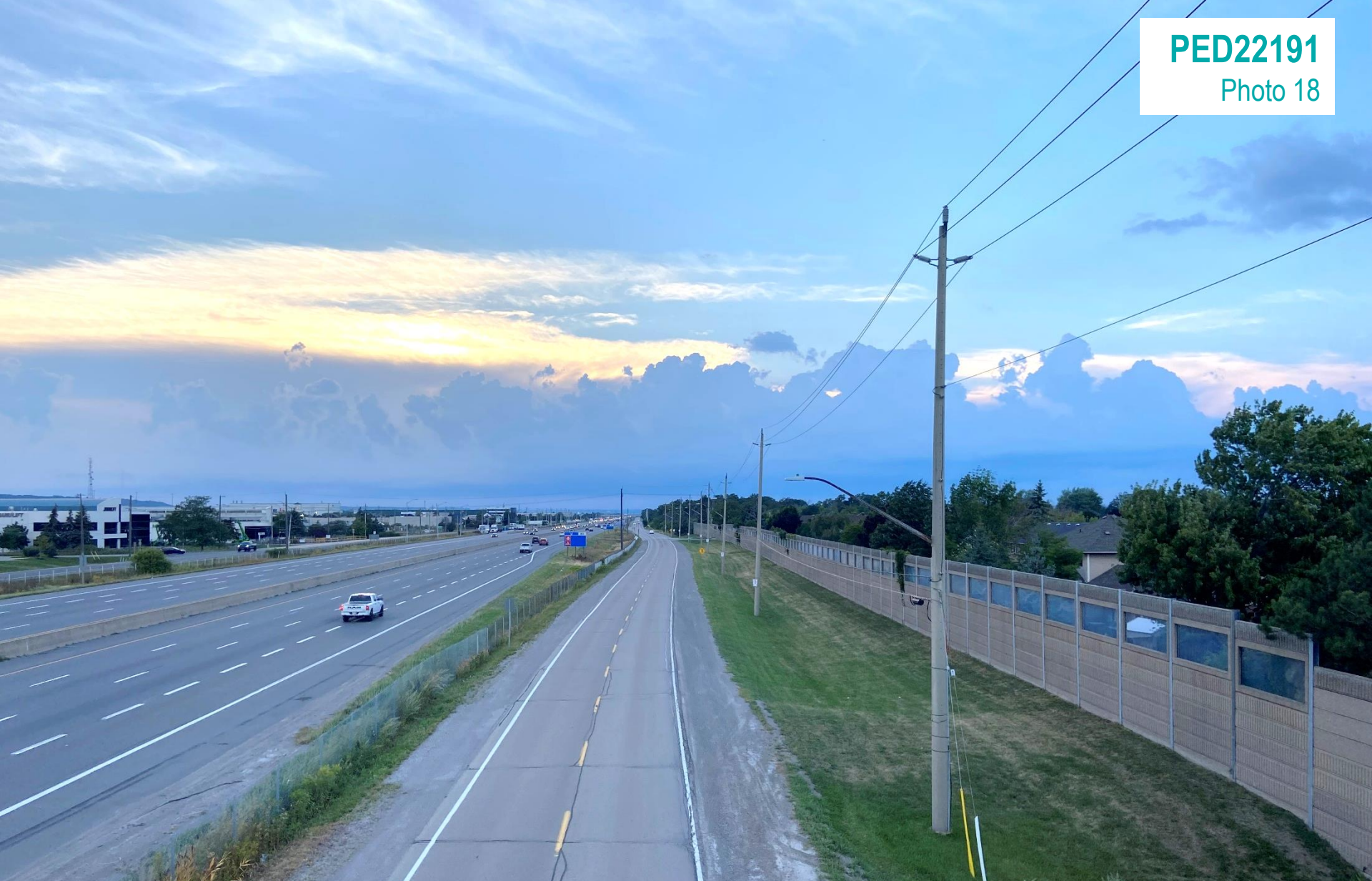
View of QEW looking west