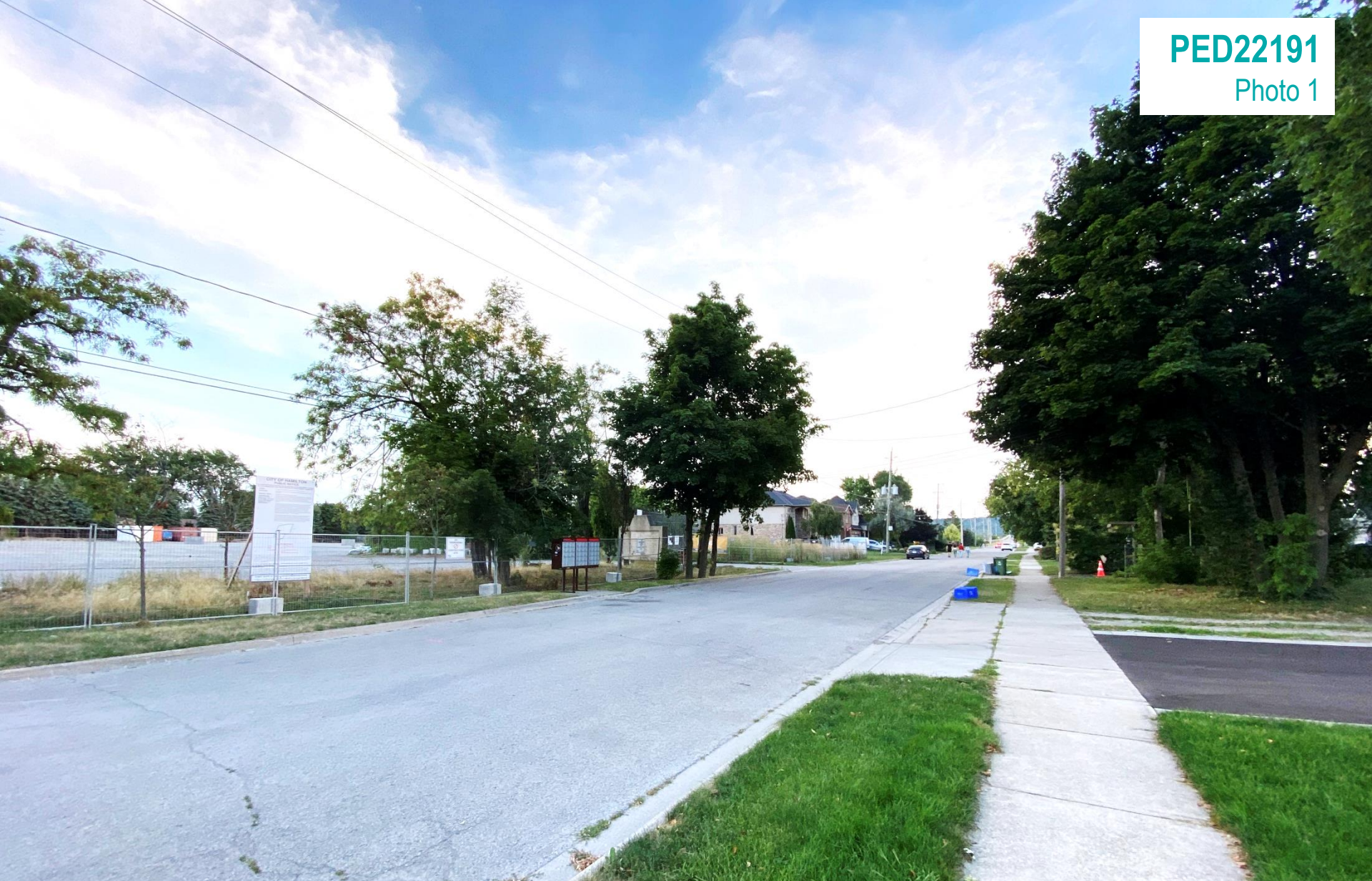
View of Site looking south east