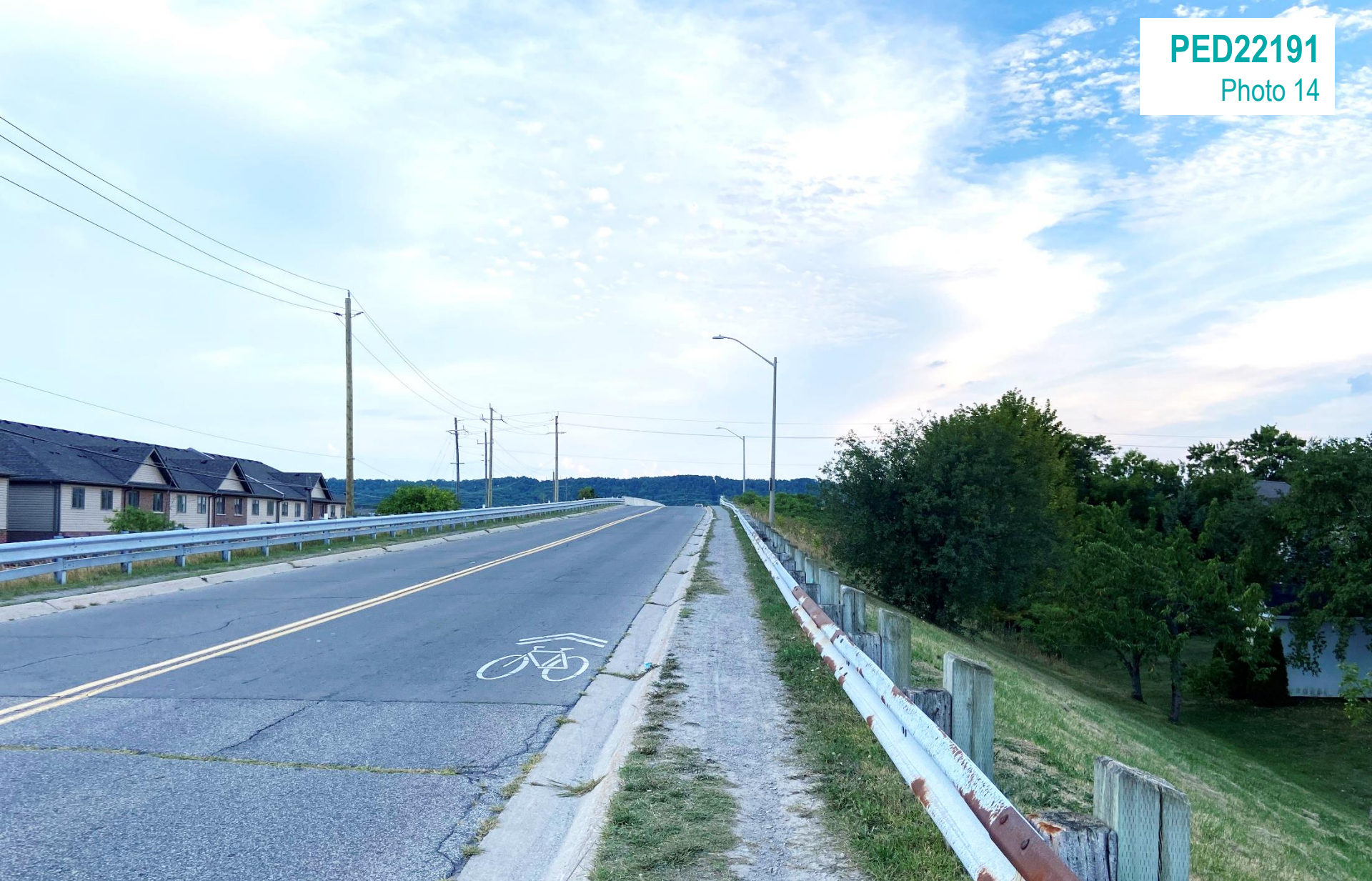
View of Winona Road looking south