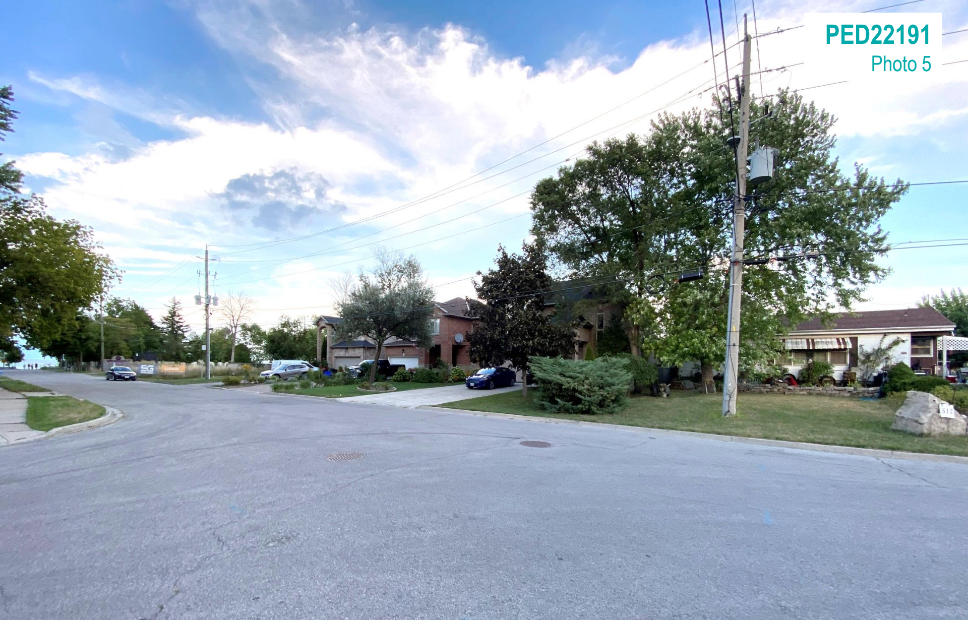
View of nearby Single Detached Dwellings on Winona Road