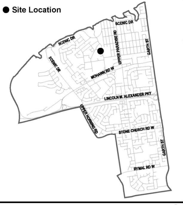
Key Map - Ward 14