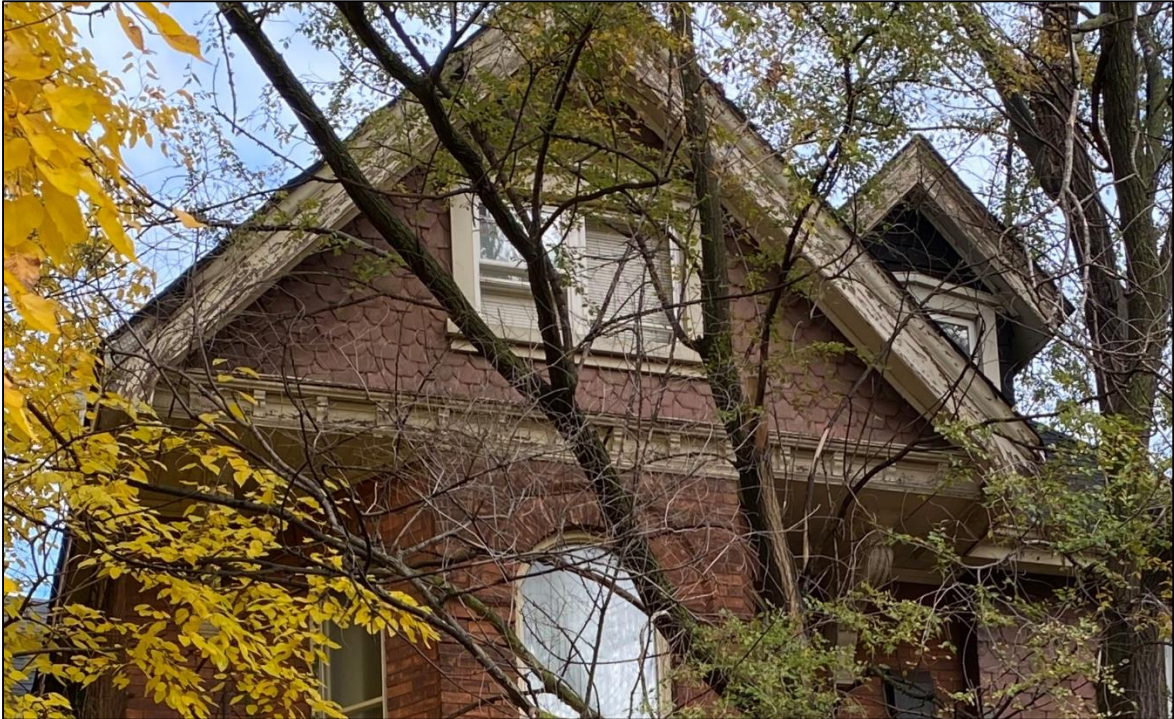
68 Charlton, South Elevation, close up of dentilated cornice and wood bracket, November 1, 2022