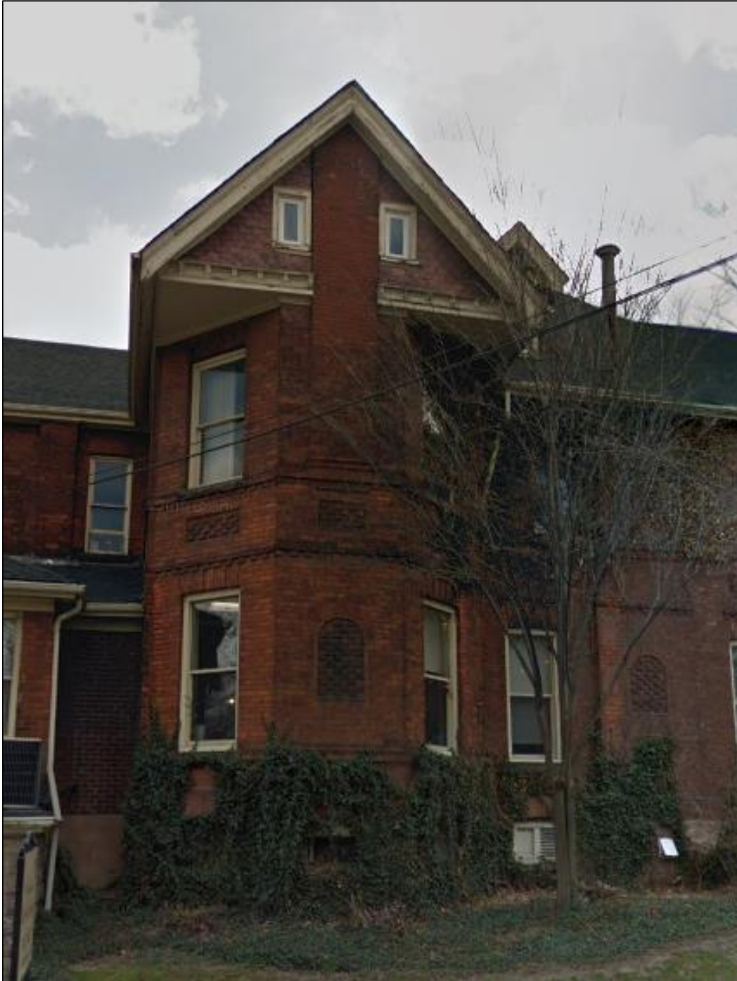
68 Charlton, West Elevation, close up of projecting gable pediment and three-sided bay, Google Street View, April 2012