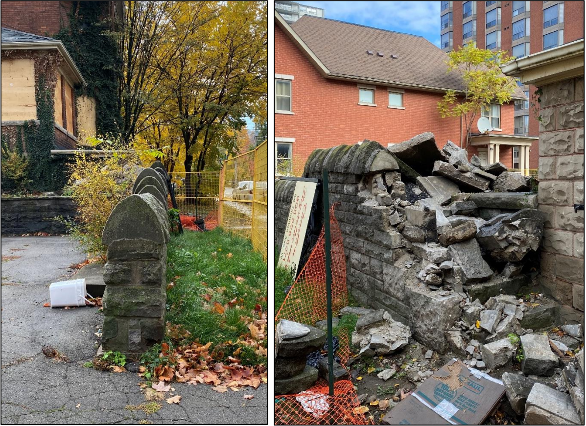
68 Charlton, detail of stone boundary wall, November 1, 2022