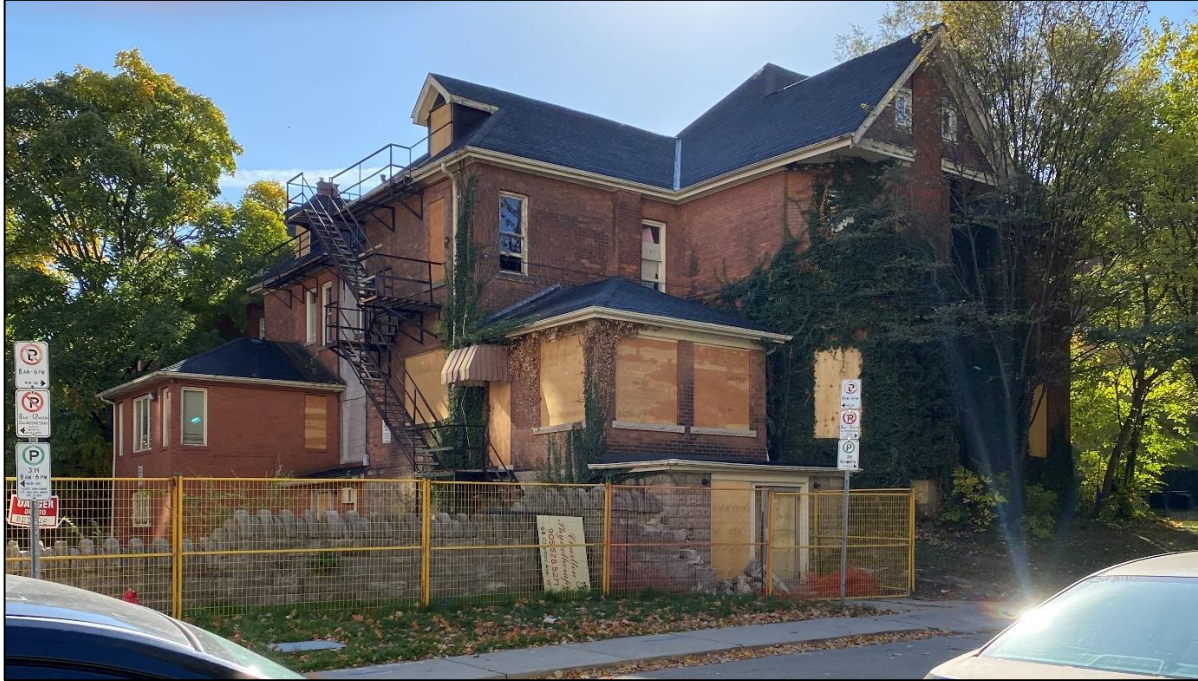
Northwest Elevation, October 21, 2022