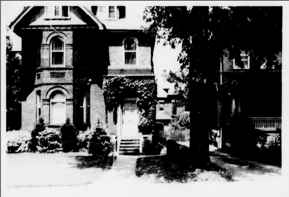
68 Charlton, South facade, Historical City of Hamilton File Image (circa 1950s)