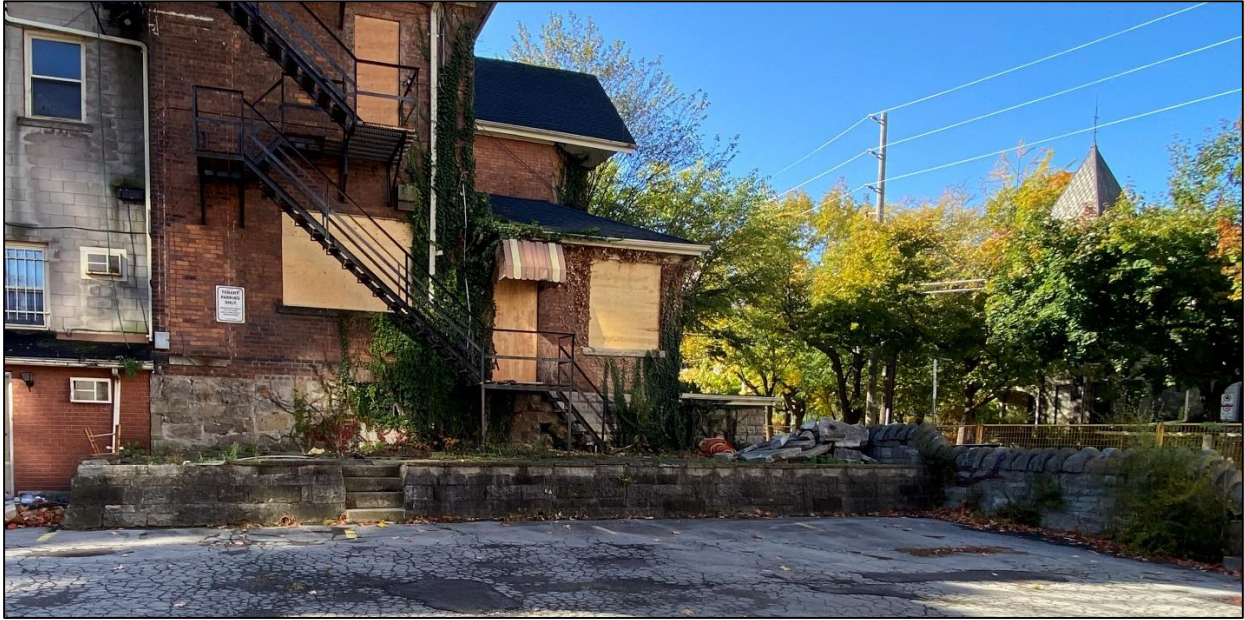
68 Charlton, North Elevation, detail of rear retaining wall and boundary stone wall, October 21, 2022