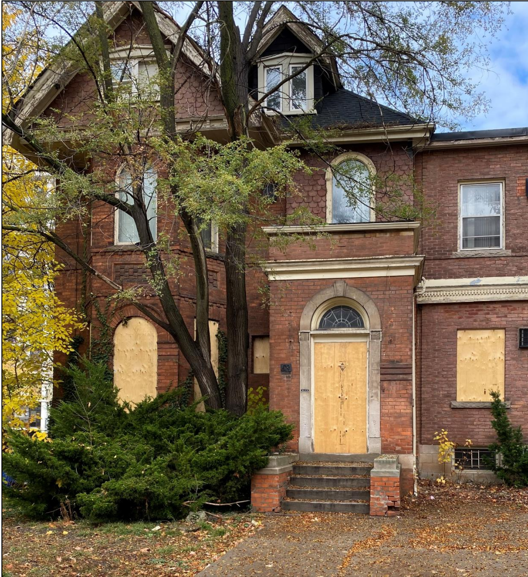
68 Charlton Front Facade, November 1, 2022