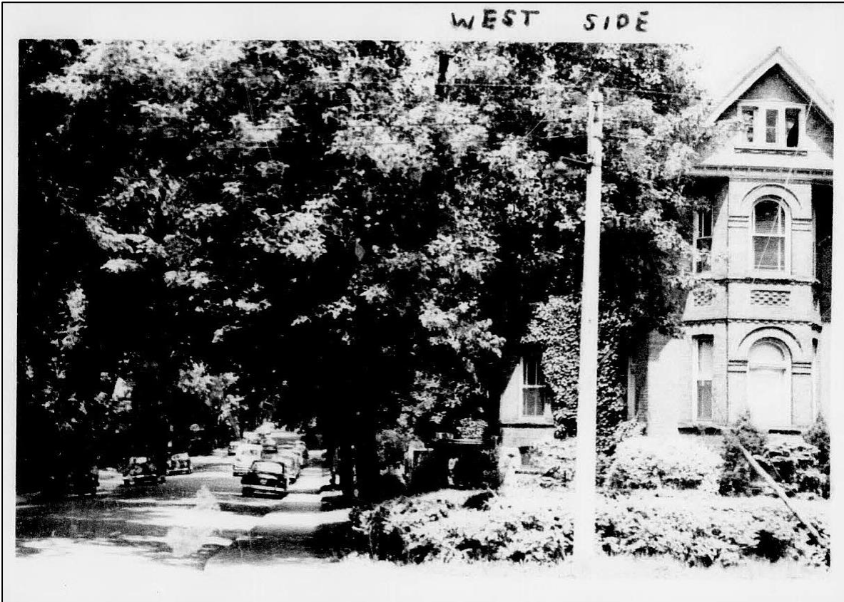
68 Charlton, Southwest facade, Historical City of Hamilton File Image (circa 1950s)