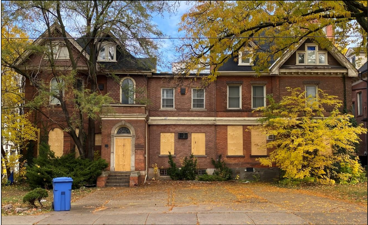
66-68 Charlton Avenue West, South Facing, Front Facade, November 1, 2022