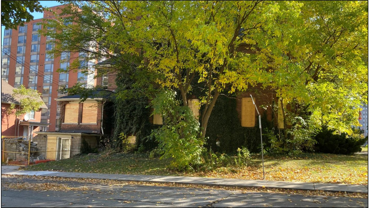
West Elevation of 68 Charlton Avenue West, facing Park Street, October 21, 2022