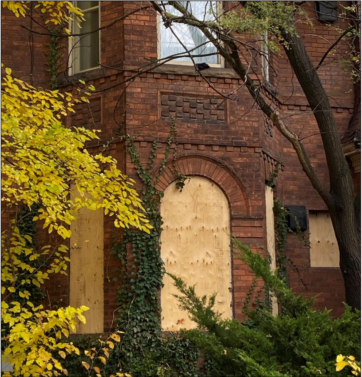
68 Charlton, South Elevation, close up of decorative brick detailing, November 1, 2022