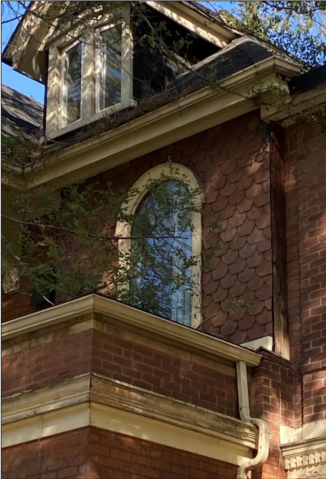
68 Charlton, South Elevation, close up of octagonal slate shingles above entrance, October 21, 2022