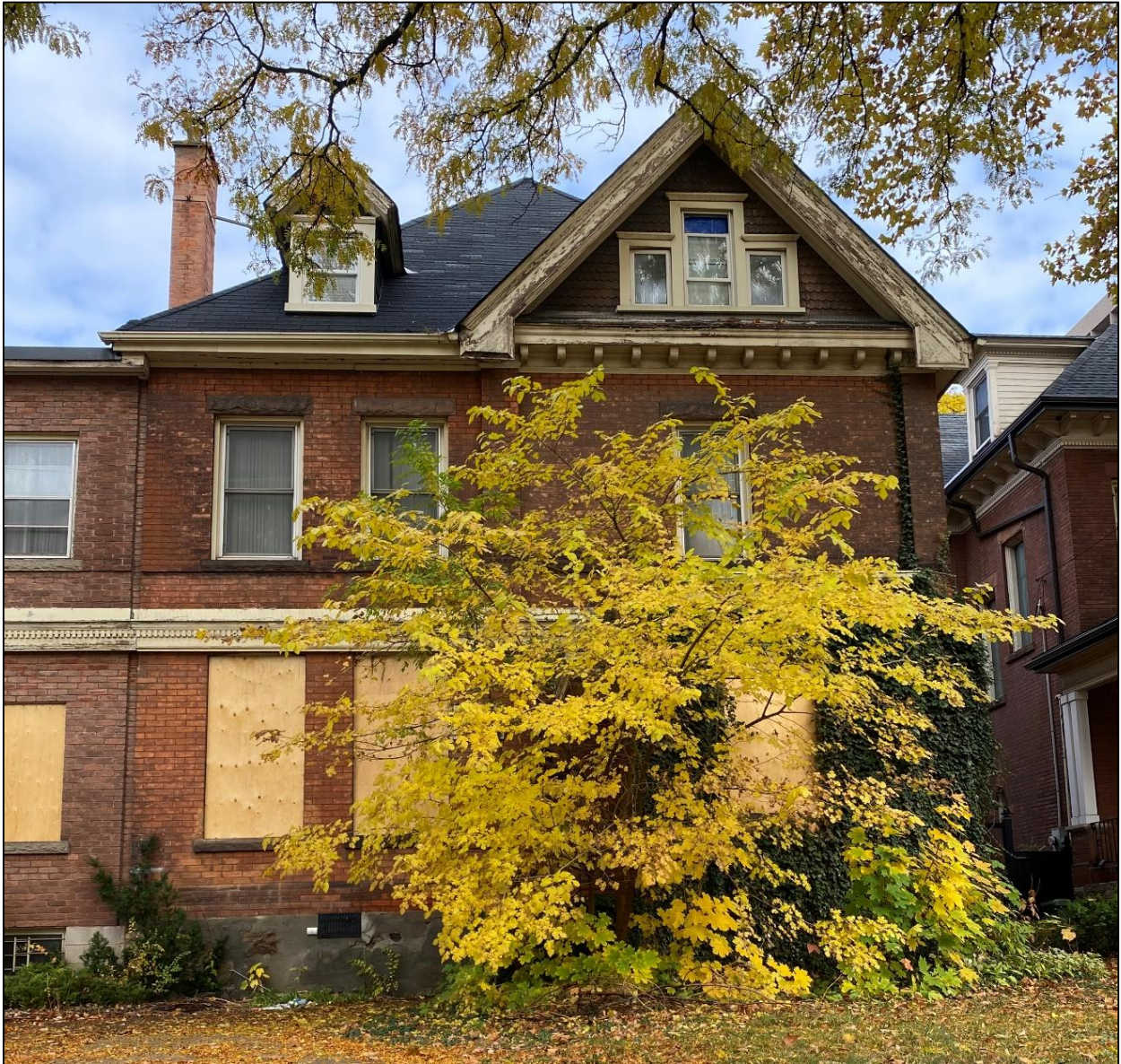
66 Charlton Front Facade, November 1, 2022