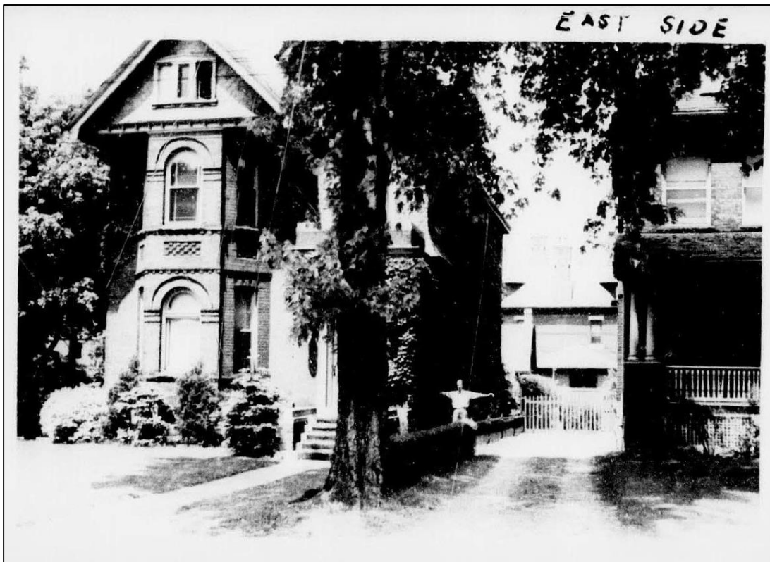
68 Charlton, Southeast facade, Historical City of Hamilton File Image (circa 1950s)