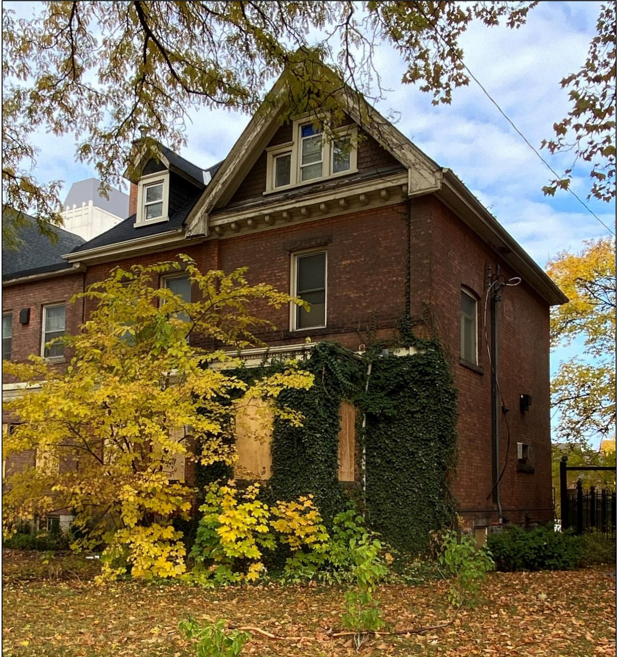
Southeast Elevation of 66 Charlton Avenue West, November 1, 2022