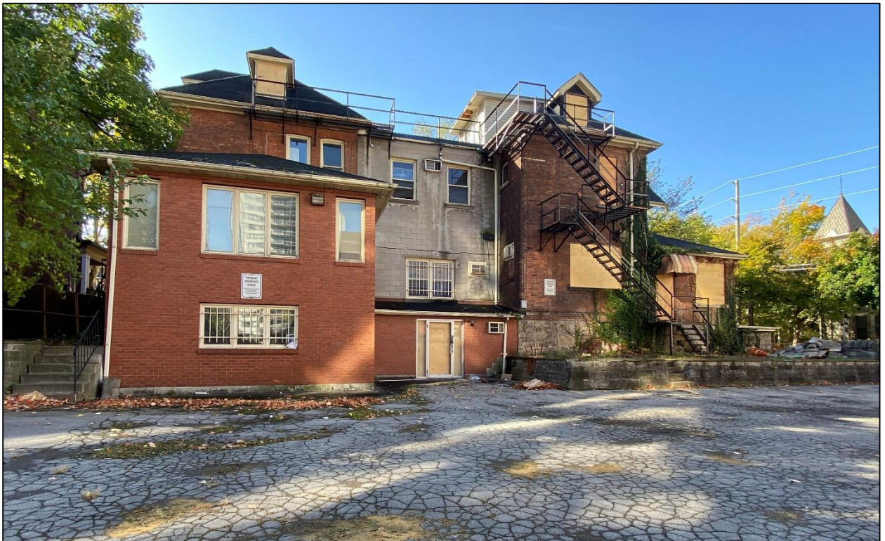
North Elevation facing the rear alley, October 21, 2022