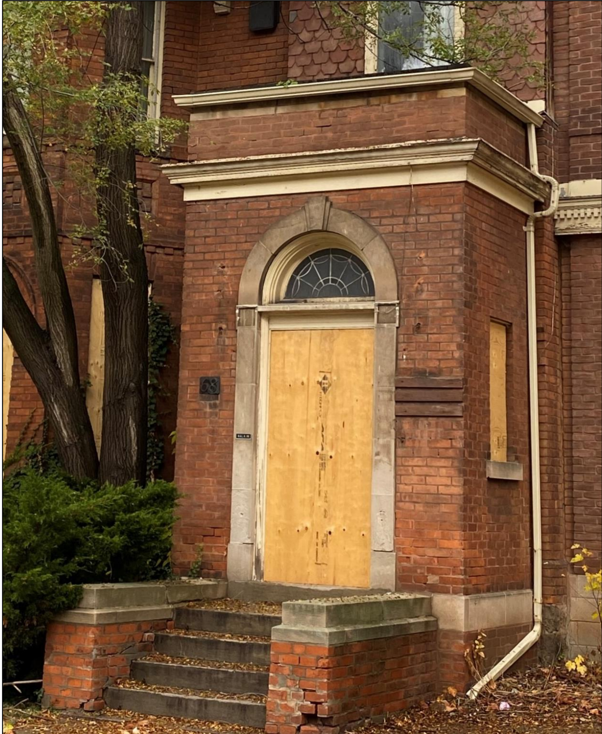
68 Charlton, South Elevation, close up of principle entrance, November 1, 2022