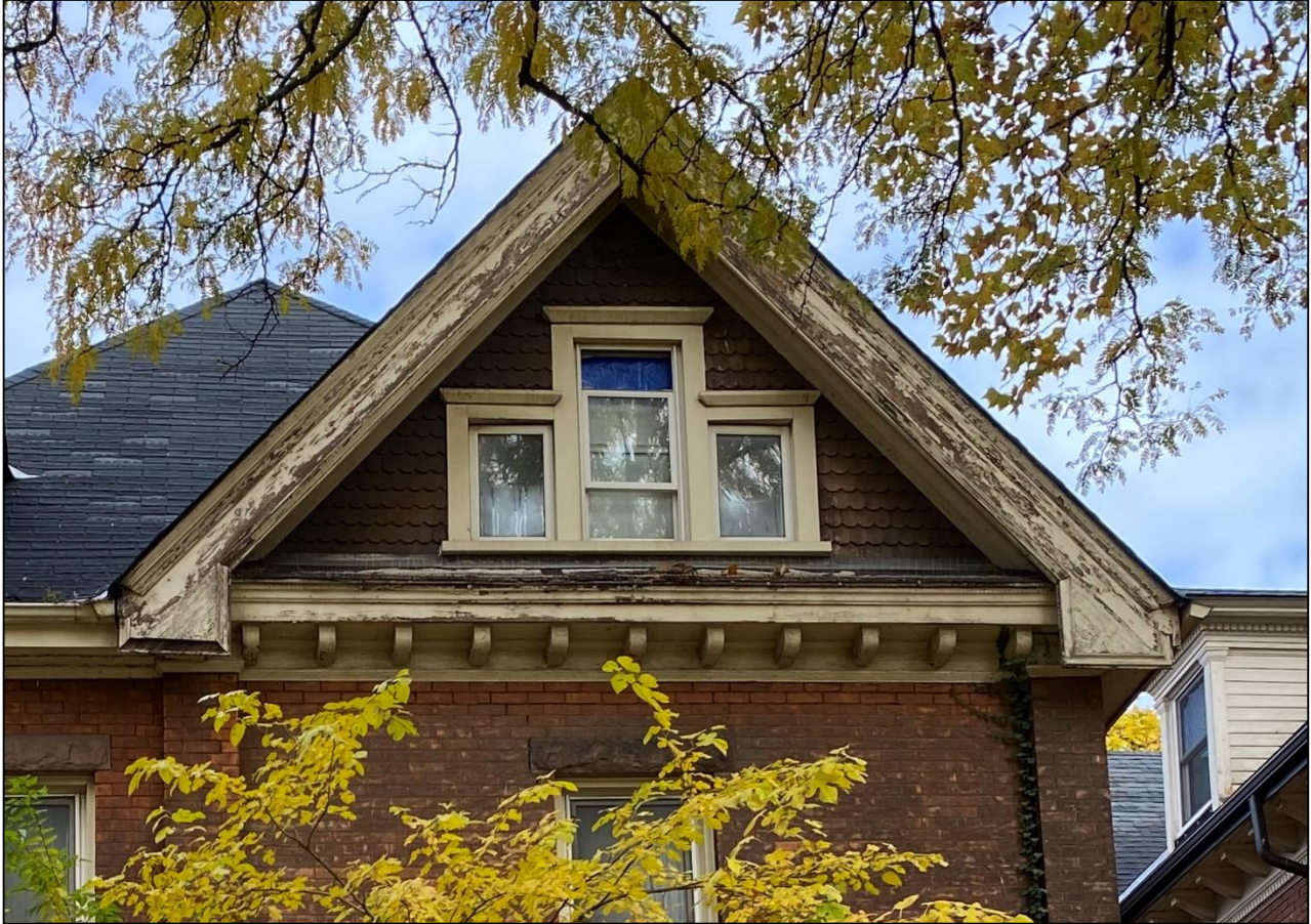
66 Charlton, South Elevation, close up of projecting pedimented front gable, November 1, 2022