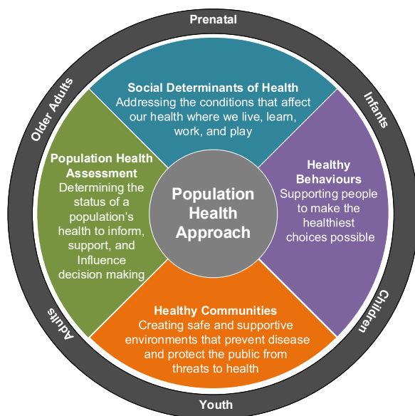
Figure 1: What is Public Health?

Public health work is grounded in a population health approach – focused on upstream efforts to promote health and prevent diseases to improve the health of populations and the differences in health among and between groups. Health risks and priorities change as people grow and age and public health works to address health across the life course.