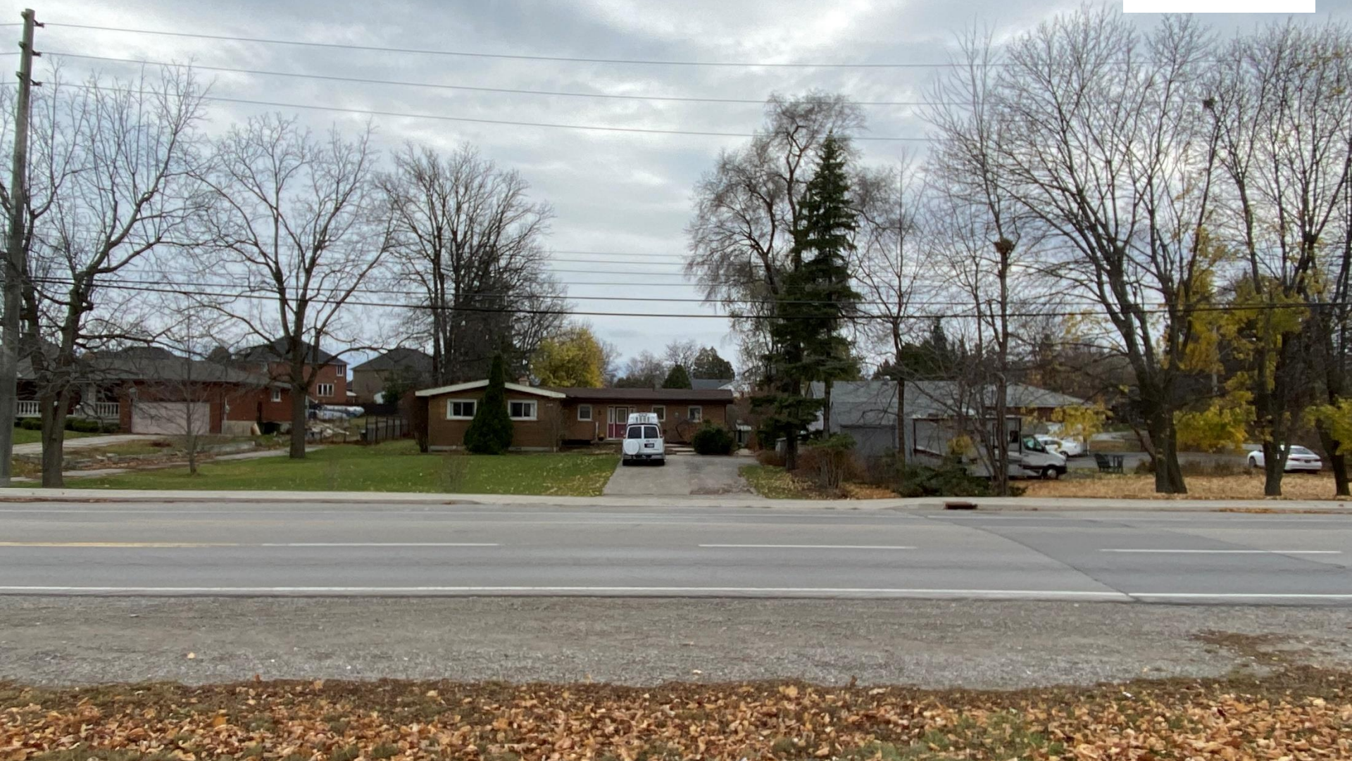
140 Rymal Road East