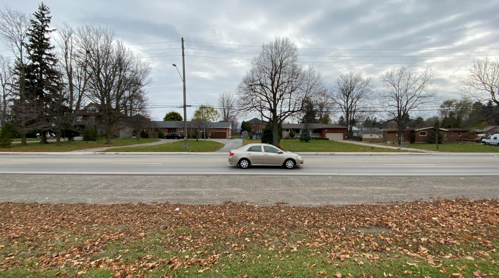
148 and 156 Rymal Road East