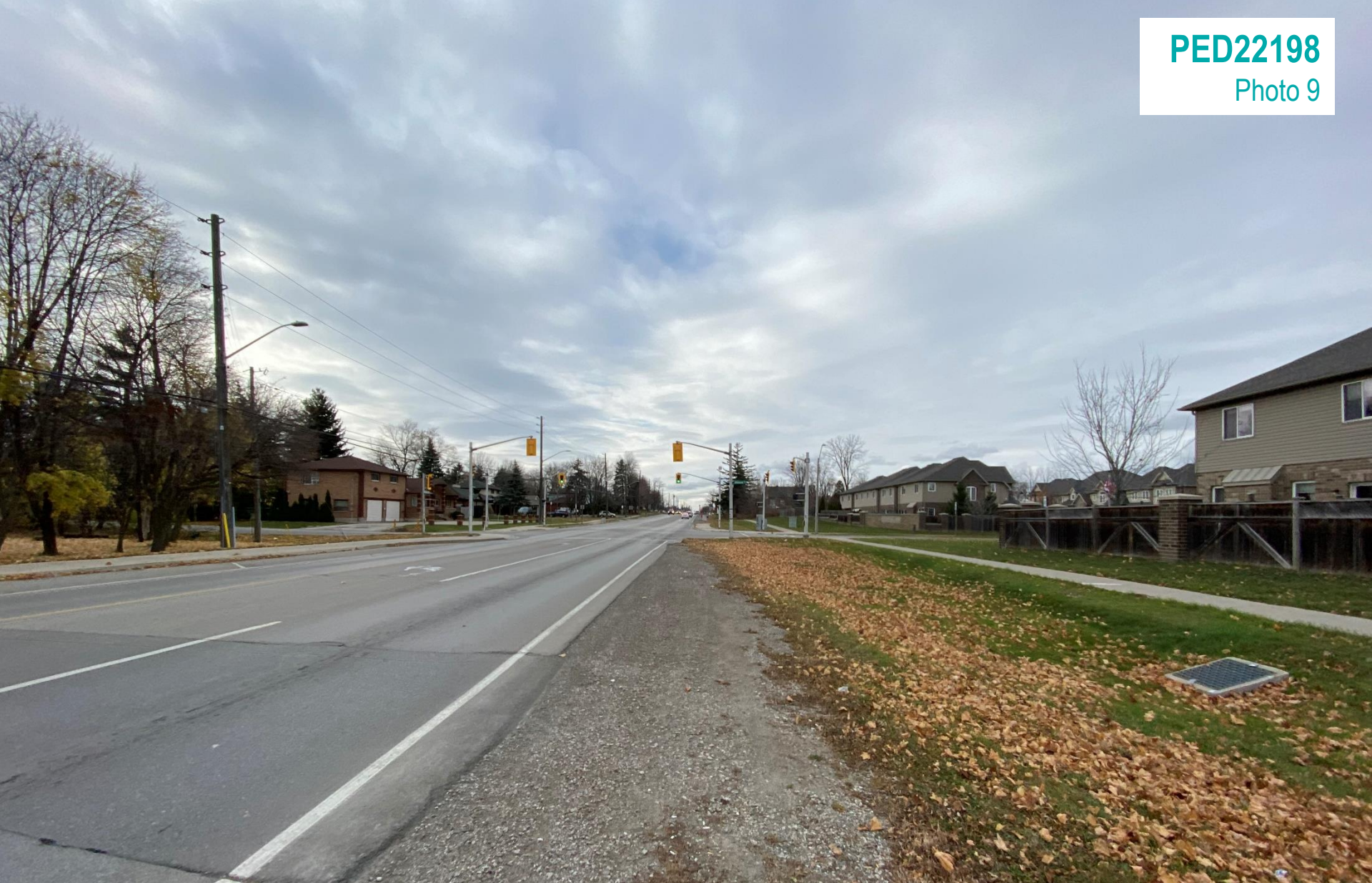
View of Rymal Road East looking west