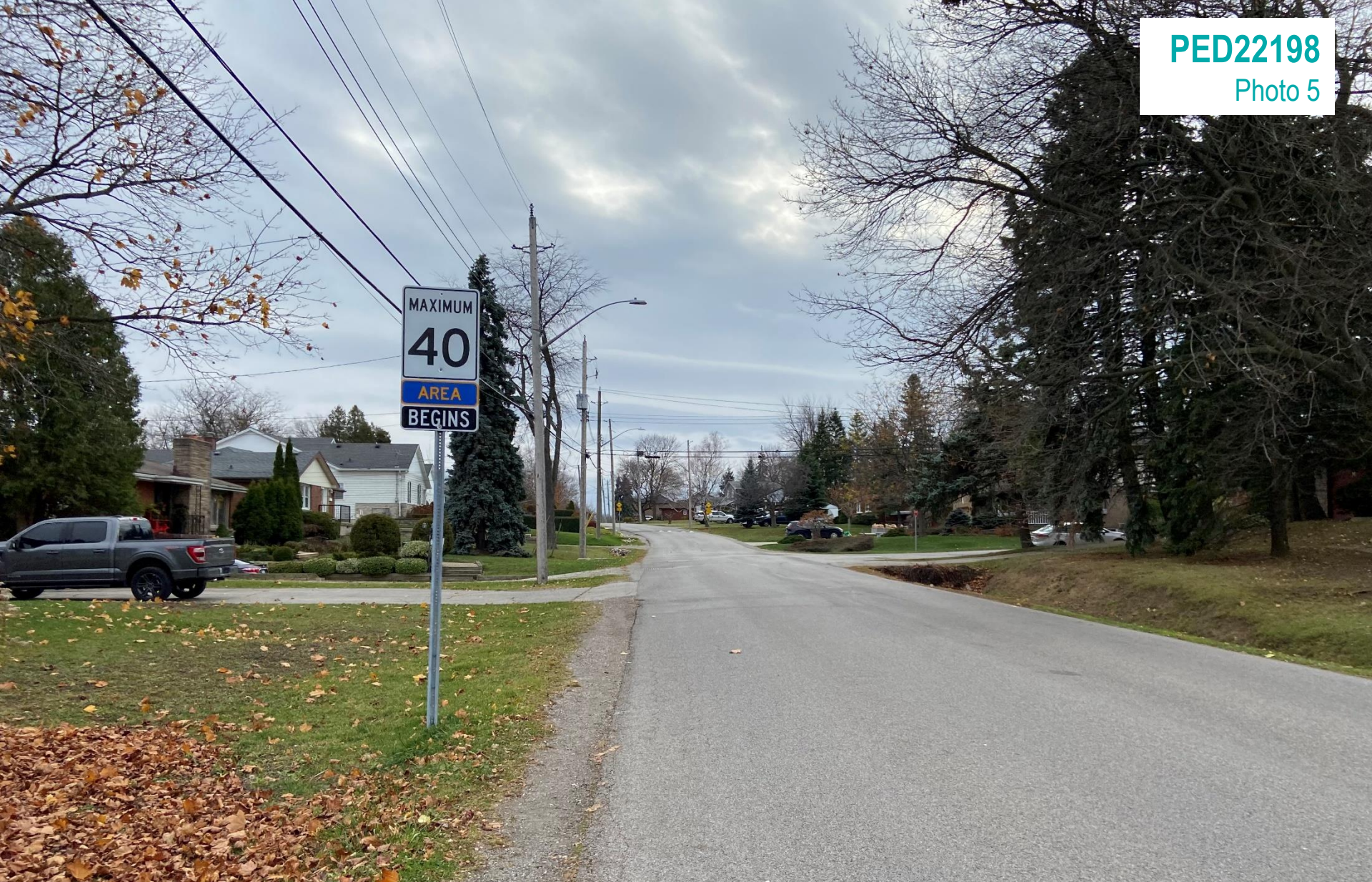
Looking south on Springside Drive