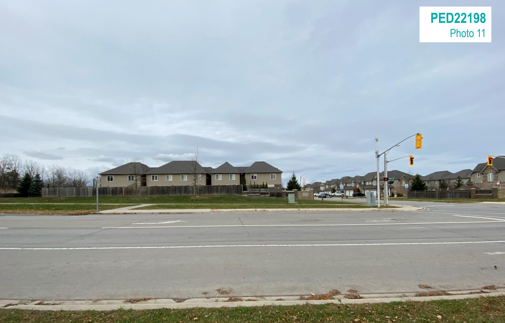
View of development north of Rymal Road East continued