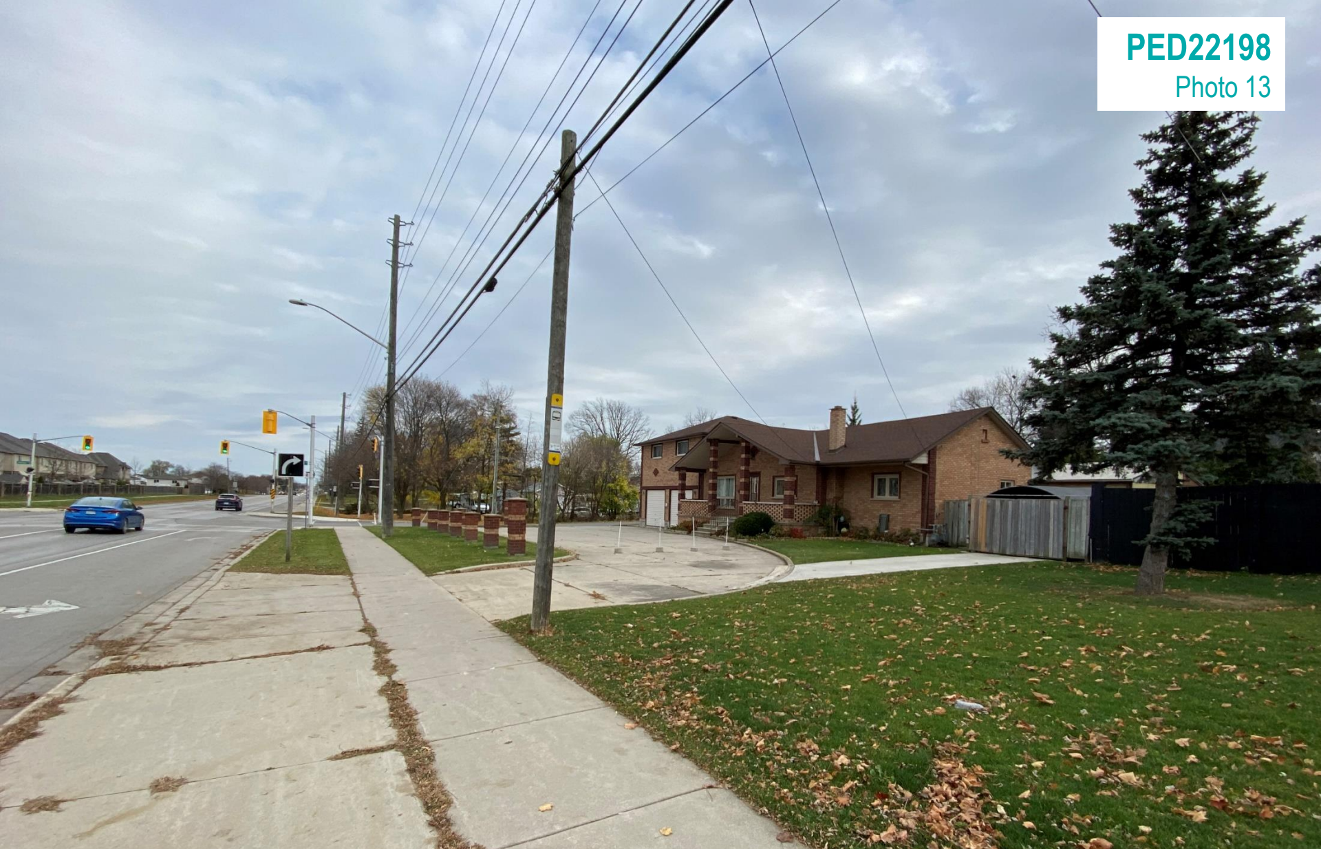
116 Rymal Road East