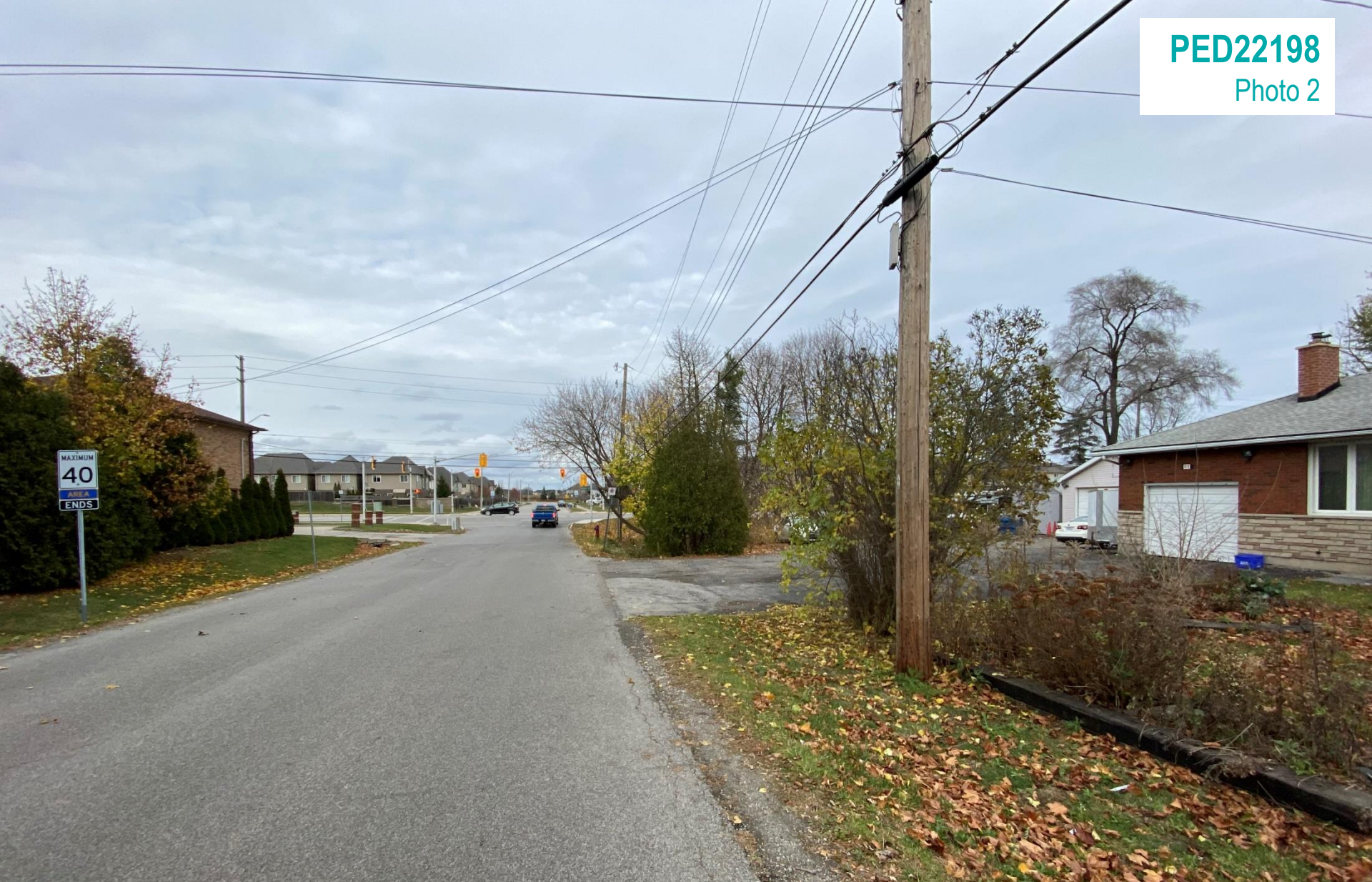
Looking north on Springside Drive