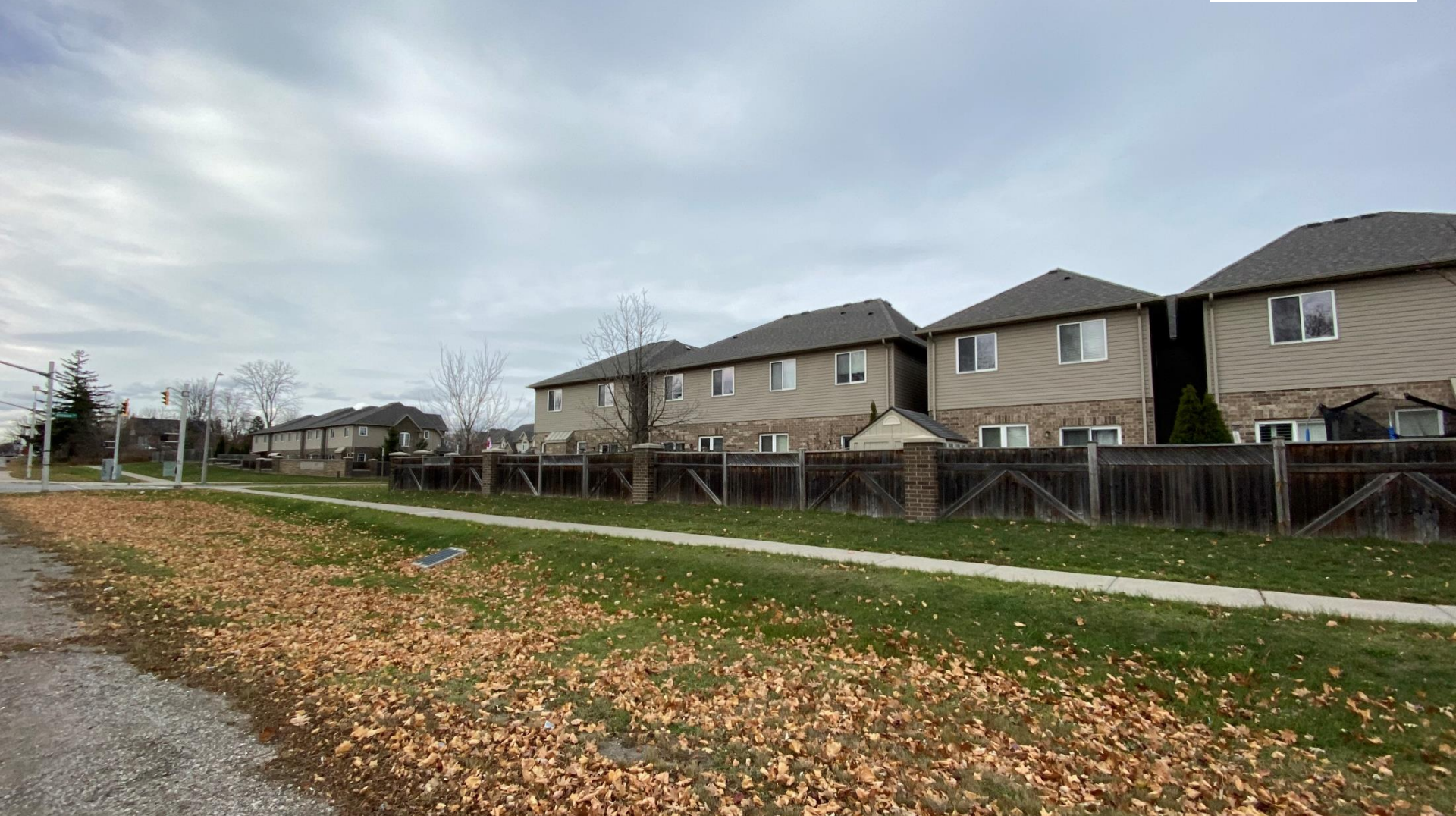
View of development north of Rymal Road East