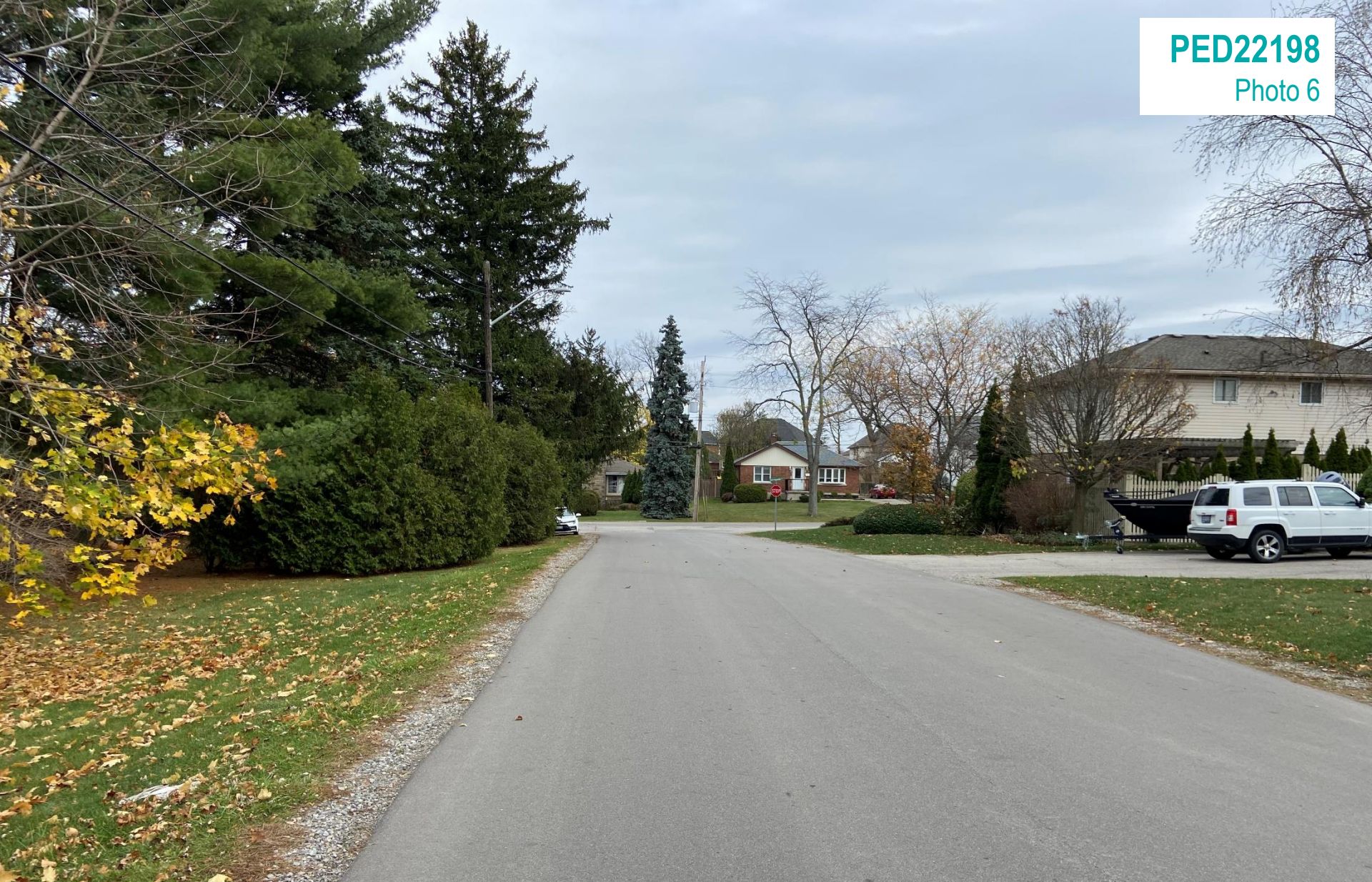
Looking toward Springside Drive from Lister Avenue