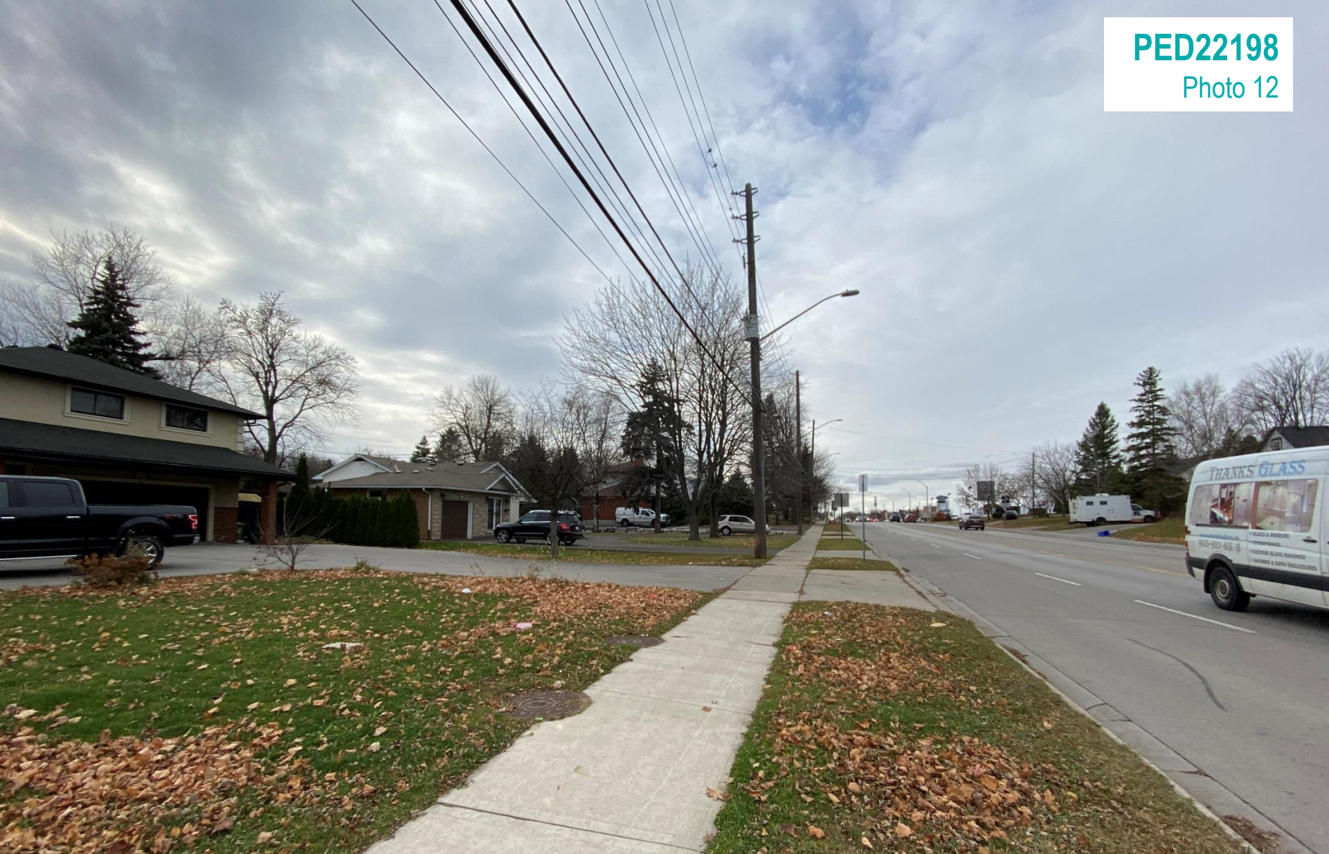
View of Rymal Road East looking west continued