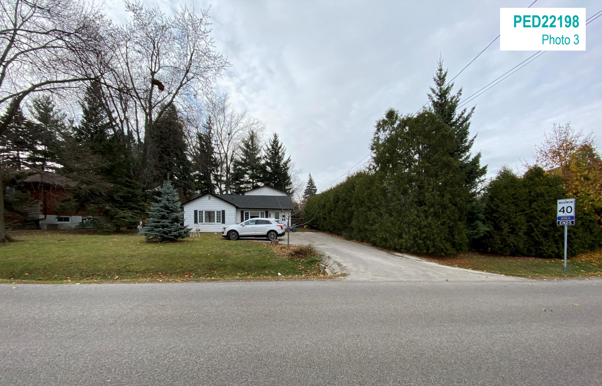
14 Springside Drive