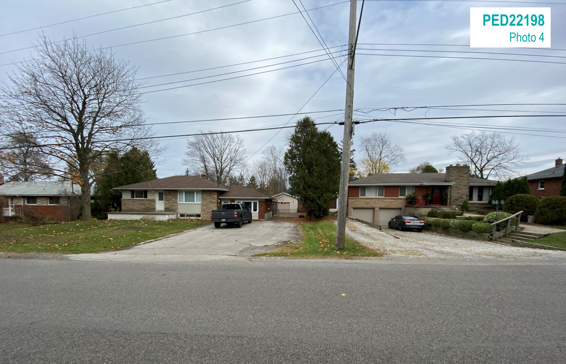
17 and 21 Springside Drive