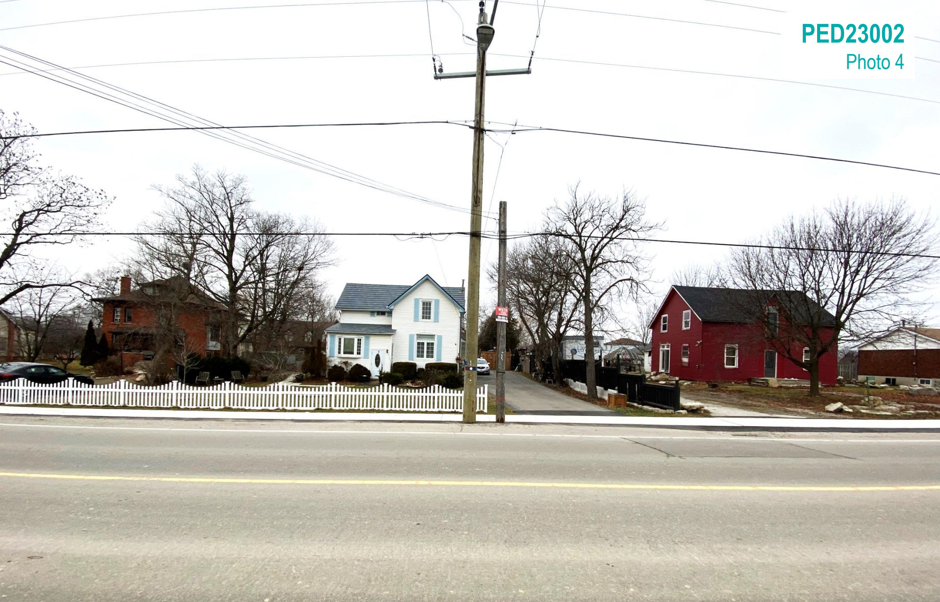
View of neighbouring property south of site