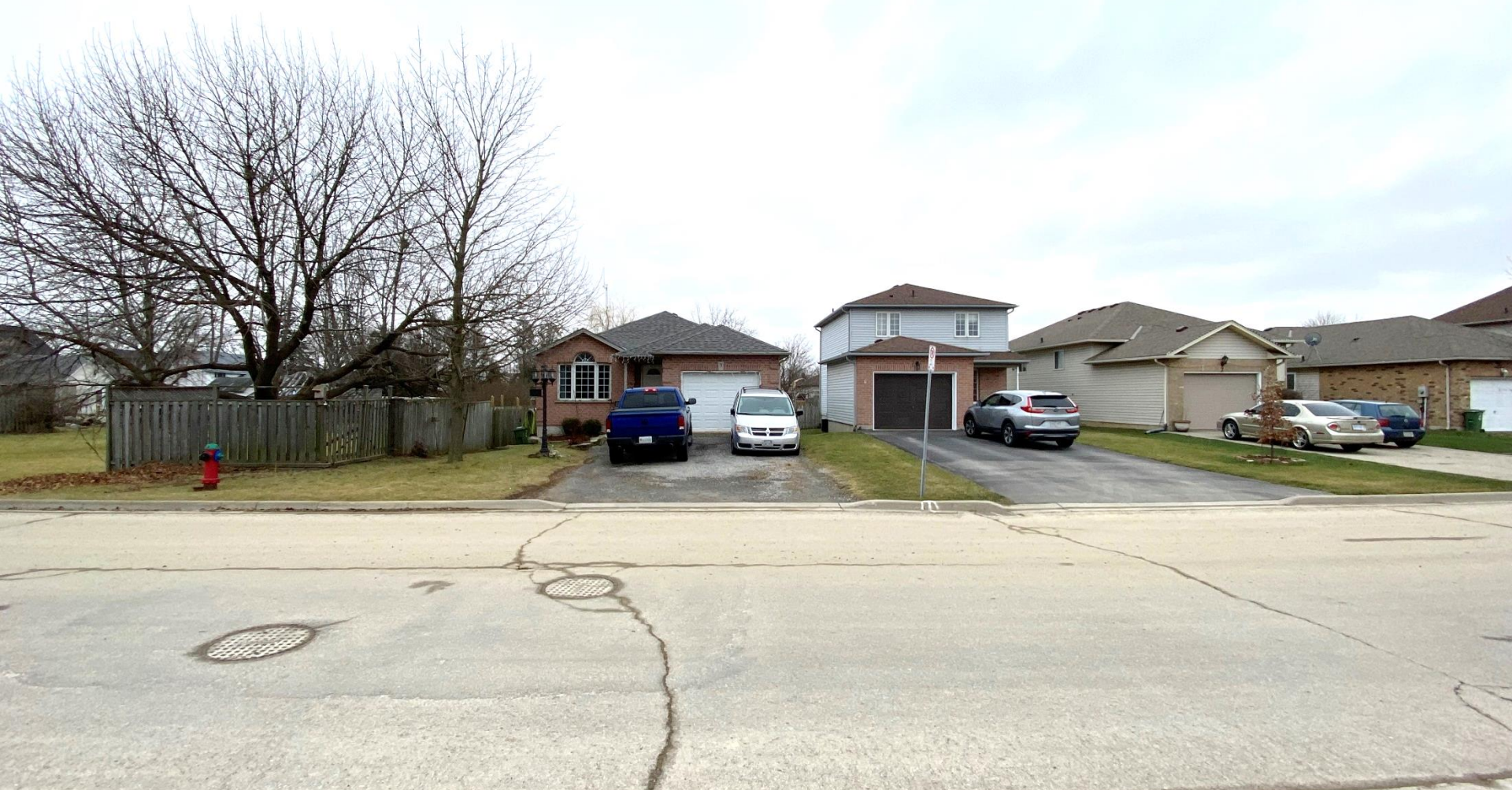
View of property west of site