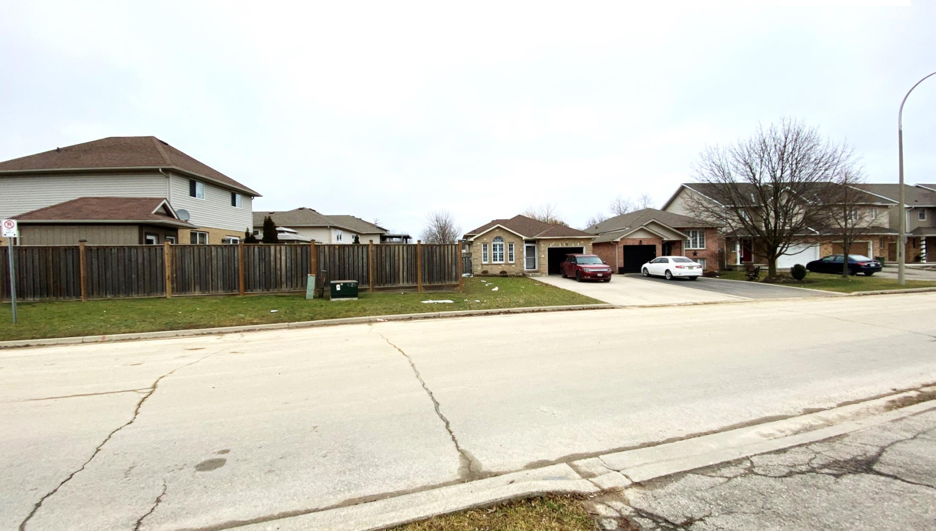
View of properties west of site continued