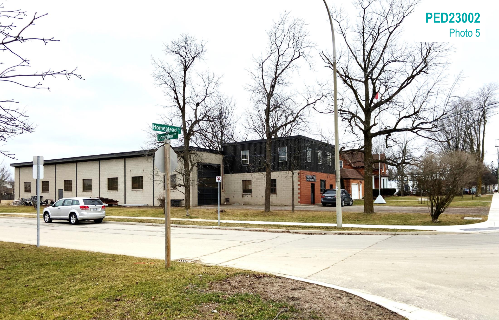
View of property north of site