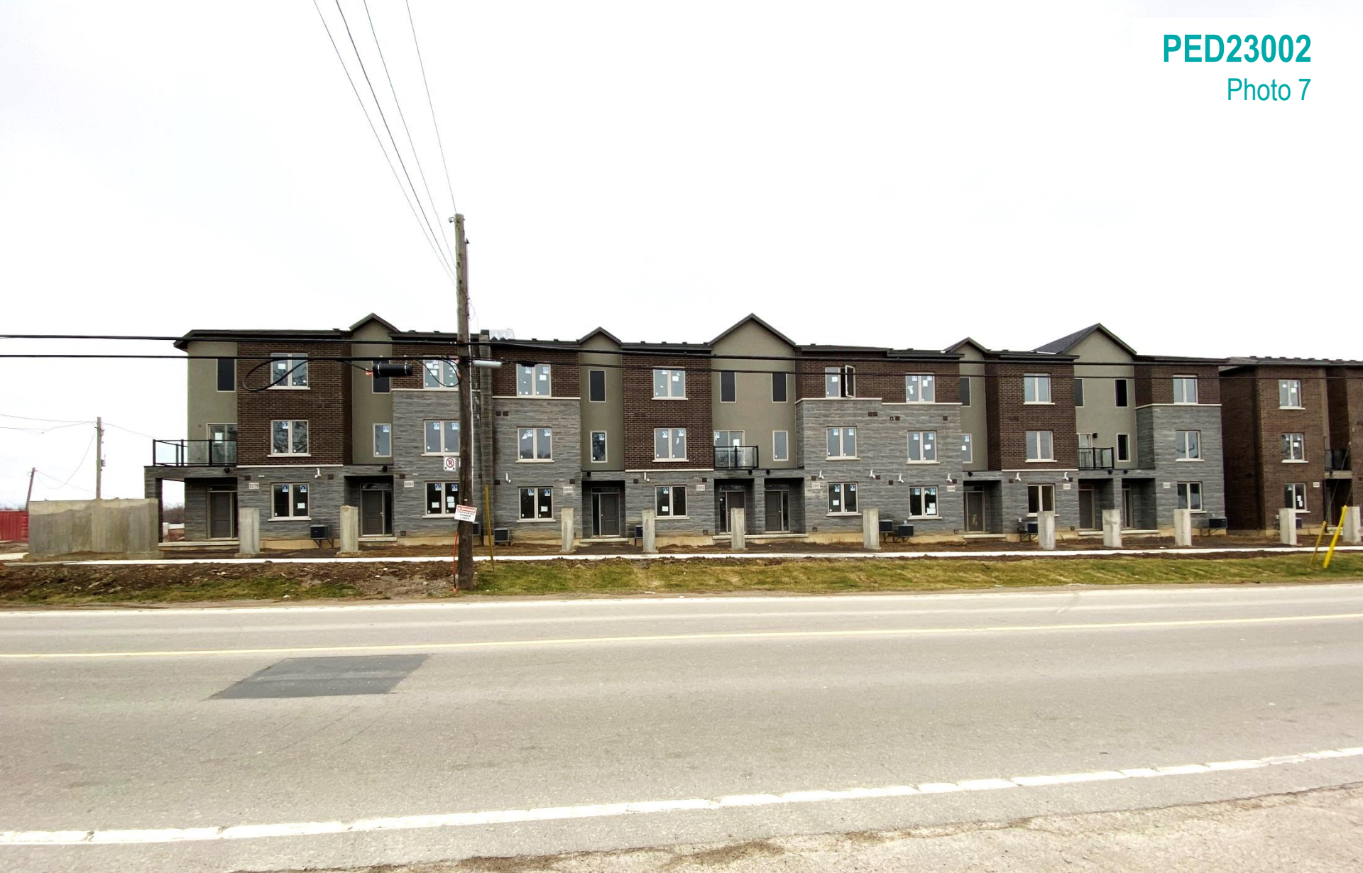
View of property east of site continued