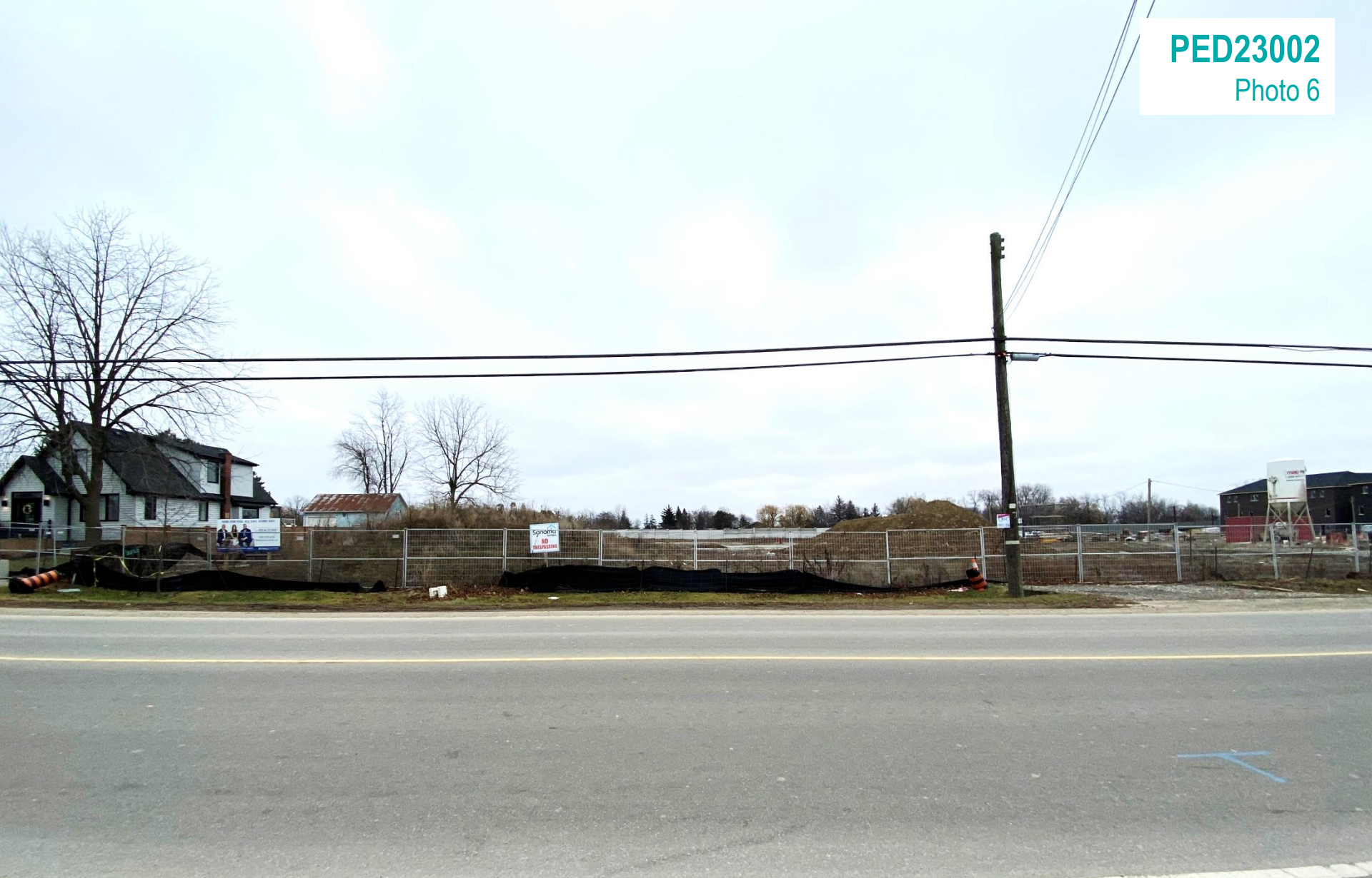
View of property east of site