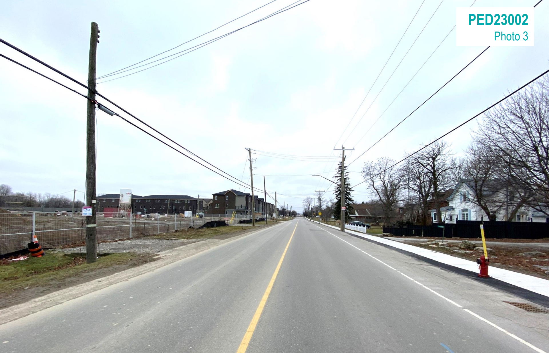
Looking South on Homestead Drive