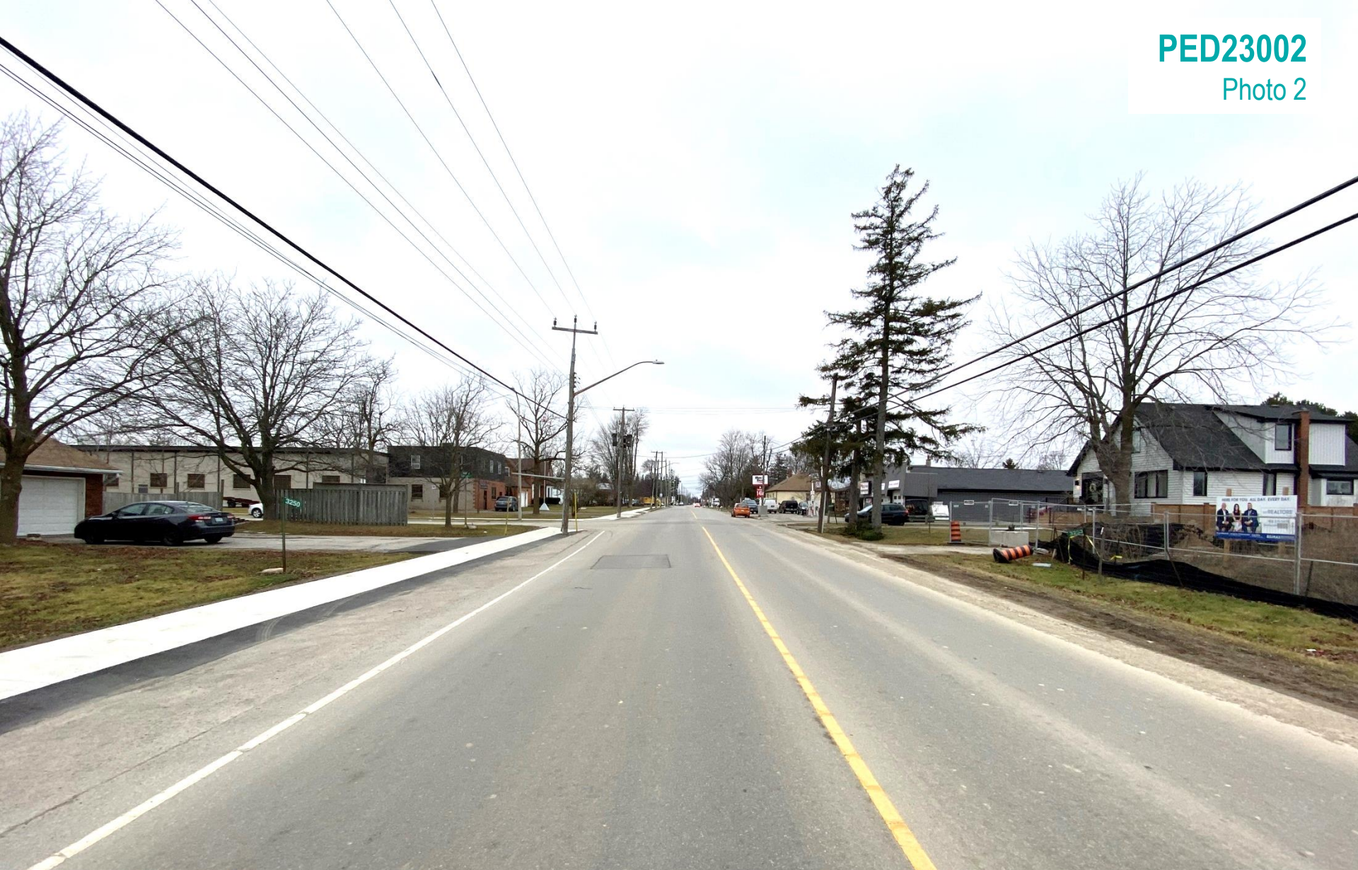
Looking North on Homestead Drive