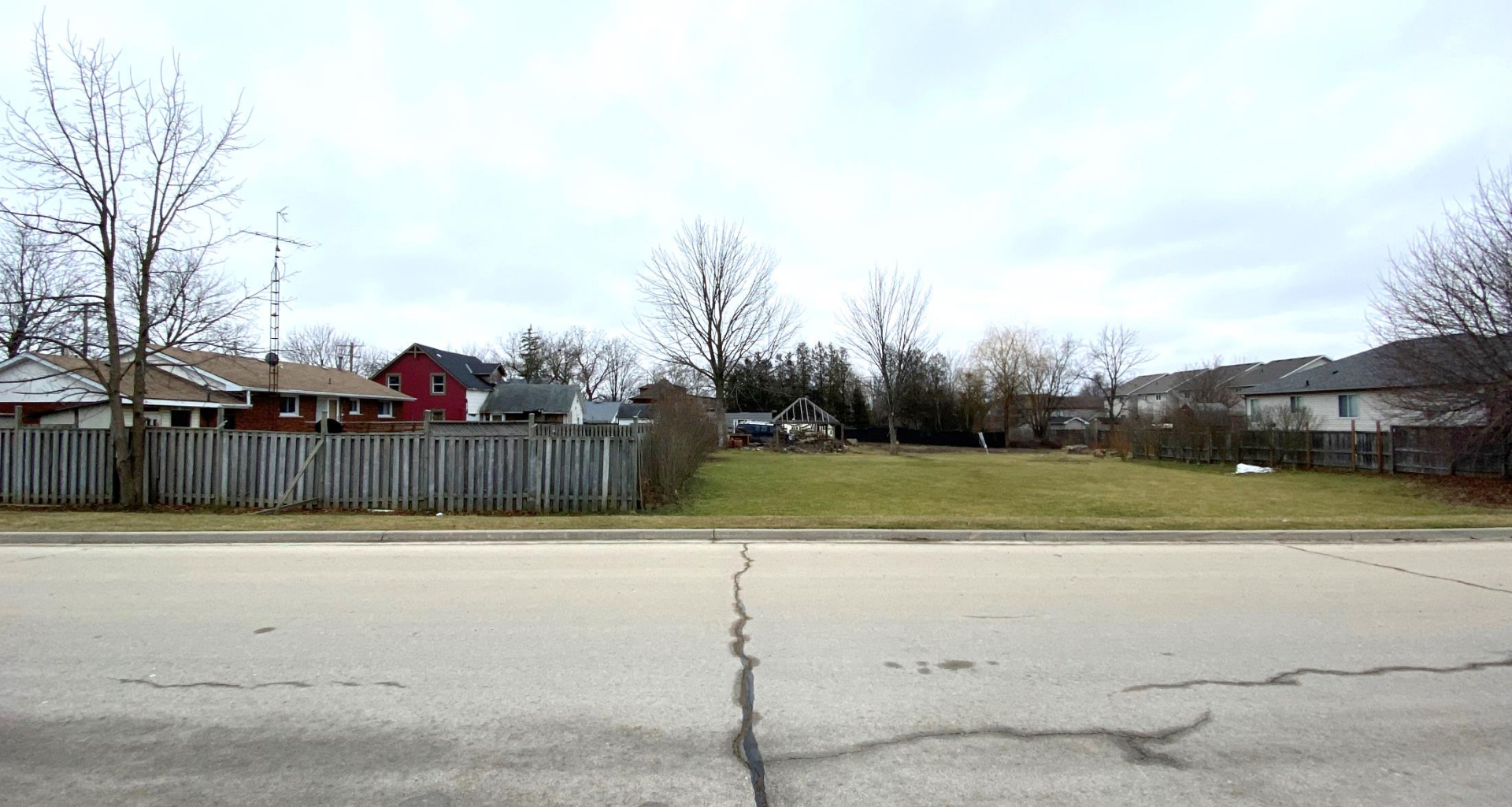
View of the property from Longview Drive