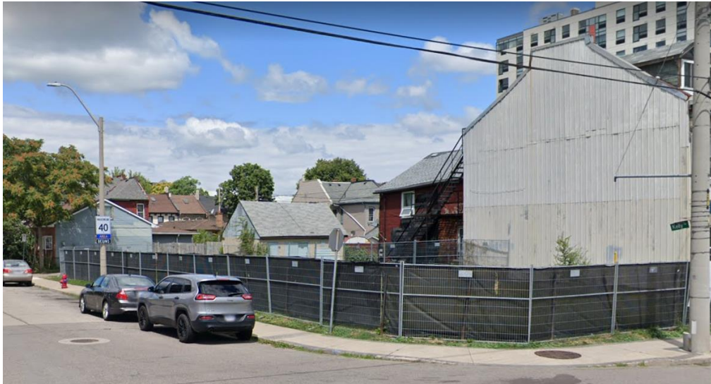
129 Wellington Street North, Hamilton - Pre-Construction