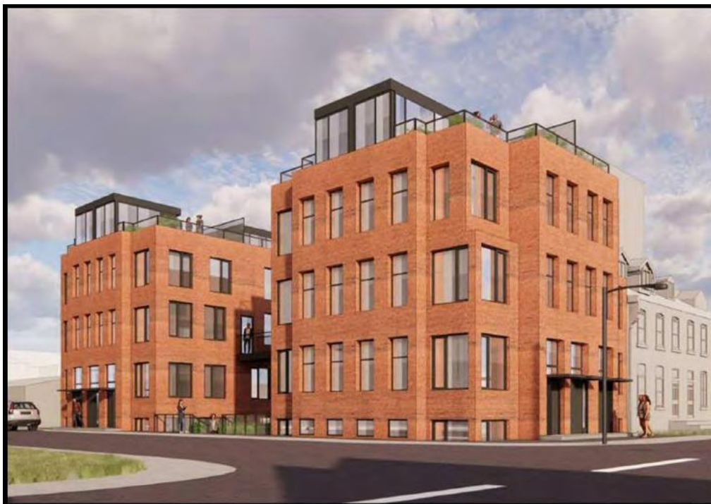
129 Wellington Street North, Hamilton - Post Construction Rendering

OUR Vision: To be the best place to raise a child and age successfully. OUR Mission: To provide high quality cost conscious public services that contribute to a healthy, safe and prosperous community, in a sustainable manner. OUR Culture: Collective Ownership, Steadfast Integrity, Courageous Change, Sensational Service, Engaged Empowered Employees.