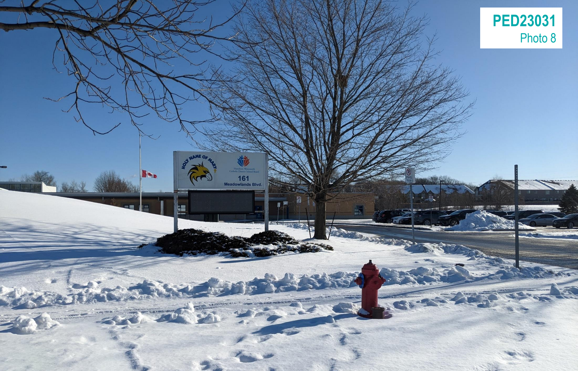
Holy Name of Mary