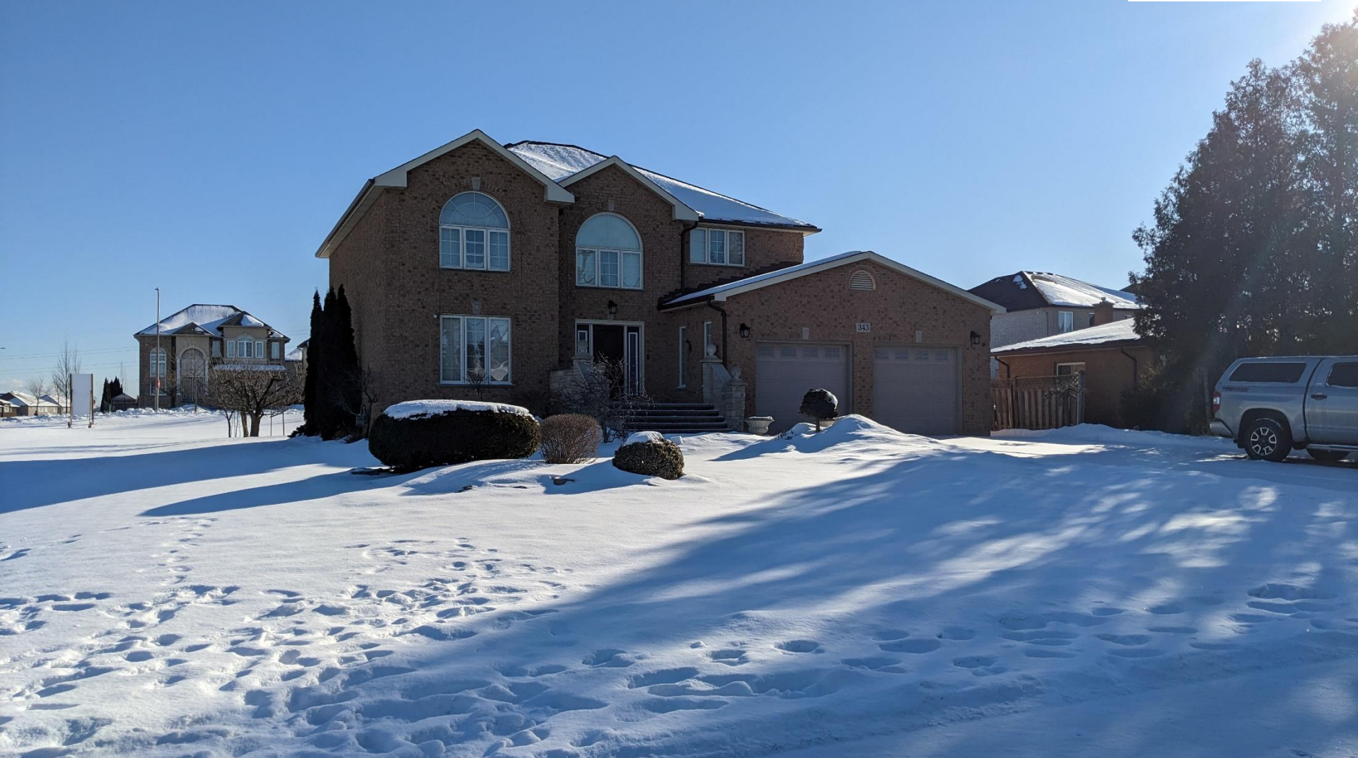
Subject Lands (Existing SDD)