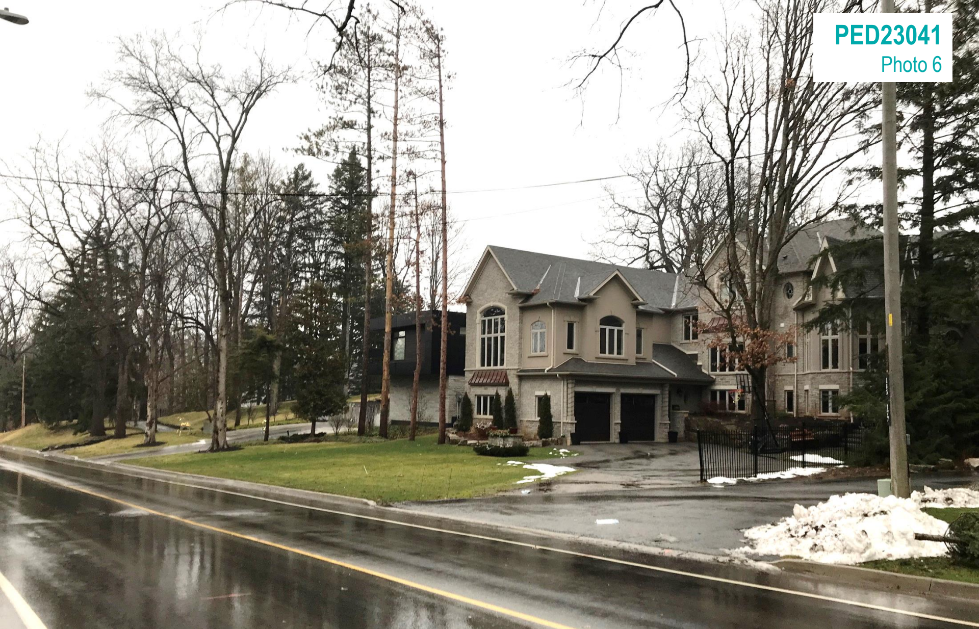
Properties on the opposite side of Lover's Lane