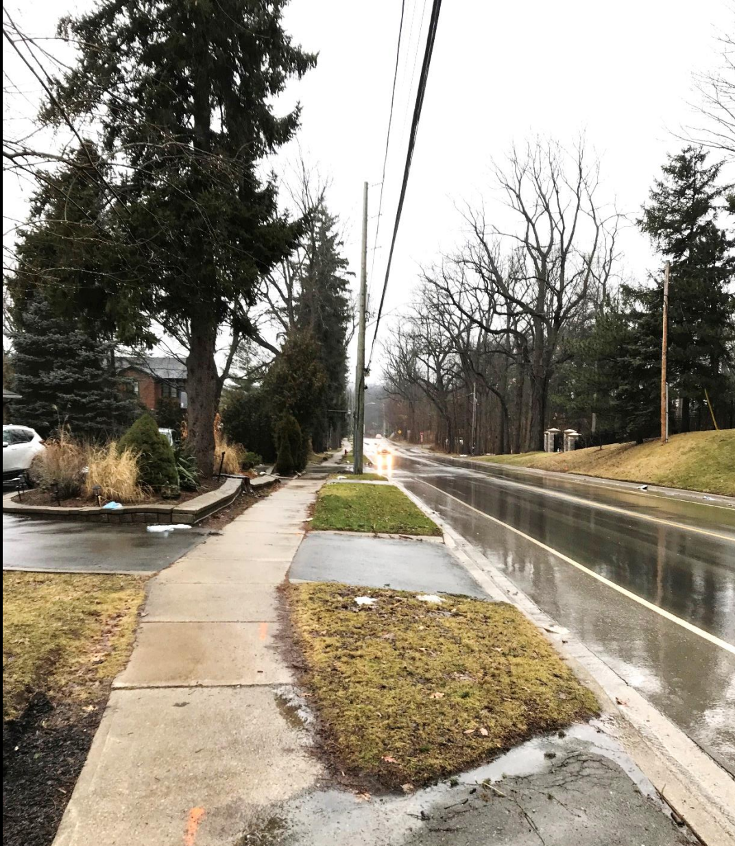
Lover's Lane looking north