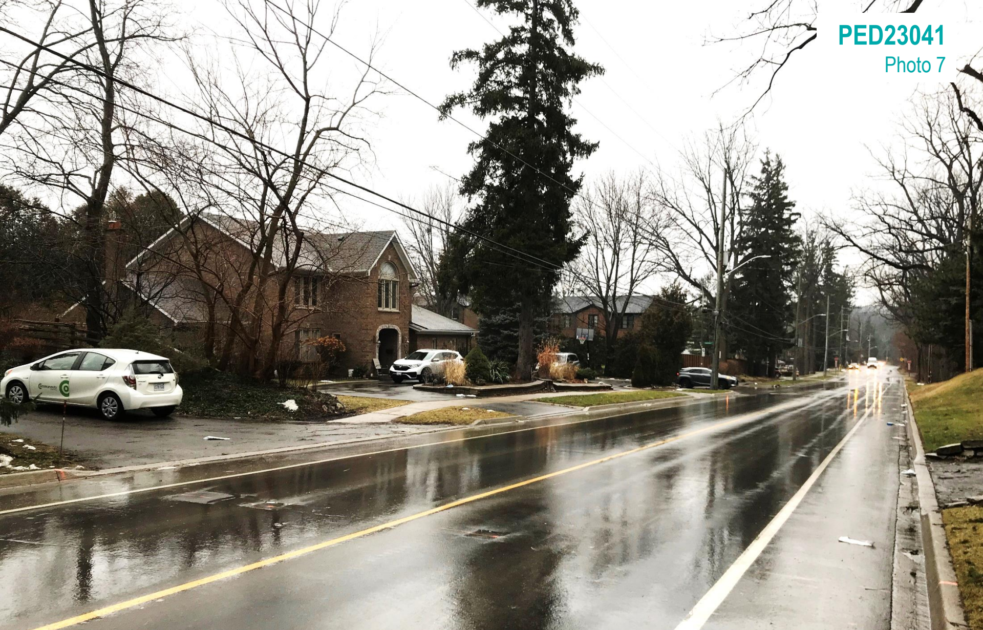
Adjacent properties to the north