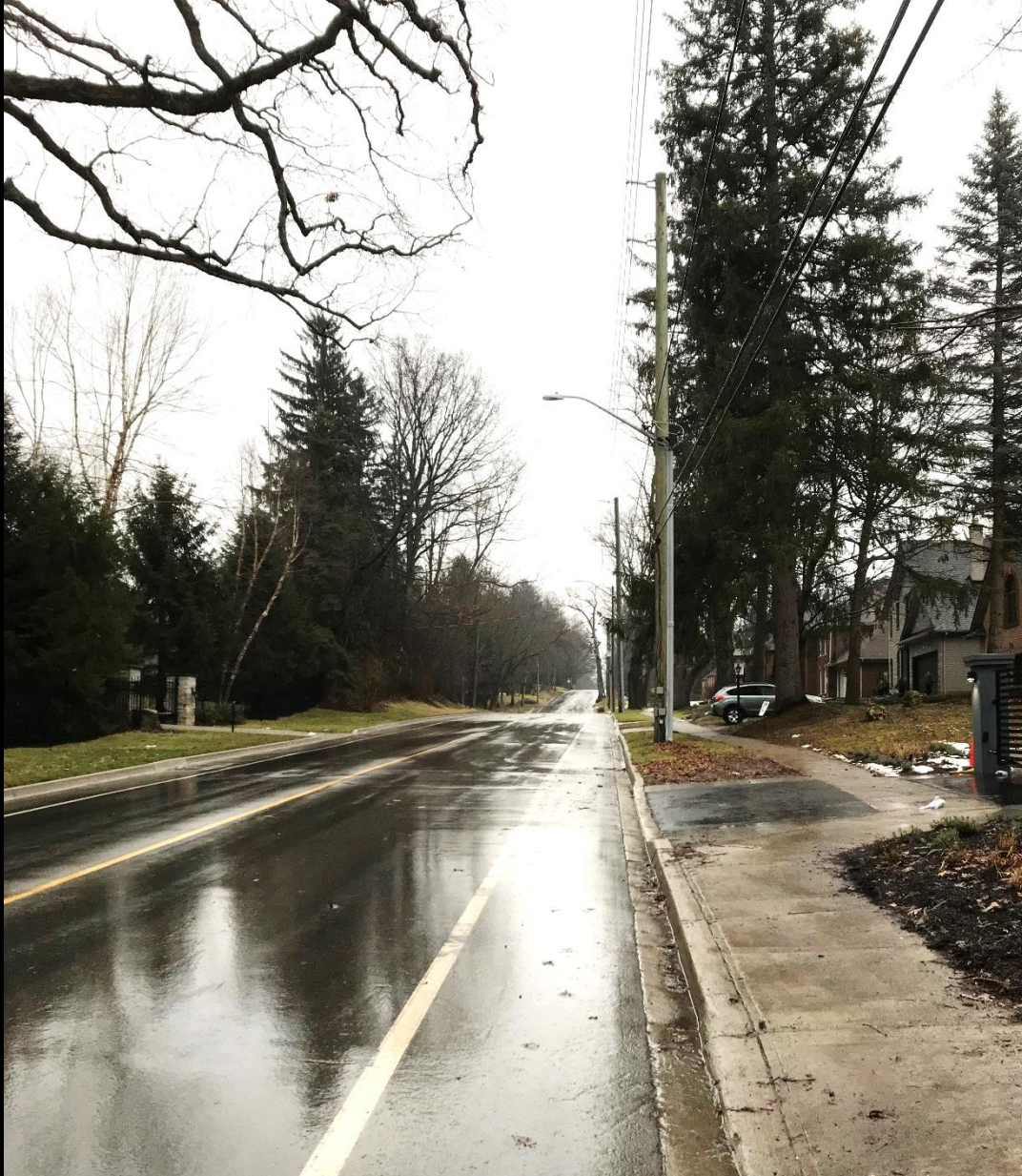
Lover's Lane looking south