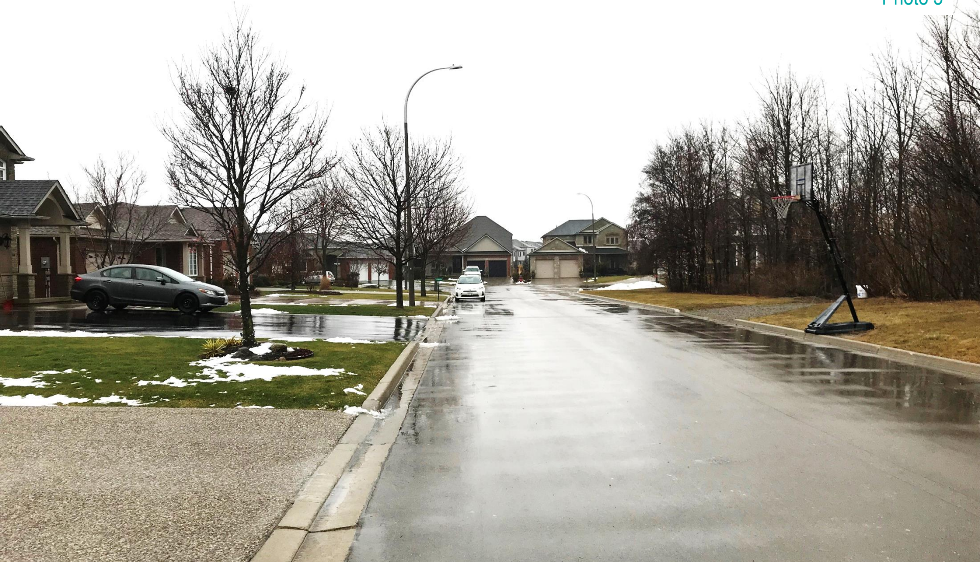
Strathearne Place looking west