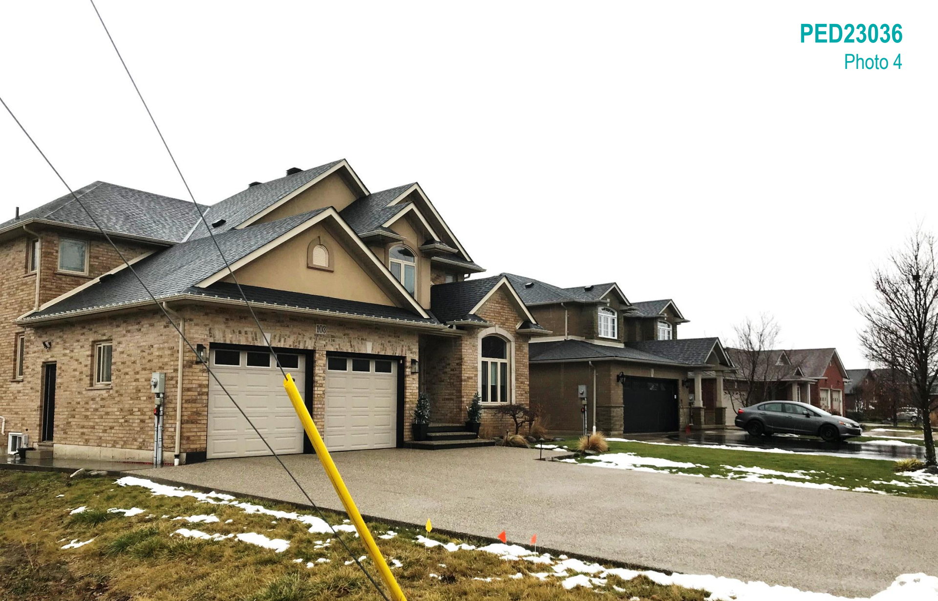
Adjacent property to the west