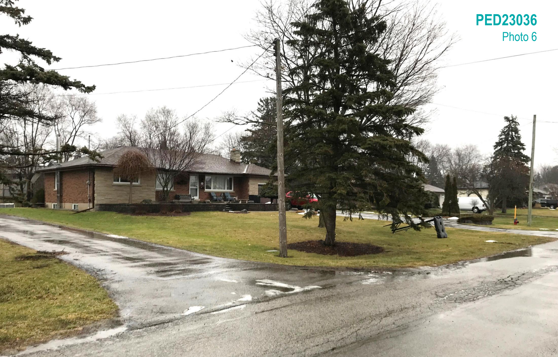
Property on the opposite side of Strathearne Place