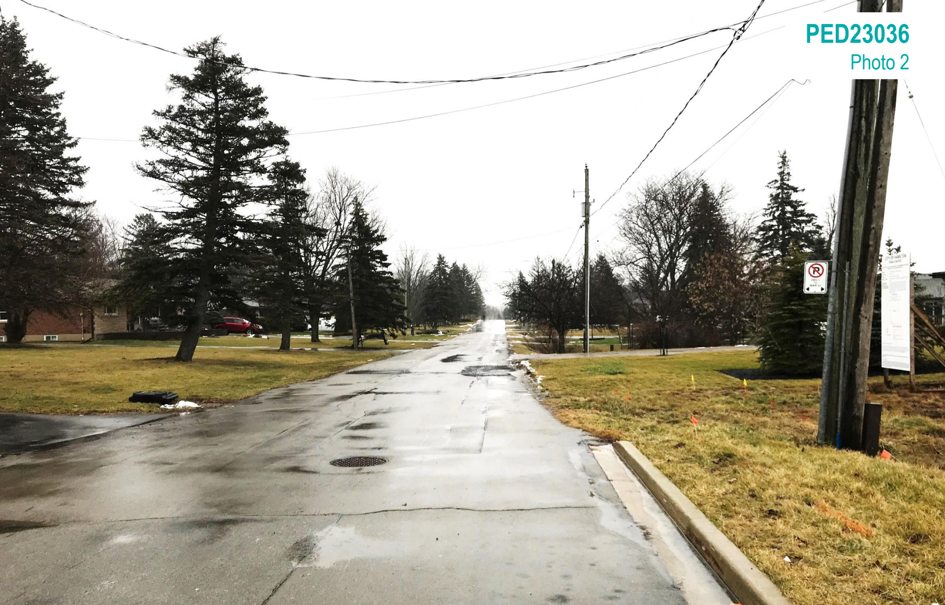
Strathearne Place looking east