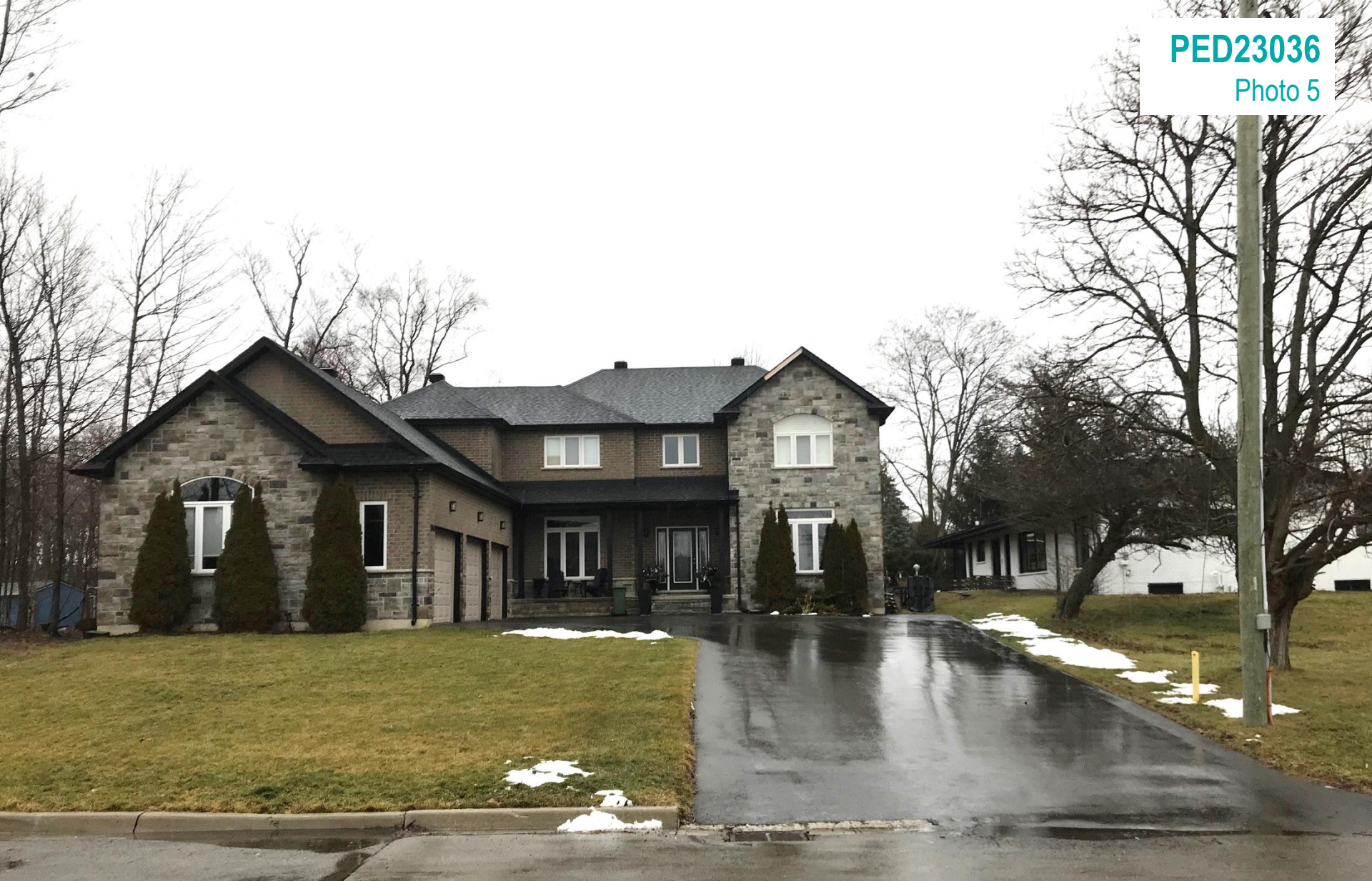
Property on the opposite side of Strathearne Place