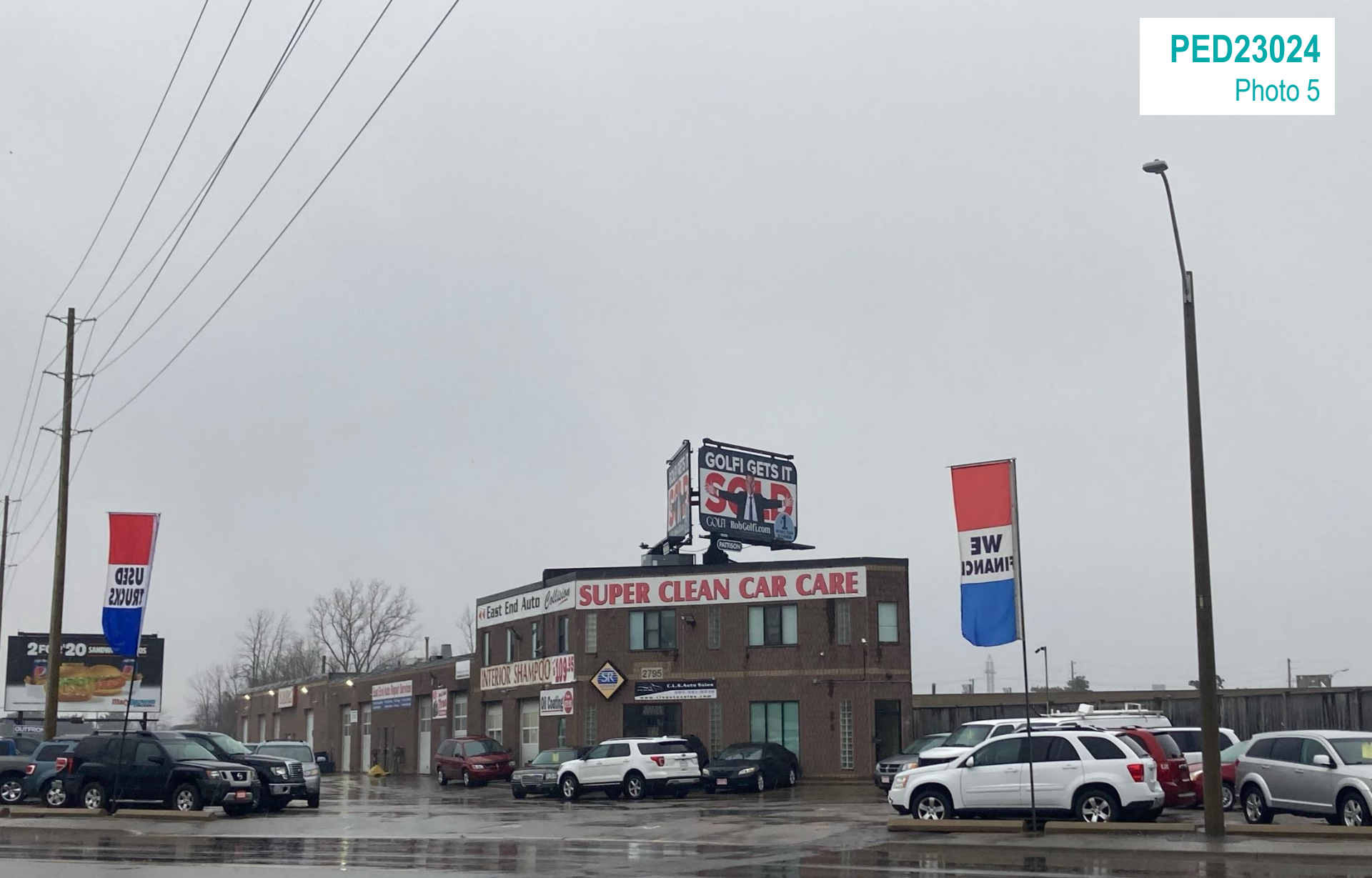
North side of Barton Street East (across from the Subject Lands)