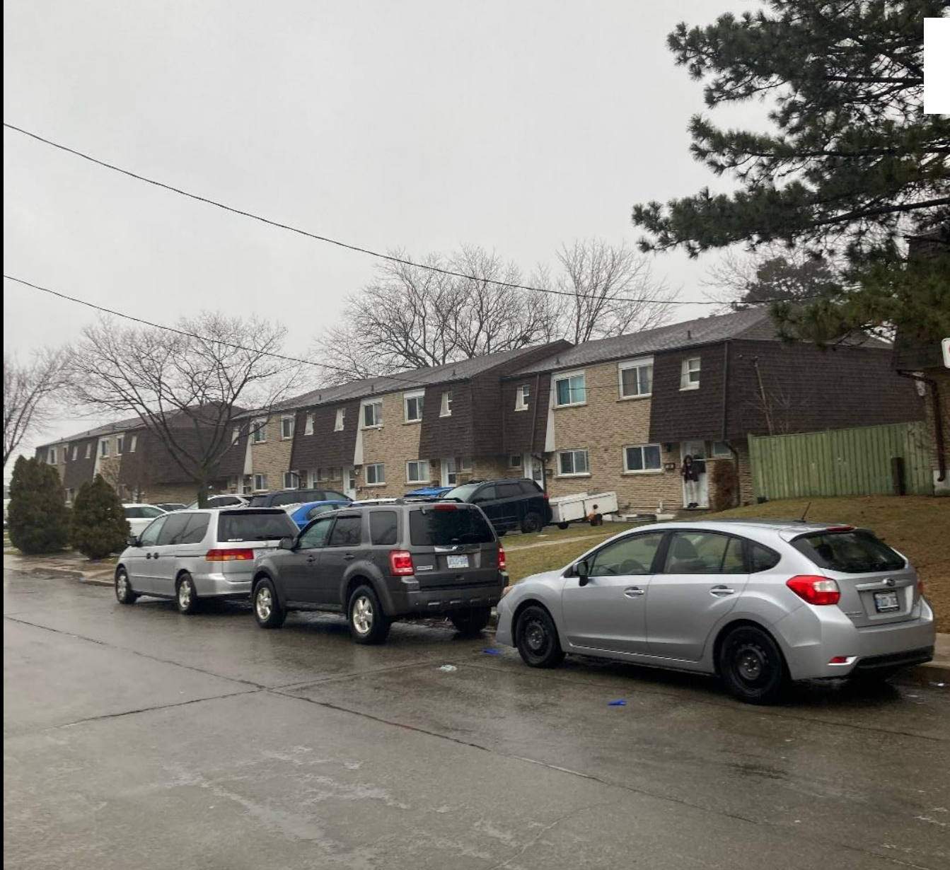
Residential to the east of the Subject Lands on Bell Manor Street