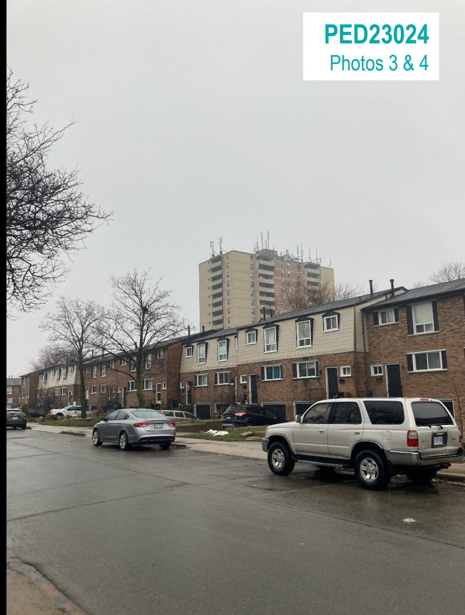
Residential uses on Berkindale Drive adjacent to the rear of the Subject Lands