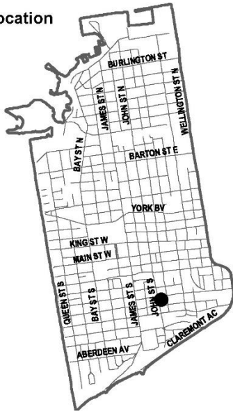
Key Map - Ward 2