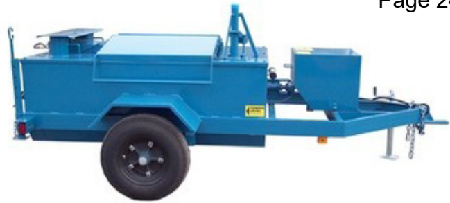
■ Above: A roofing kettle

VOCs are emitted from the installation and repair of asphalt roofs on commercial and industrial buildings, specifically from roofing kettles. A roofing kettle is a device used to heat and melt asphalt or coal tar pitch so that it can be applied onto a rooftop to provide a protective coating. To limit VOC emissions: