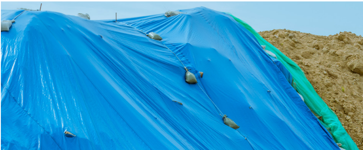
■ Protecting a stockpile.

Several work practices can be employed to mitigate fugitive dust emissions resulting from storage piles.