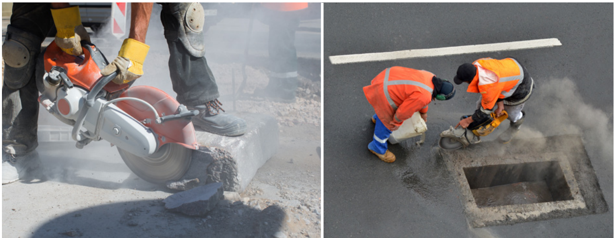
■ Above: These photos illustrate concrete cutting and how the activity can generate dust.