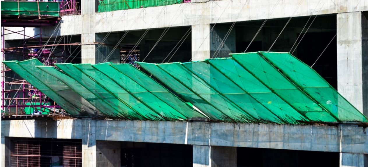
■ Above: Construction screen on temporary panels blocks vision, dust and debris