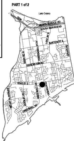
Key Map - Ward 5