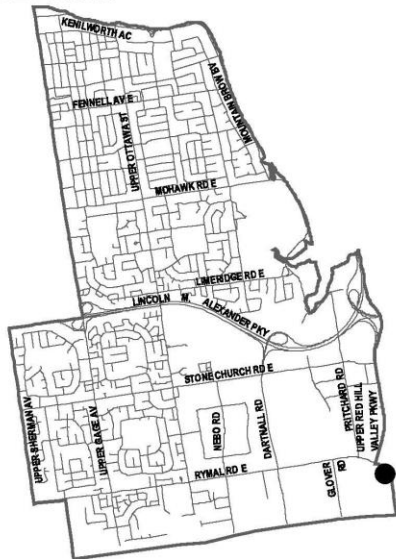
Key Map - Ward 6