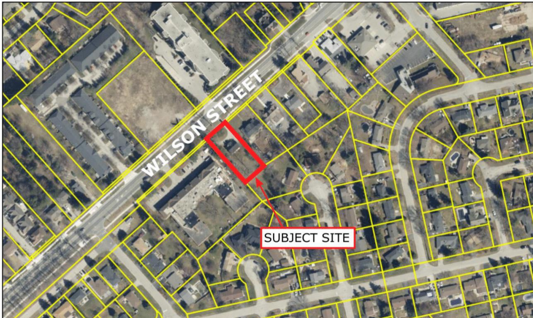
Figure 1: Subject lands located at 140 Wilson Street (VuMap).

The ER Zone permits one (1) single detached dwelling and structures accessory thereto. The proposed Zoning By-law Amendment application will facilitate a low-rise apartment dwelling on the subject lands, consistent with the vision for the site established in the Urban Hamilton Official Plan and the Ancaster Wilson Street Secondary Plan.