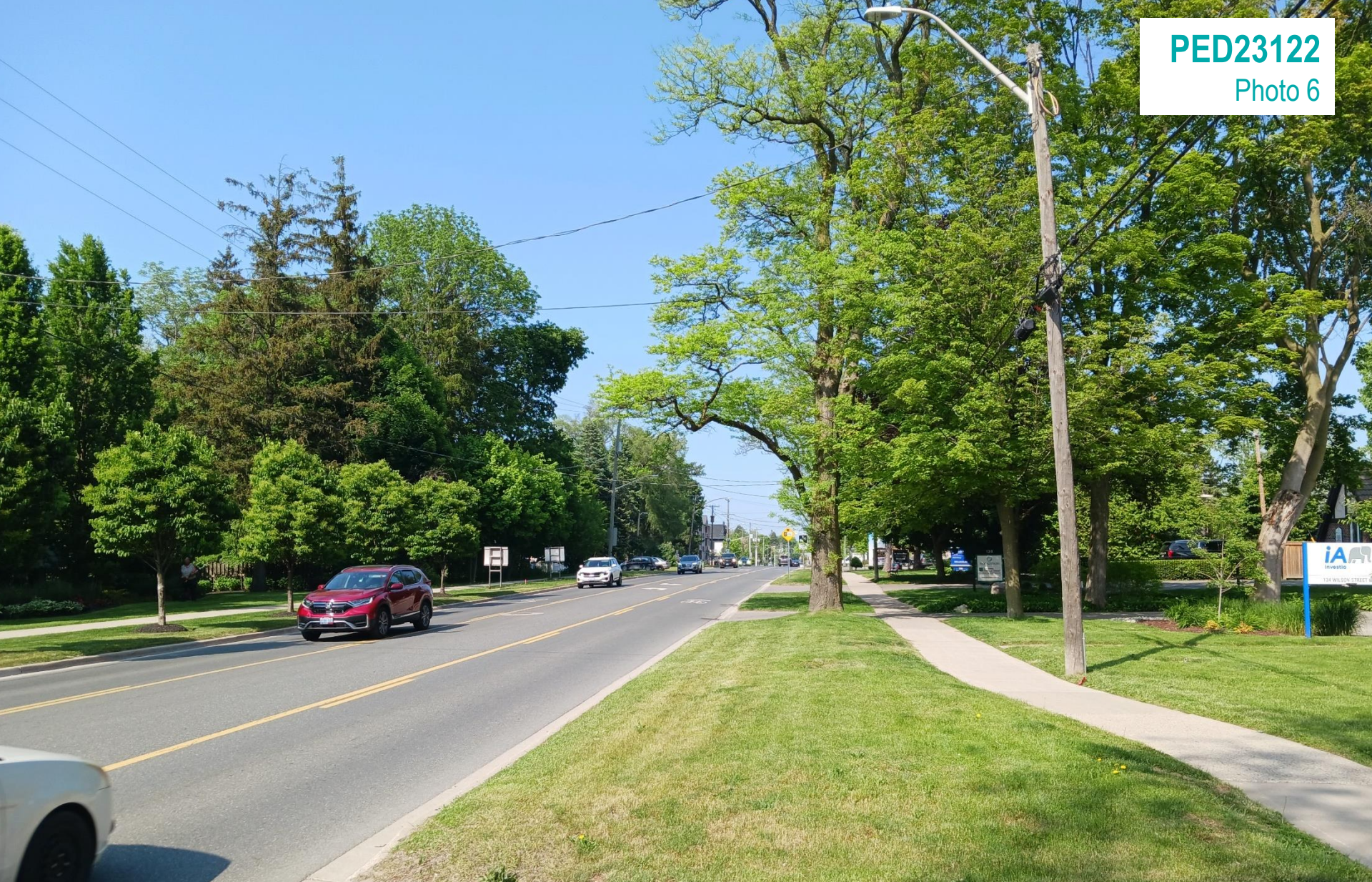
View to east along Wilson Street West