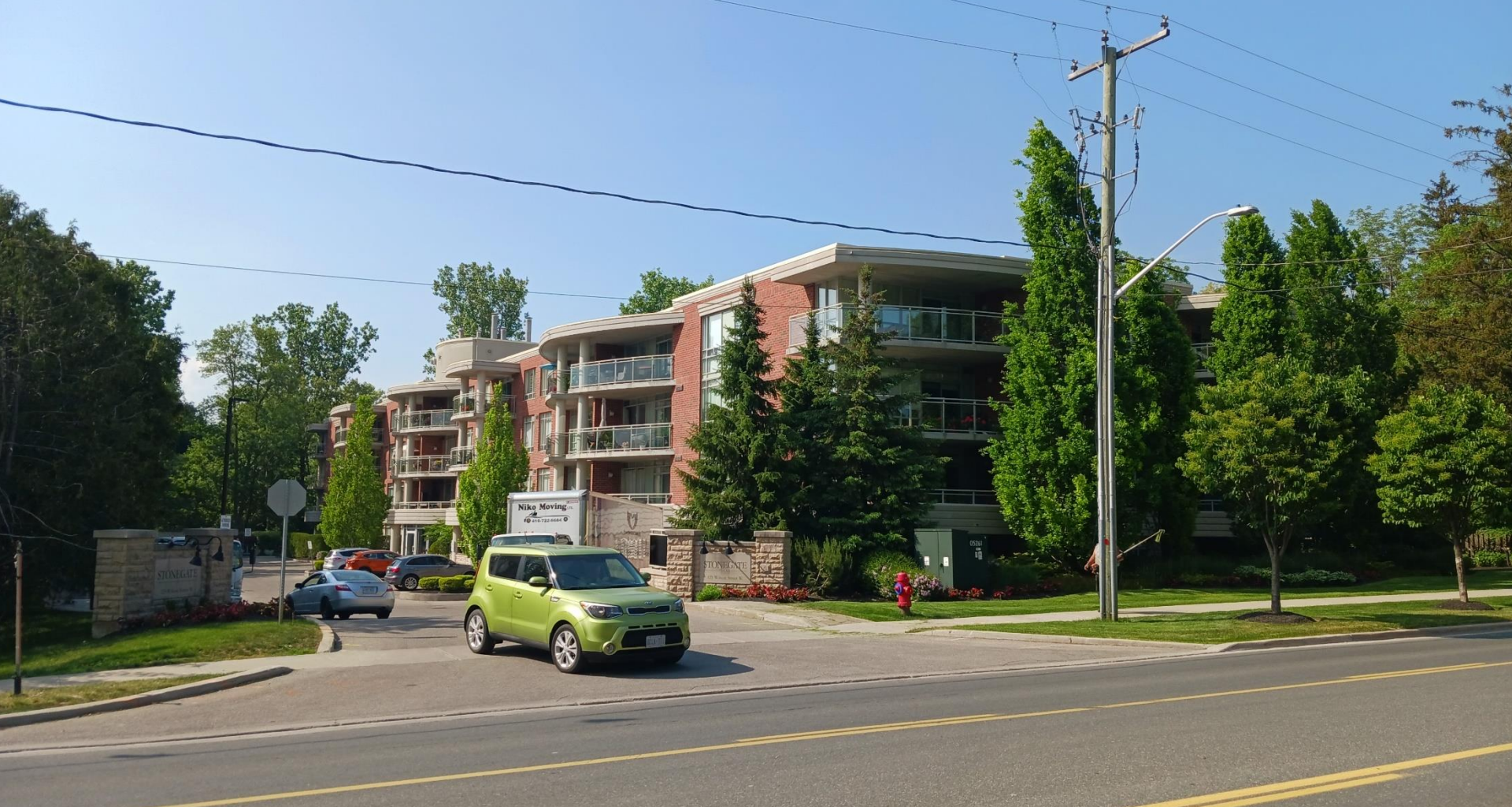
Multiple dwelling across Wilson Street West