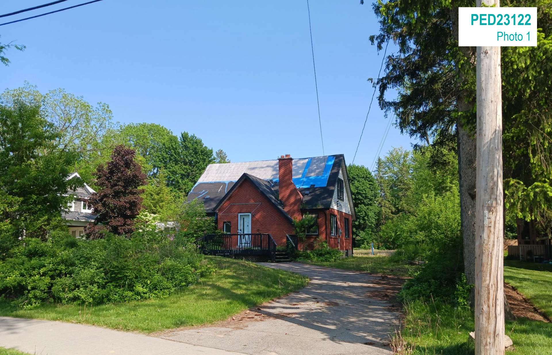
View of Subject Lands