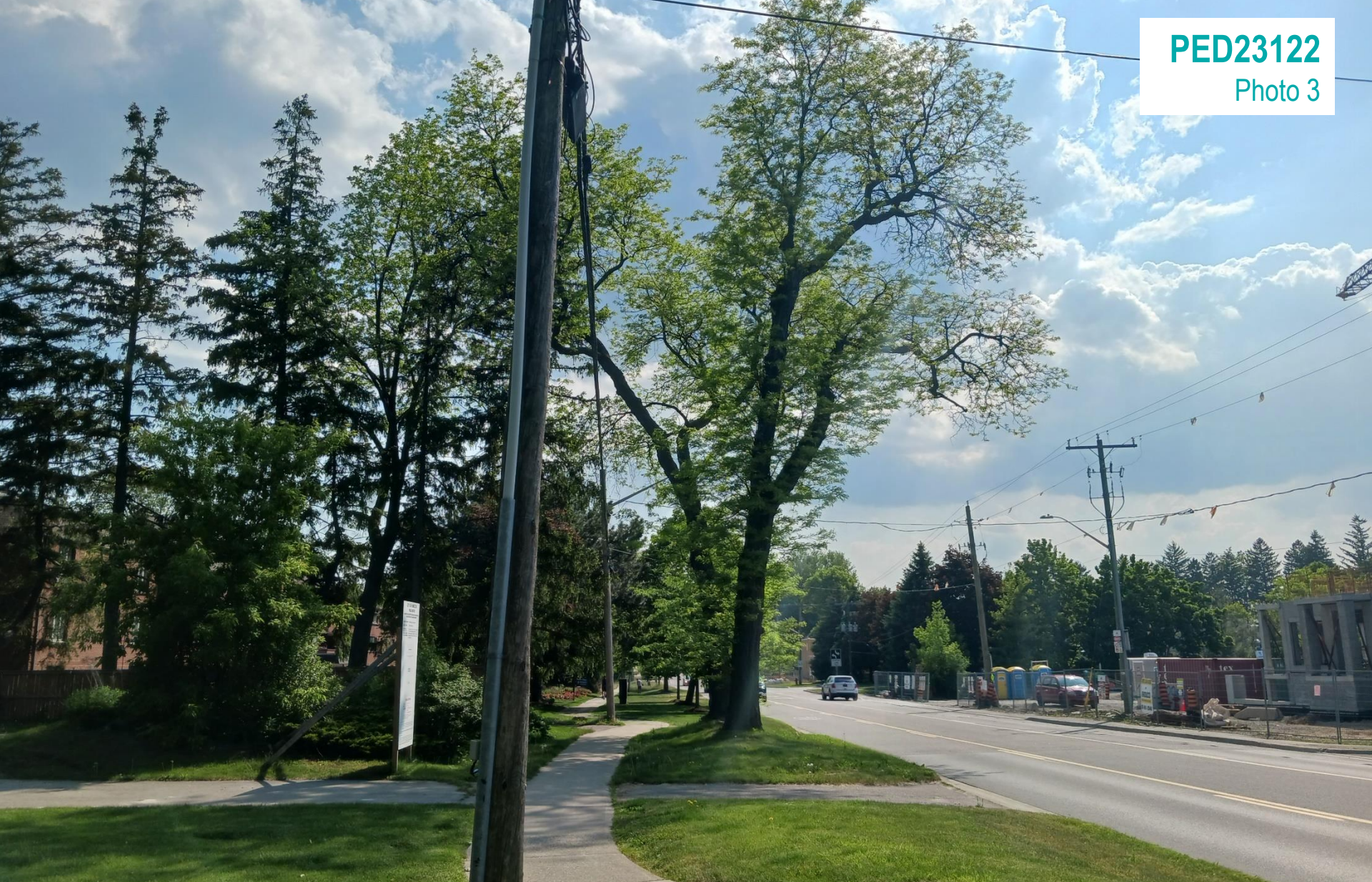
View to west along Wilson Street West