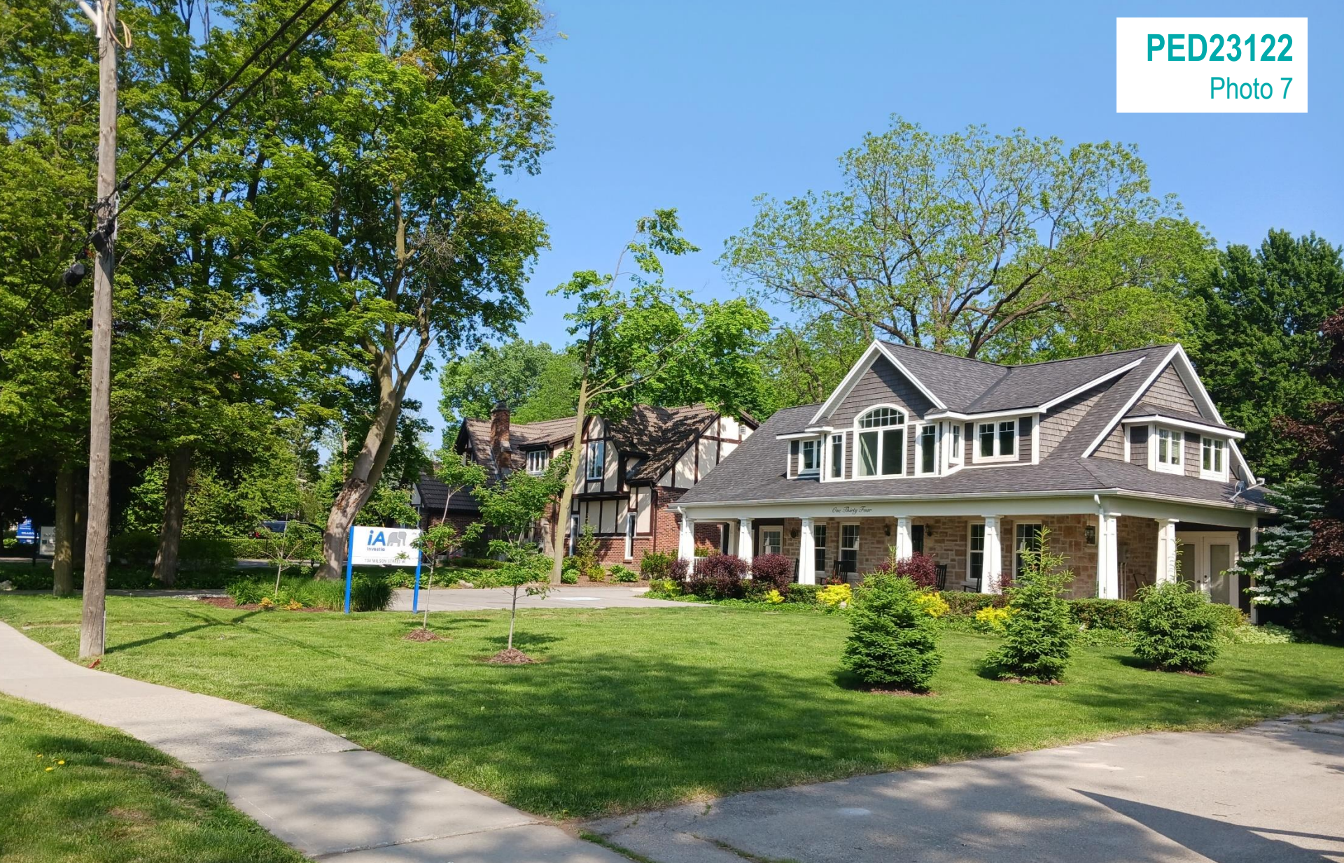
Adjacent single detached dwelling to east