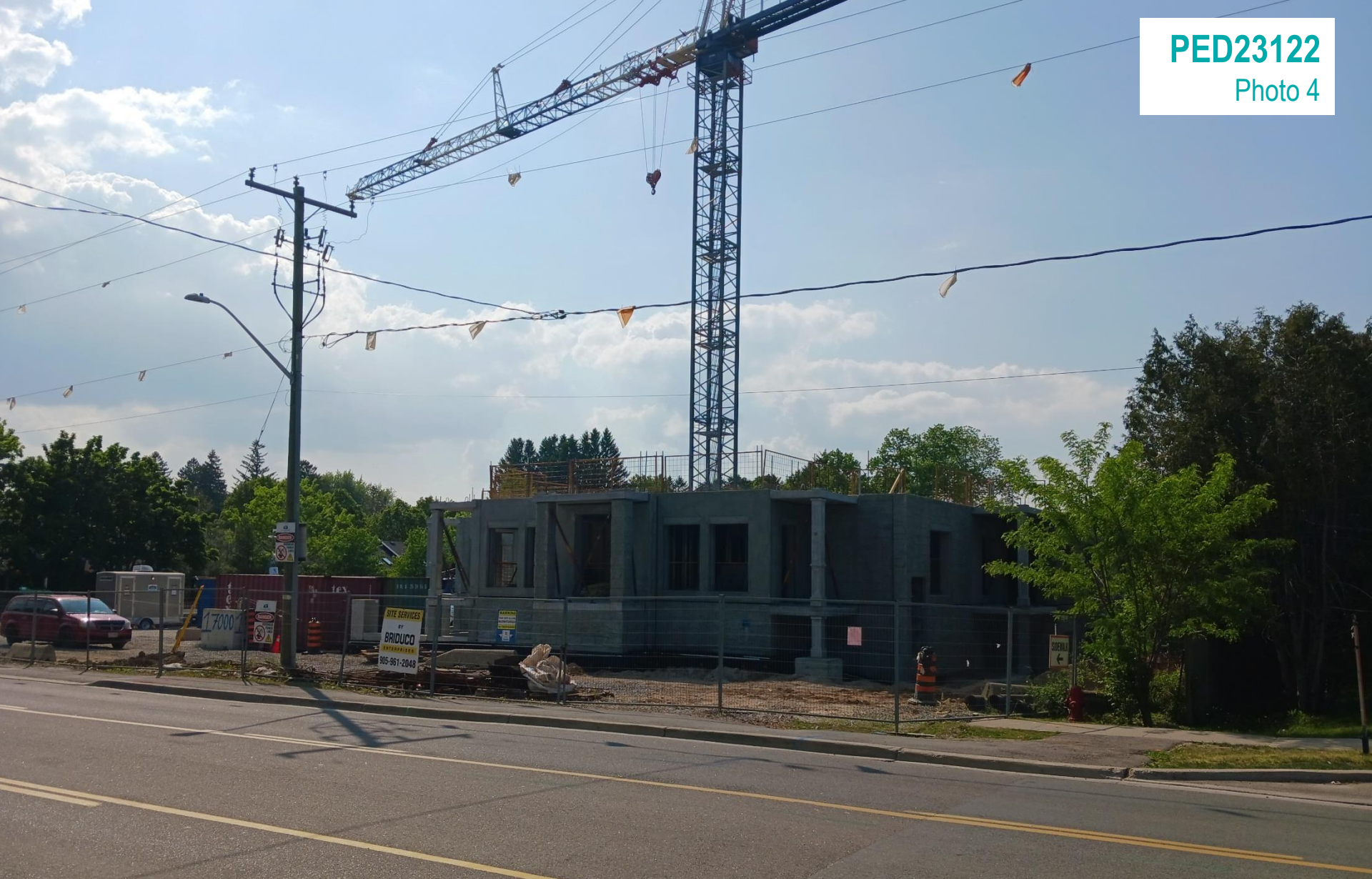
Multiple dwelling (under construction) across Wilson Street West