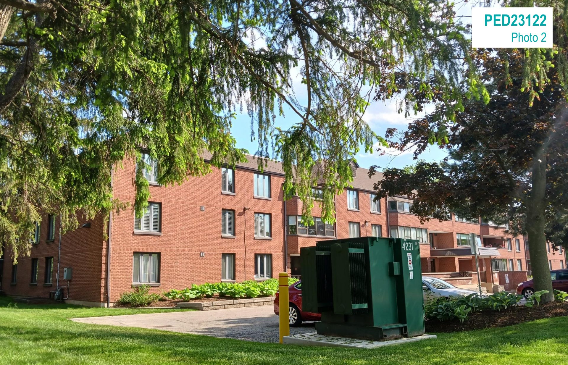
Adjacent multiple dwelling to west