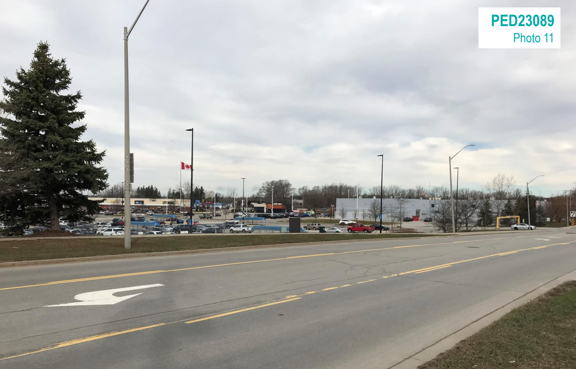
View of commercial uses on the opposite site of Shaver Road