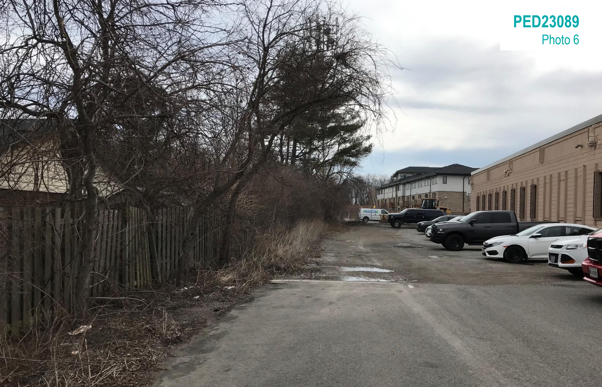
Public Works parking lot adjacent to the south property line