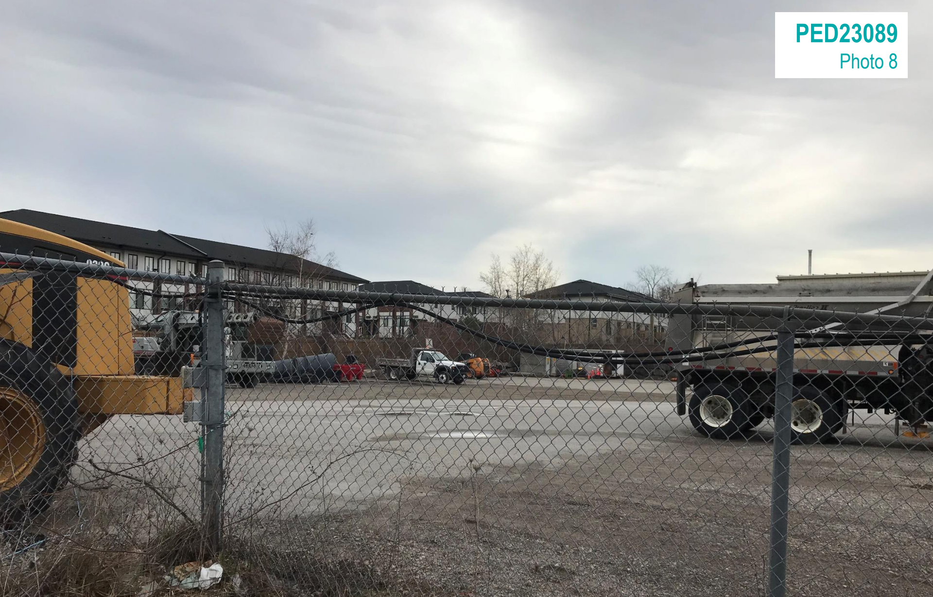
Public Works yard adjacent to the south property line