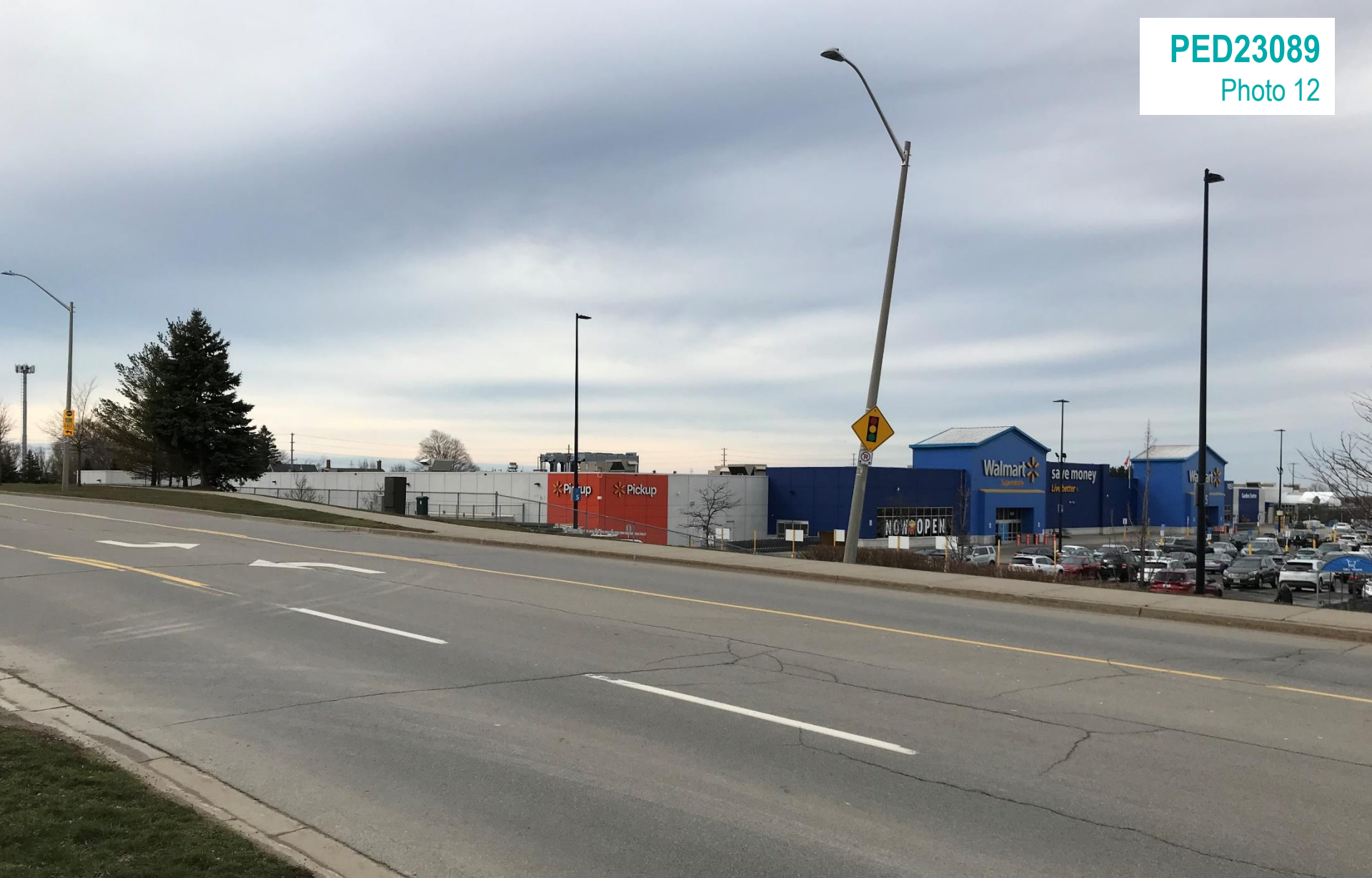
View of commercial uses on the opposite site of Shaver Road