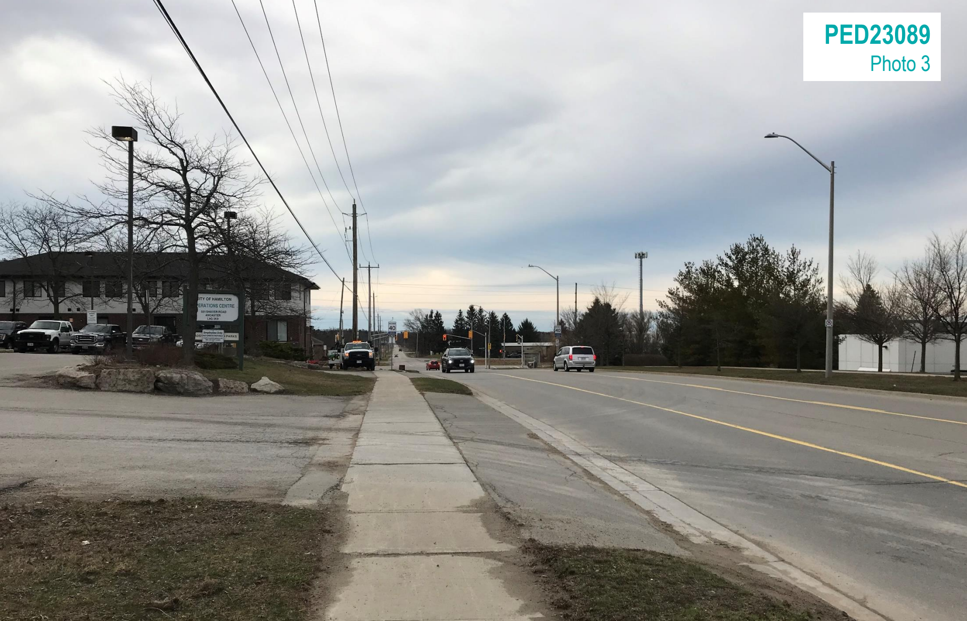
Shaver Road looking south