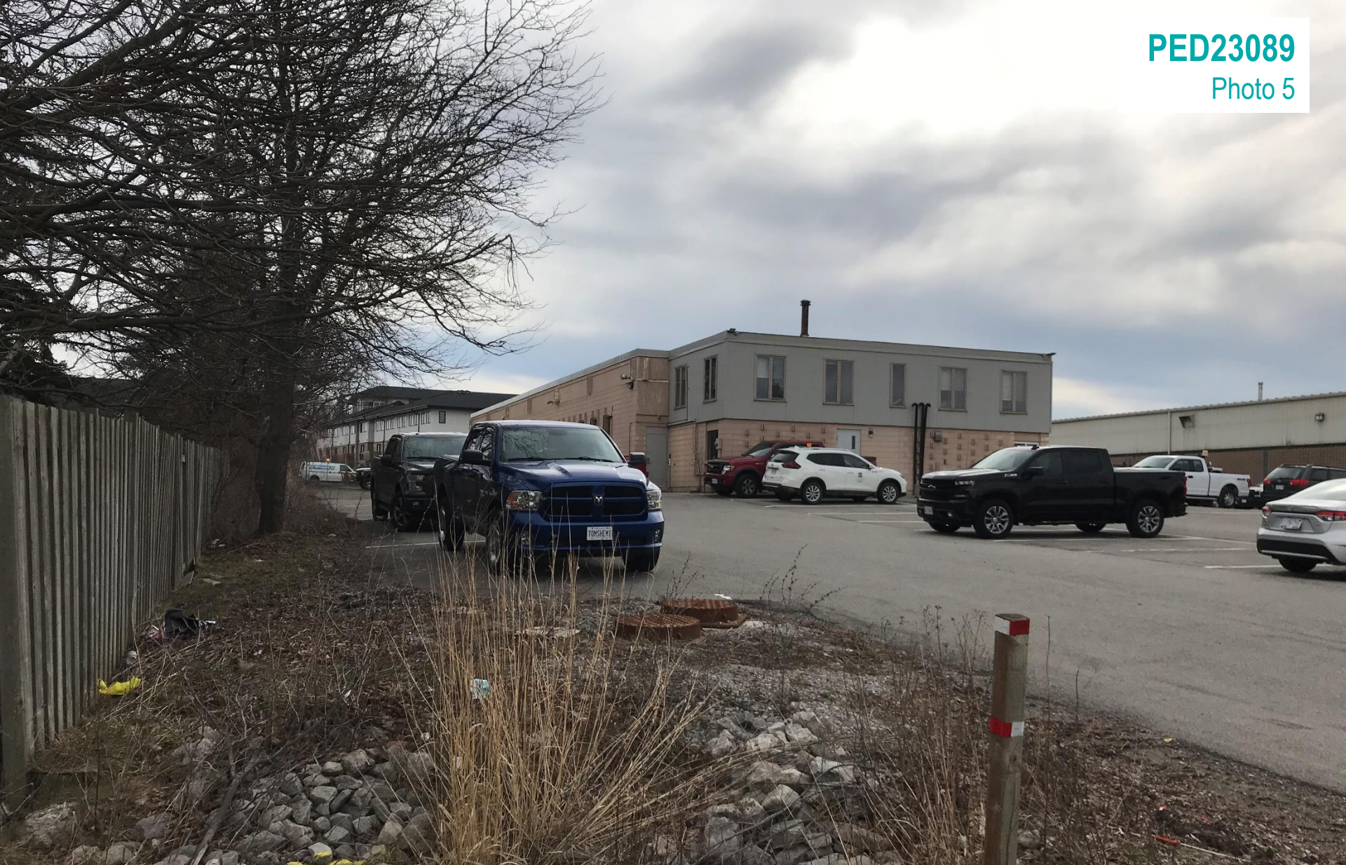
Public Works building located directly south of the Subject Property