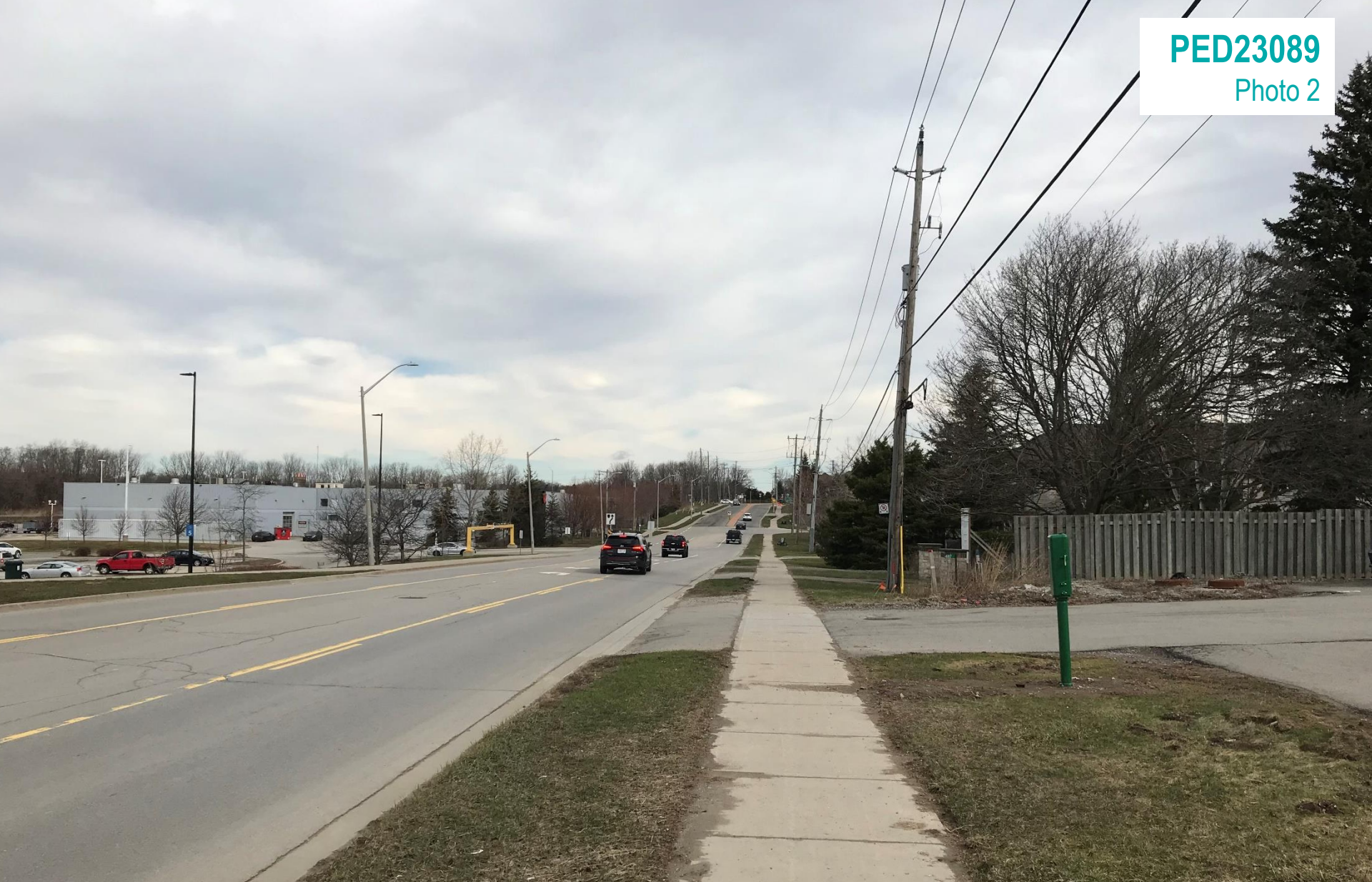
Shaver Road looking north