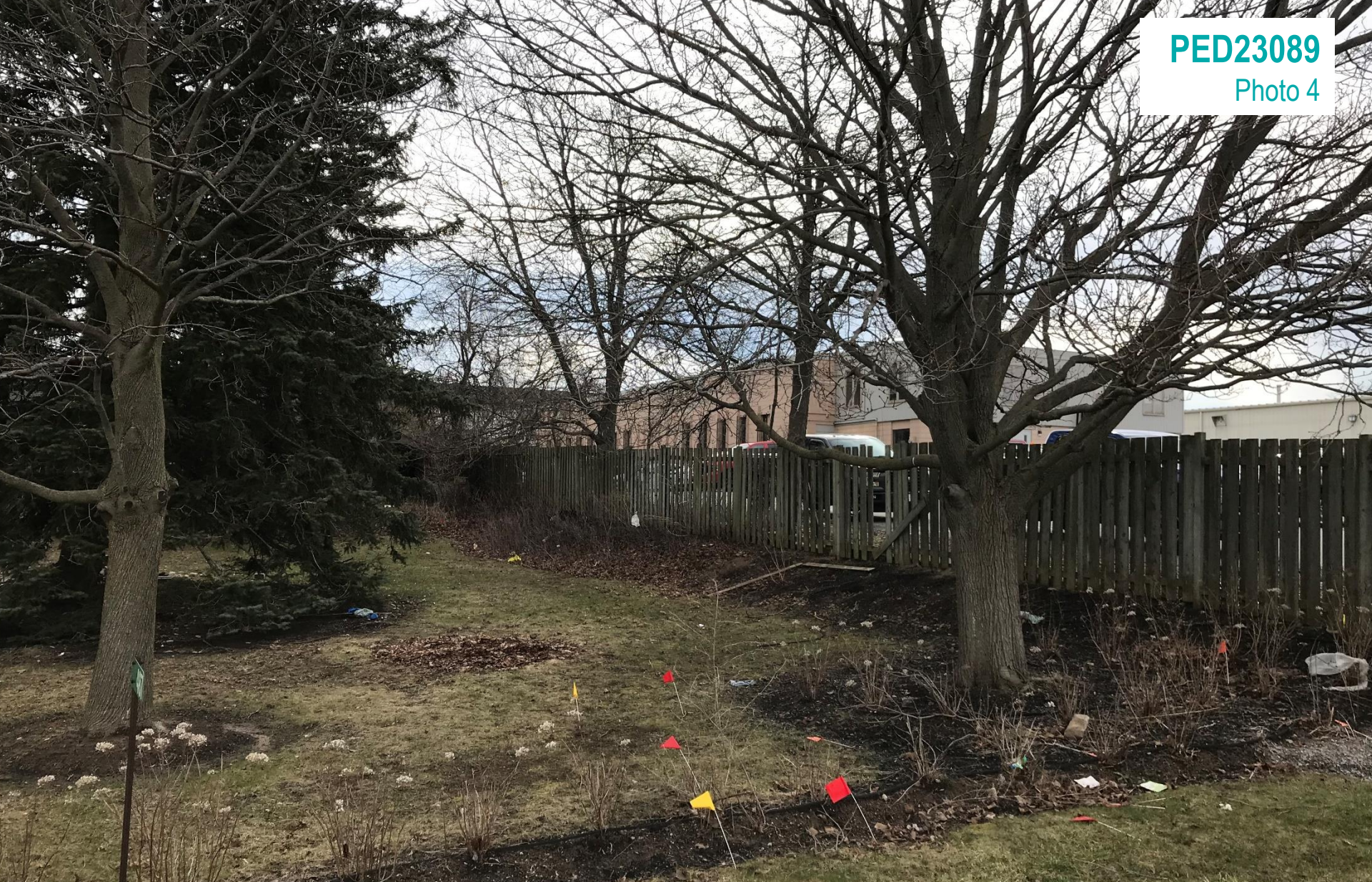
Subject Property looking south