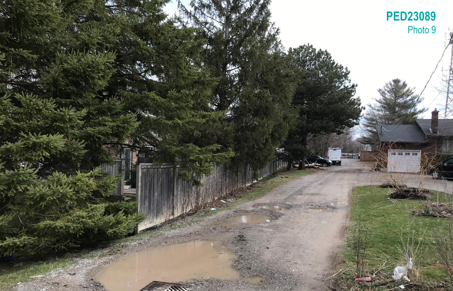
Subject Property looking north