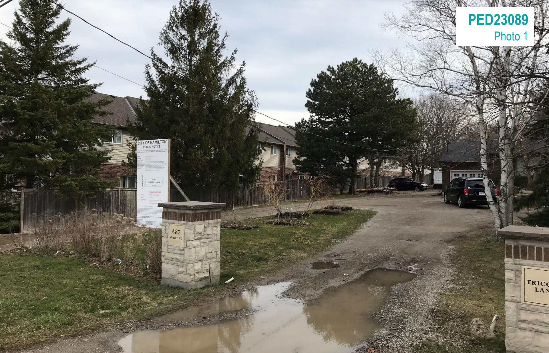
Subject Property – 487 Shaver Road