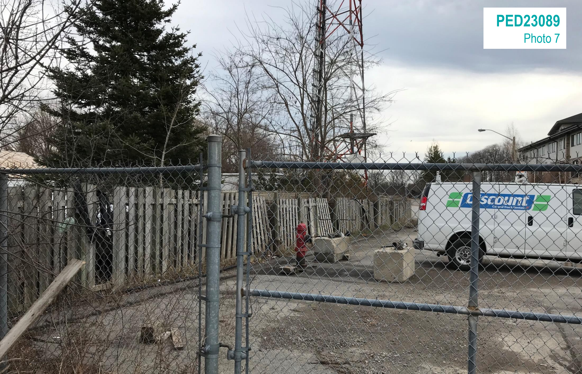
Public Works yard adjacent to the south property line