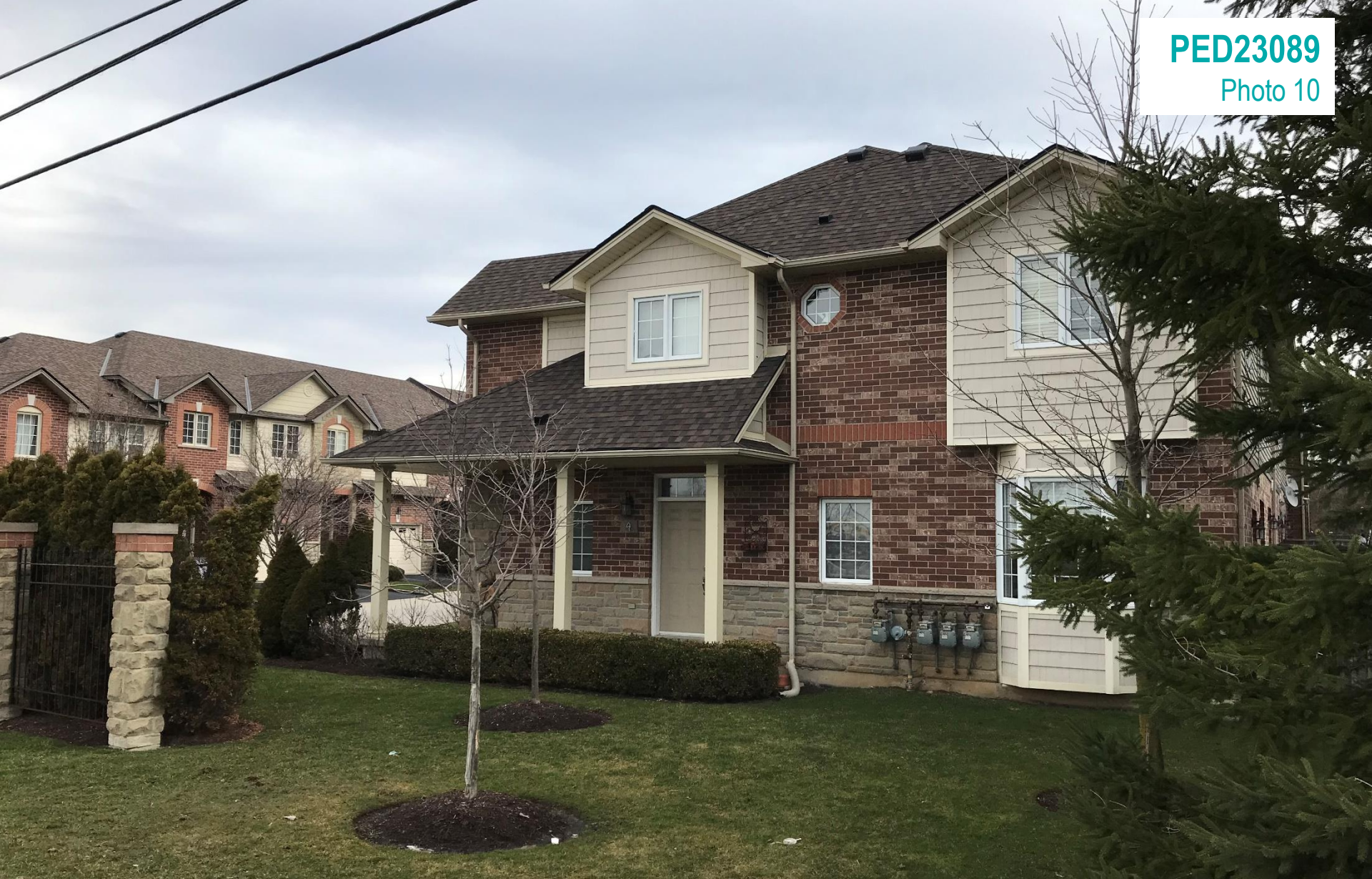
Residential property located directly north of the Subject Property