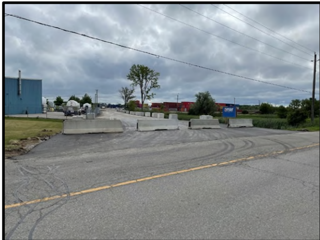
Figure 2: Example of physical enforcement action

Along with physical actions being taken such as the placement of barriers or removal of illegally placed fill, another action undertaken to help reduce the cost advantage of operating illegally has been to inform the Municipal Property Assessment Corporation (MPAC) through Finance staff of changes in use of the property and have the property reassessed. Often, illegal operators are surreptitiously converting farm properties to commercial properties and by informing MPAC of the actual use of the property appropriate taxes can be levied, ensuring equal treatment for legal and illegal operators. To date there have been 25 properties reassessed and this has resulted in more than a $384,000 increase in the tax levy for these properties; another 24 properties are still waiting to be reassessed. Staff also regularly inform our contacts at the Canadian Revenue Agency (CRA) of these operations as we have found that there is a significant amount of cash transactions between the vehicle operators storing their vehicles on the property and the operators of these yards. Staff also regularly communicate with other enforcement agencies such as the Toronto and Region and Conservation Authority (TRCA), Ontario Ministry of Transportation (MTO), Ministry of Environment, Conservation and Parks (MECP), and the Electrical Safety Authority (ESA) on these illegal operations and coordinate our enforcement efforts with them as much as possible.