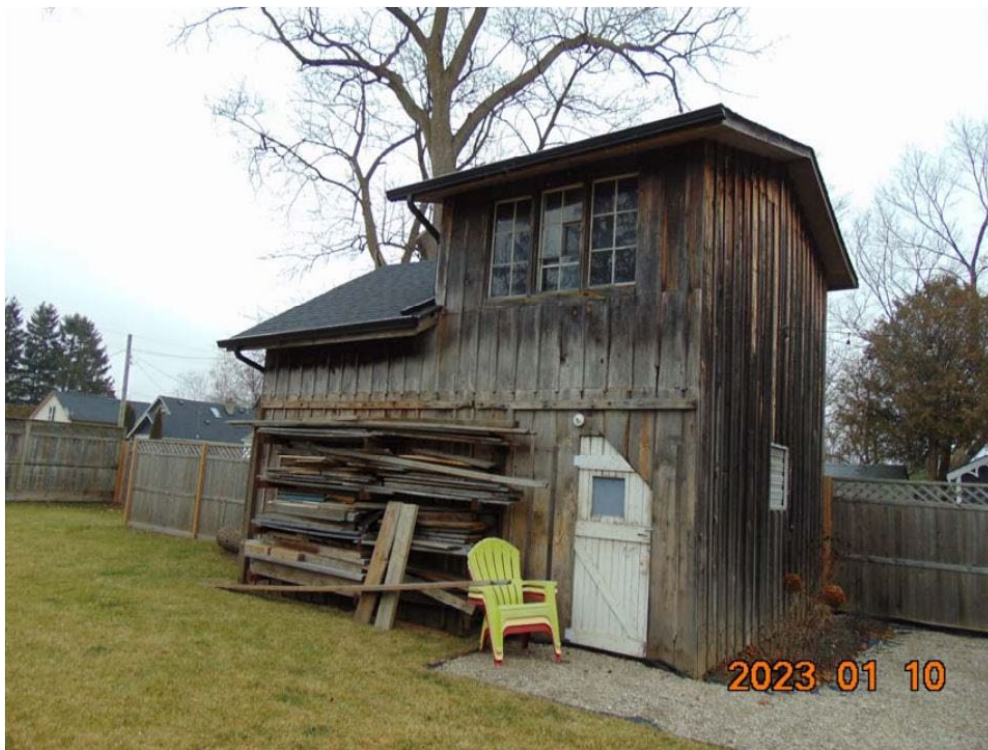
Figure 4. Rear and side elevation of exterior structure