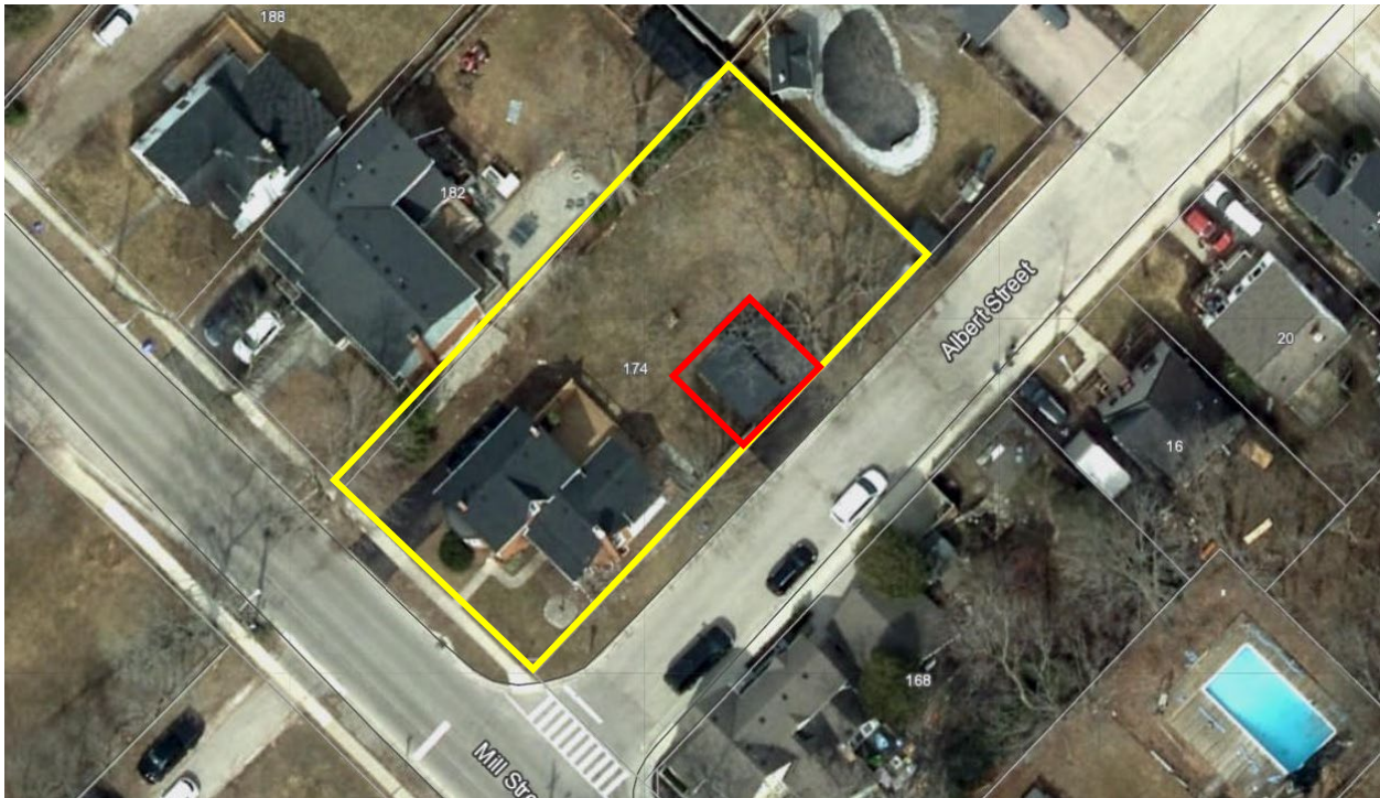
Figure 1. Subject lands depicted in yellow, structure to be removed in red.

Application Submission Materials (Personal Information Redacted)