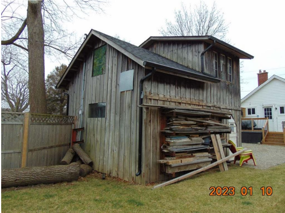
Figure 3. Rear and side elevation of exterior structure