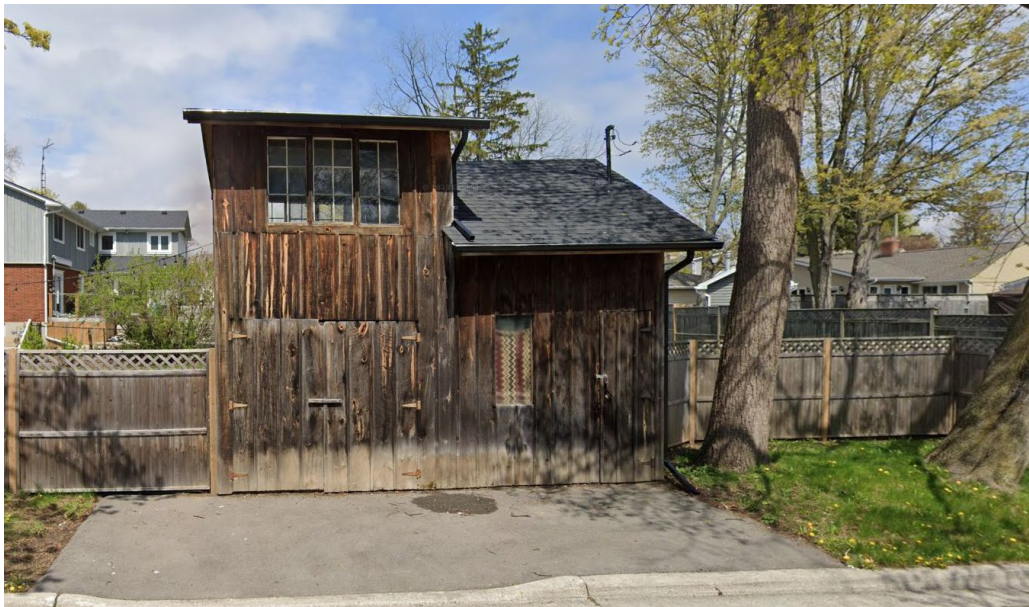
Figure 2. Front elevation of exterior structure