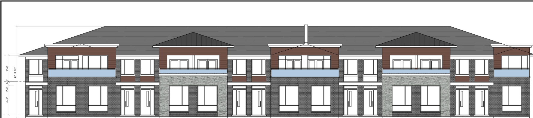
1 BUILDING C.D - FRONT ELEVATION 3/16" = 1'-0"