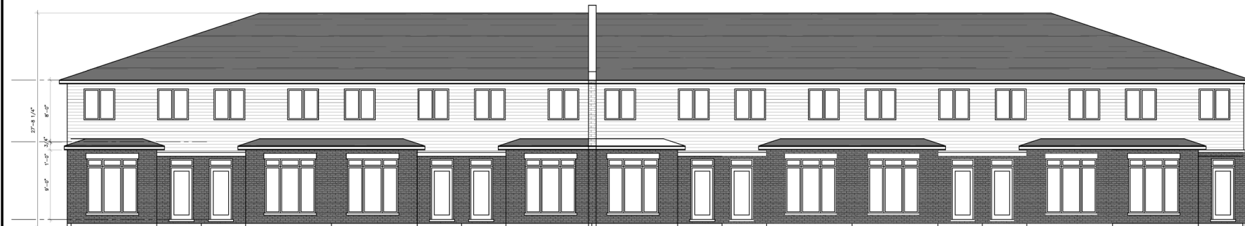
2 BUILDING C.D - REAR ELEVATION 3/16" = 1'-0"