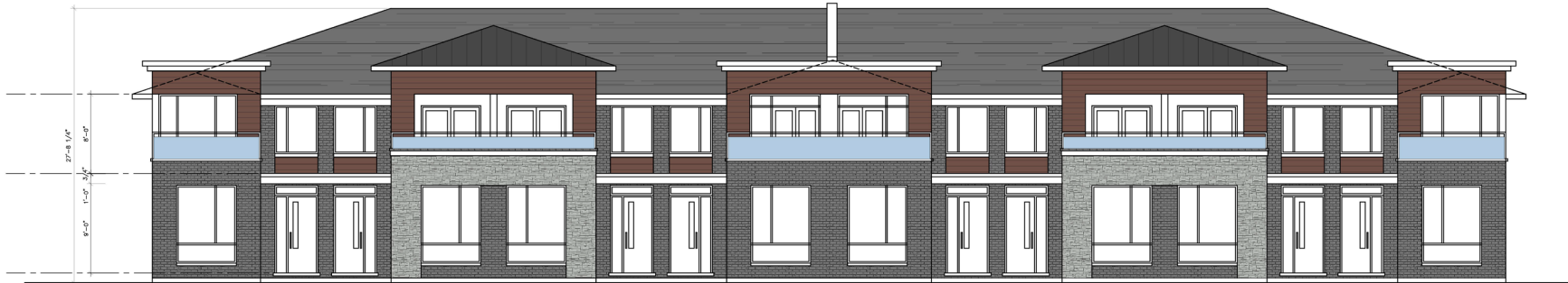
1 BUILDING B.E - FRONT ELEVATION A5 3/16"=1'-0"