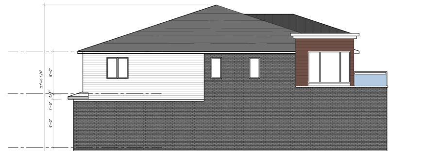
4 BUILDING C.D - EXTERIOR SIDE ELEVATION 3/16" = 1'-0"

CONTRACTOR MUST CHECK AND VERIFY ALL DIMENSIONS AND JOB CONDITIONS BEFORE PROCEEDING WITH WORK ALL DRAWINGS MAY BE SUBJECT TO CHANGE DUE TO DOCUMENTS FROM MUNICIPAL GOVERNMENTS ATTACHED HERETO WITH AUTHORITY