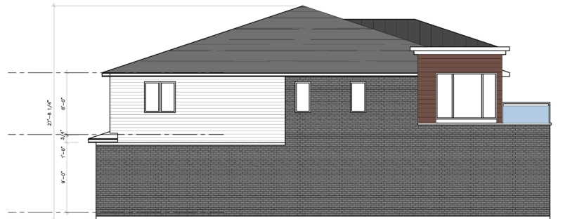
4 BUILDING B.E - EXTERIOR SIDE ELEVATION A5 3/16"=1'-0"

CONTRACTOR MUST CHECK ALL SUPPLY ALL DIMENSIONS AND JOB CONDITIONS BEFORE PROCEEDING WITH WORK