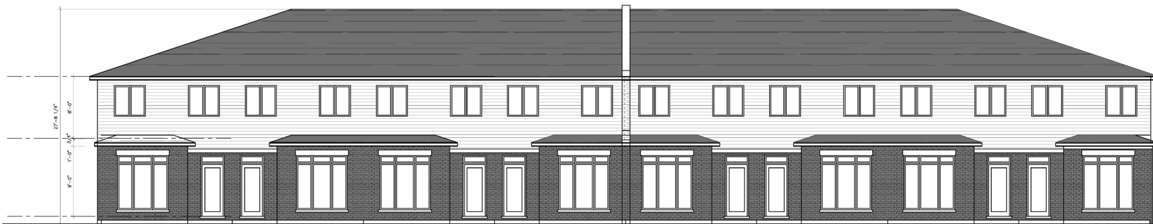
2 BUILDING B.E - REAR ELEVATION A5 3/16"=1'-0"