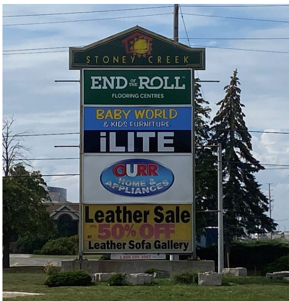
Existing sign at South Service Road

Replacing these signs with the proposed does not make any changes to the area and would be similar to the above-mentioned ground signs nearby with larger digital screens. It would be in the best interest to update the current signs to add a refreshed look to the current updates that our client is looking to achieve at the property and building. Investing in Hamilton is something our client has been involved with many other properties in Hamilton and requesting a more modern ground to replace the existing signs with modern technology for their tenants is not a large request being that the current signs have similar dimension.