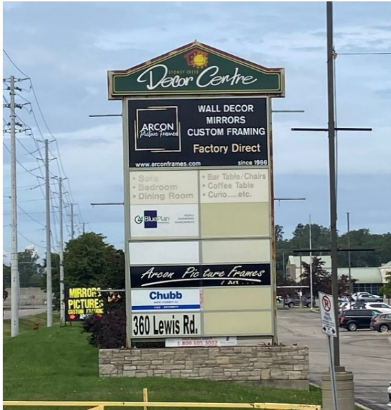
Existing ground signs sign at Lewis Road signs.