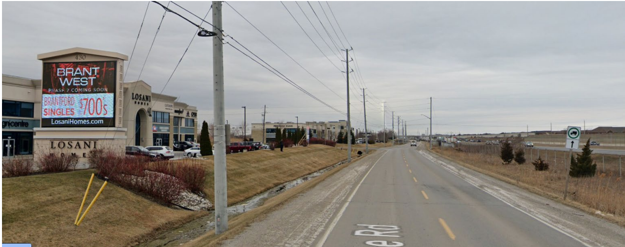
Google Street View image of similar signs on QEW frontage in the surrounding area exceeding the allowable Digital Sign ratio of 50%