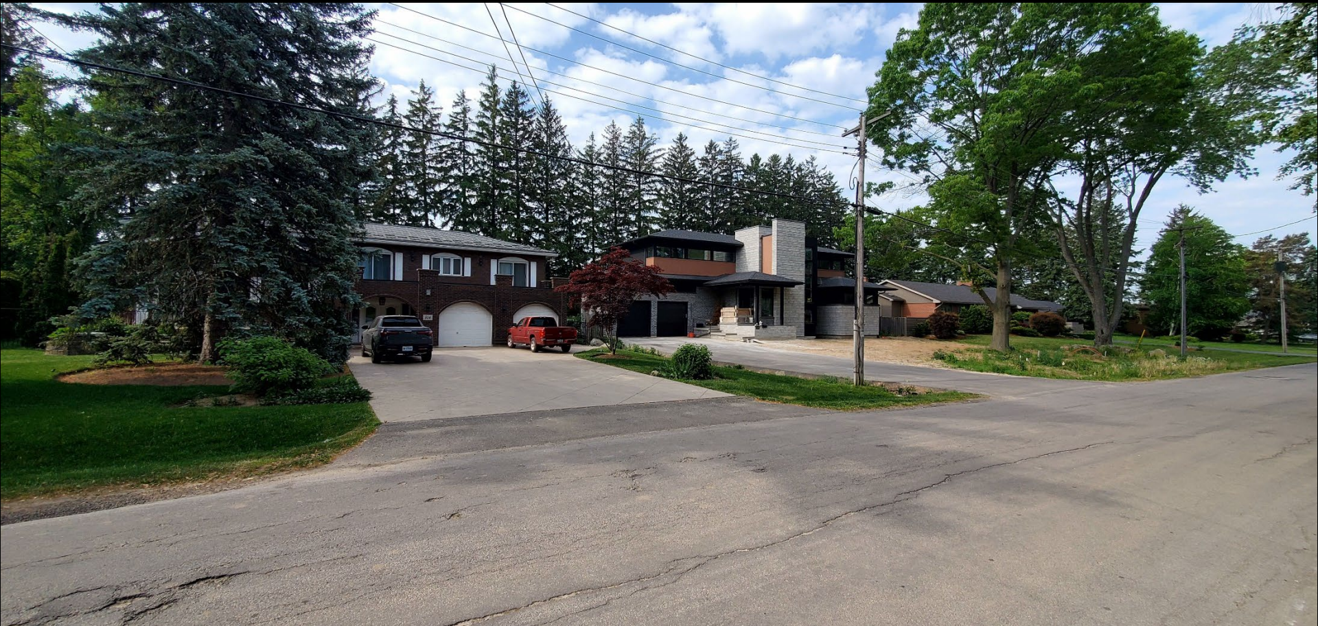
View looking southeast from Southcote Road