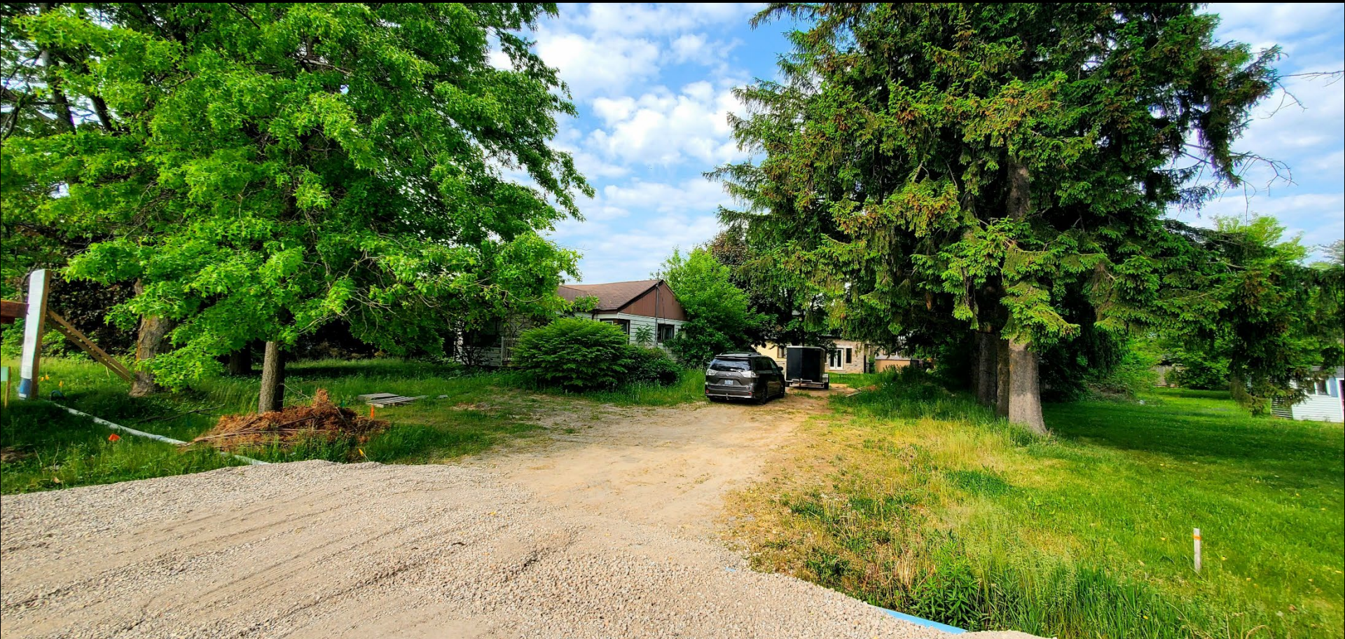
Subject Lands – 382 Southcote Road