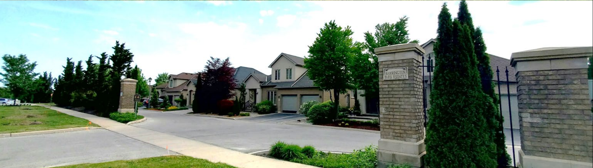
View looking north from Southcote Road