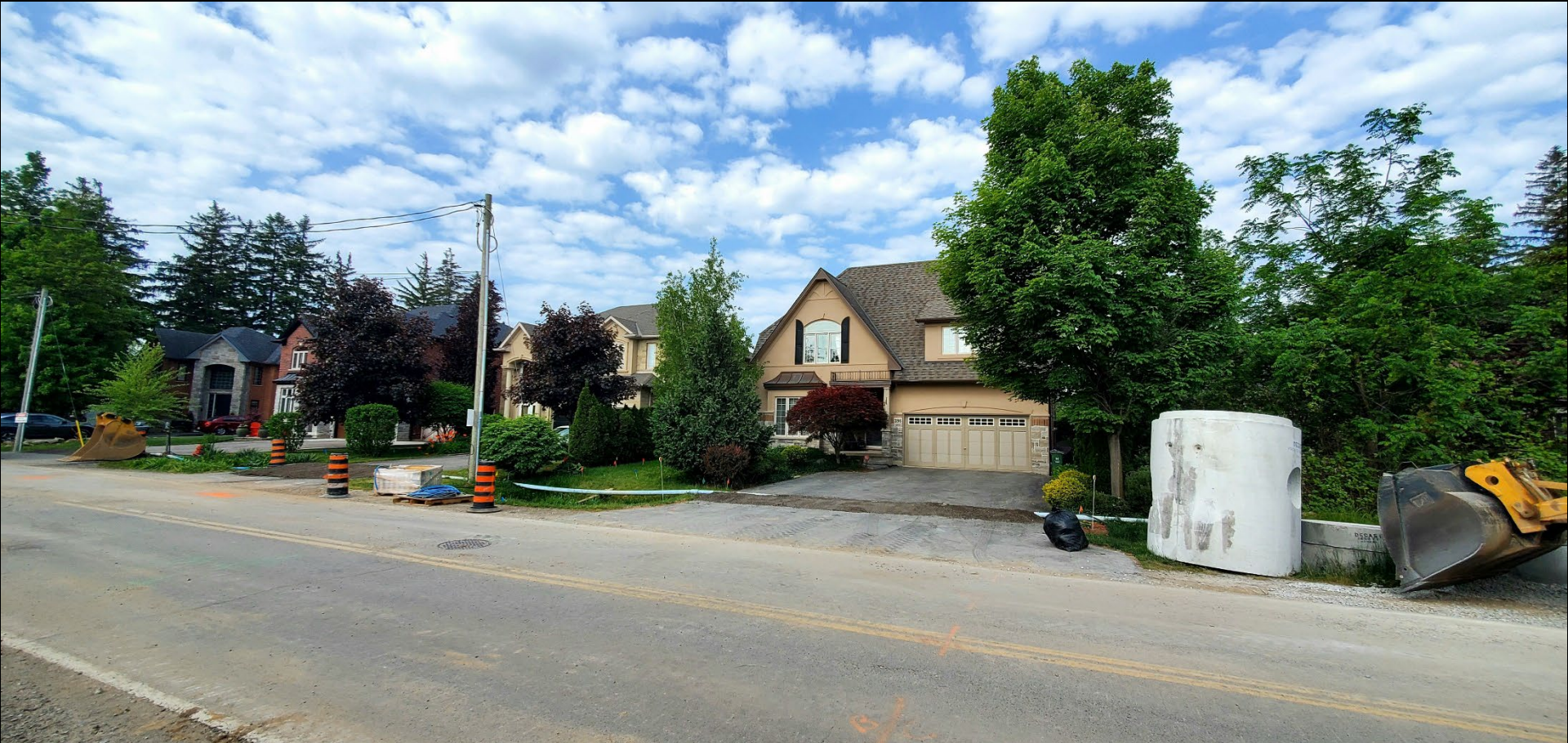
View looking southwest from Southcote Road