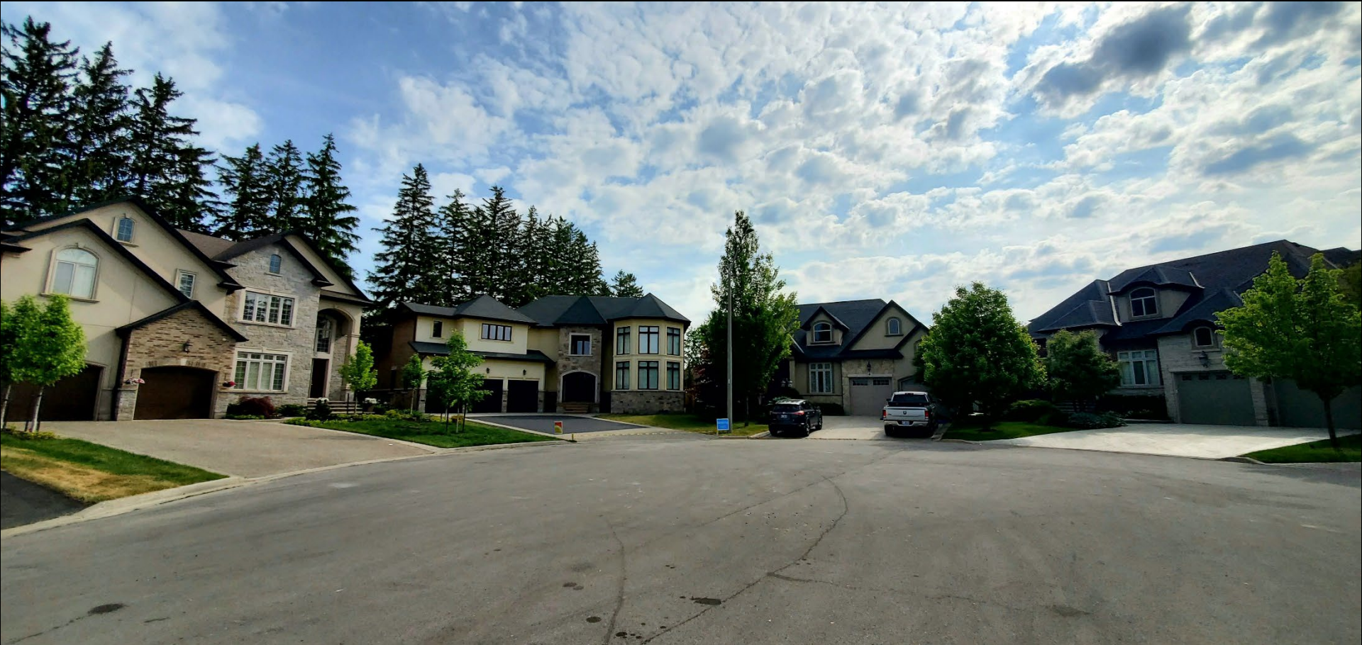
Adjacent properties west of the Subject Property viewed from Gregorio Court