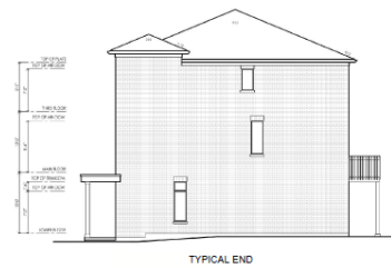
STANDARD TOWNHOUSE BLOCK SIDE ELEVATION