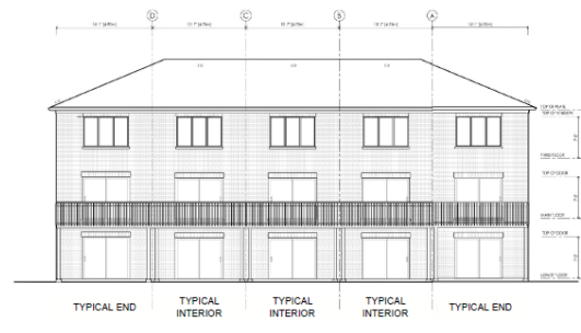
STANDARD TOWNHOUSE BLOCK REAR ELEVATION