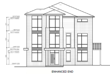
CORNER TOWNHOUSE BLOCK SIDE ELEVATION