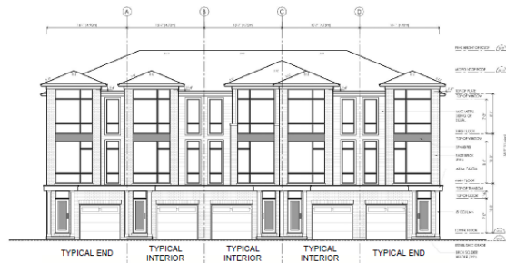
STANDARD TOWNHOUSE BLOCK FRONT ELEVATION