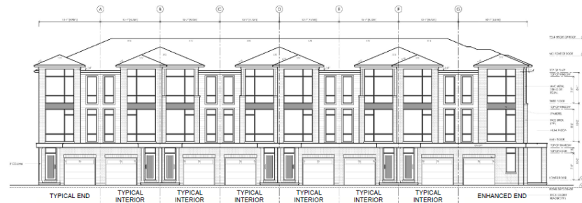
CORNER TOWNHOUSE BLOCK FRONT ELEVATION