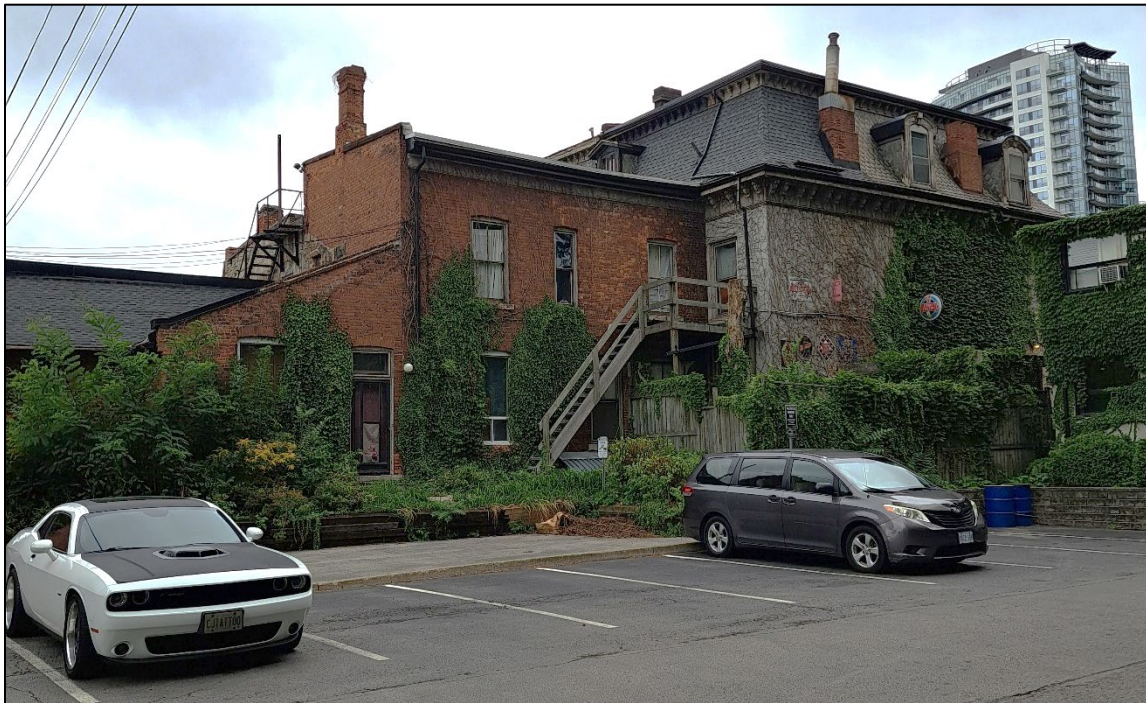
Side (south) elevation of 56 Hess Street South