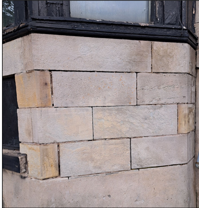
Closeup of cut-stone even course façade