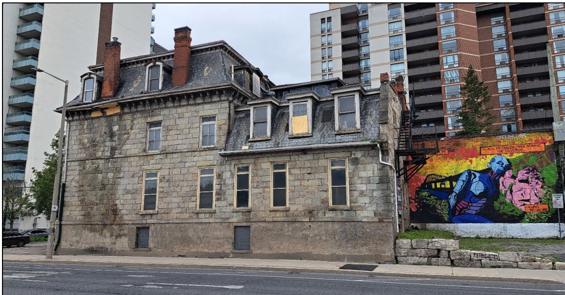
Side (north) elevation