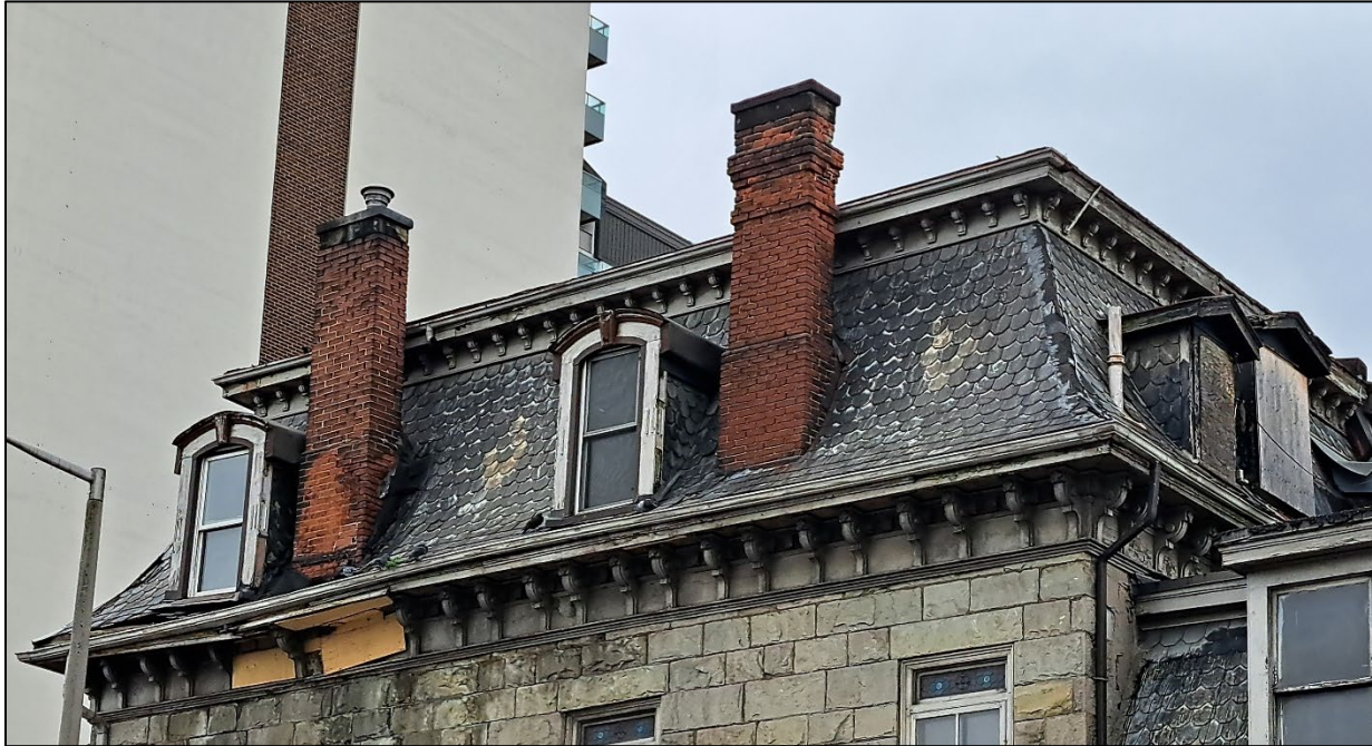
Closeup of Mansard roof with slate shingles, brick chimneys and dormers