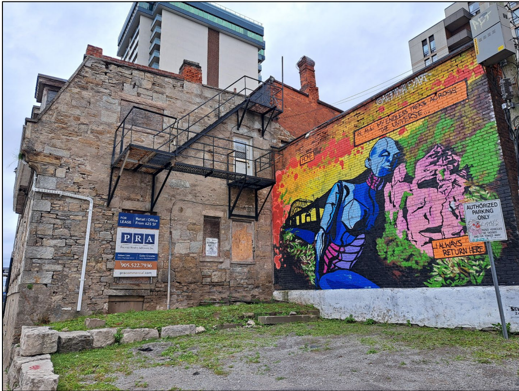
Rear (west) elevation of 54 Hess Street South (left) and north elevation of the painted rear brick wing of 56 Hess Street South (right)