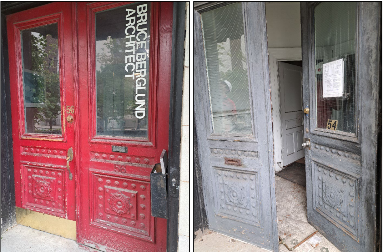
Closeups of decorative paired wooded doors, no. 54 (right) and no. 56 (left)