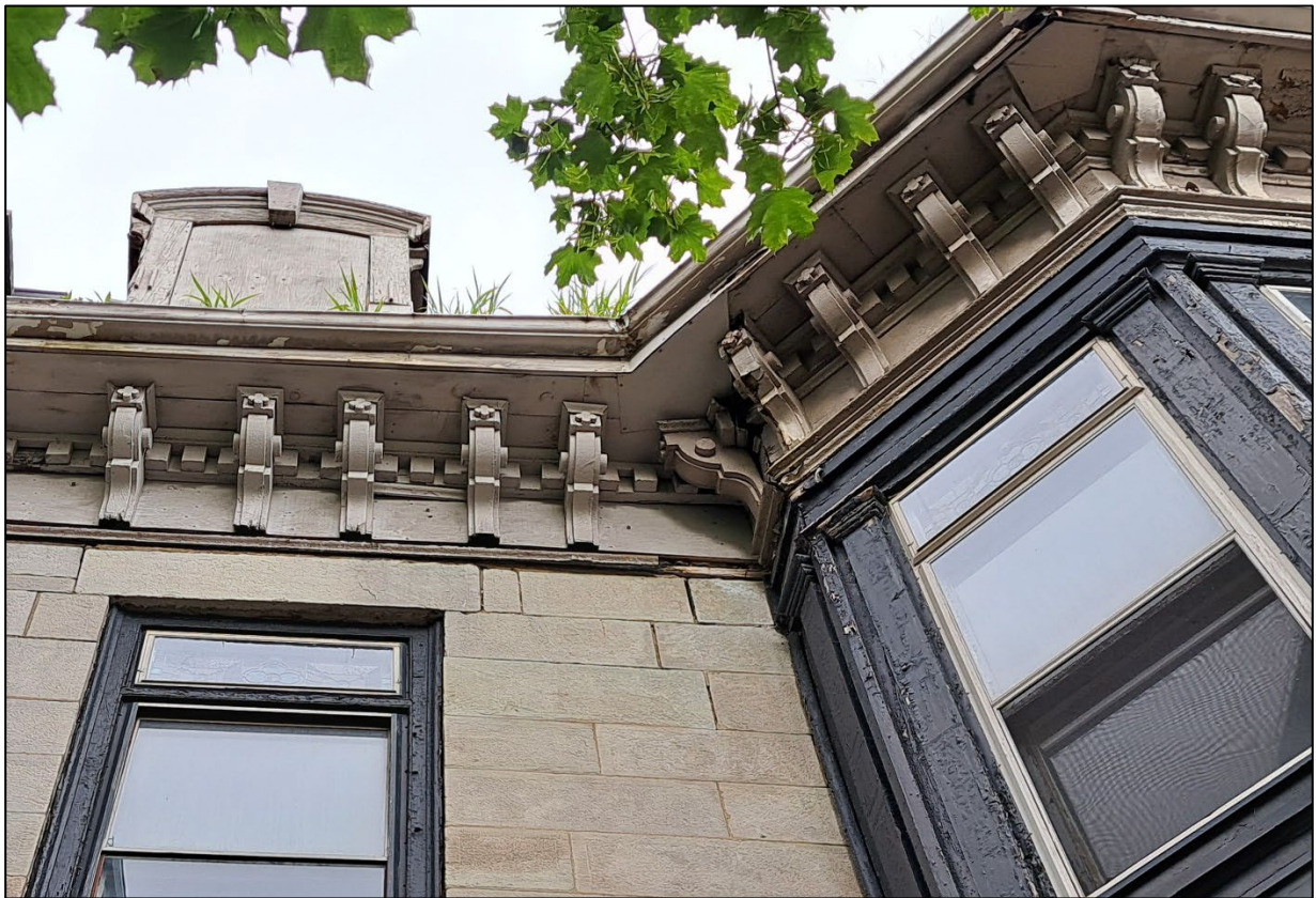
Closeup of wood cornices with dentils, decorative brackets and moulded frieze