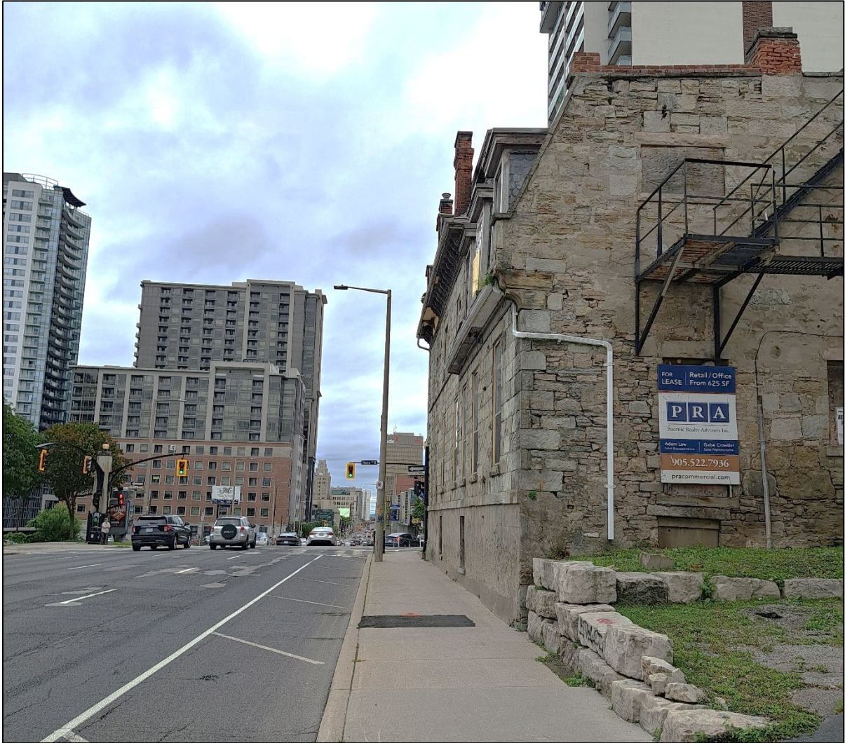
View looking east on Main Street West past Hess Street, showing raised topography