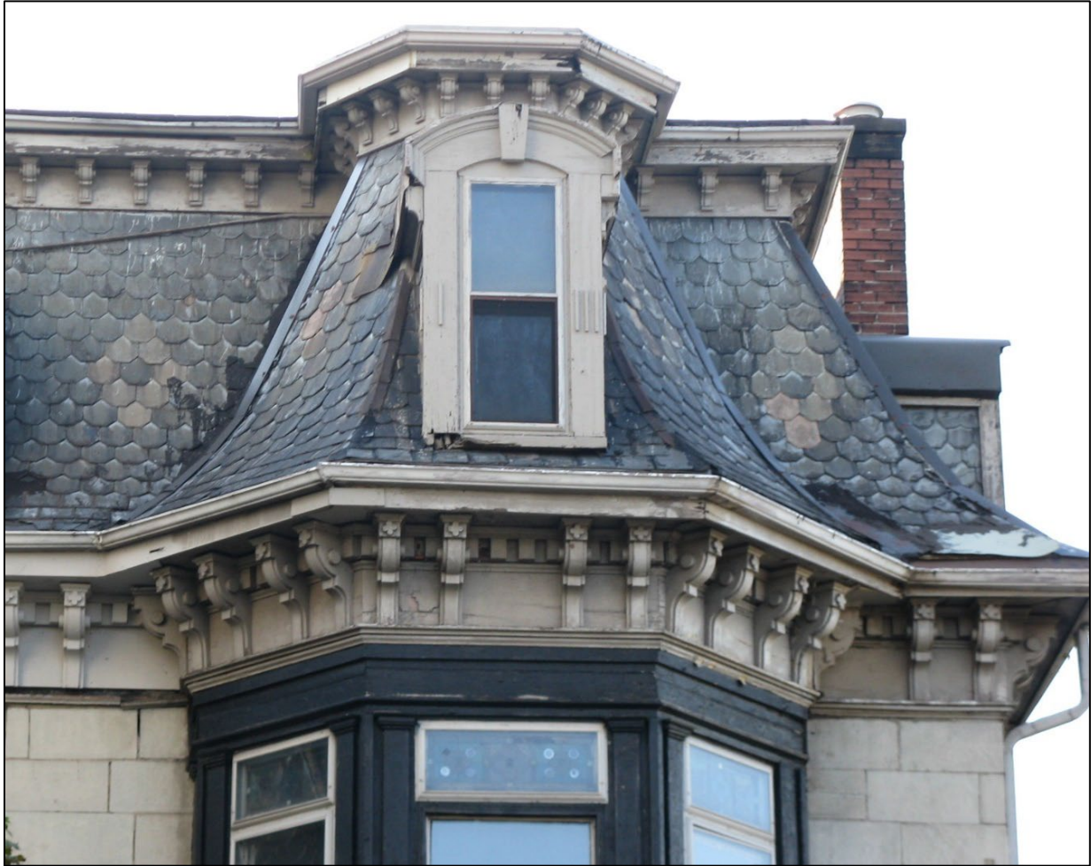
Closeup of second-storey front bay (2011)