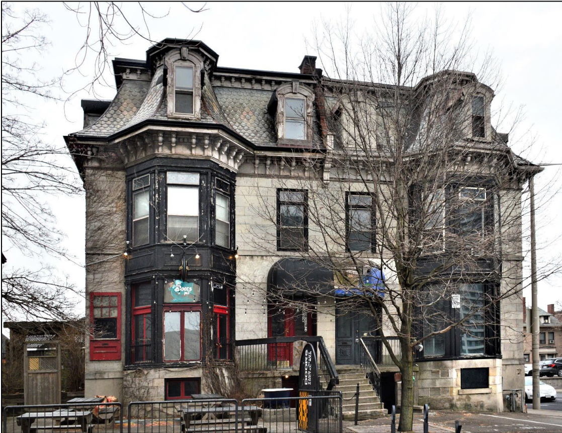
54 and 56 Hess Street South, front (east) elevation (2021)