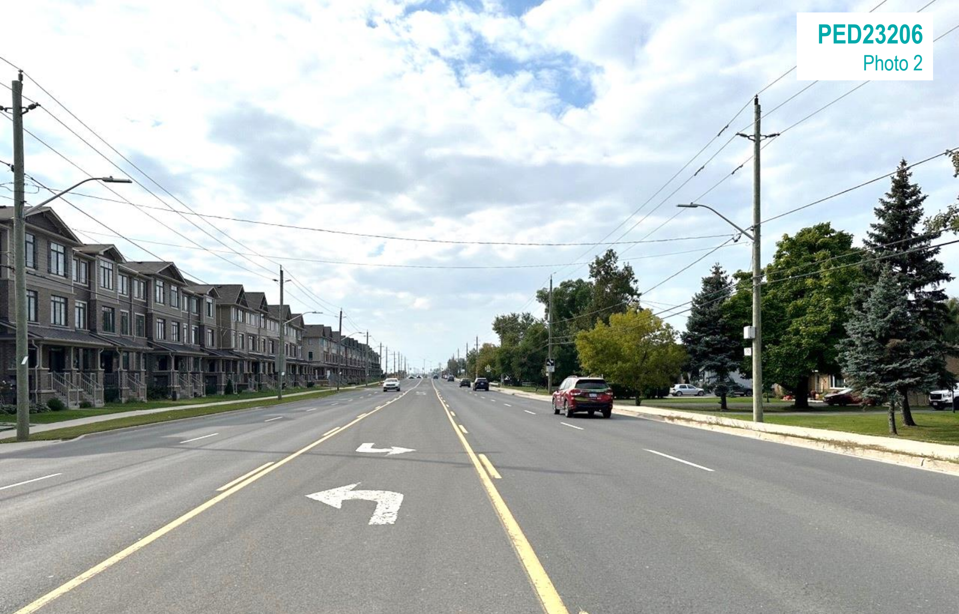
1898 and 1900 Rymal Road East - Facing West