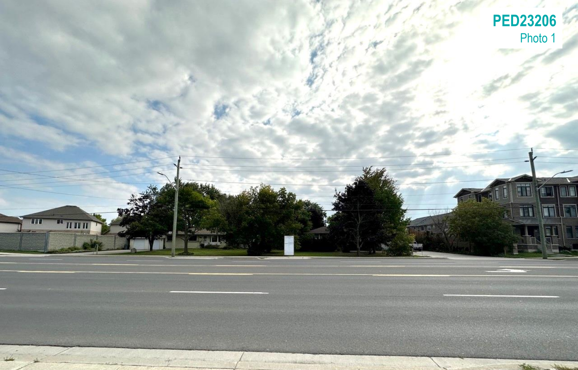
1898 and 1900 Rymal Road East