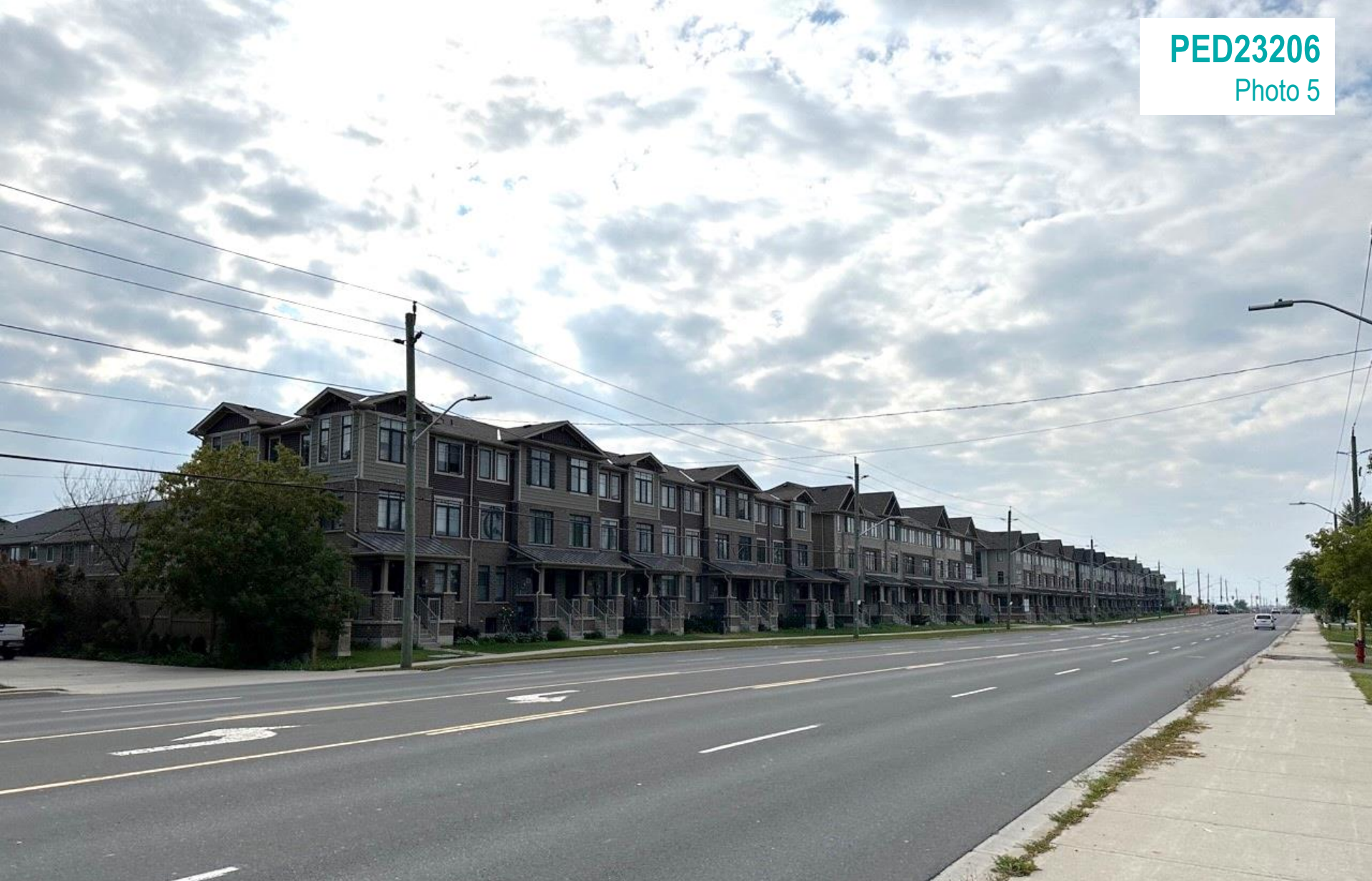
1898 and 1900 Rymal Road East - for context