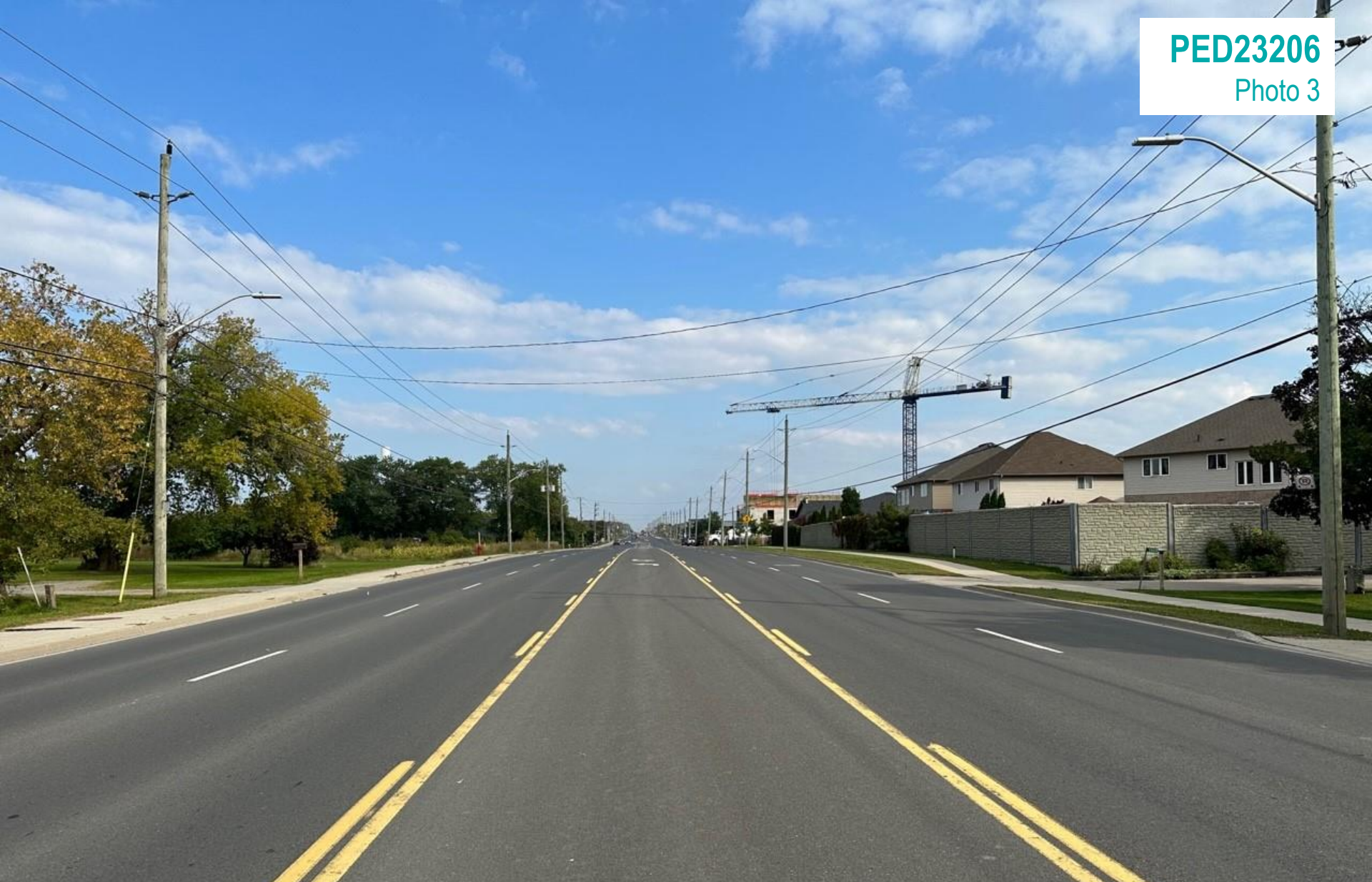
1898 and 1900 Rymal Road East - Facing East