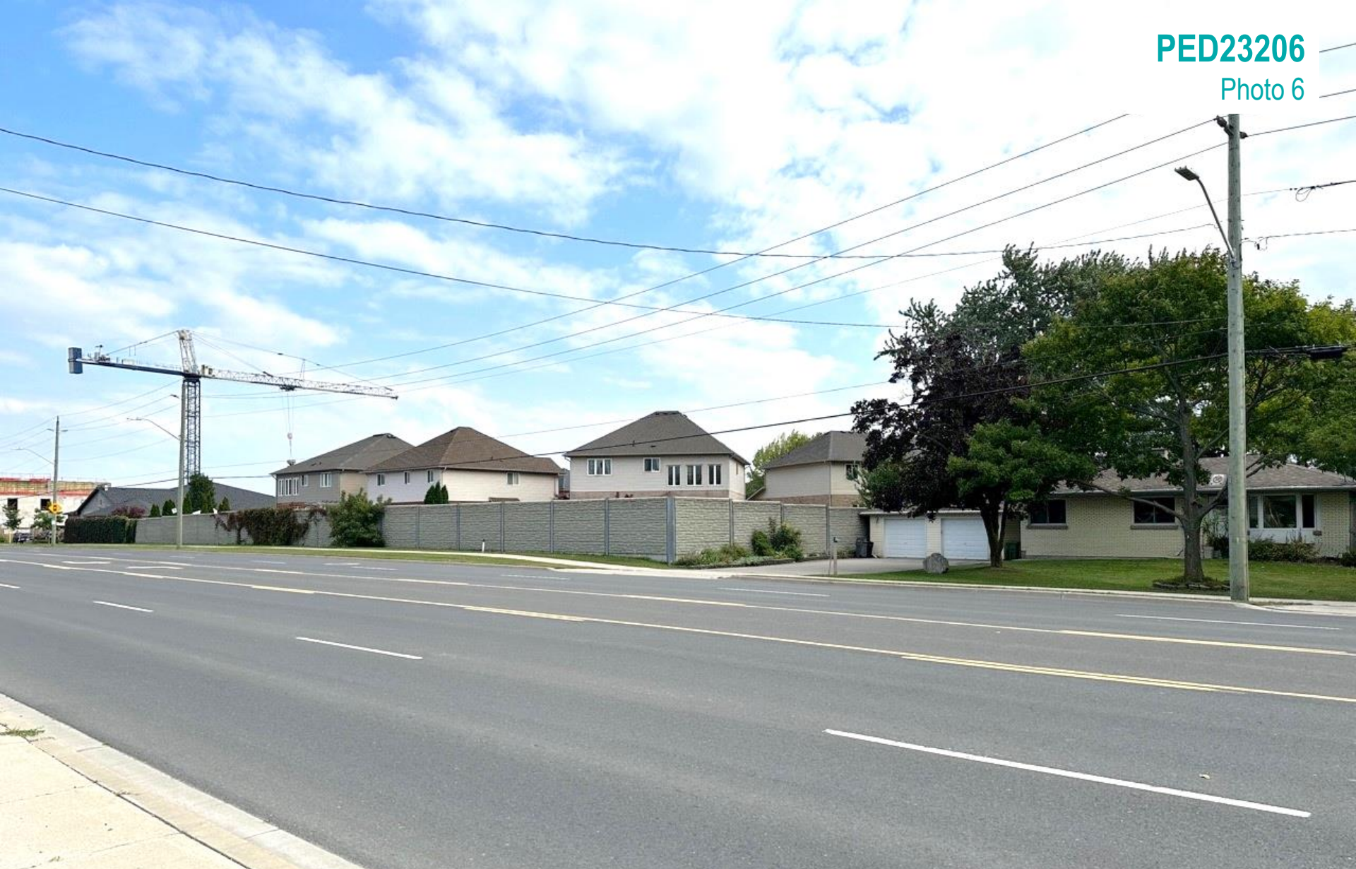
1898 and 1900 Rymal Road East - For context