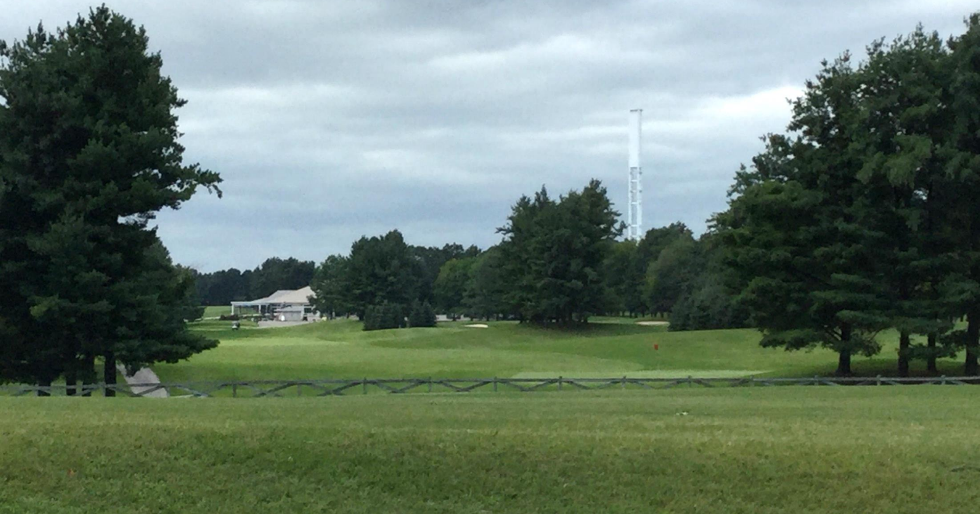
Subject Lands and existing telecommunications tower, as seen from Carlisle Road looking north