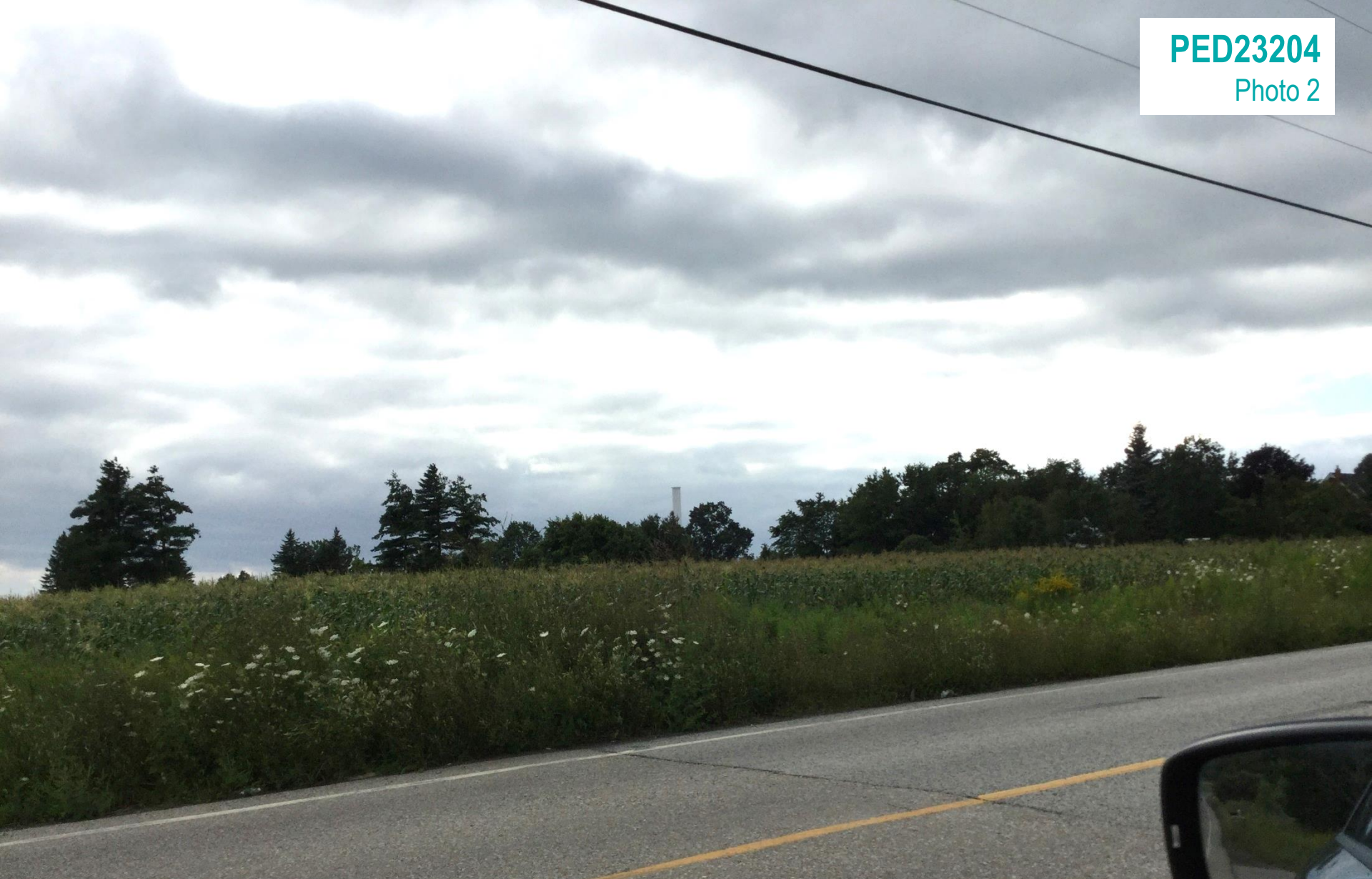
Existing telecommunications tower, as seen from Milborough Line looking north west