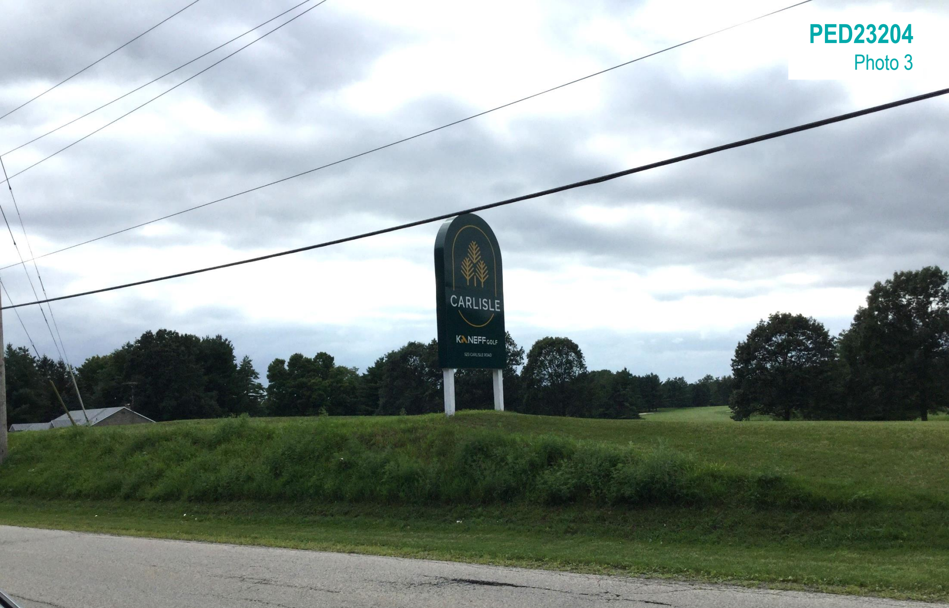
Existing ground sign for the Subject Lands, as seen from Carlisle Road looking north west