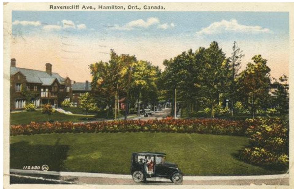
Hamilton Postcards, 1924