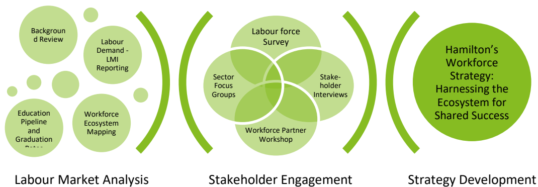
Figure 2: Hamilton’s Workforce Strategy Development Process – Phases of Work

The Workforce Strategy will elevate Hamilton's profile as a workforce hub that supports increased investment and future growth in the city. This living document sets direction and establishes workforce priorities that will support the labour market today and into the future.