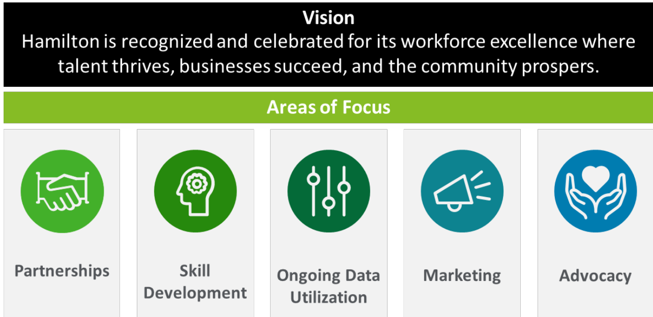
Figure 1: Strategy at a Glance

Hamilton's Workforce Strategy Areas of Focus are detailed below: