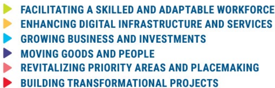
Figure 2:2021-2025 Economic Development Action Plan Priorities

This Workforce Strategy is a direct outcome of the 2021-2025 Economic Development Action Plan, namely action #5, which states: In collaboration with the workforce development community, create and implement a Workforce Attraction, Retention & Development (Talent) Strategy. The strategy is driven by Action #3 ( Design and deliver an annual Local Economy and Workforce Needs business survey ) and recognizes Action #1 ( Approve and implement the Hamilton Immigration Partnership Strategy ) as essential to workforce growth. The role of the Hamilton Economic Development Office as the coordinator and convener for workforce development, builds on Action #11 ( Partner with the workforce and business community to identify employment programs, work development opportunities and initiatives in Hamilton focused on equity-seeking groups, groups disadvantaged by discrimination and marginalized communities to recommend future strategies to address existing needs and gaps ).