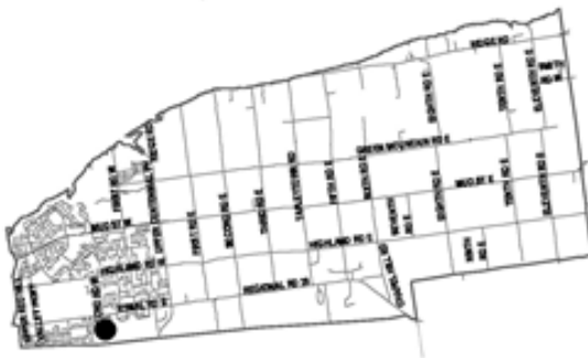
Key Map - Ward 9