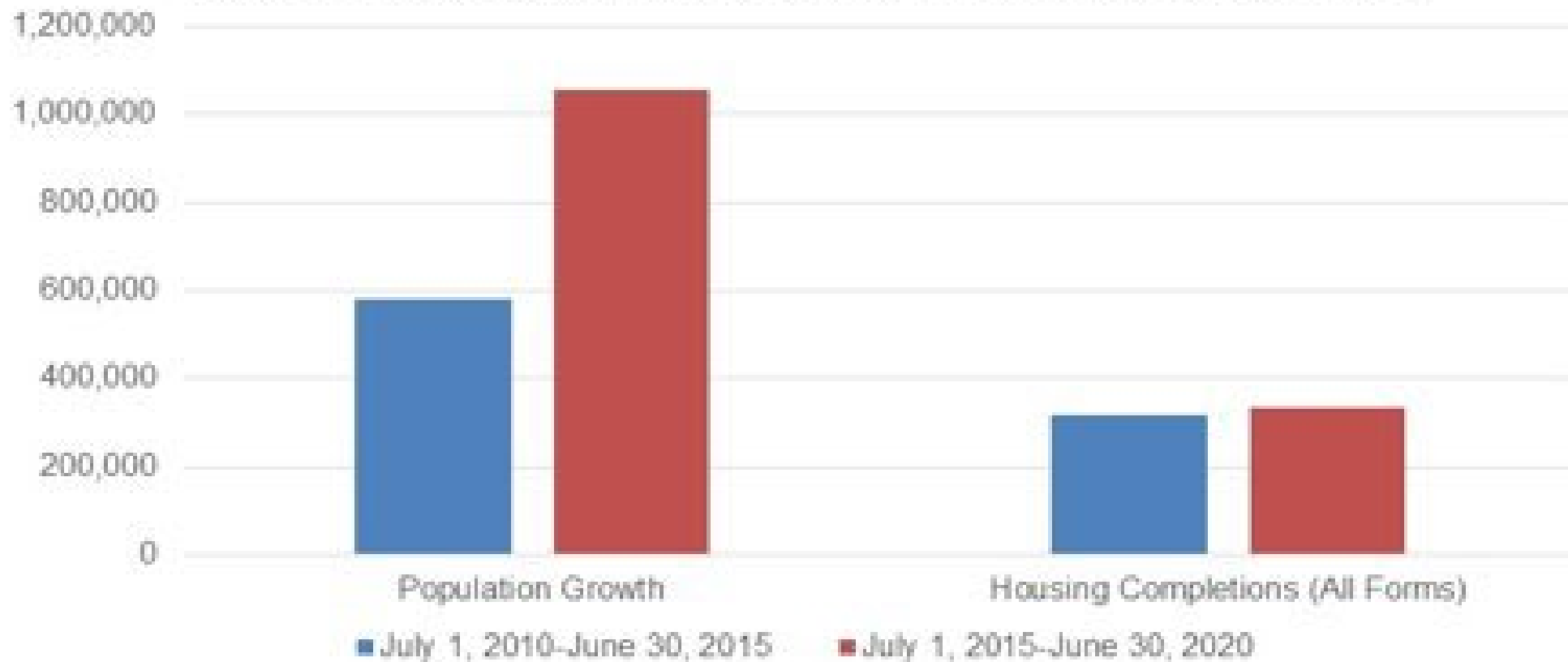
Ontario: Population Growth vs. Housing Completions, 2010-15 & 2015-20