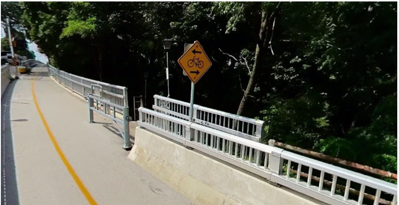
Top access of stairs shows vegetation covering lighting causing visibility issues.

Graffiti – Graffiti is a common issue in many major cities. This is not only a cost to the city, it also takes away from the clean image which the City is attempting to portray in its parks. The light standards have become a target for graffiti. Regular maintenance and inspections should be completed to clean up graffiti.