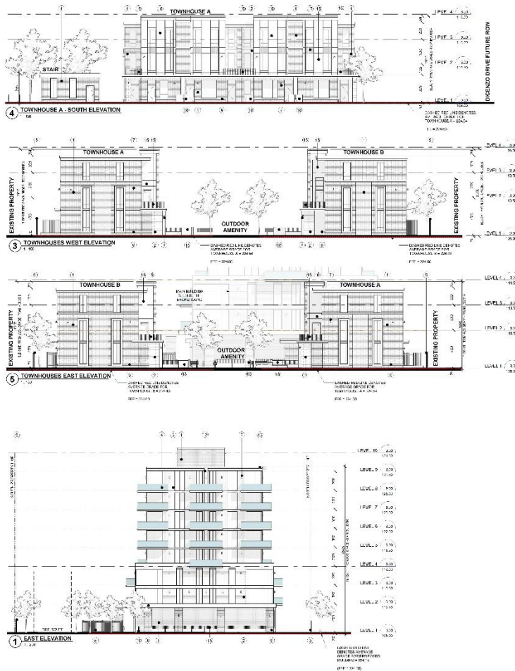
ELEVATIONS - EAST & WEST, TOWNHOUSE 81 & 87 RYMAL RD, HAMILTON