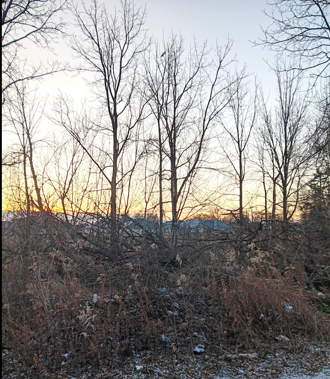
87 Rymal Road East - rear of property looking east