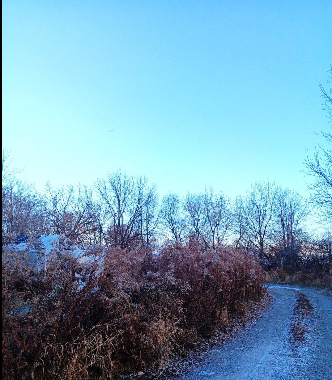
81 Rymal Road East - rear of property looking north