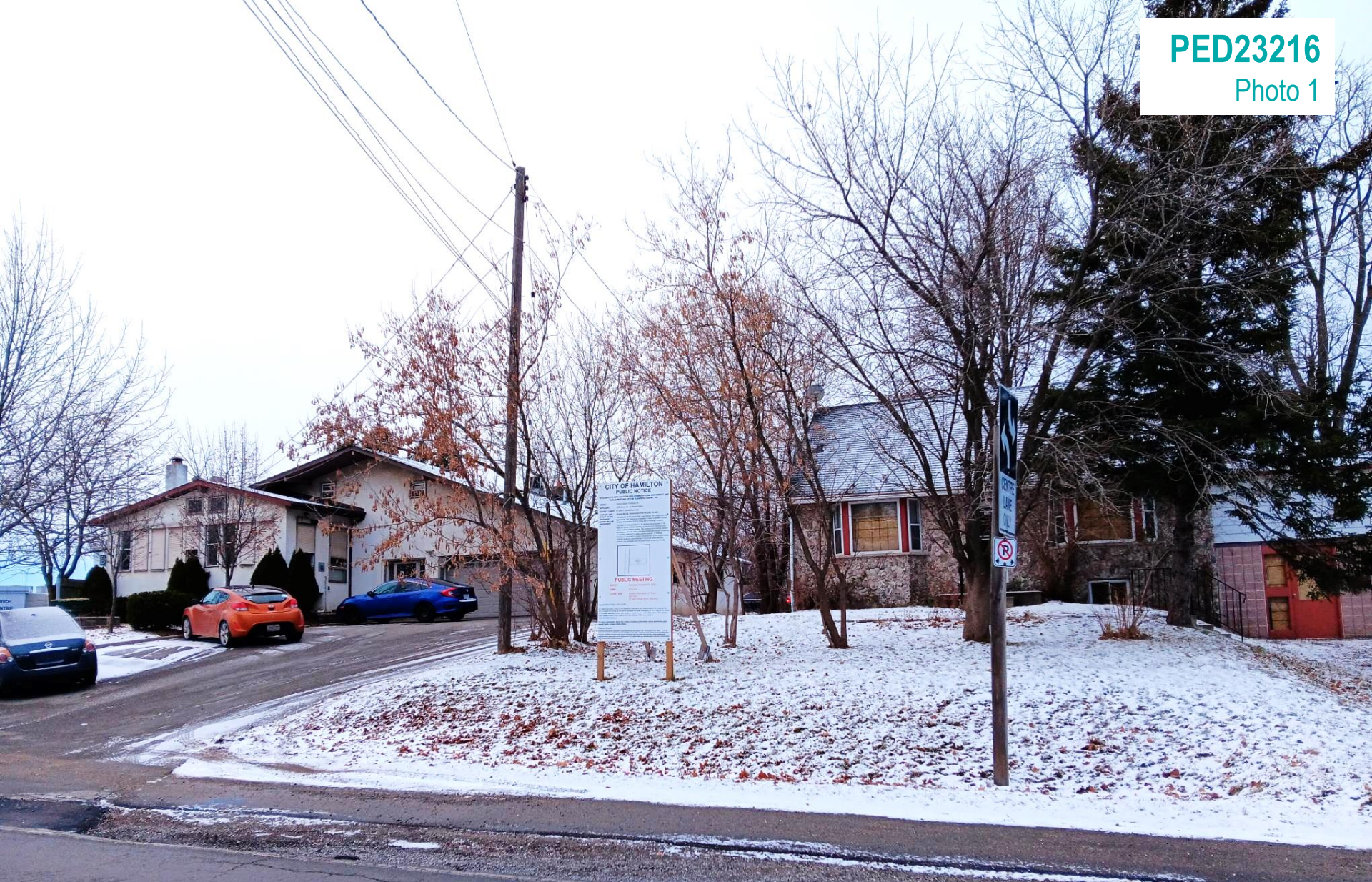
81 & 87 Rymal Road East