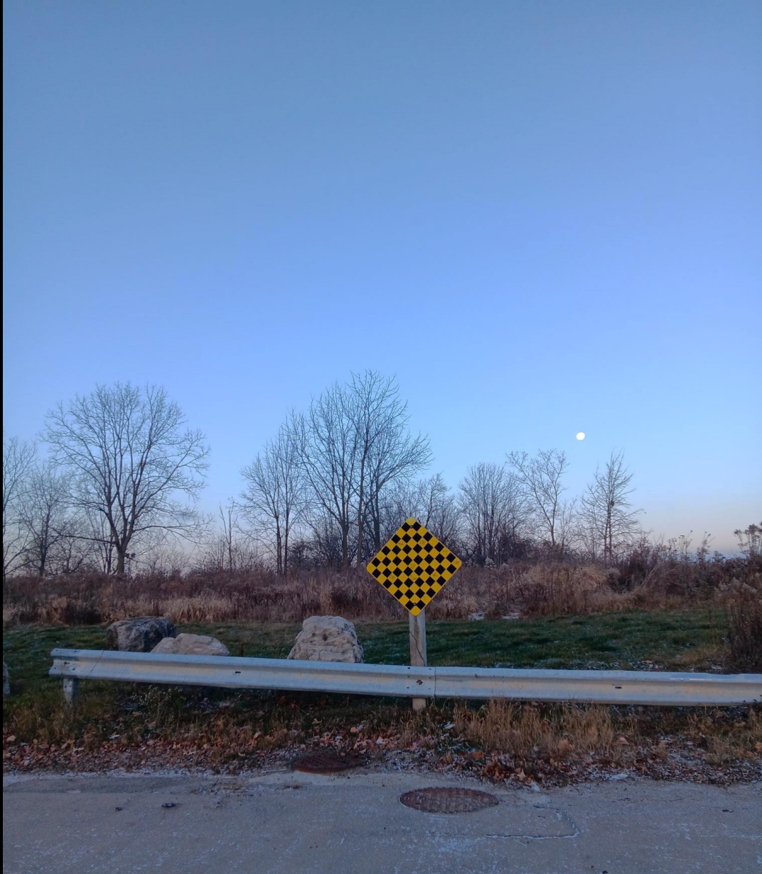
DiCenzo Drive dead end - looking west