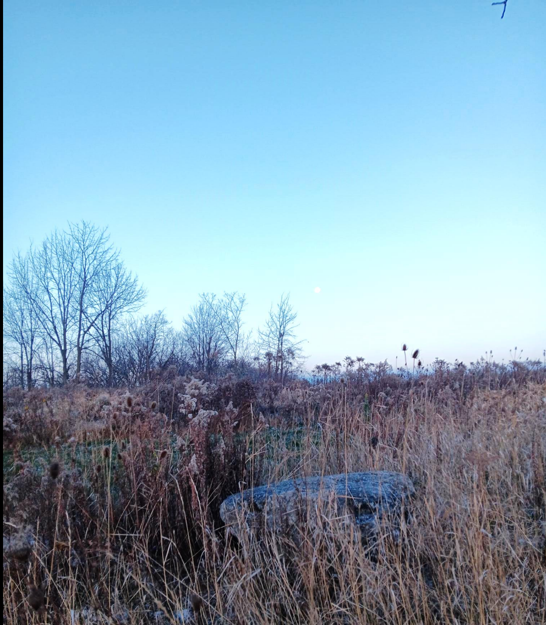
DiCenzo Drive extension - looking west