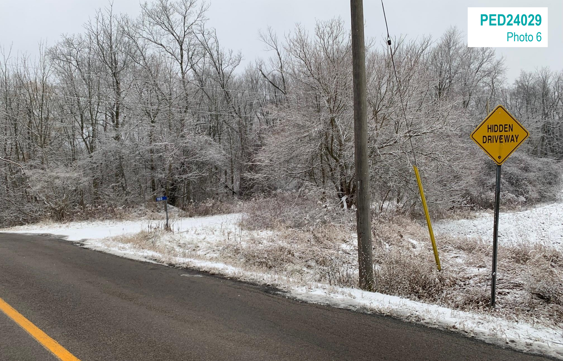
193 Weirs Lane