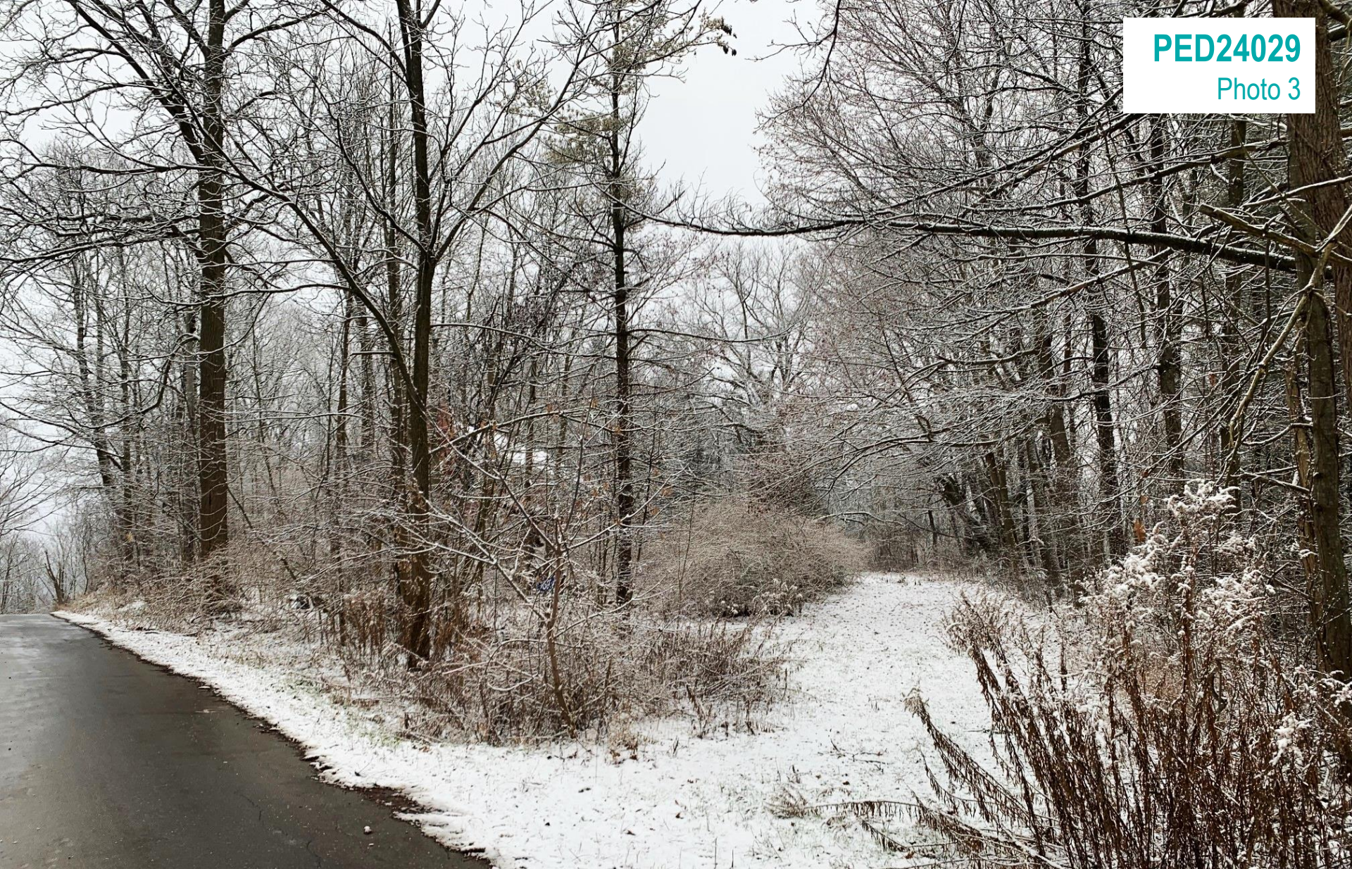
169 Weirs Lane