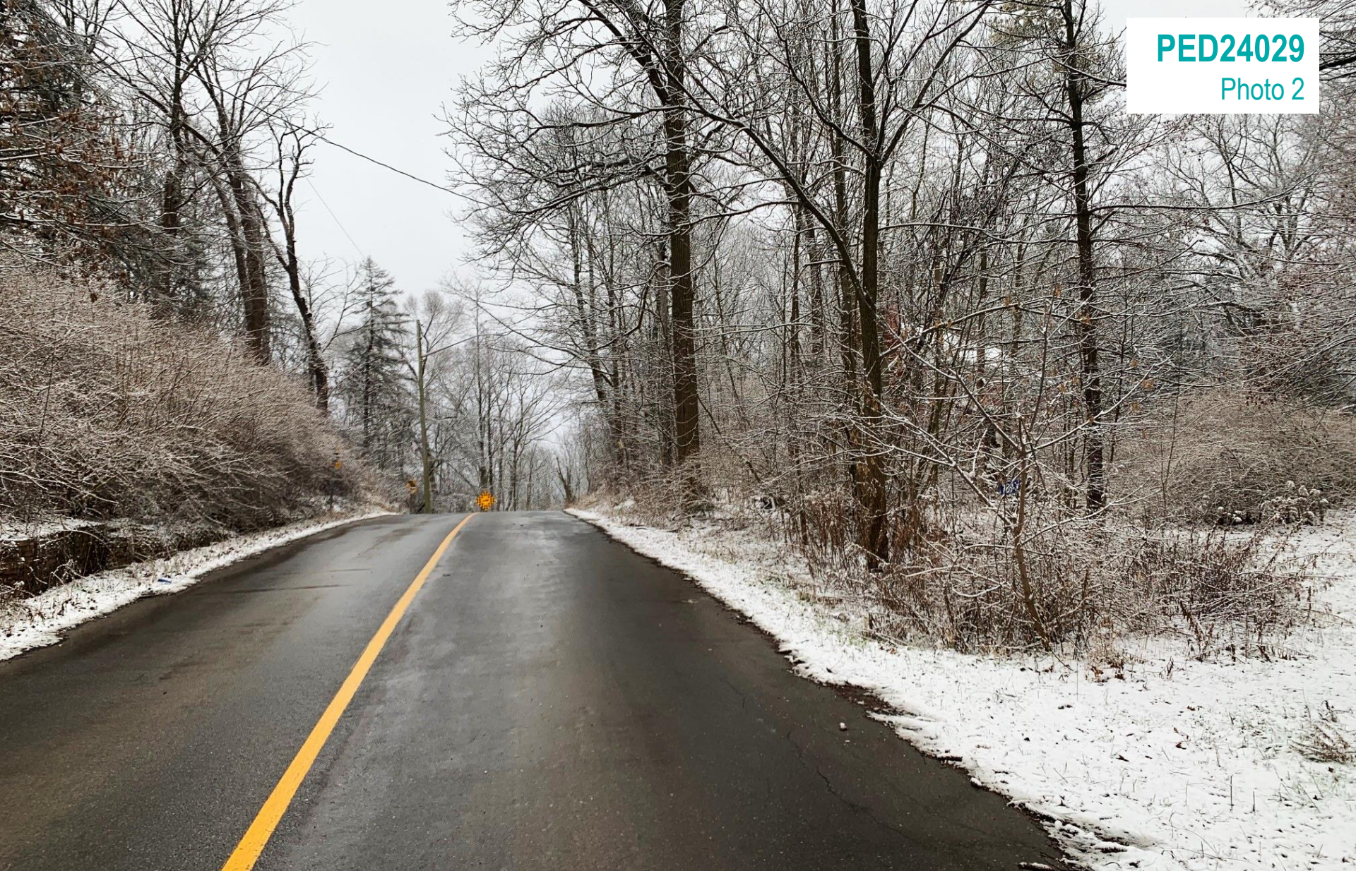
169 Weirs Lane - looking west