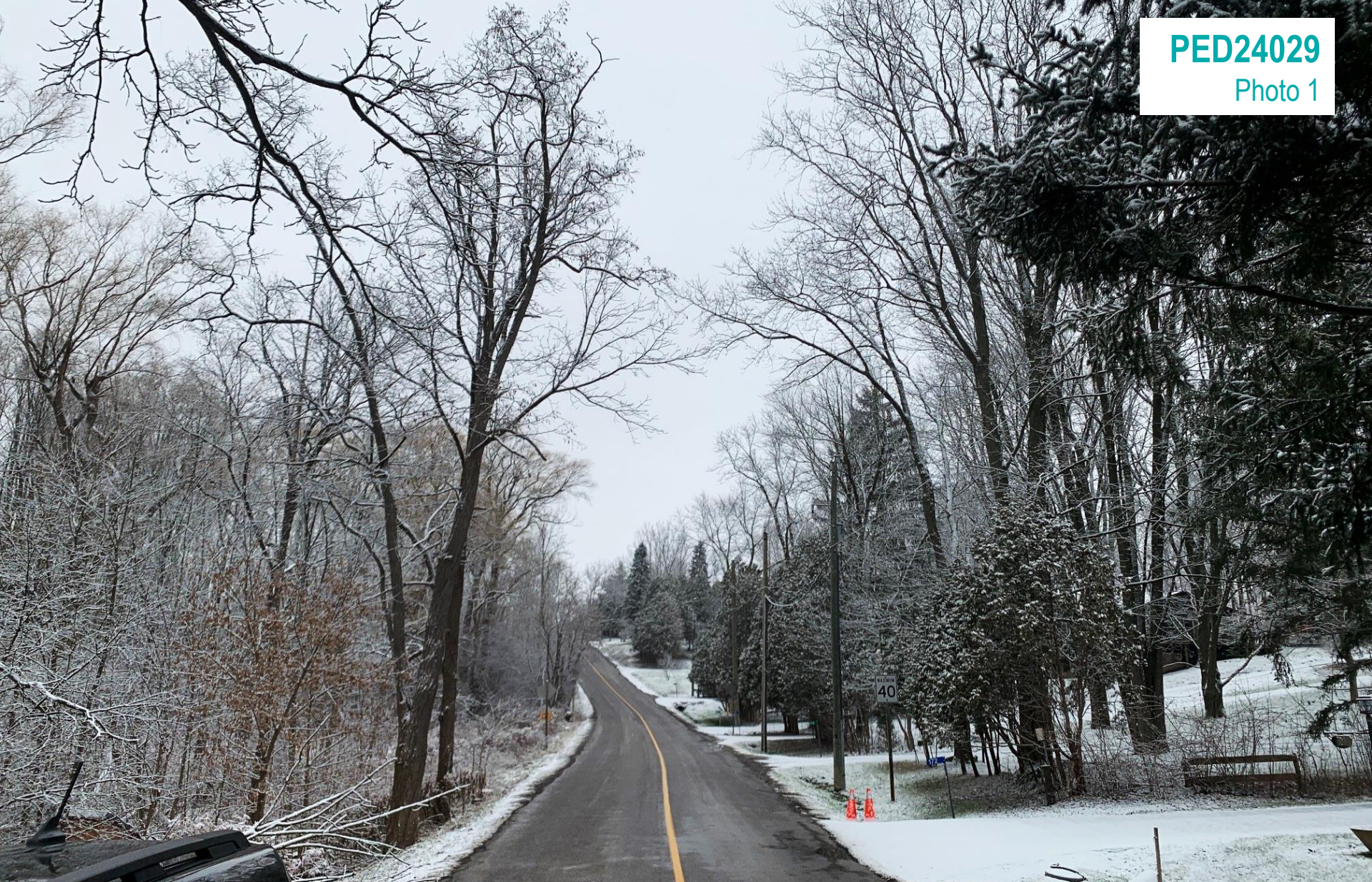
169 Weirs Lane - looking east