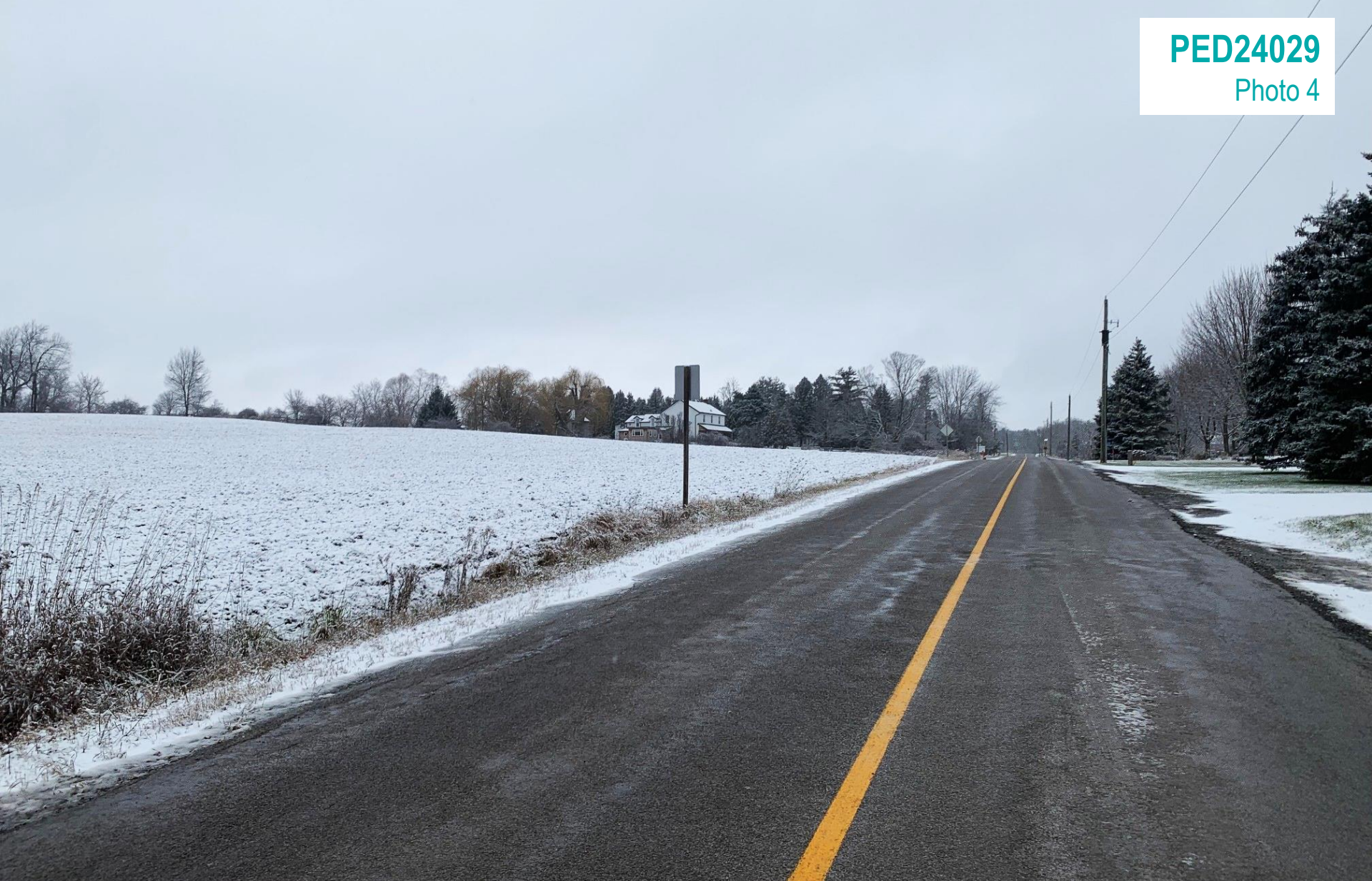
193 Weirs Lane - looking east