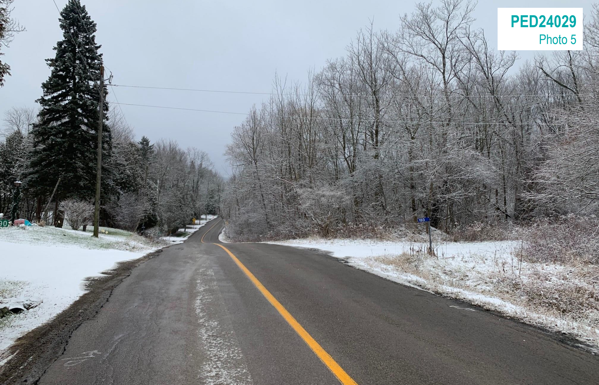
Looking east at the northern property line of the Subject Lands