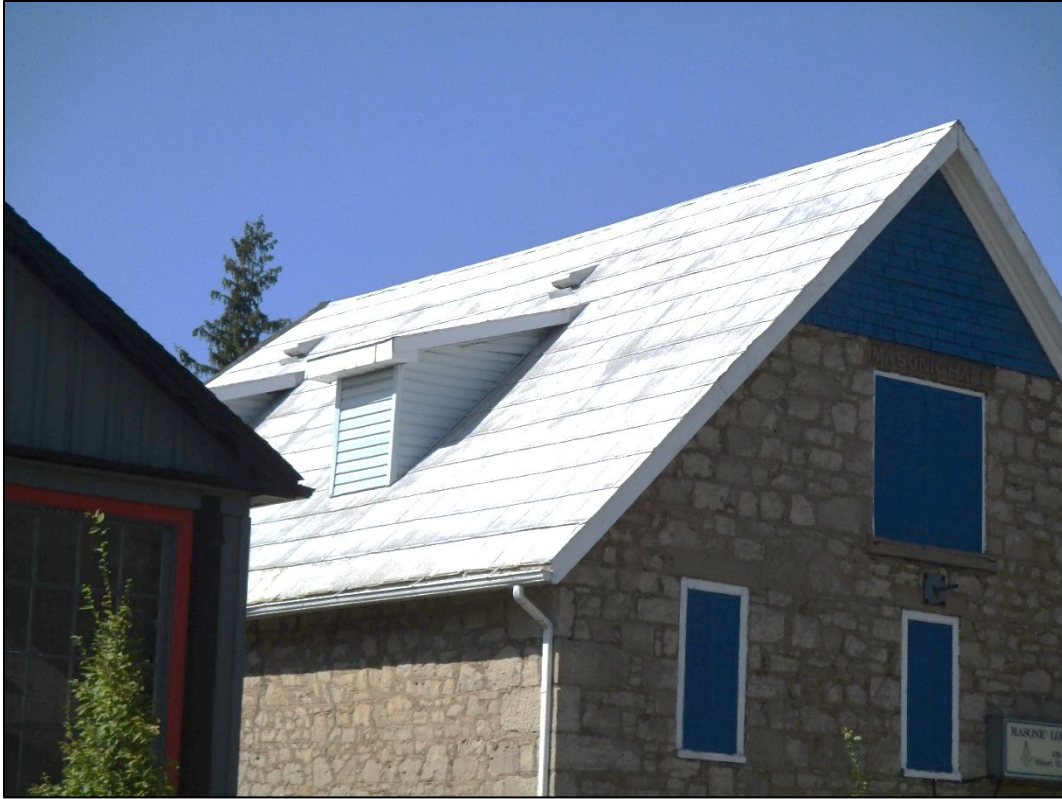
Image 13: Detail of Dormers and Roofline on Side (South) elevation