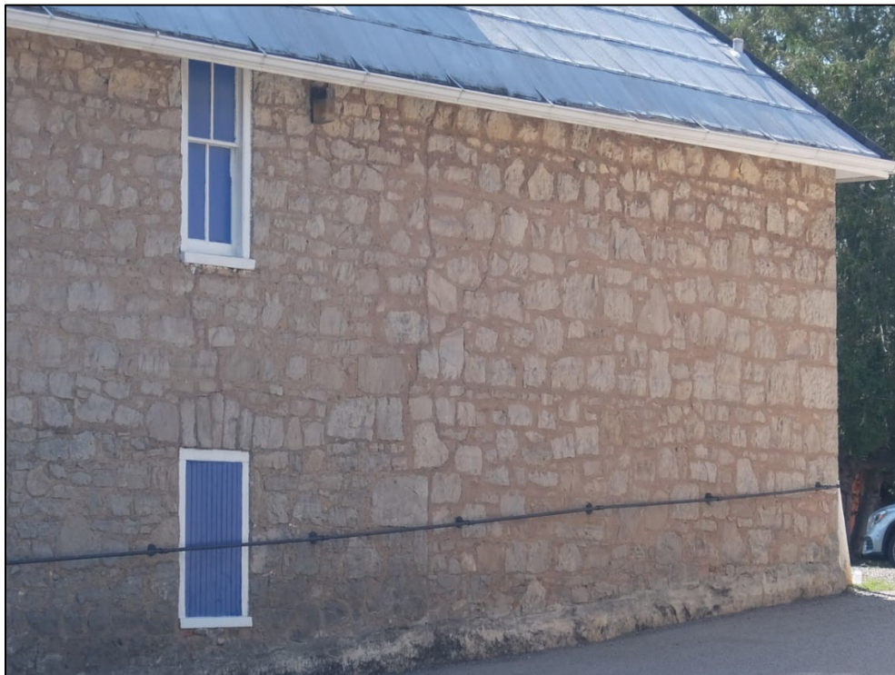
Image 6: Masonry Seam Detail on Side (North) Elevation Delineating the Original circa 1821 Structure and the circa 1914 Addition