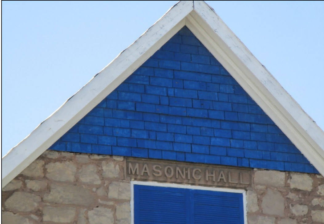
Image 7: Detail of Gable Peak on Front (East) Elevation. Stone inscription reads "MASONIC HALL".