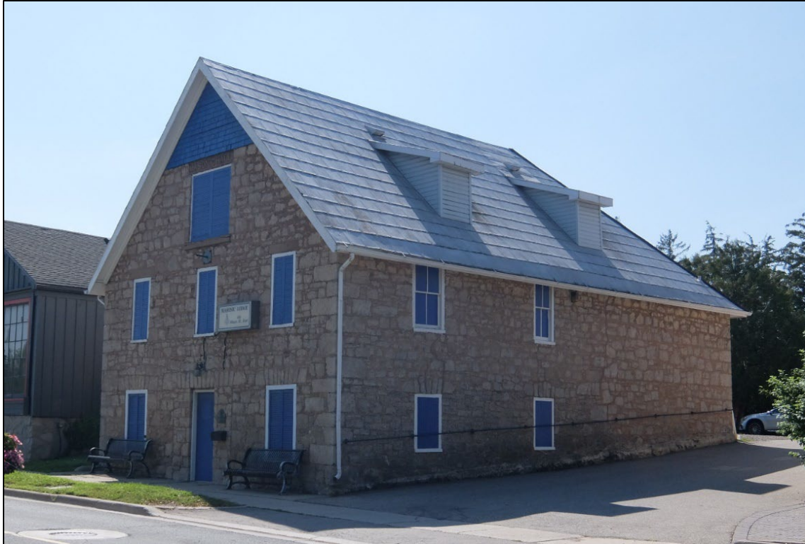
Image 2: View of Subject Property looking southbound along Wilson Street East