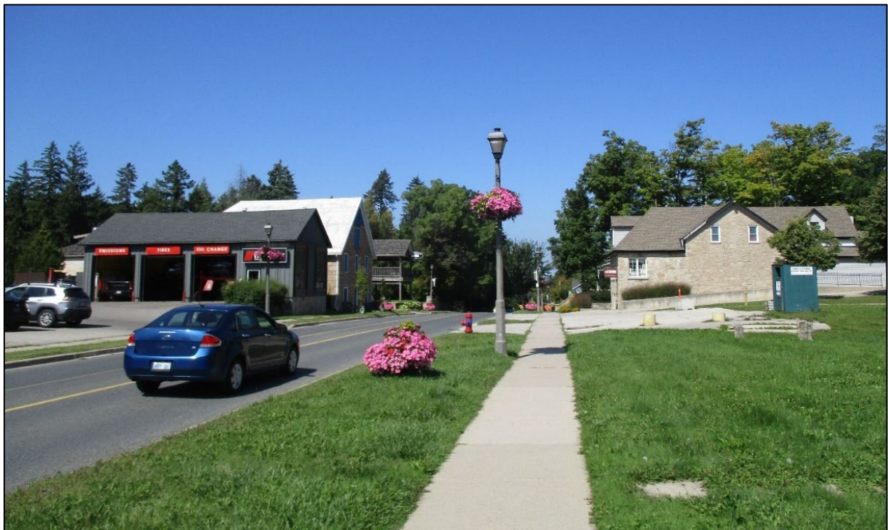
Image 14: View of Streetscape looking northbound along Wilson Street East