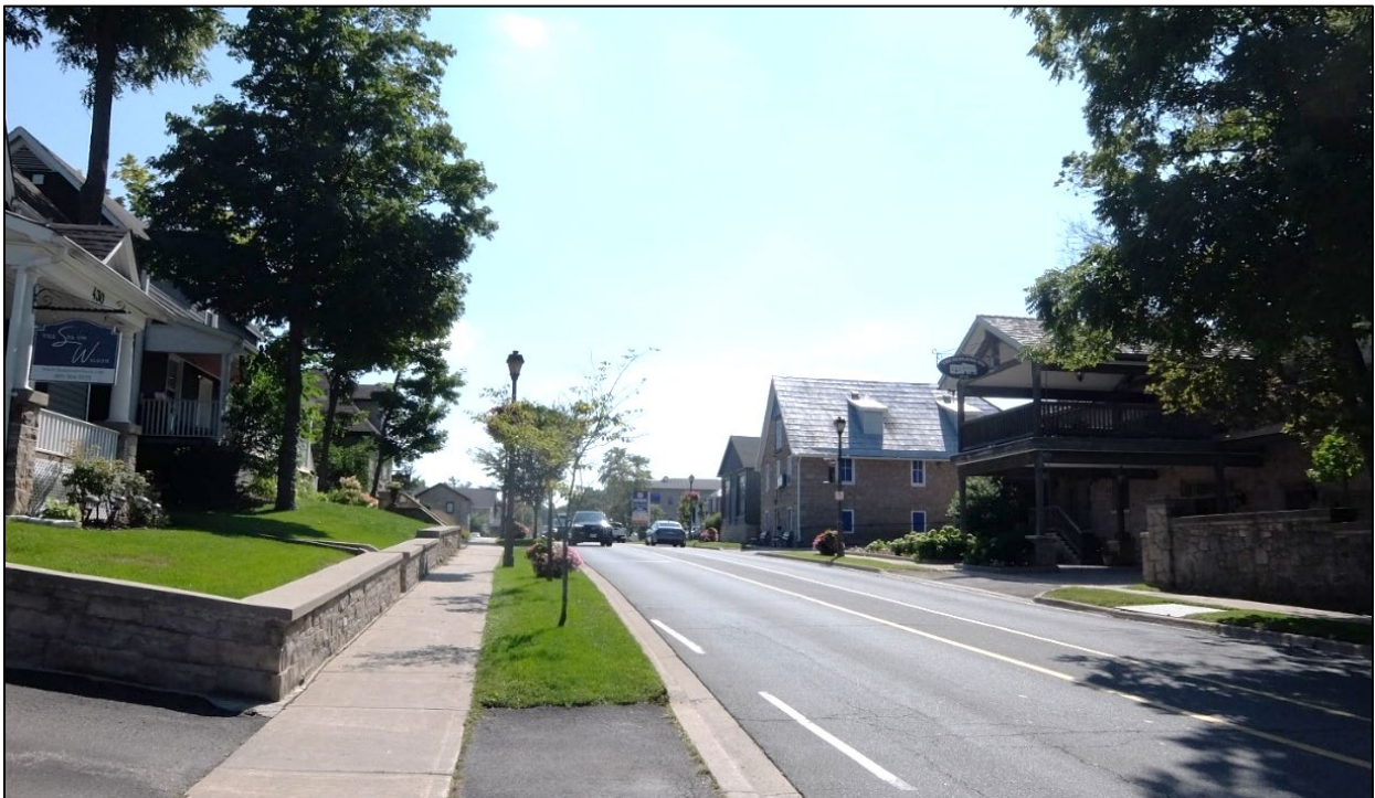
Image 10: View of Streetscape looking southbound along Wilson Street East