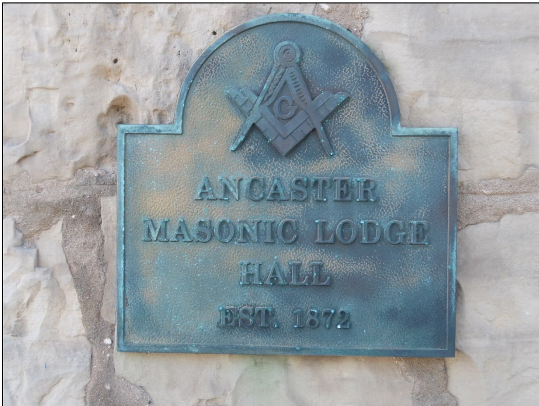
Image 12: Detail of Plaque reading: “Ancaster Masonic Lodge Hall est. 1872”.