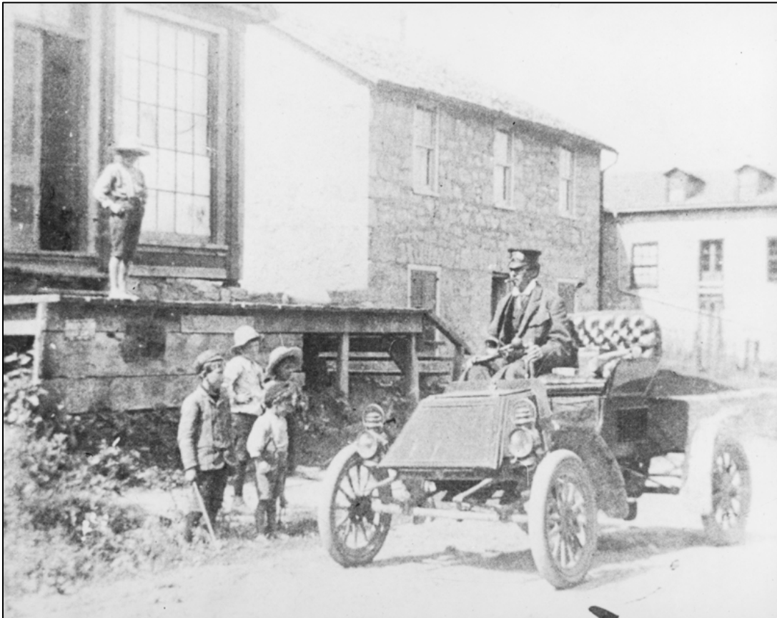
Image 16: Subject Property circa 1902. Note original orientation of roofline.