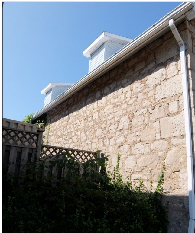
Image 3: Side (South) Elevation of Subject Property, partially obscured