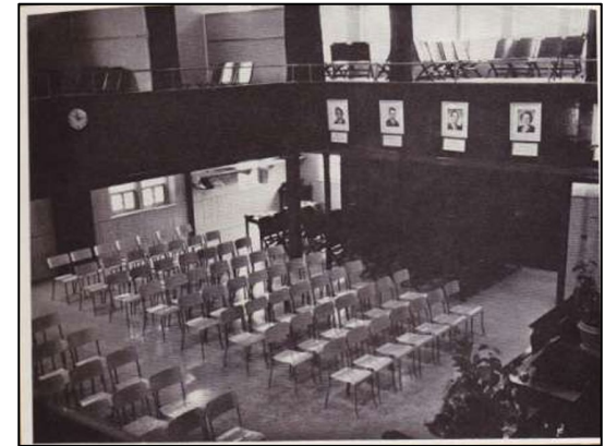
Christian Workers' Chapel interior. Formerly called The Lecture Hall, the space has now been repurposed.