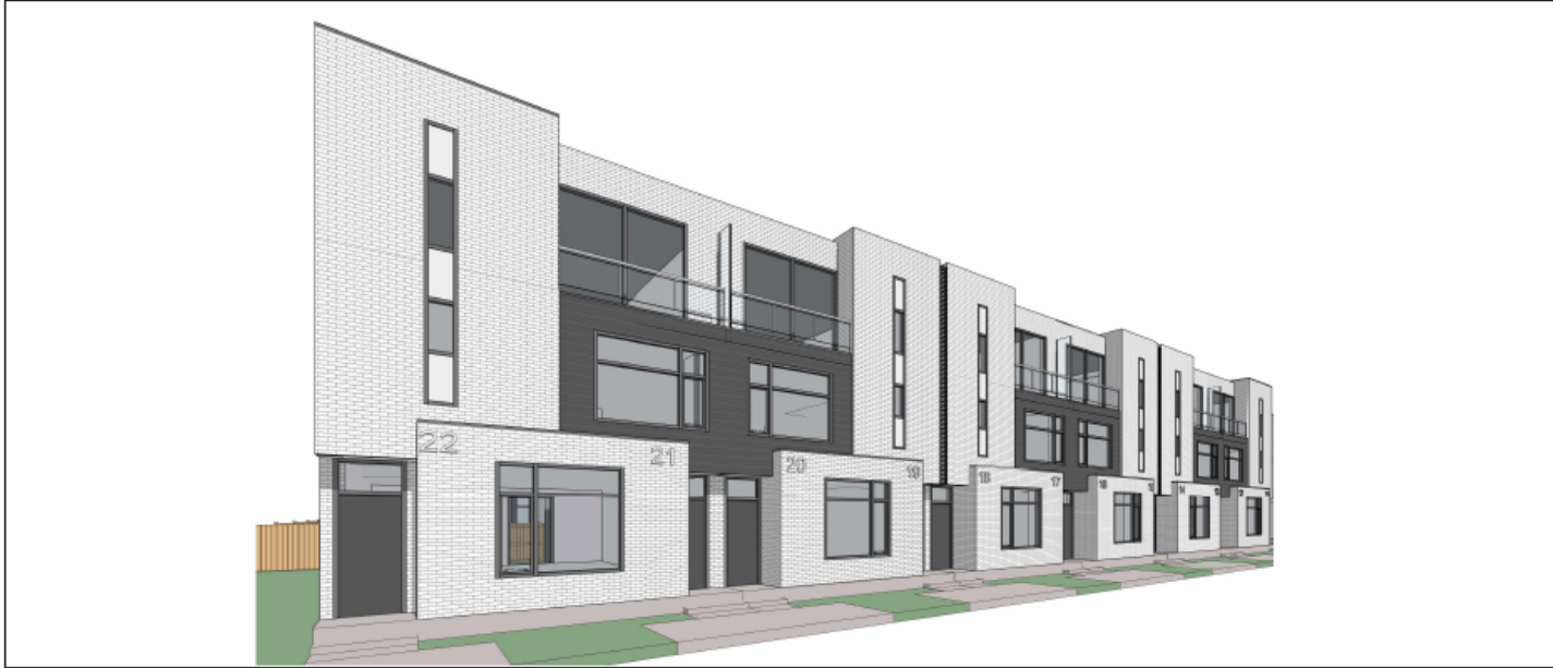
2 A-0.2 STACKED TOWNHOUSES - VIEW 02

ALL WORK SHALL BE CARRIED OUT IN ACCORDANCE WITH THE LATEST ONTARIO BUILDING CODE.