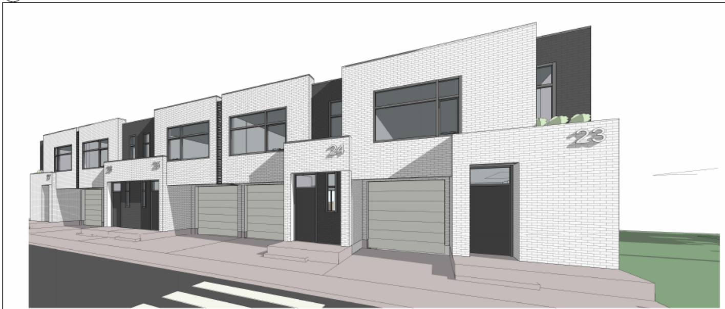
2 TOWNHOUSES - VIEW 02 A-0.1

ALL WORK SHALL BE CARRIED OUT IN ACCORDANCE WITH THE LATEST ONTARIO BUILDING CODE.