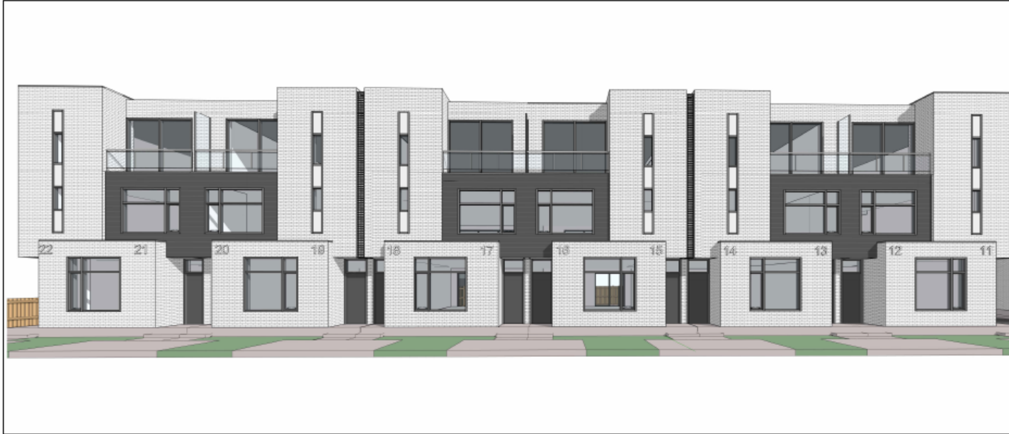
1 A-0.2 STACKED TOWNHOUSES - VIEW 01