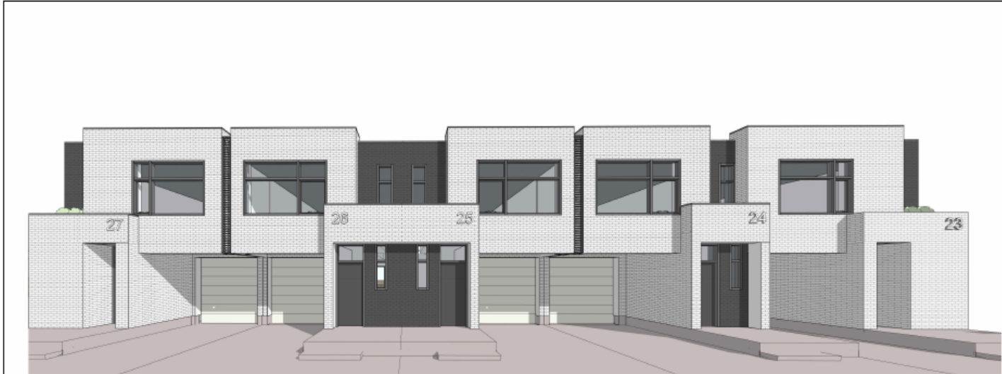
1 TOWNHOUSES - VIEW 01 A-0.1