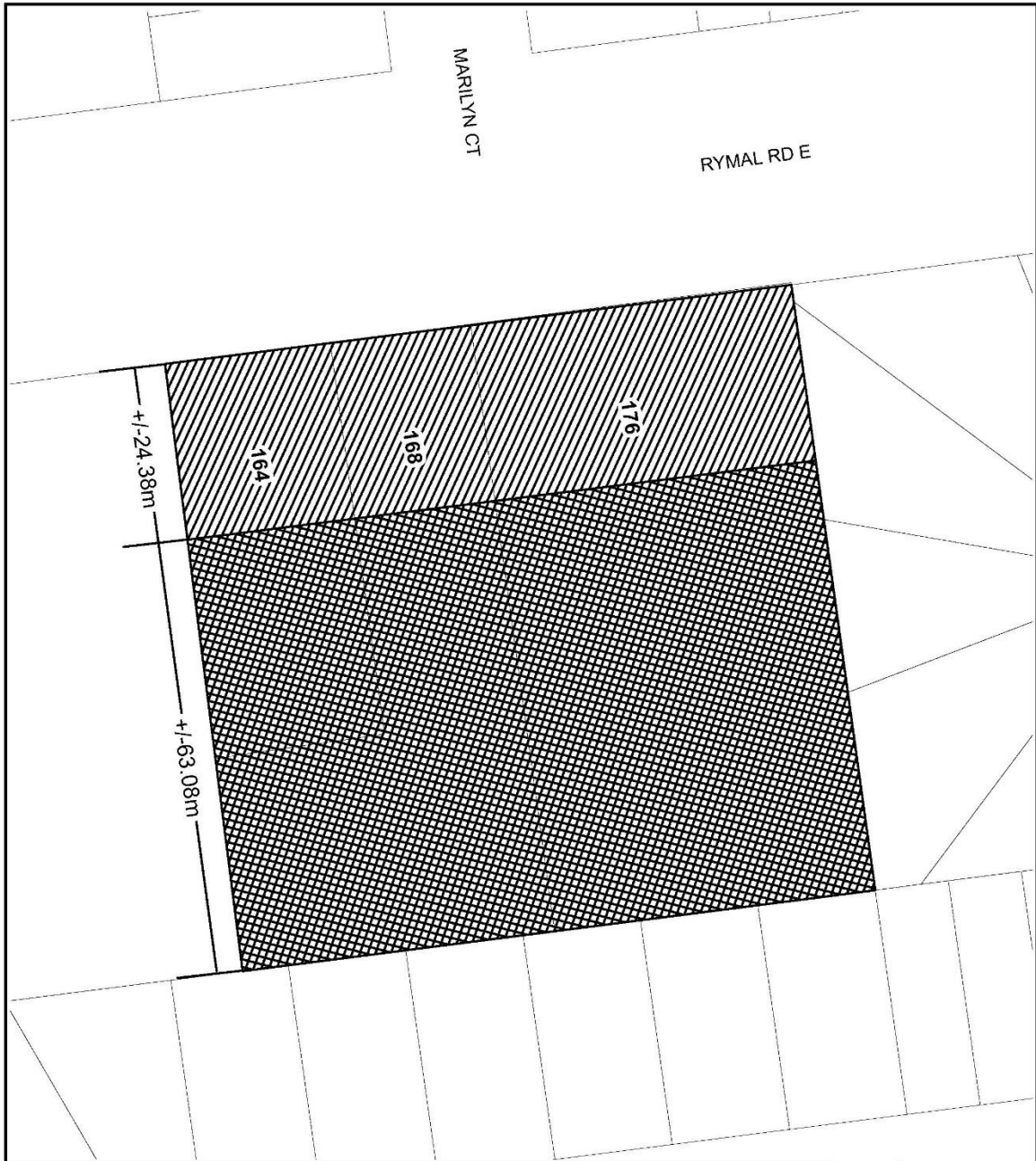
Special Figure 38: 164 - 176 Rymal Road East