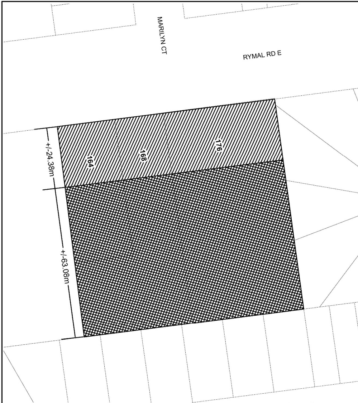
Special Figure 38: 164 - 176 Rymal Road East