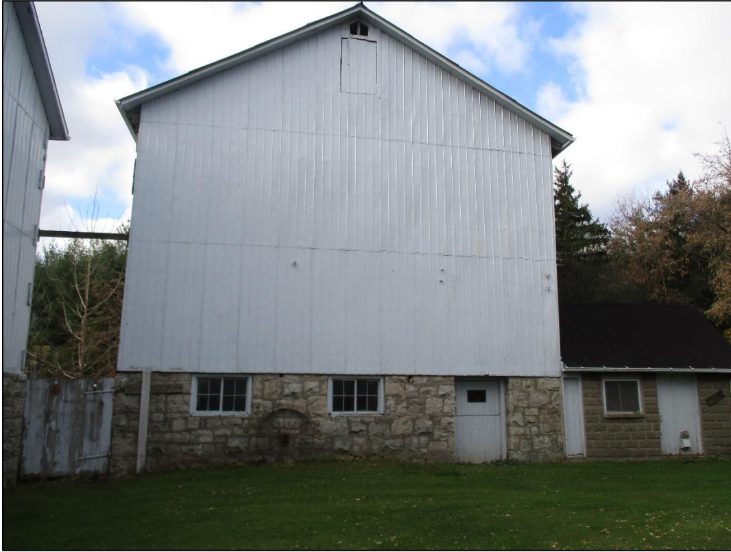
Figure 29: East Elevation of Dairy Barn