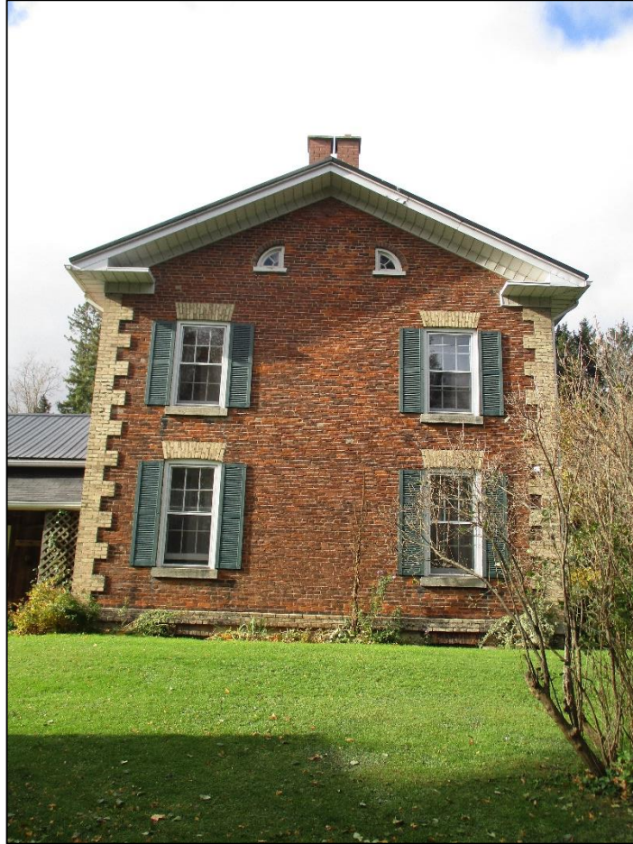
Figure 7: West Elevation of Farmhouse