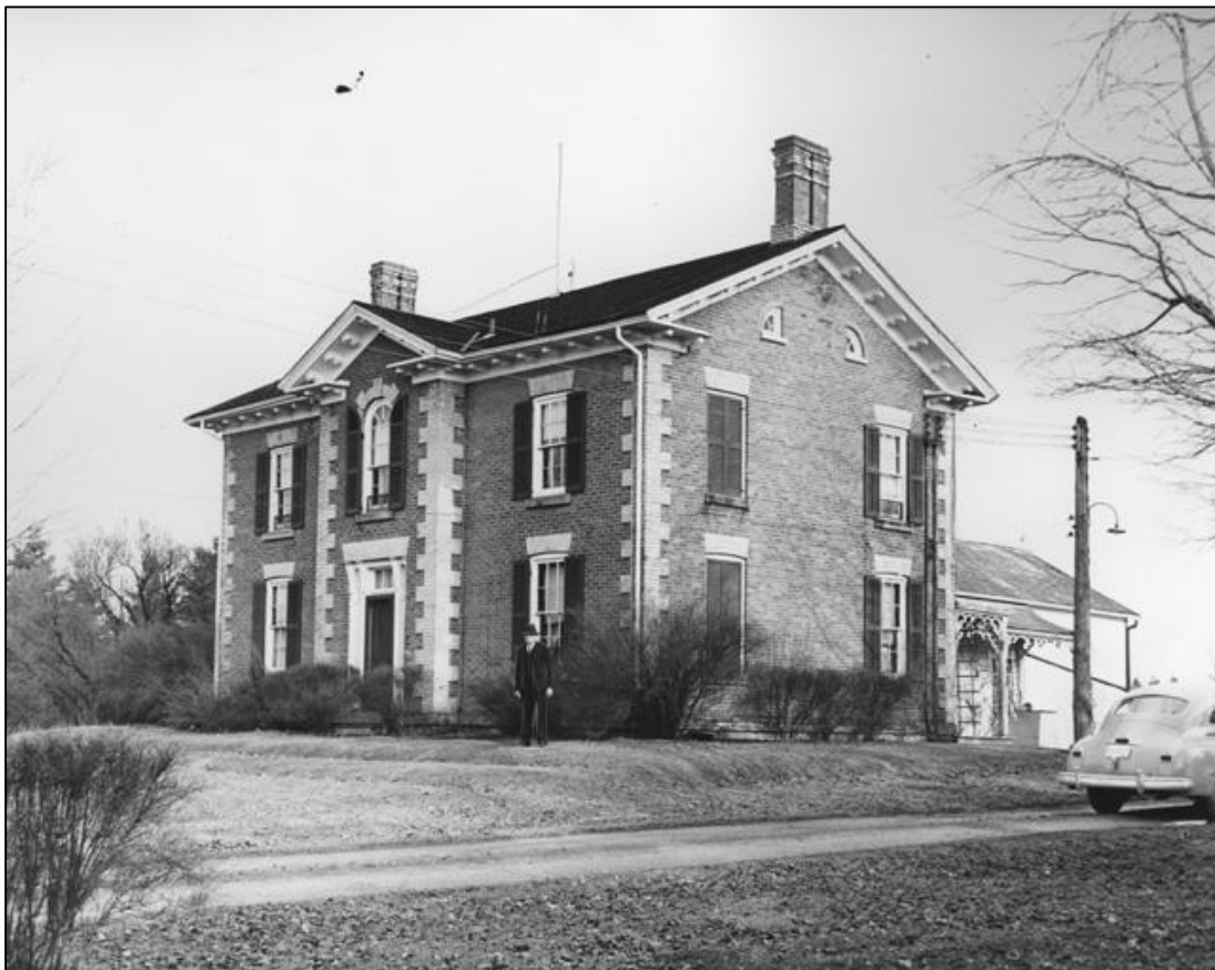
Figure 50: Farmhouse in 1952 (Hamilton Public Library: Local History and Archives)