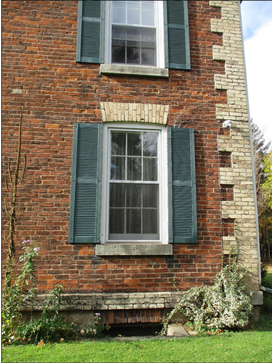
Figure 9: Detail view of windows, stone foundation, and projecting quoins