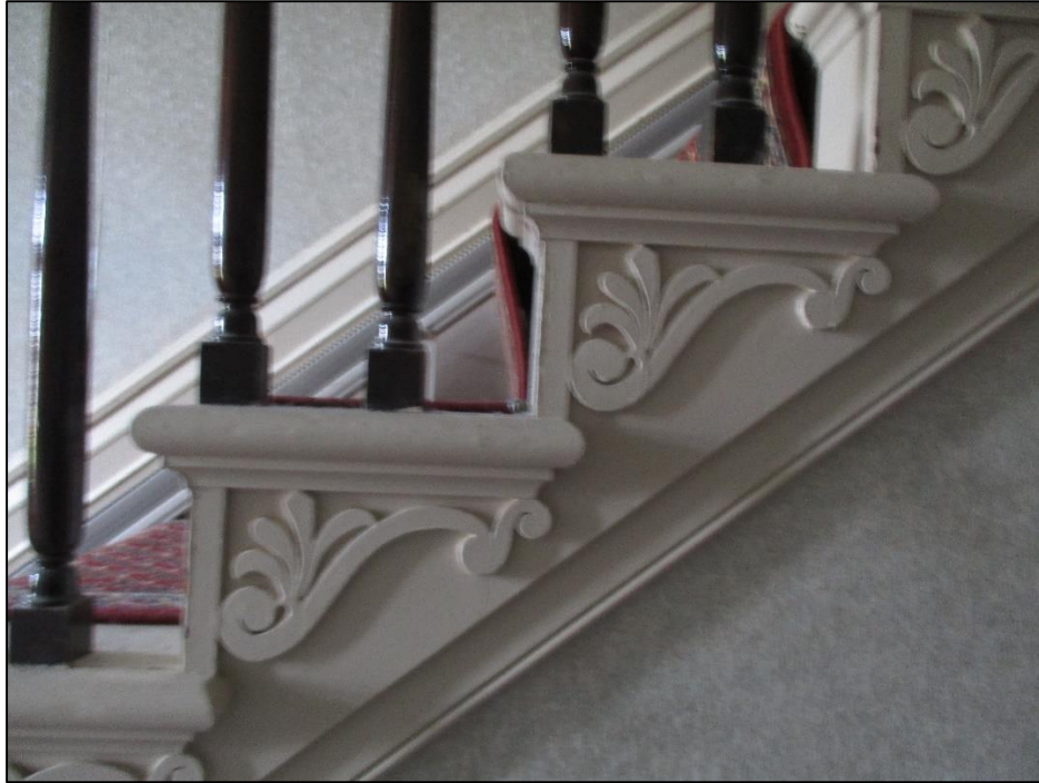
Figure 41: Detail of staircase