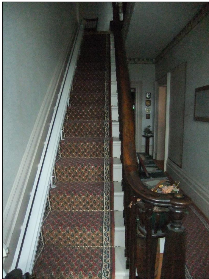
Figure 40: View of front hall in farmhouse