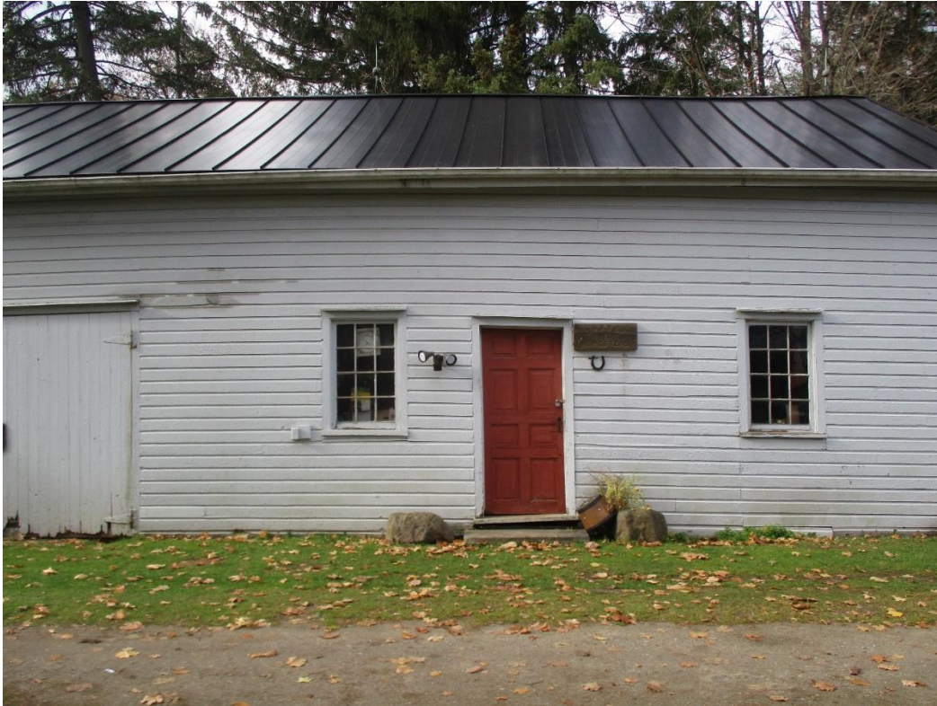
Figure 19: Detail of paneled "Loyalist" door