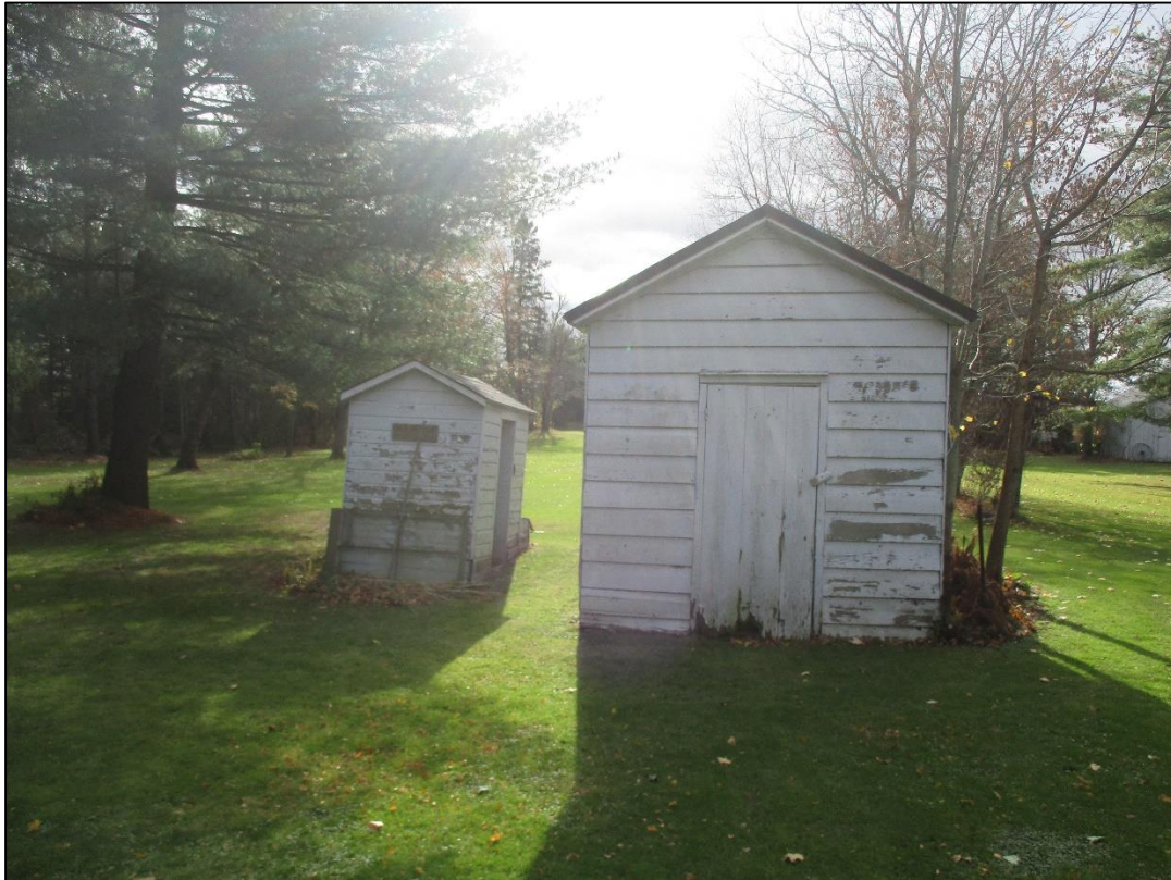
Figure 24: North Elevations of outhouse (right) and smokehouse (left)