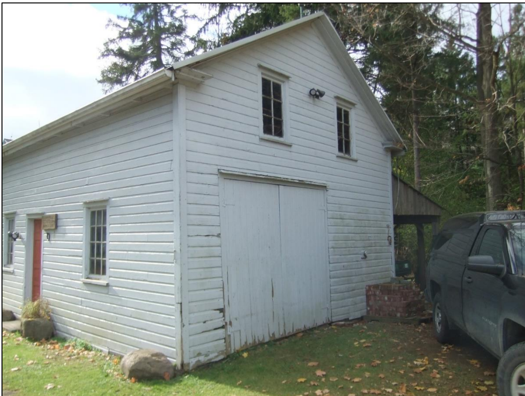
Figure 18: North Elevation of c.1830 frame house