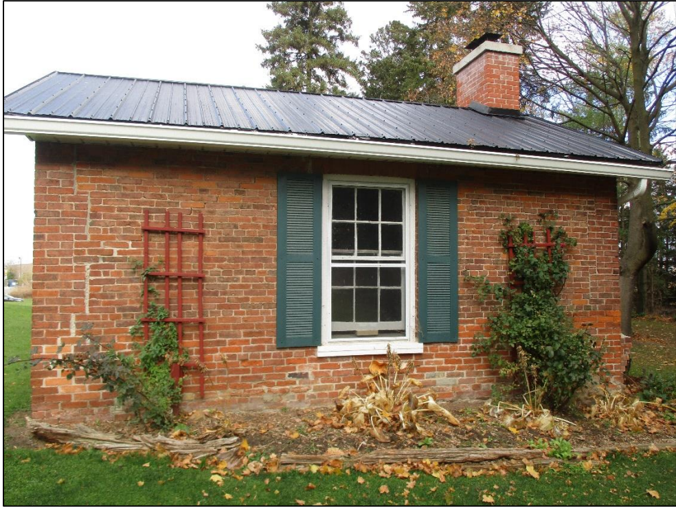
Figure 21: South Elevation of c.1856 bakehouse