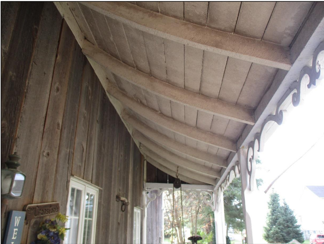
Figure 14: Detail of west side farmhouse porch