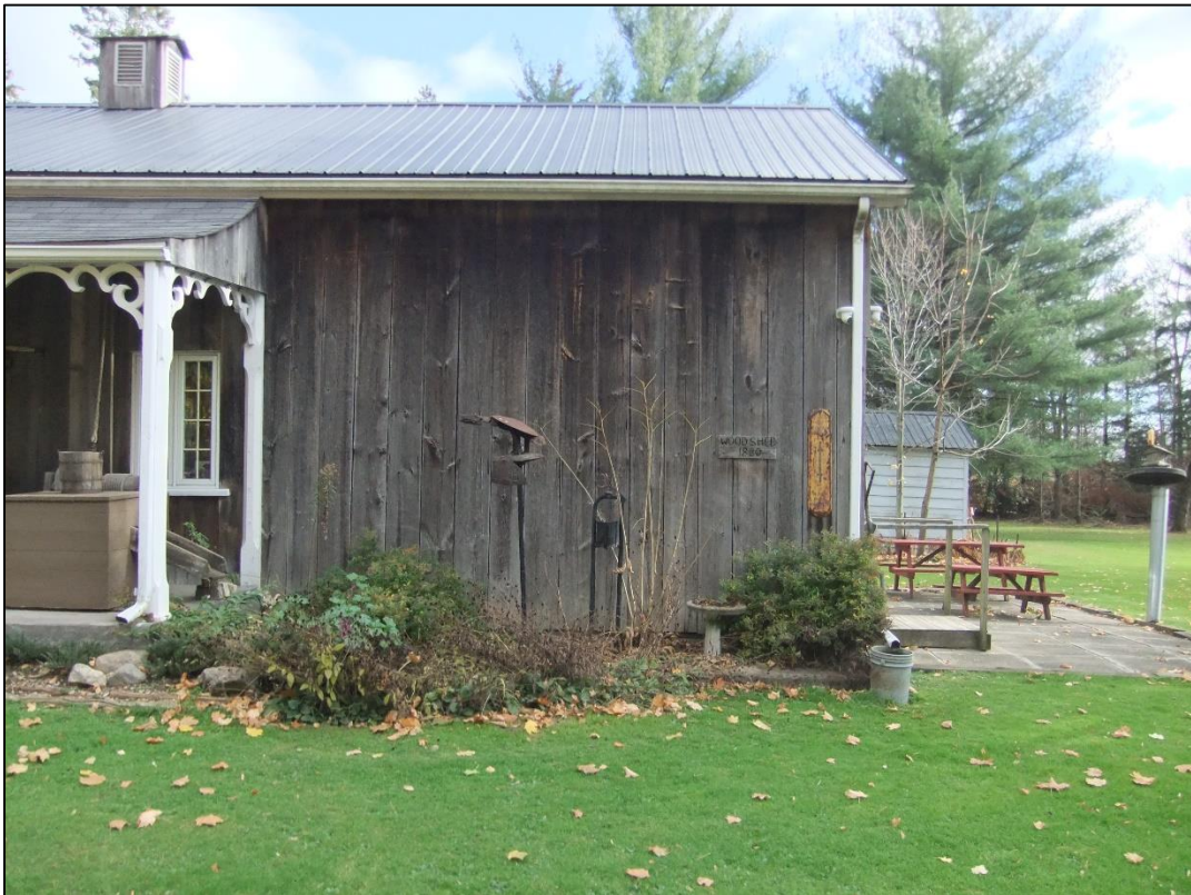
Figure 4: Rear of West Elevation of Farmhouse