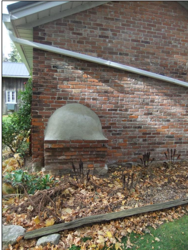
Figure 22: East Elevation of Bakehouse showing rear of bake oven