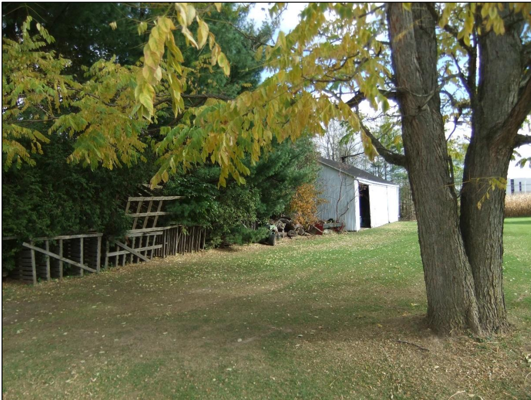
Figure 34: View of 1959 Equipment Shed