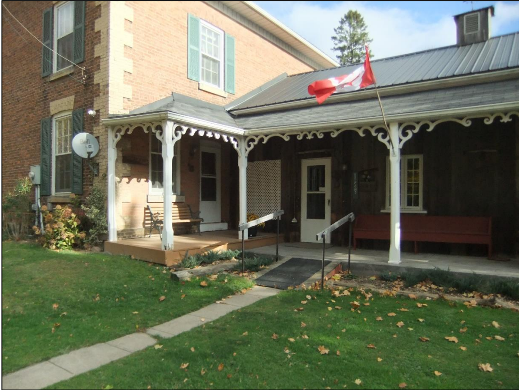
Figure 3: Side (West) Elevation of Farmhouse showing Porch and Frame Kitchen