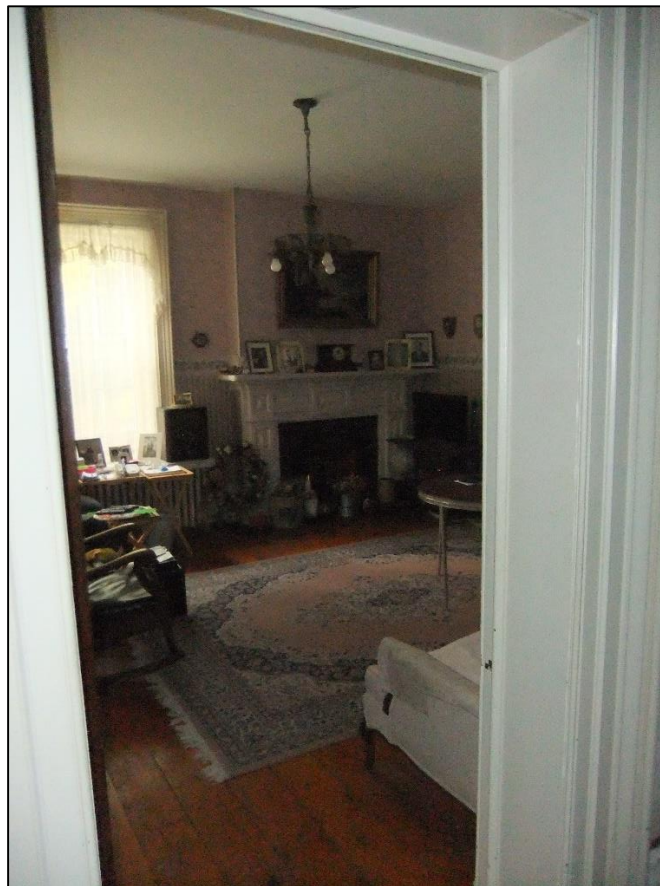
Figure 38: Interior of farmhouse showing living room