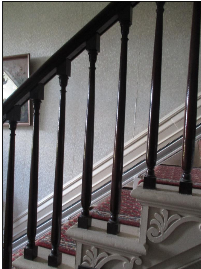
Figure 42: Detail of staircase