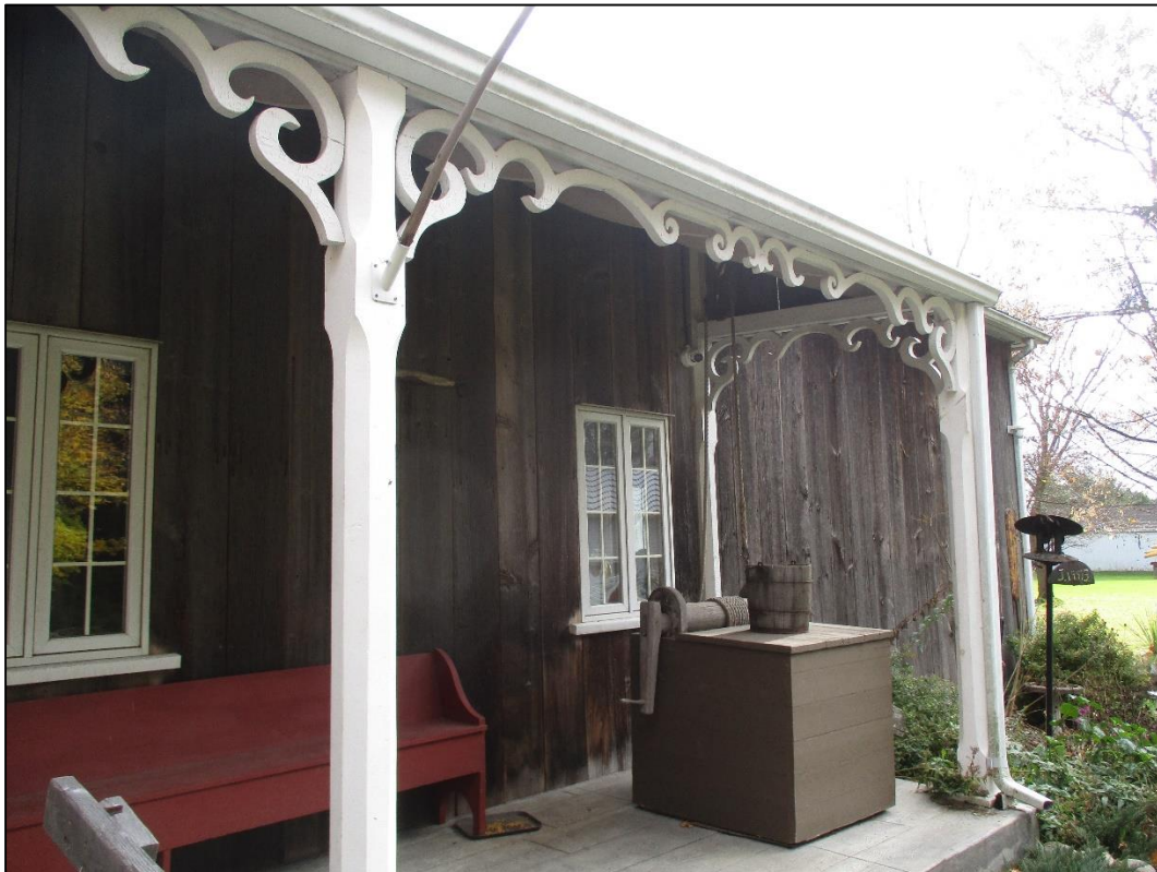
Figure 12: Detail of scrollwork on west side farmhouse porch