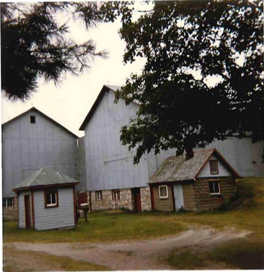
Figure 52: barnyard in 1984 (Ancaster LACAC)