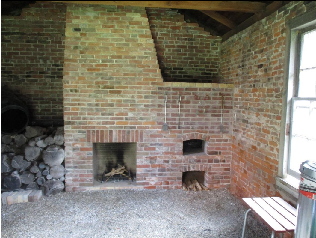
Figure 23: View of interior of c.1856 bake house, showing hearth and bake oven