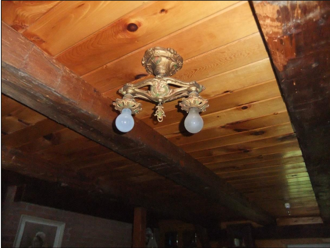
Figure 35: Interior View of farmhouse showing hand hewn beams