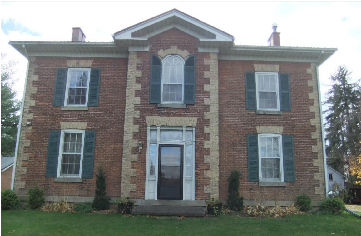
Figure 1: Front Elevation of Brick Farmhouse