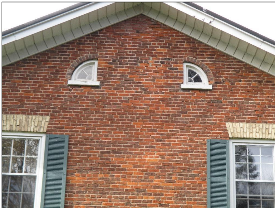
Figure 8: Quarter-Circle Windows on West Elevation of Farmhouse