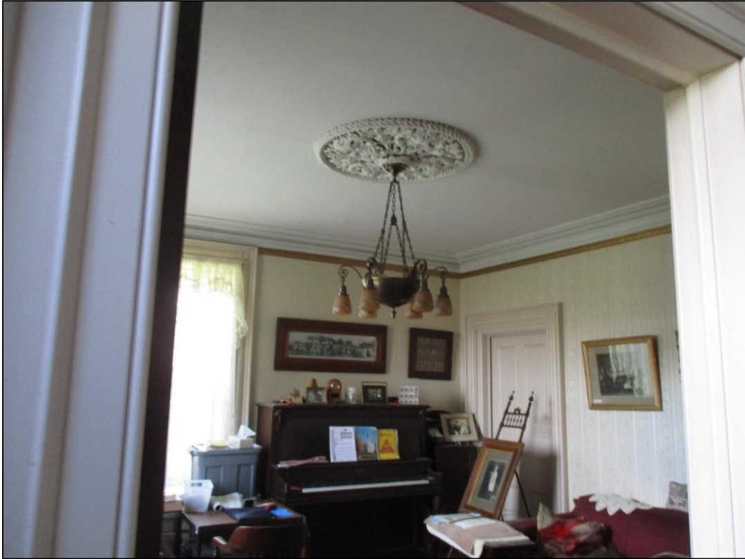
Figure 45:View of Study