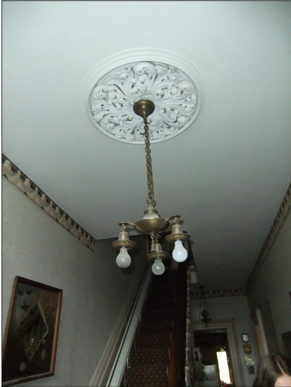
Figure 44: Detail of Medallion in front hall