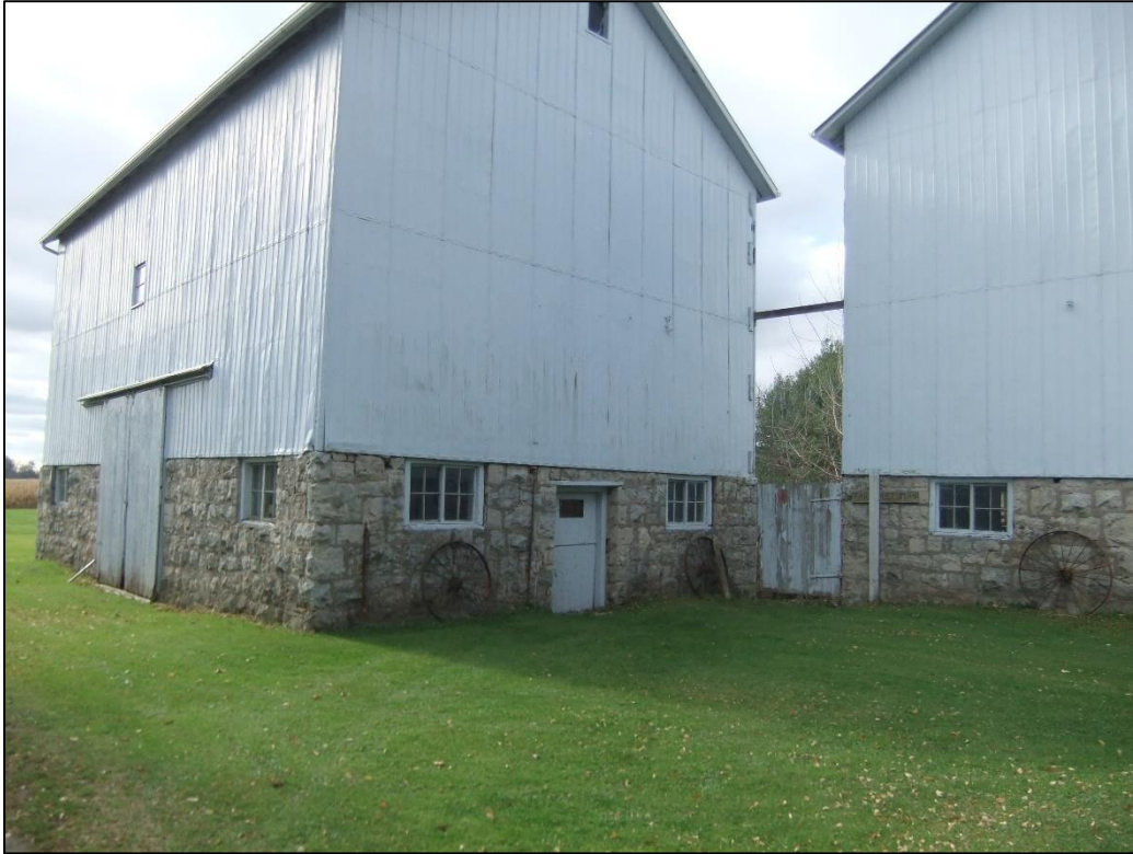
Figure 31: North and East Elevations of Horse Barn