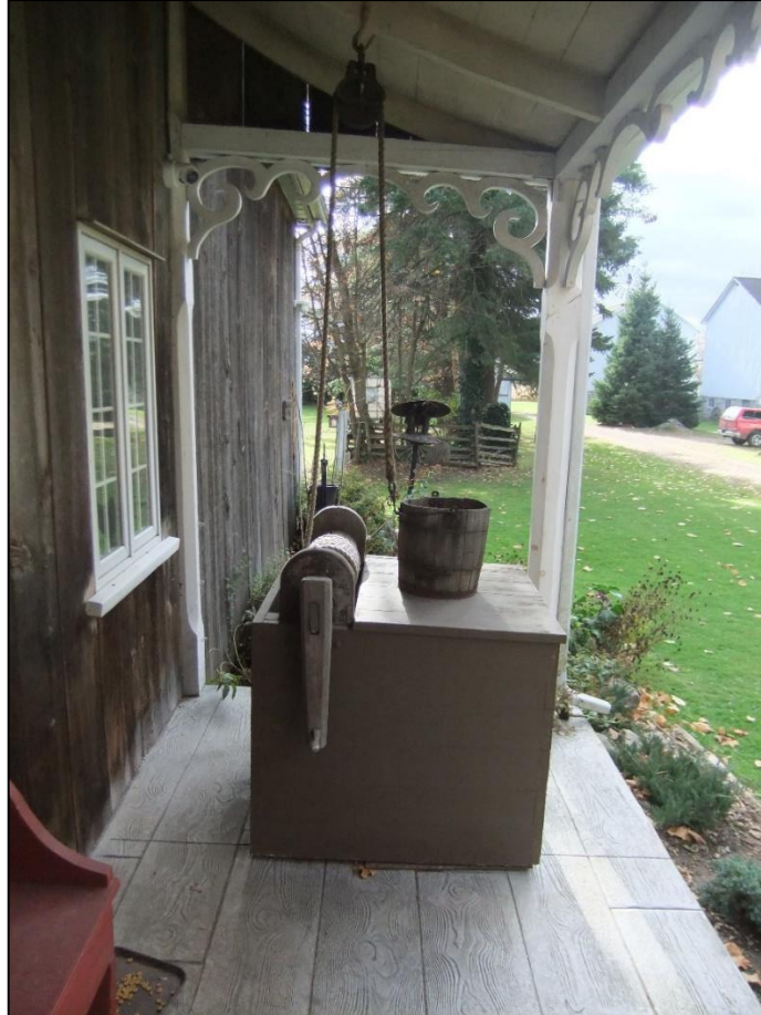
Figure 15: Detail of Shaver Family well