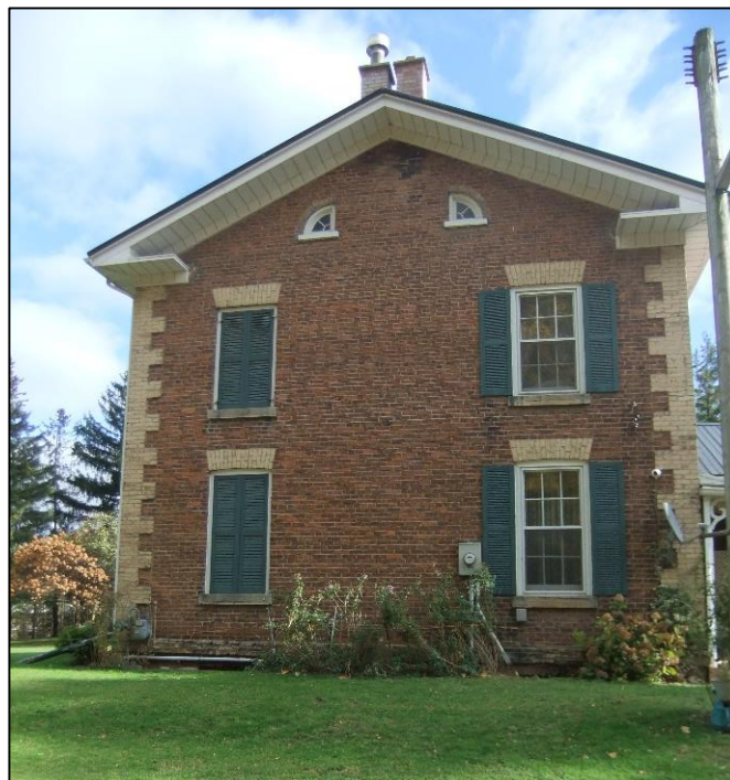
Figure 2: Side (West) Elevation of Brick Farmhouse