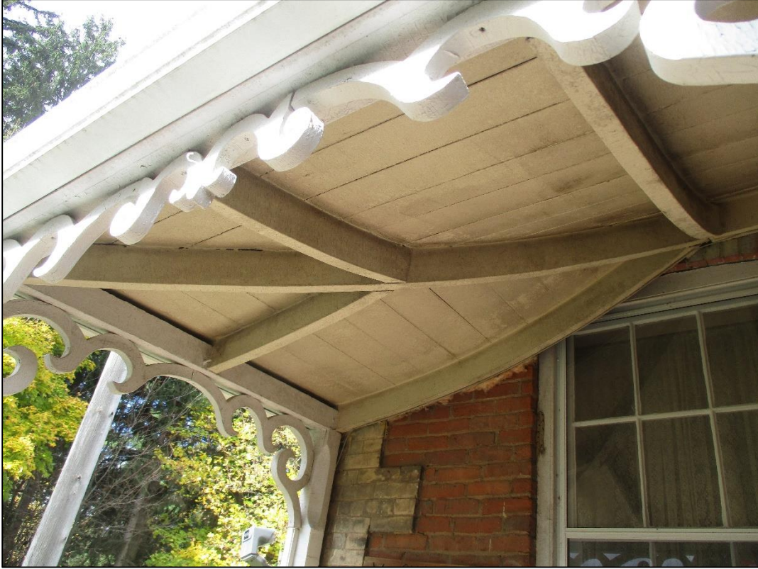
Figure 13: Detail of west side farmhouse porch