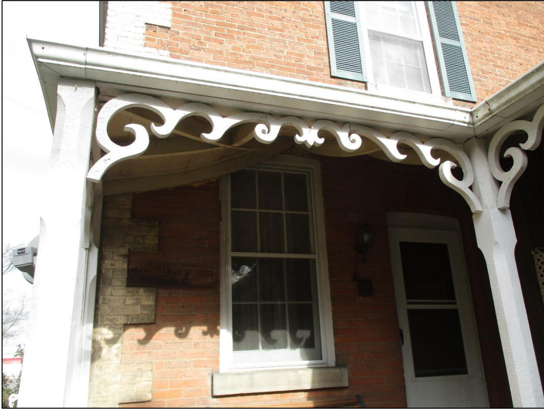
Figure 11: Detail of scrollwork on west side farmhouse porch