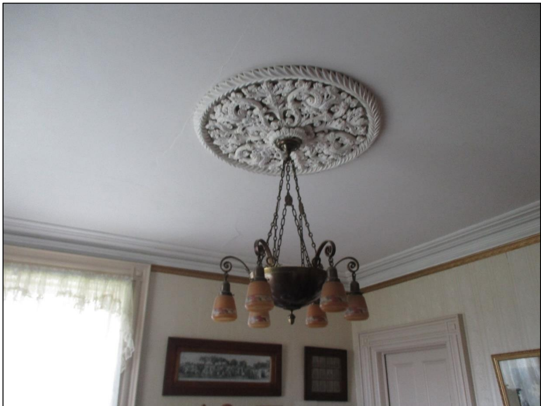
Figure 46: Detail of medallion in study