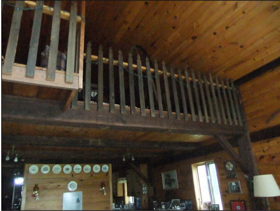
Figure 37: Interior of farmhouse showing framework of beams