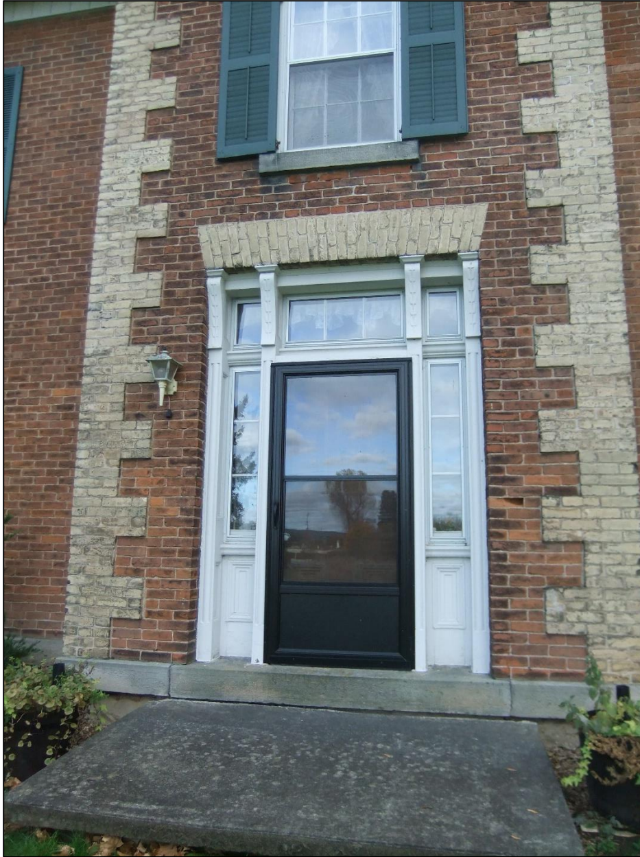
Figure 10: Detail View of Main Entrance of Farmhouse