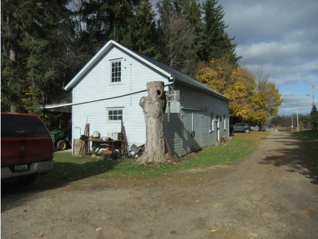
Figure 17: South Elevation of c.1830 frame house showing workshop extension