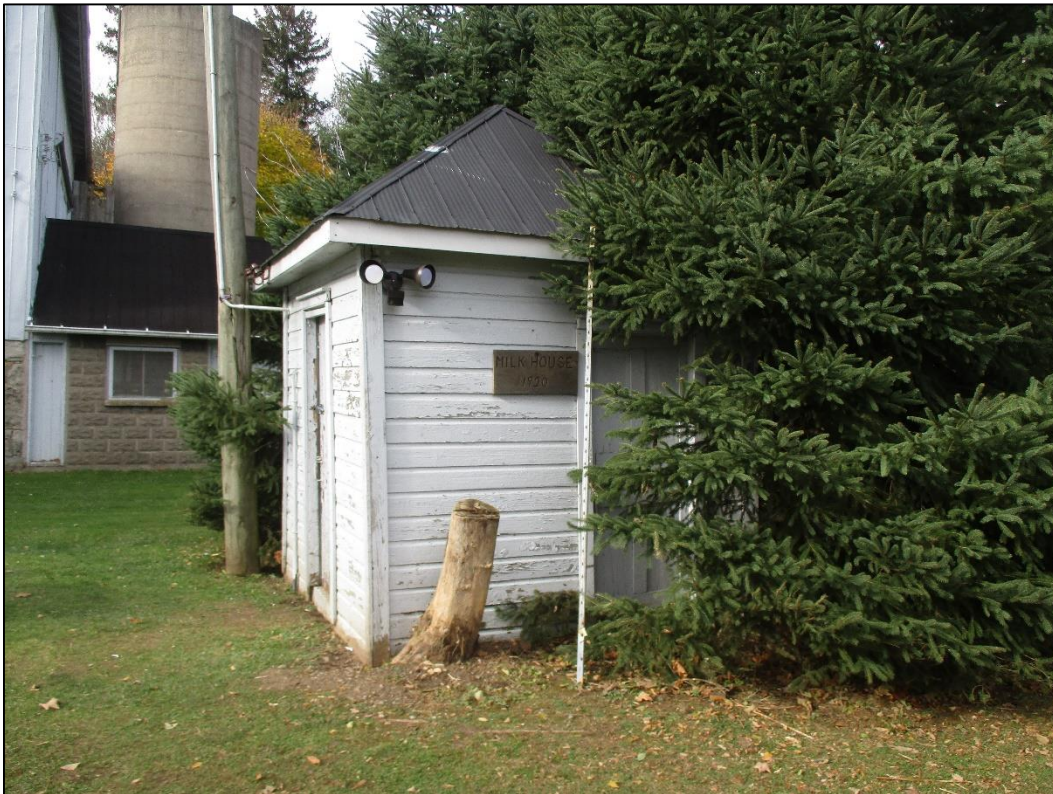
Figure 27: View of c.1920 milkhouse