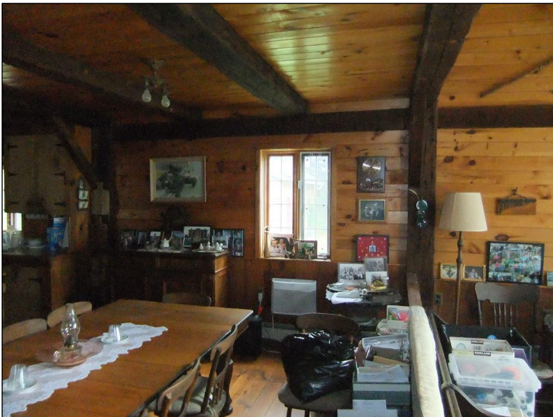
Figure 36: Interior of farmhouse showing framework of beams