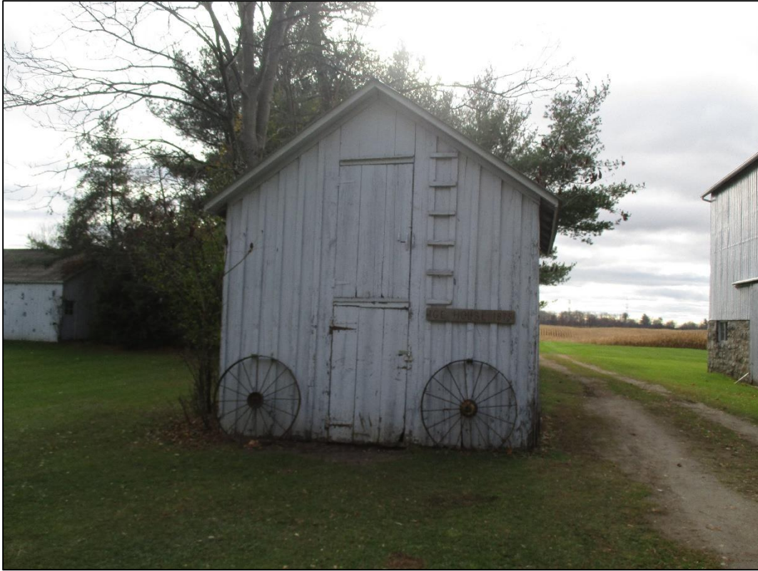
Figure 26: North Elevation of c.1872 icehouse