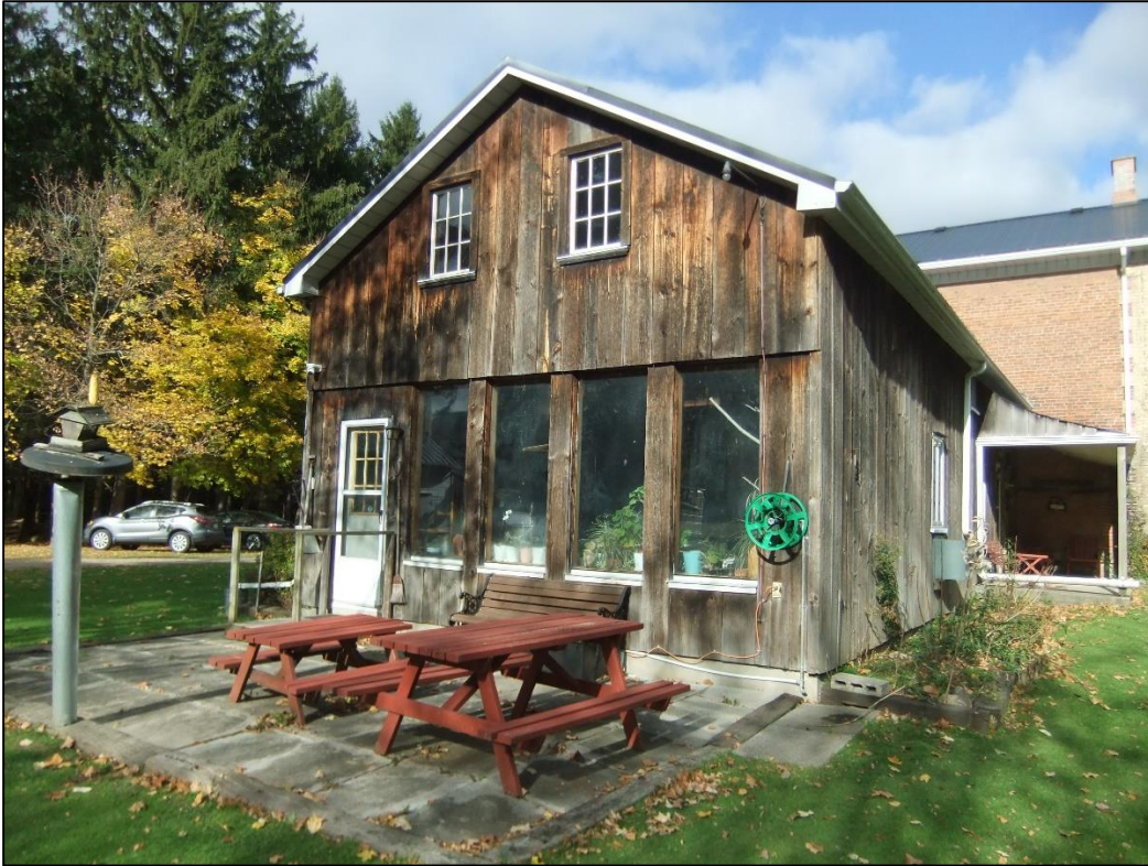
Figure 5: Rear (South) Elevation of Farmhouse