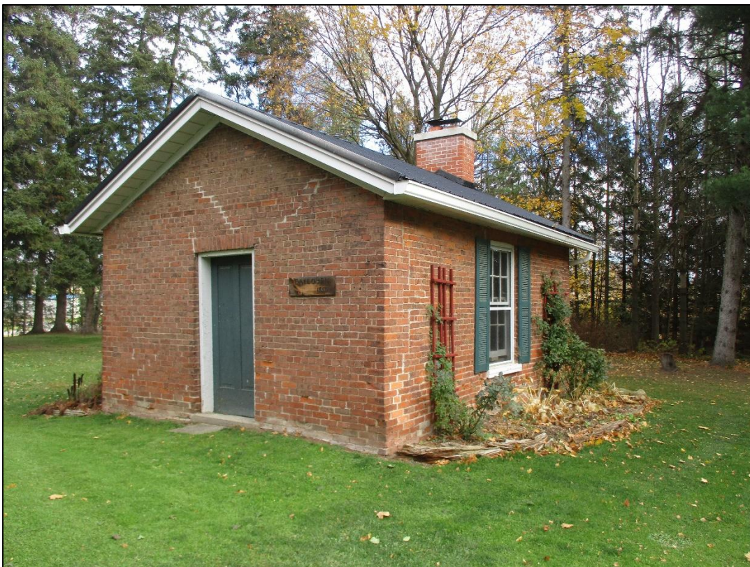
Figure 20: View of c.1856 bakehouse