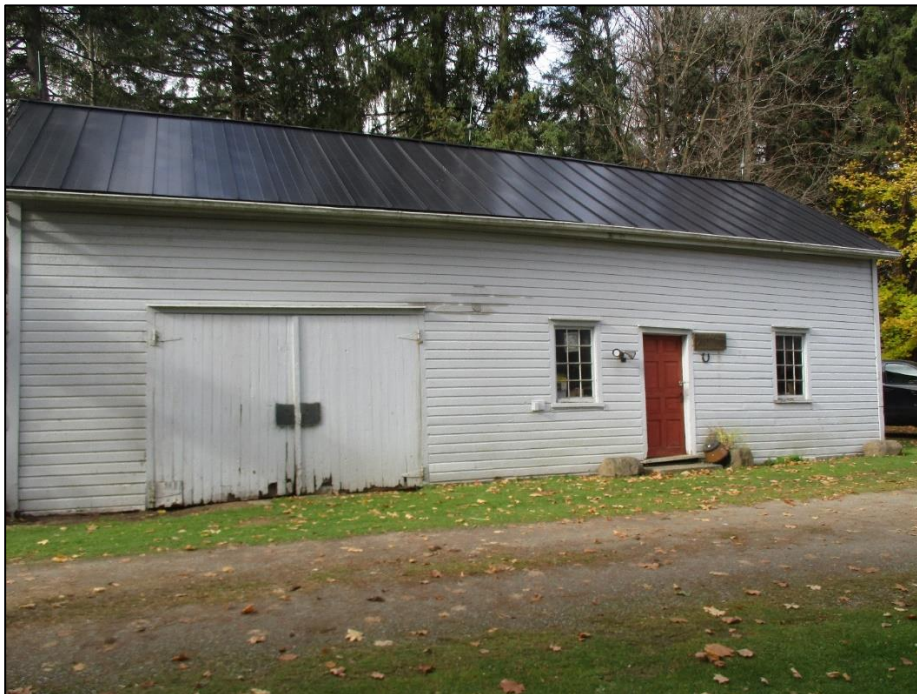
Figure 16: East Elevation of c. 1830 frame house