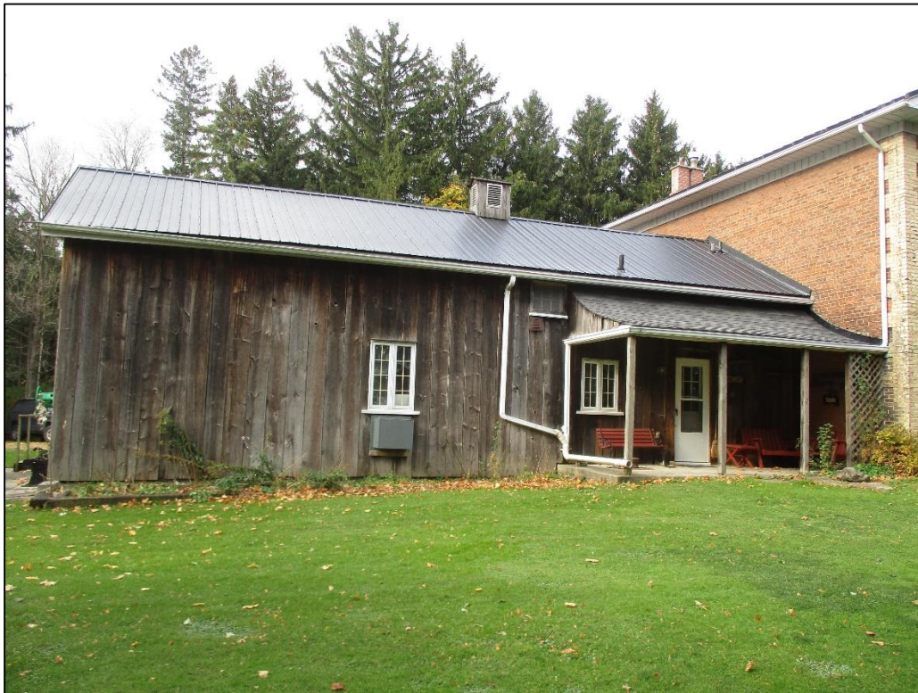
Figure 6: Rear of West Elevation of Farmhouse