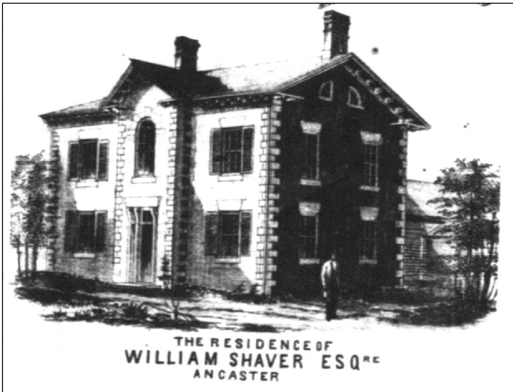
Figure 48: Farmhouse in 1859 (Map of Wentworth County 1859)