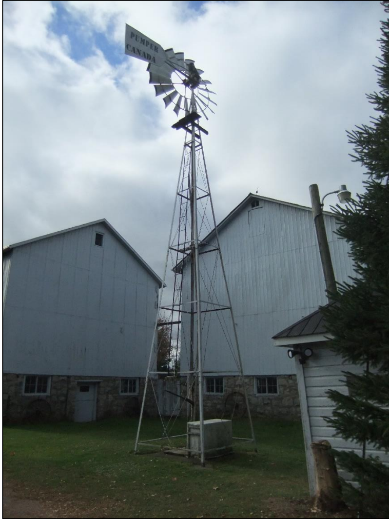
Figure 28: View of Horse Barn (left), Dairy Barn (right) and milkhouse (foreground)