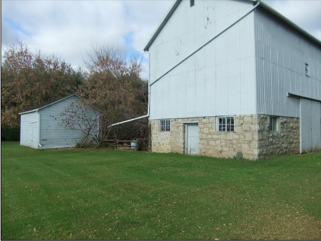
Figure 33: View of pre-1950 shed (left)