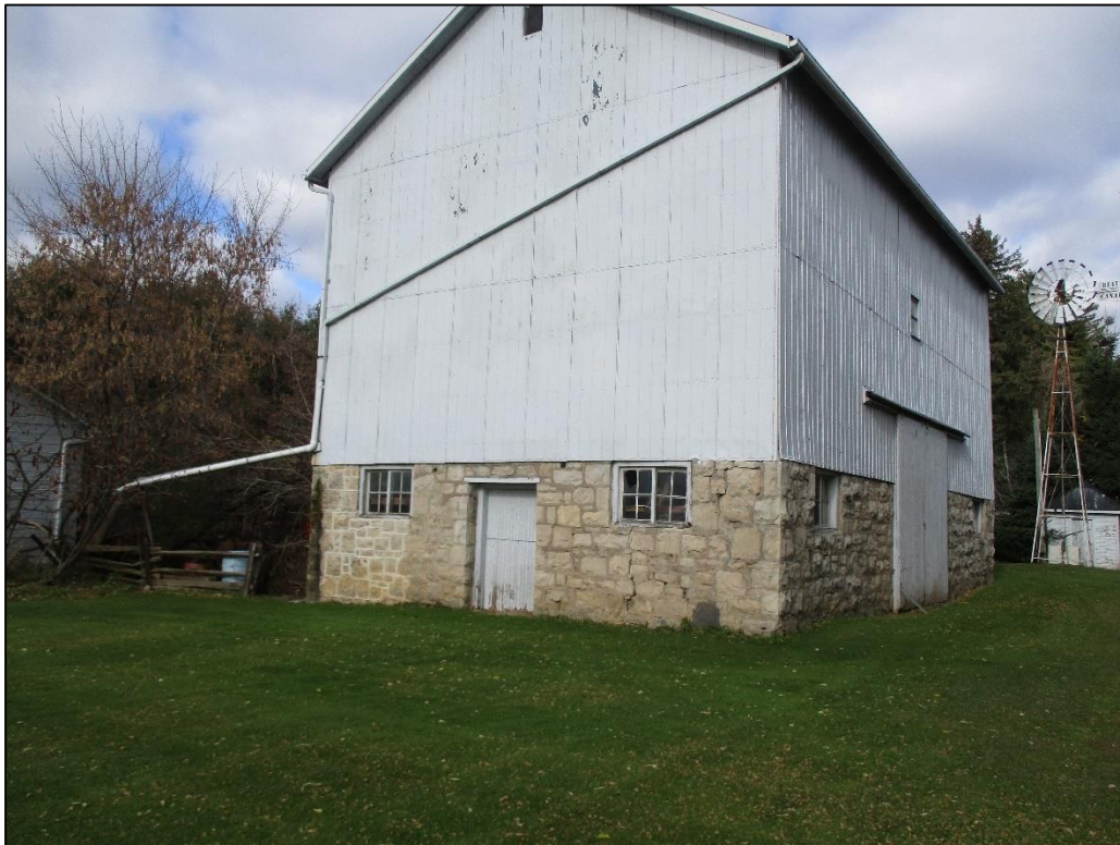
Figure 32: South and East Elevations of Horse Barn