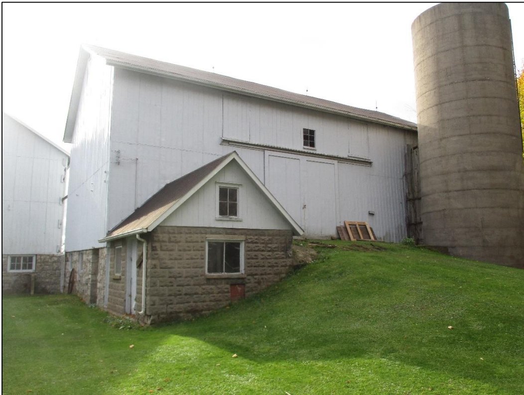
Figure 30: North Elevation of Dairy Barn, showing silo and 1942 attached milkhouse