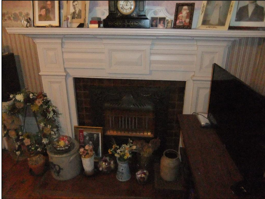
Figure 39: Detail of fireplace in living room of farmhouse