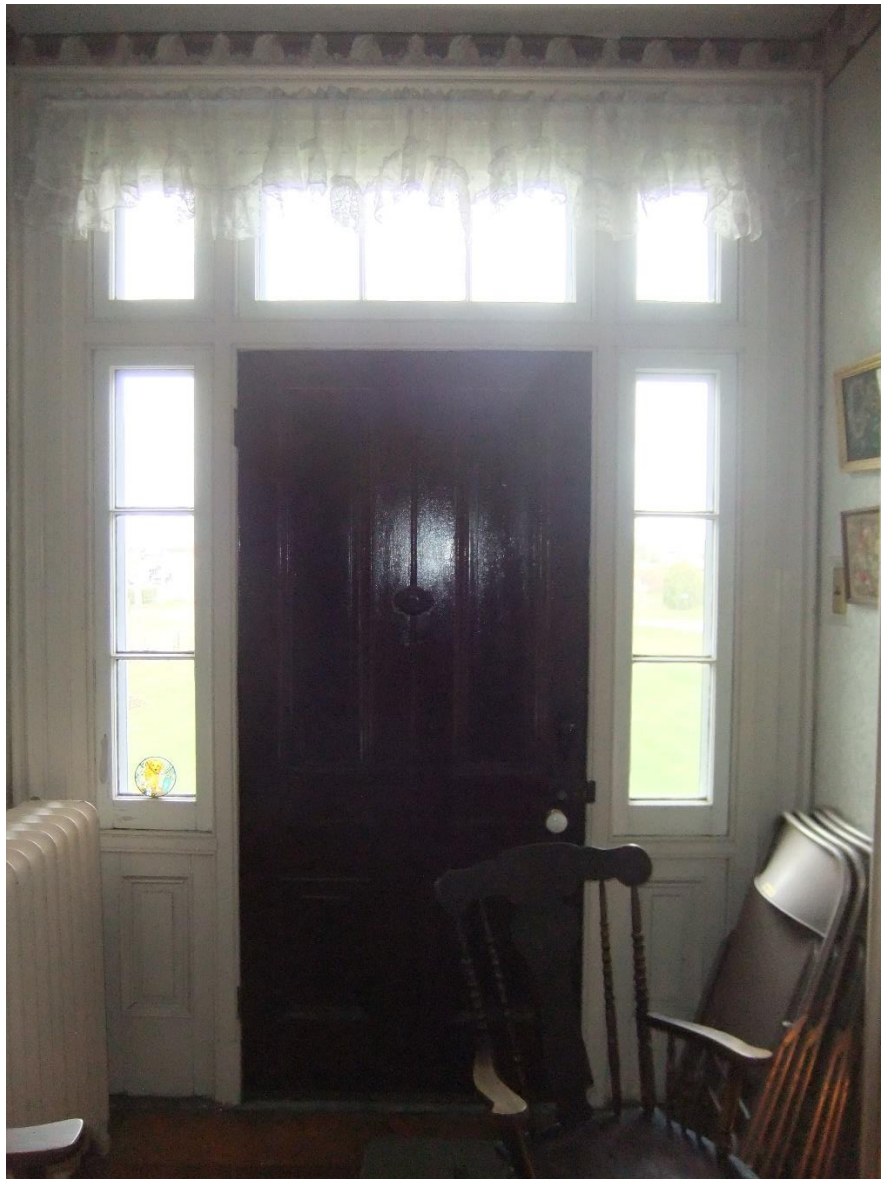
Figure 43: Interior of Main Entrance