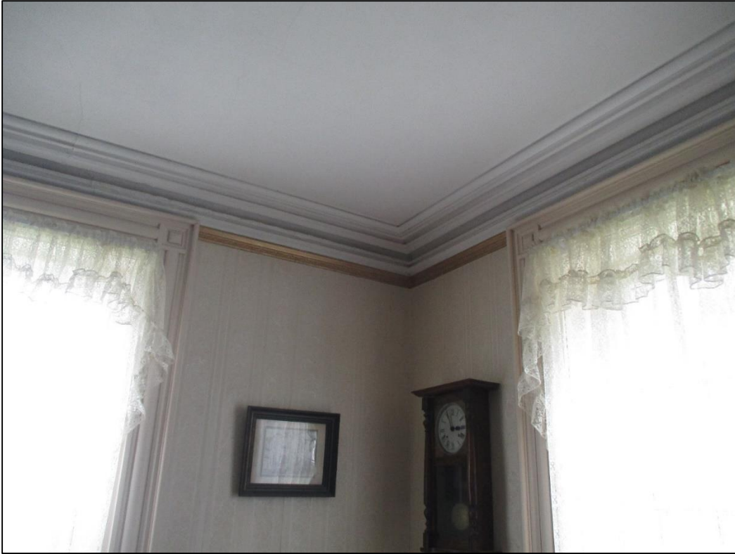
Figure 47: Detail of trim in study