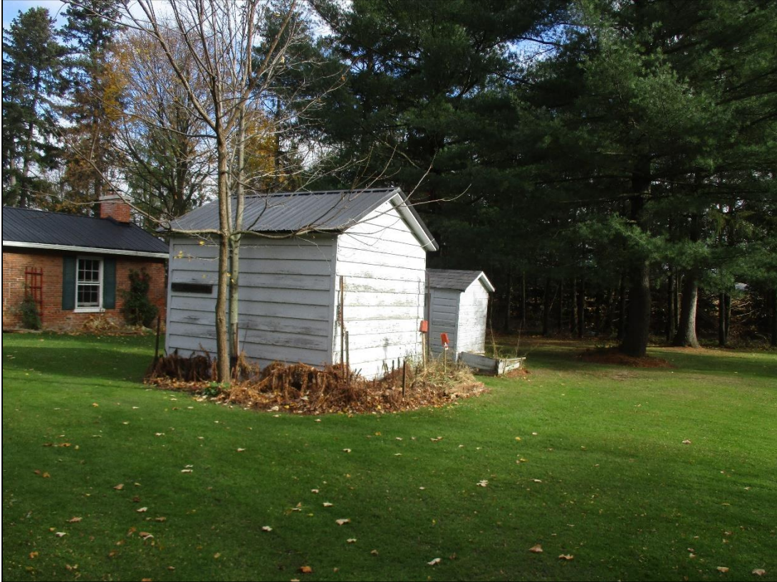
Figure 25: Rear of outhouse (left) and smokehouse (right)