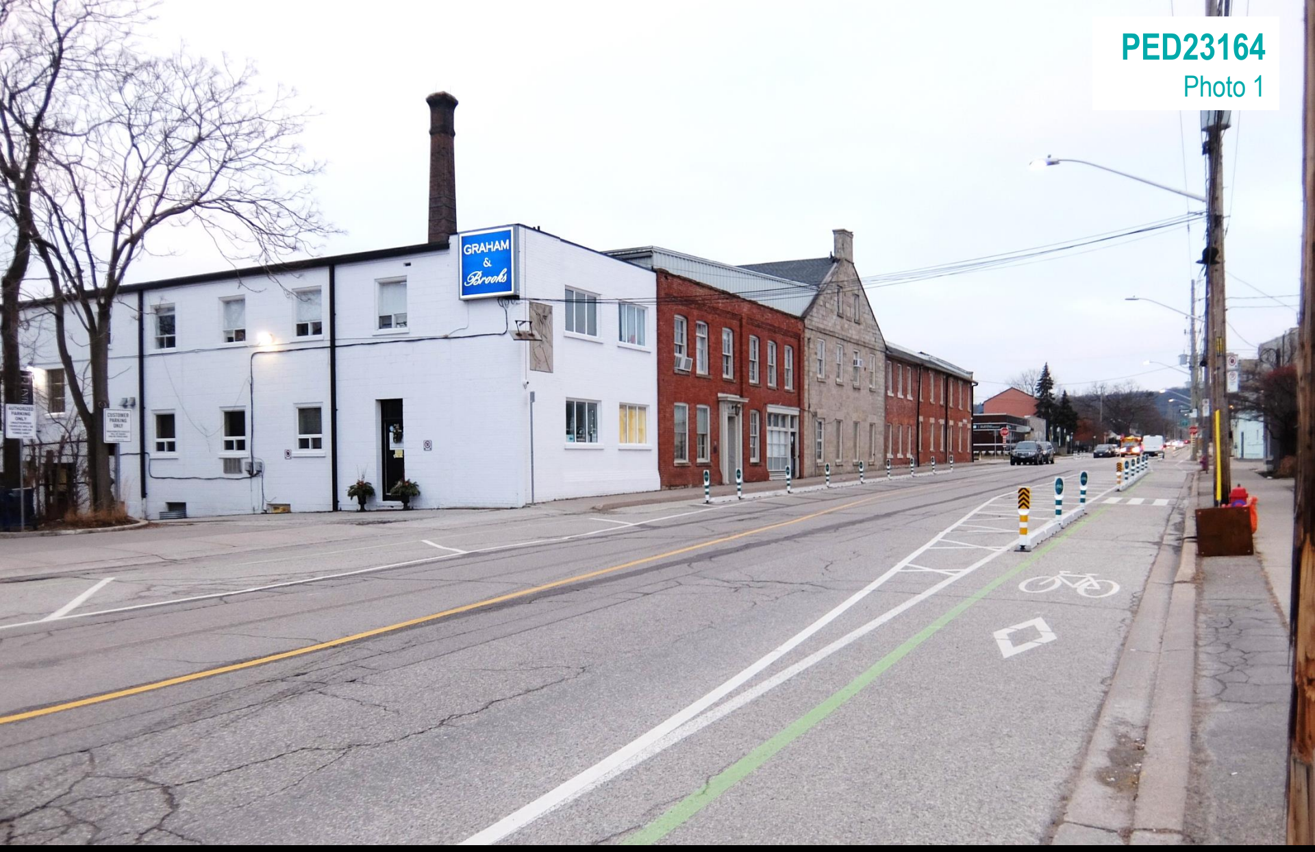
Looking south west at the subject property, from Hatt St