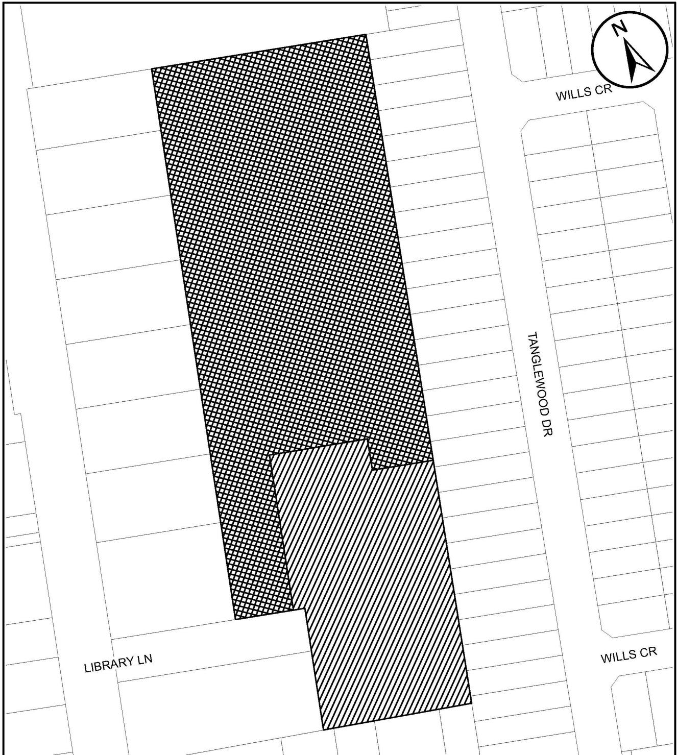
Special Figure 2: 2800 Library Lane and 2641 Regional Road 56