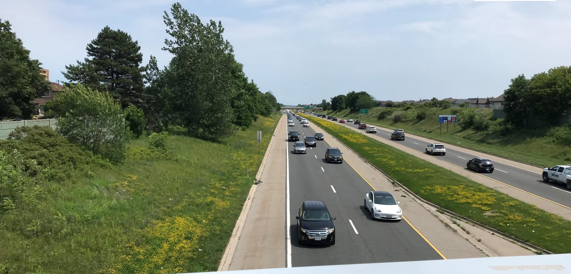
Lincoln M. Alexander Parkway looking east