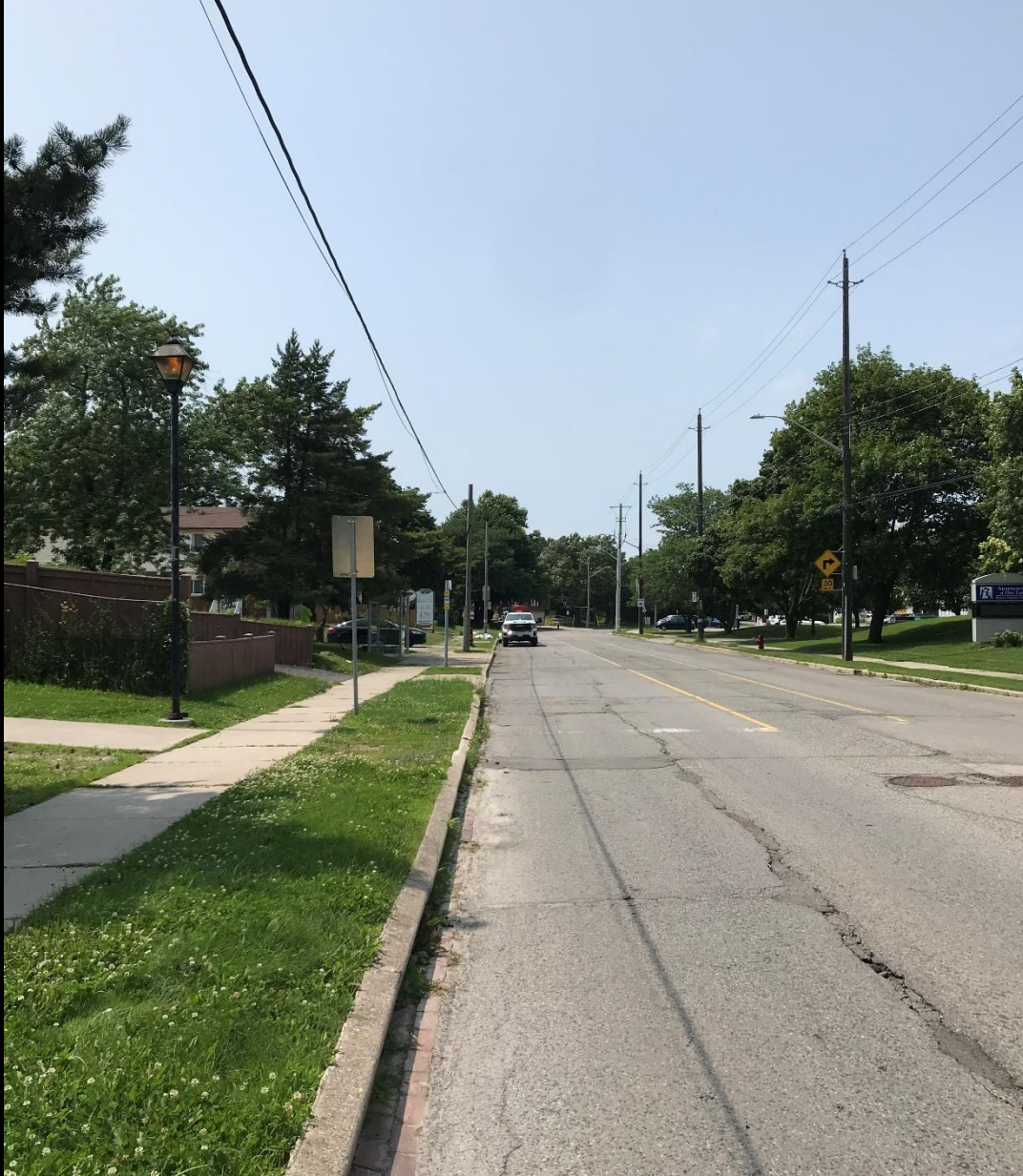
Limeridge Road West looking west