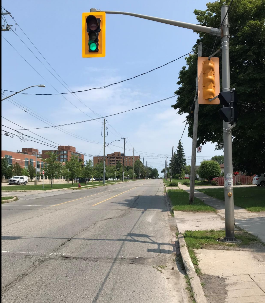
Limeridge Road West looking east