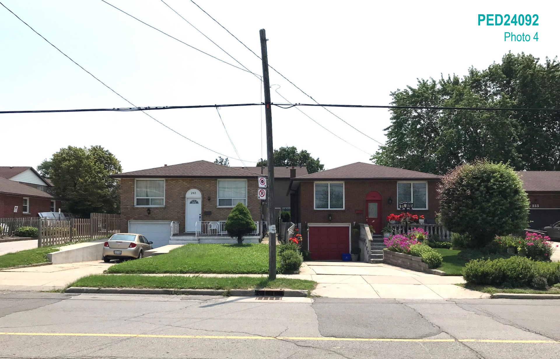
Adjacent residential dwellings to the east