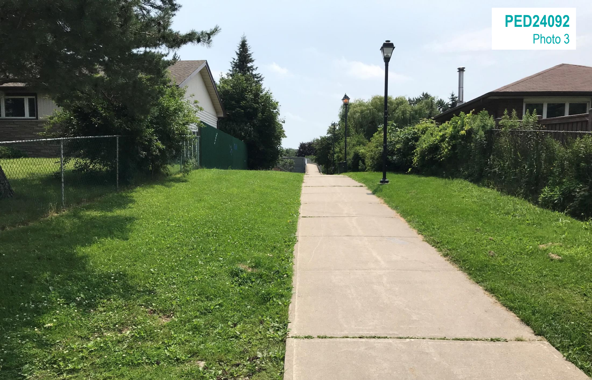
Adjacent pathway to Lincoln M. Alexander Parkway to the west