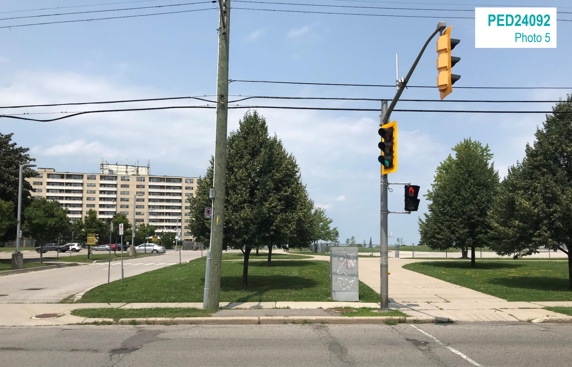
View to the north