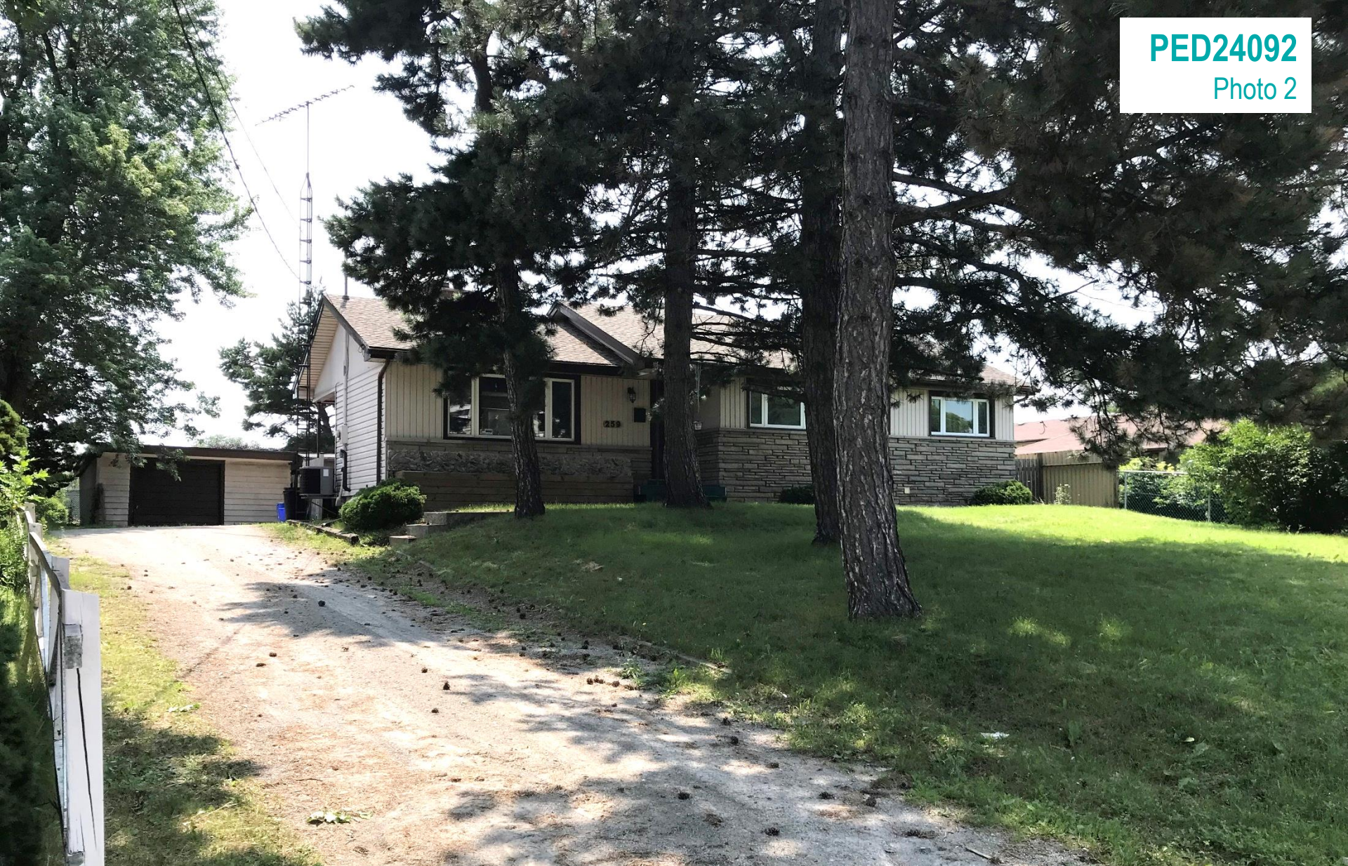
Subject Lands – 259 Limeridge Road West