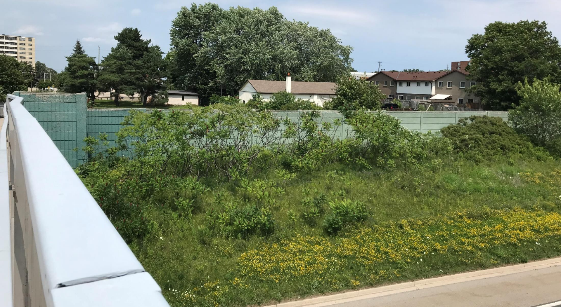
View of rear of subject site