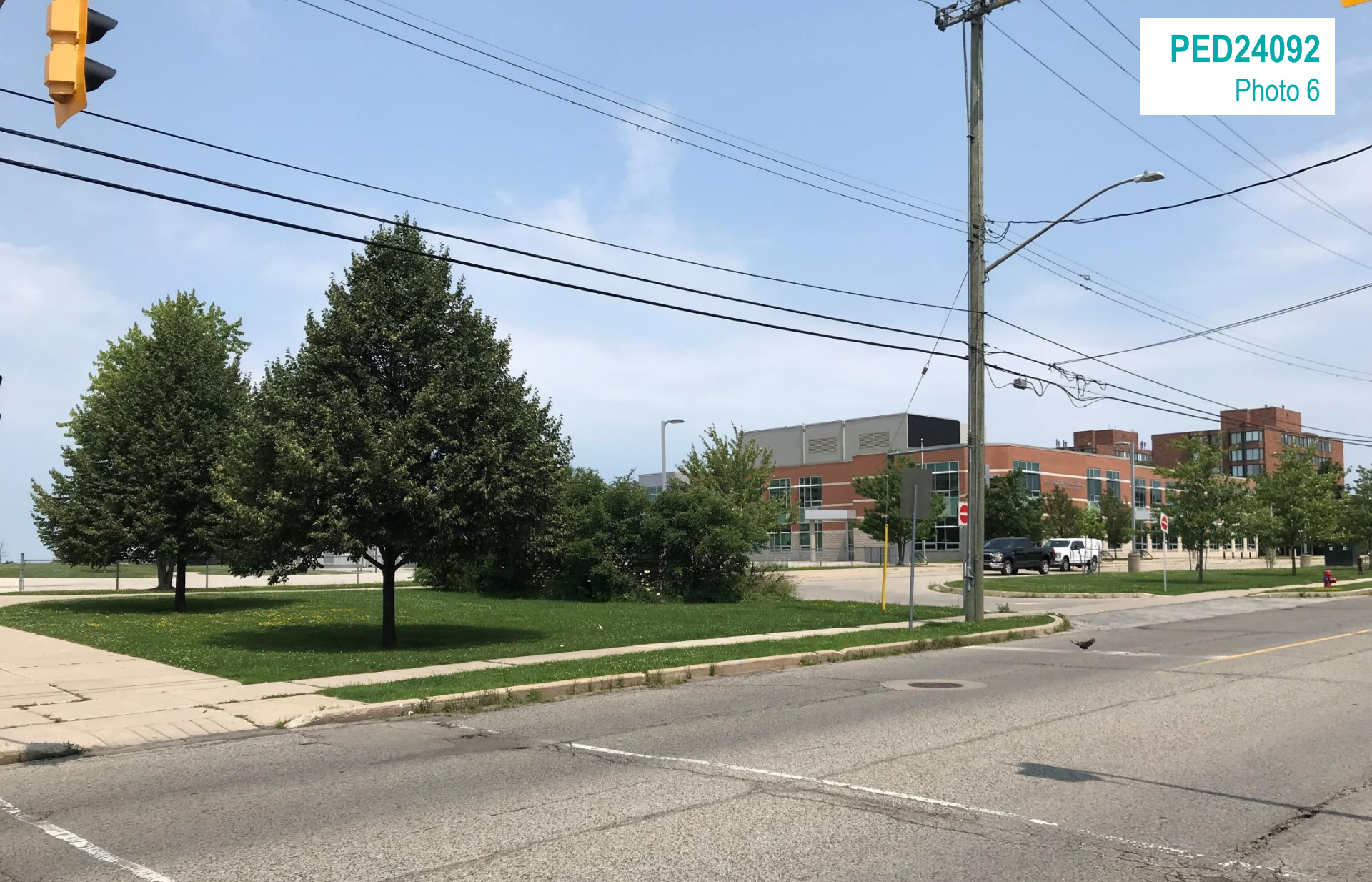
Annunciation of Our Lord Catholic Elementary School located to the northeast