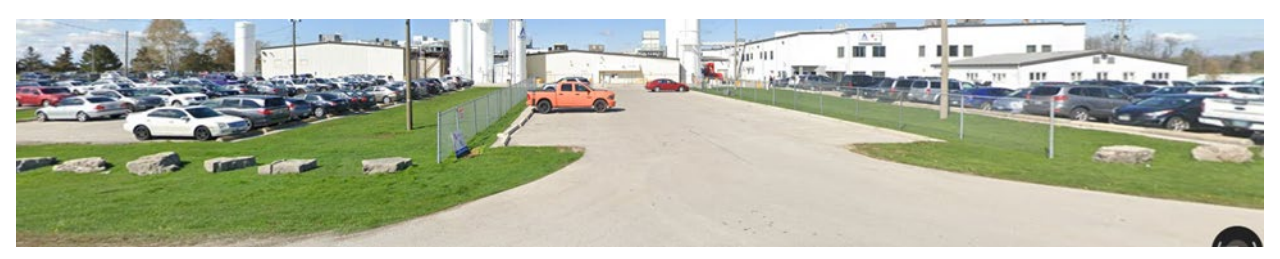
Figure 1: Rural Property that Would Not Qualify for the Green Space Credit