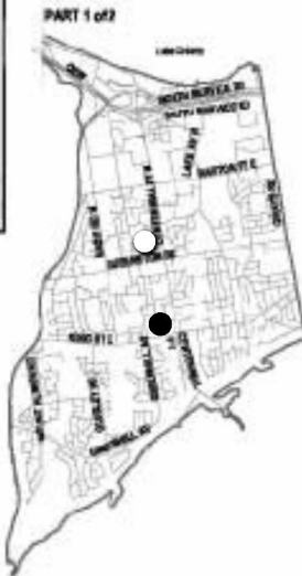
Key Map - Ward 5