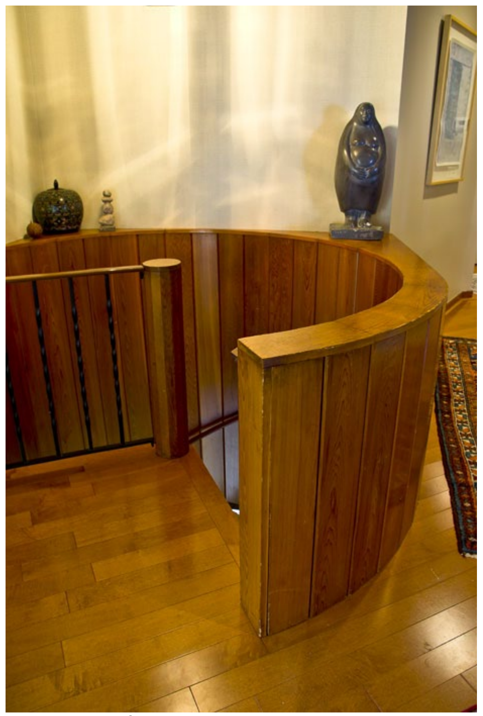
Image 13: Image of the spiral staircase banister on the second storey.