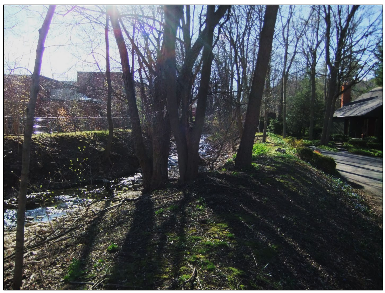
Image 11: Image of Sydenham Creek, located directly across the street from 7 Rolph Street to the south.