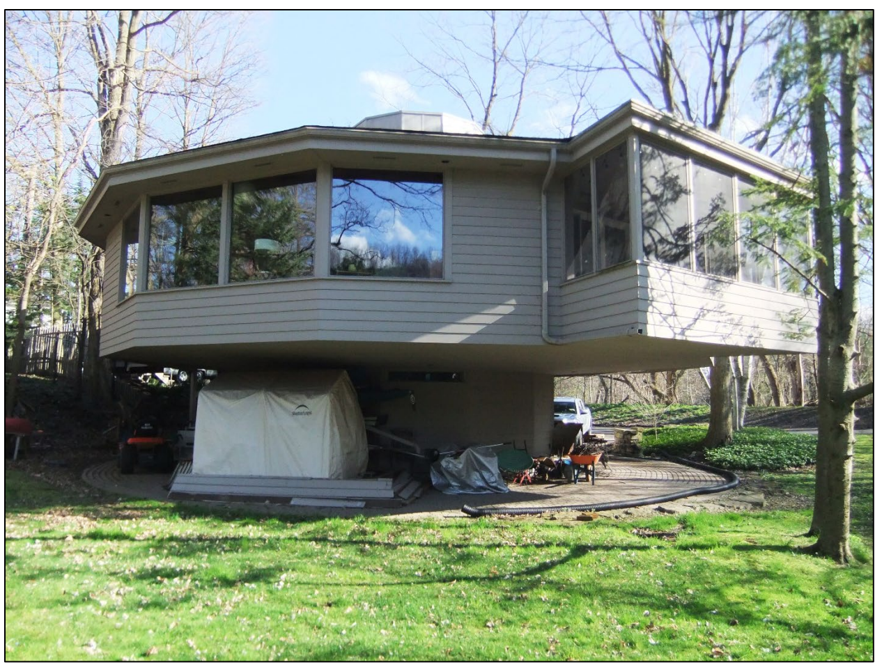
Image 2: Northern elevation from the north. Note the four large picture windows facing the rear of the property, and projecting porch enclosed with screens.