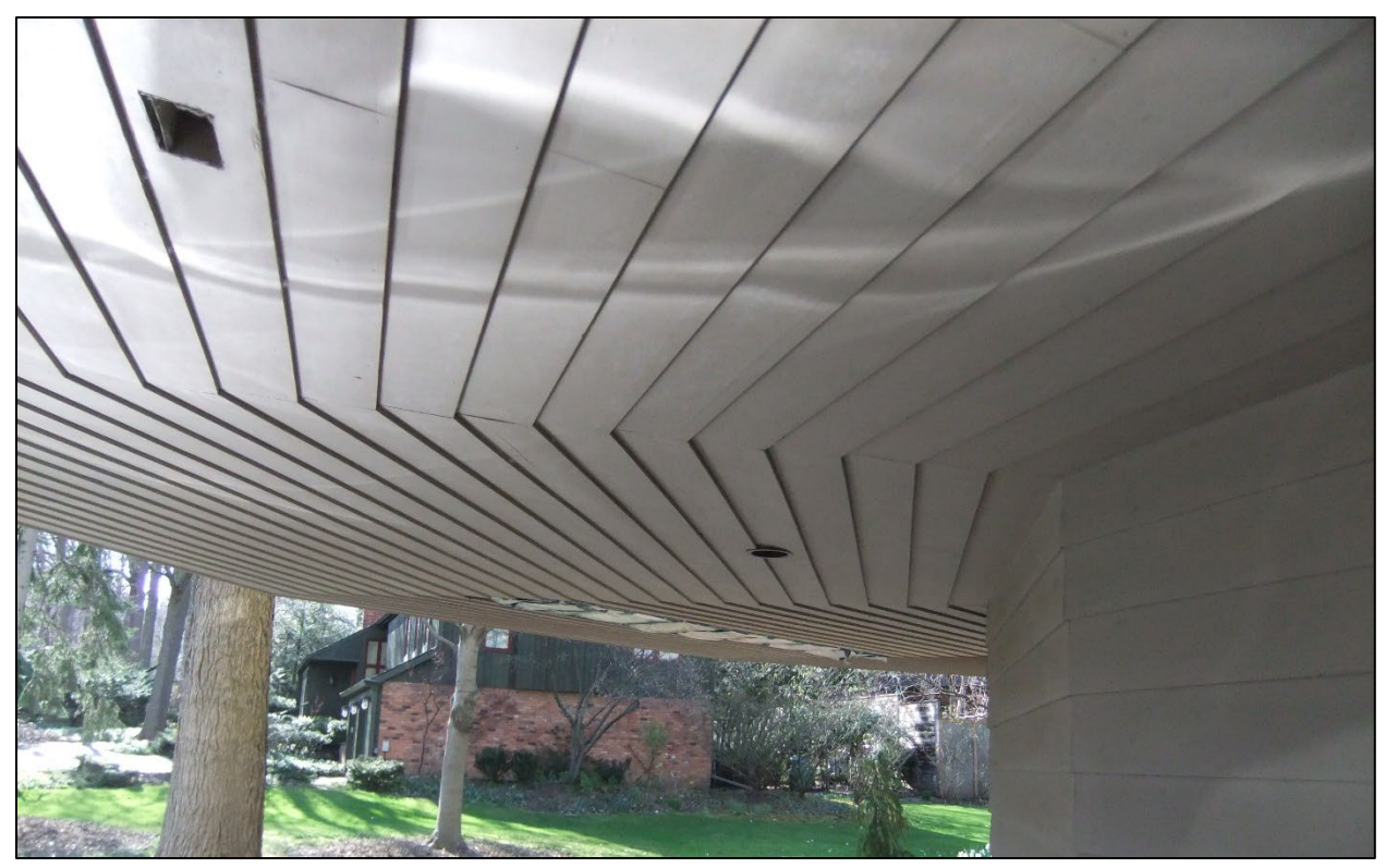
Image 7: Close-up detail of the cedar board cladding underneath the second storey of the Lennard / Mushroom house.