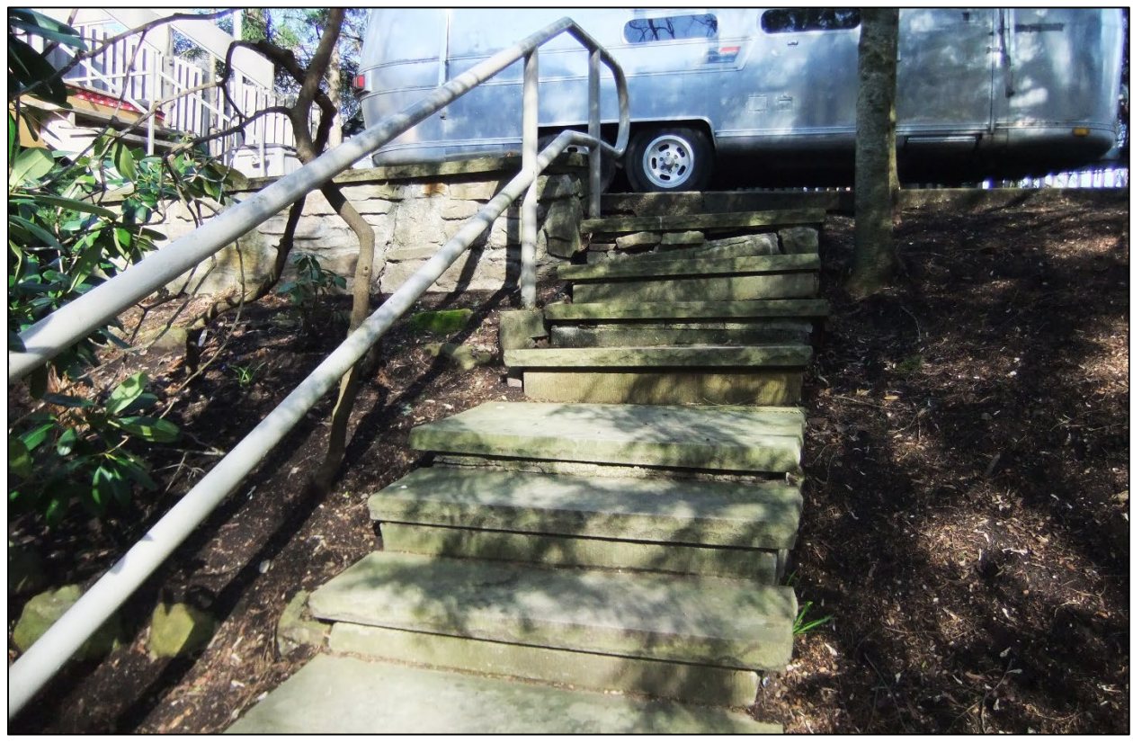
Image 10: Image of cut stone stairs leading down from the upper level entry way and stone planter.