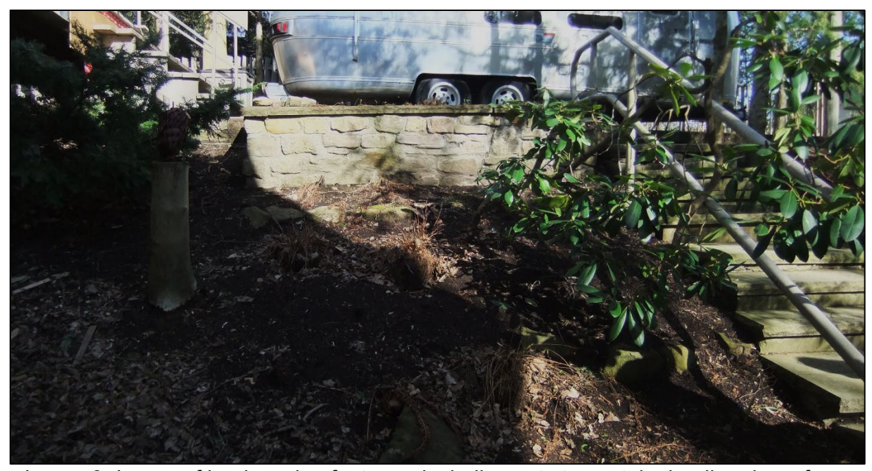
Image 9: Image of landscaping features, including cut stone stairs leading down from the upper level entry way and stone planter.