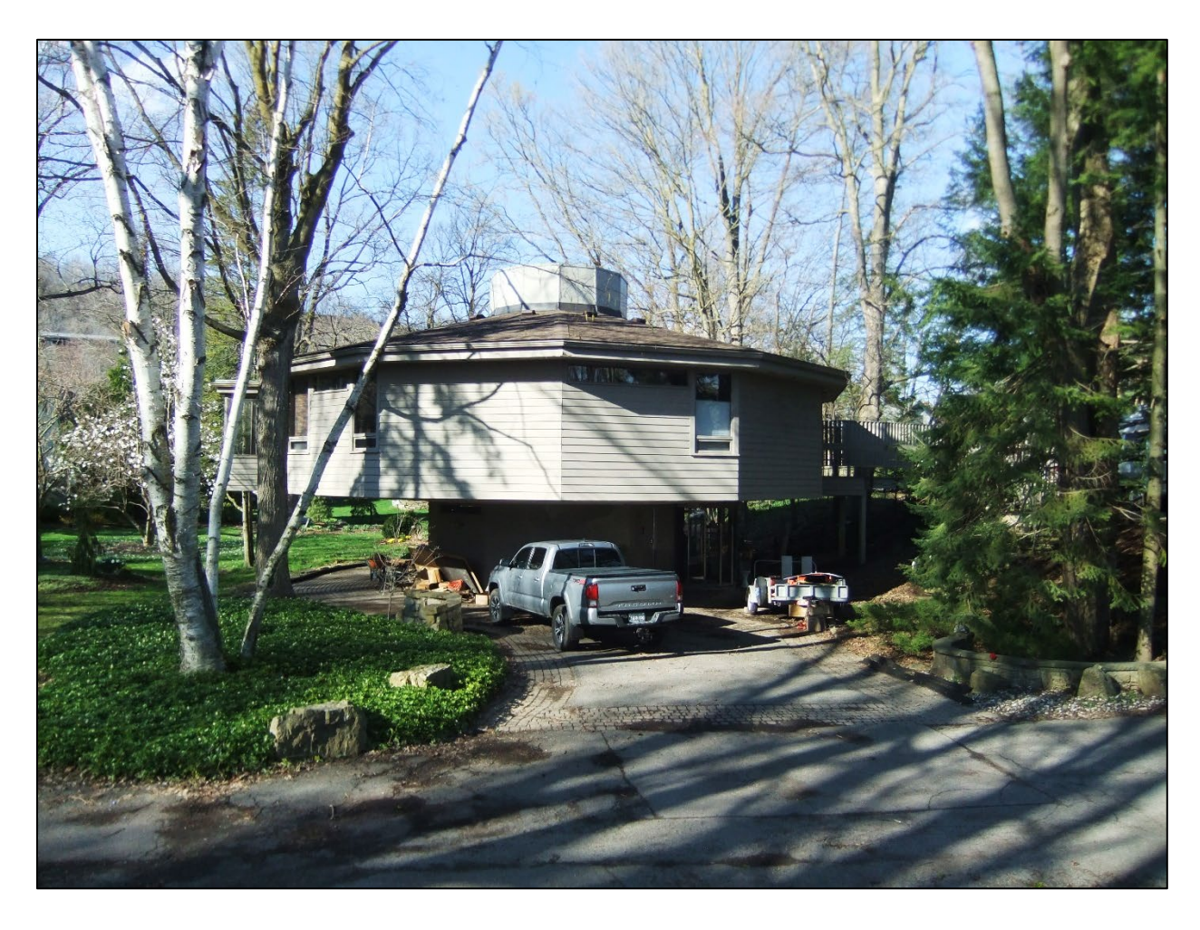
Image 1: Southern elevation from the south. Note the decorative collar on the top of the building, surrounding mature trees, and circular landscaping surrounding the pedestal base.