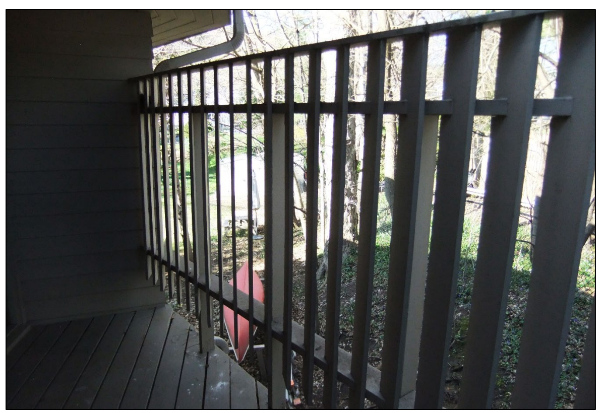
Image 5: Close-up detail of the fence along the second floor entry porch.