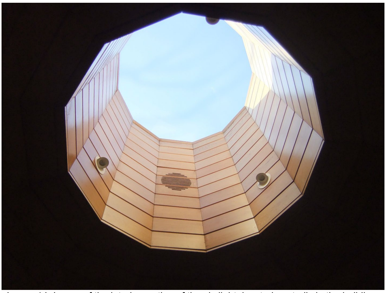
Image 14: Image of the interior portion of the skylight, located centrally in the building, lined with stained cedar.