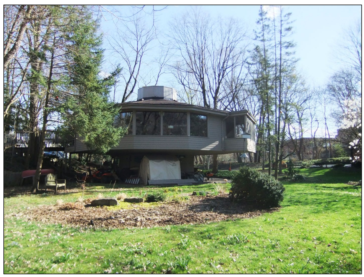
Image 3: Northern elevation from the north. Note the surrounding mature trees.