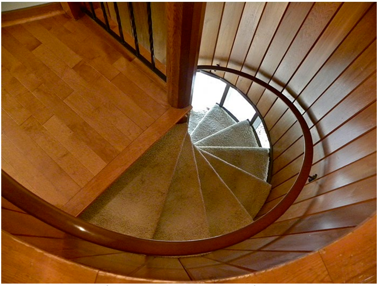
Image 12: Image of the spiral staircase looking down from the second storey.