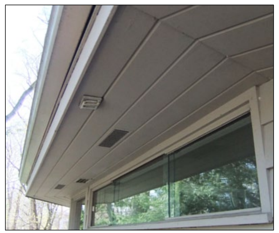
Image 6: Close-up detail of the second storey soffits and transom windows.