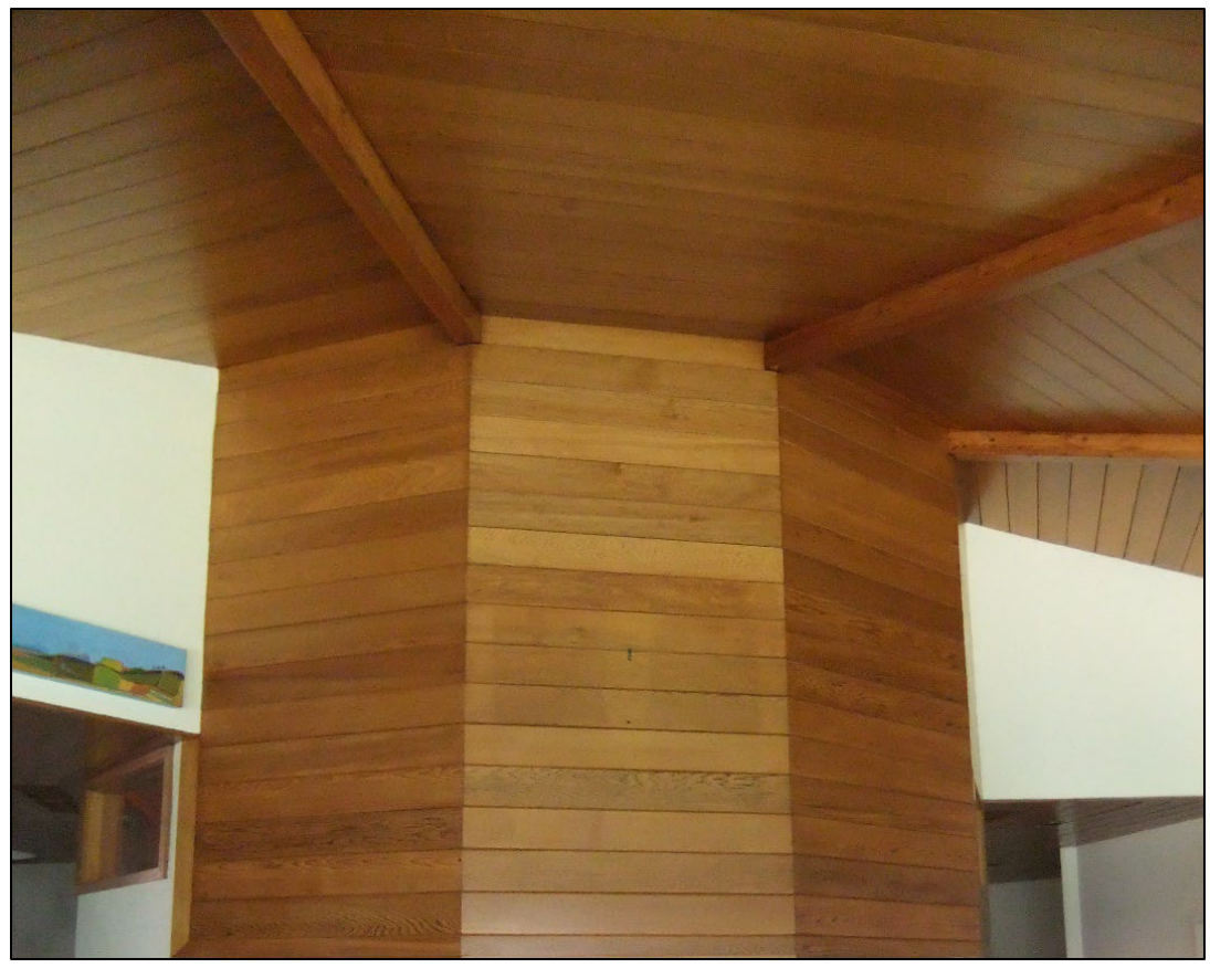
Image 15: Image of the stained cedar ceiling, radiating from the center of the building.