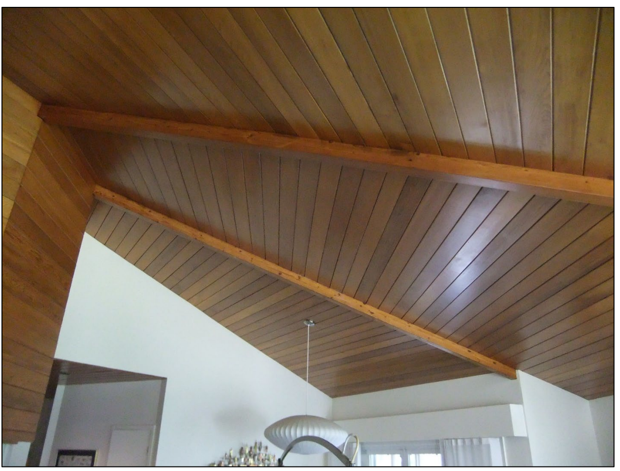
Image 16: Image of the stained cedar ceiling in the main living area, extending to the outer walls.