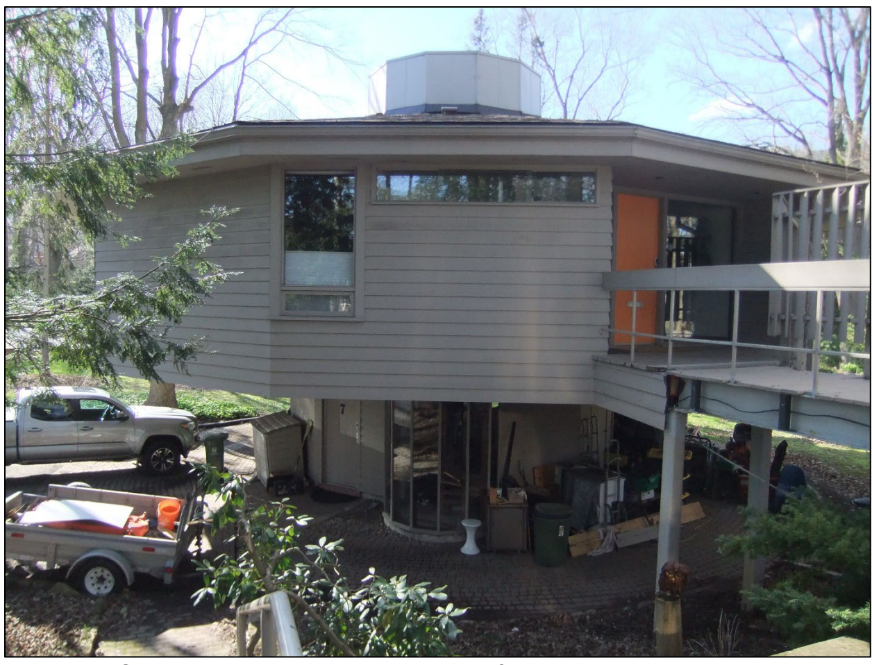
Image 4: Southeastern second storey elevation from the eastern elevated drive and entry way. Note the protected second storey entrance, bridge, and angled decorative fence.