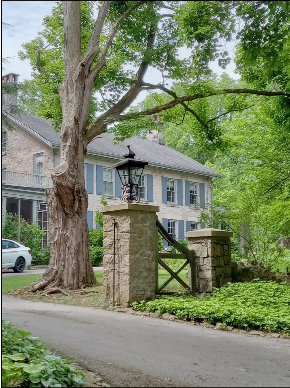
Figure 1: North elevation.