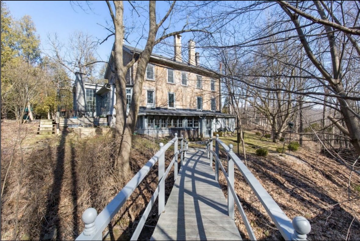
Figure 8: View of South Elevation (FreshBrick, Retrieved X from https://www.freshbrick.ca/2022/09/no-stone-left-un-yearned.html ).