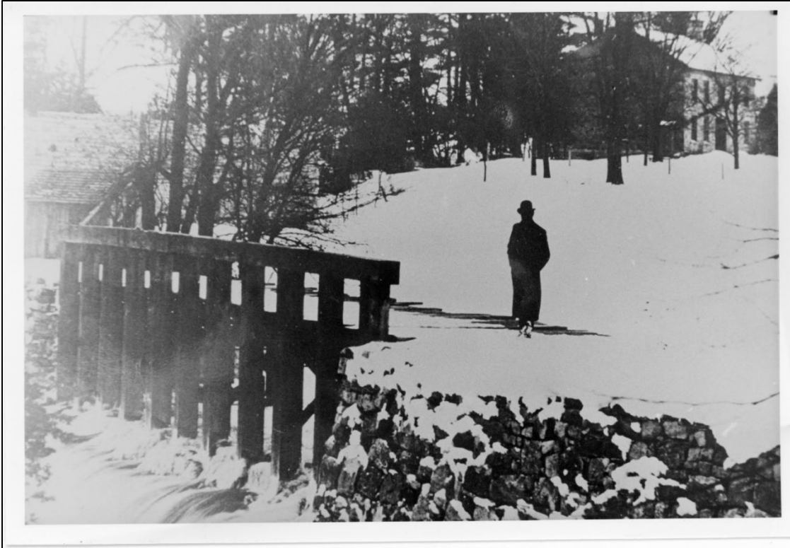
Figure 10: Webster's Dam and Ashbourne Mill ruins, subject property in background, early twentieth century.