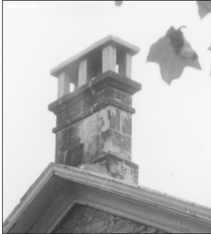
Figure 6: Detail view of chimney on eastern elevation (Flamborough Archives, circa 2000).