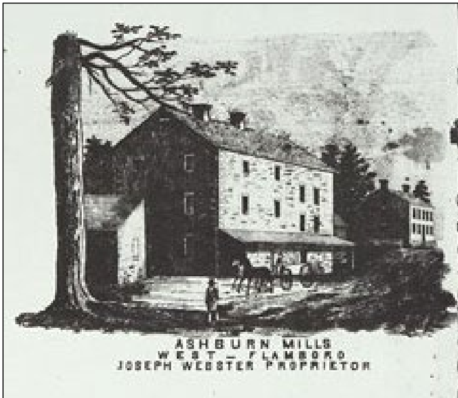
Figure 9: Ashbourne Mill with subject property in background, 1859 (Surtrees Map).