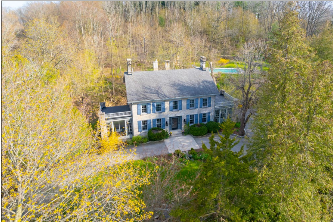
Figure 3: Aerial view of subject property (Woolcott Real Estate, Retrieved May 7, 2024 from https://woolcott.ca/property-listing/6-websters-falls-road/ ).