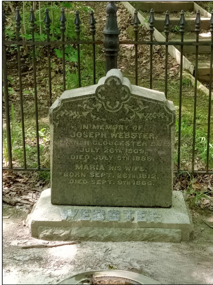
Figure 12: Grave of Joseph Webster II at Webster's Fall.