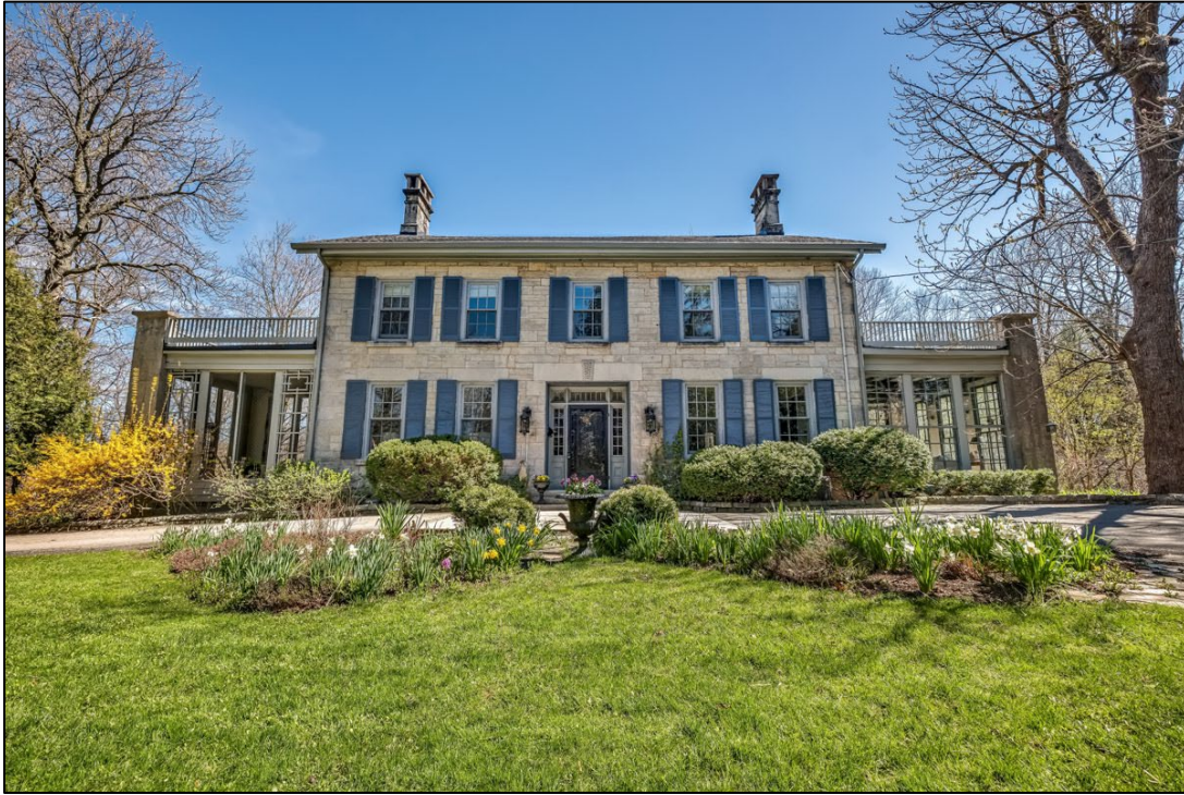
Figure 2: North elevation.