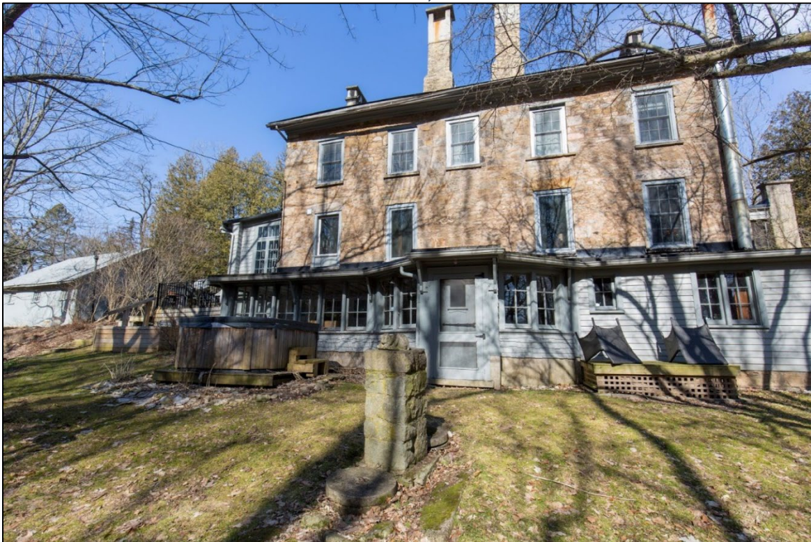
Figure 7: View of south elevation (FreshBrick, Retrieved May 7, 2024 from https://www.freshbrick.ca/2022/09/no-stone-left-un-yearned.html ).