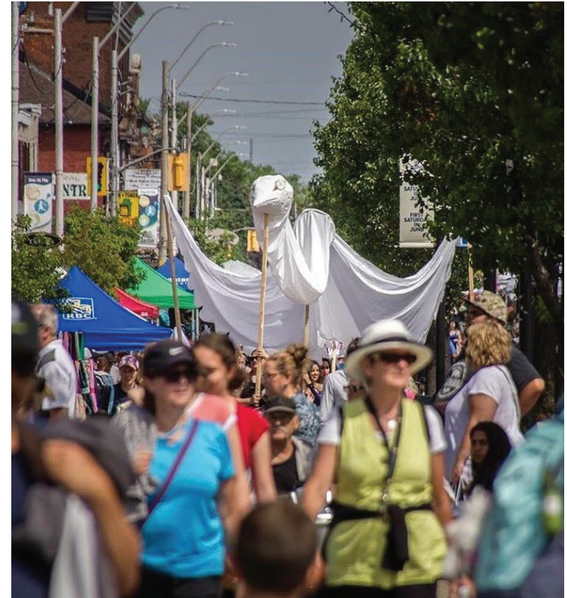
Barton Village Festival, 2018 Barton Village B.I.A

This funding supports activities that are about community identity - the unique people, places and things that make up the city of Hamilton. Project themes can honour Hamilton's past, celebrate its present and / or envision its future. Themes can be city-wide or focus on a specific geographic or cultural group. Applicants must demonstrate how the public will interact with the project.