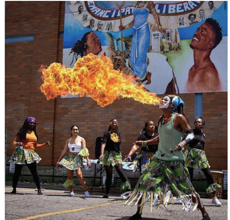
Concession Streetfest, 2022 Concession Street B.I.A

This stream supports the planning and delivery of a variety of established activities (programs and events) that create opportunities for participation in and the celebration of community identity – the people, places and things that make up Hamilton.