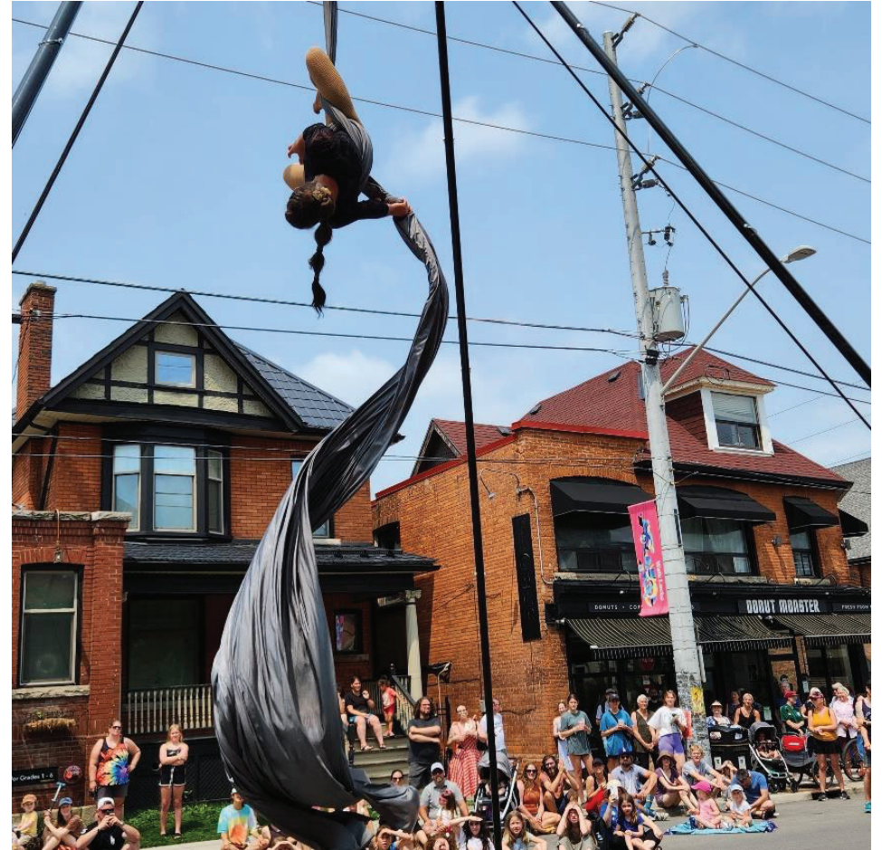
Sundays Unlocked, 2023 Locke Street B.I.A

To support organization's activities, programming, events, and projects that engage the public in strengthening and celebrating community identity – the people, places and things that make up Hamilton.